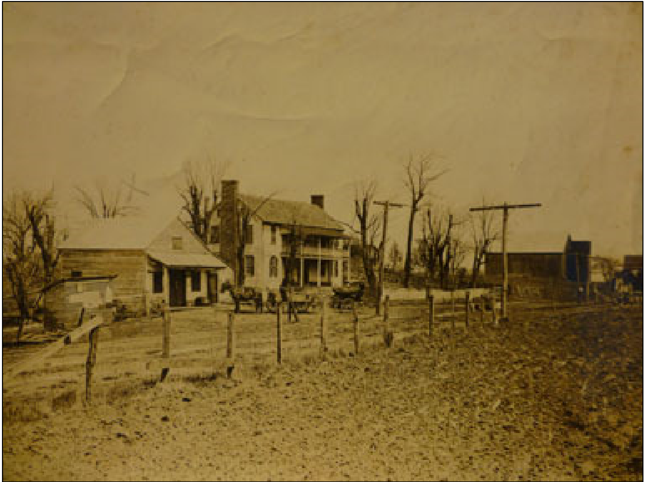
Figure 1. Ca. 1915 photo of property, view looking northeast.

Botetourt County, Virginia County and State