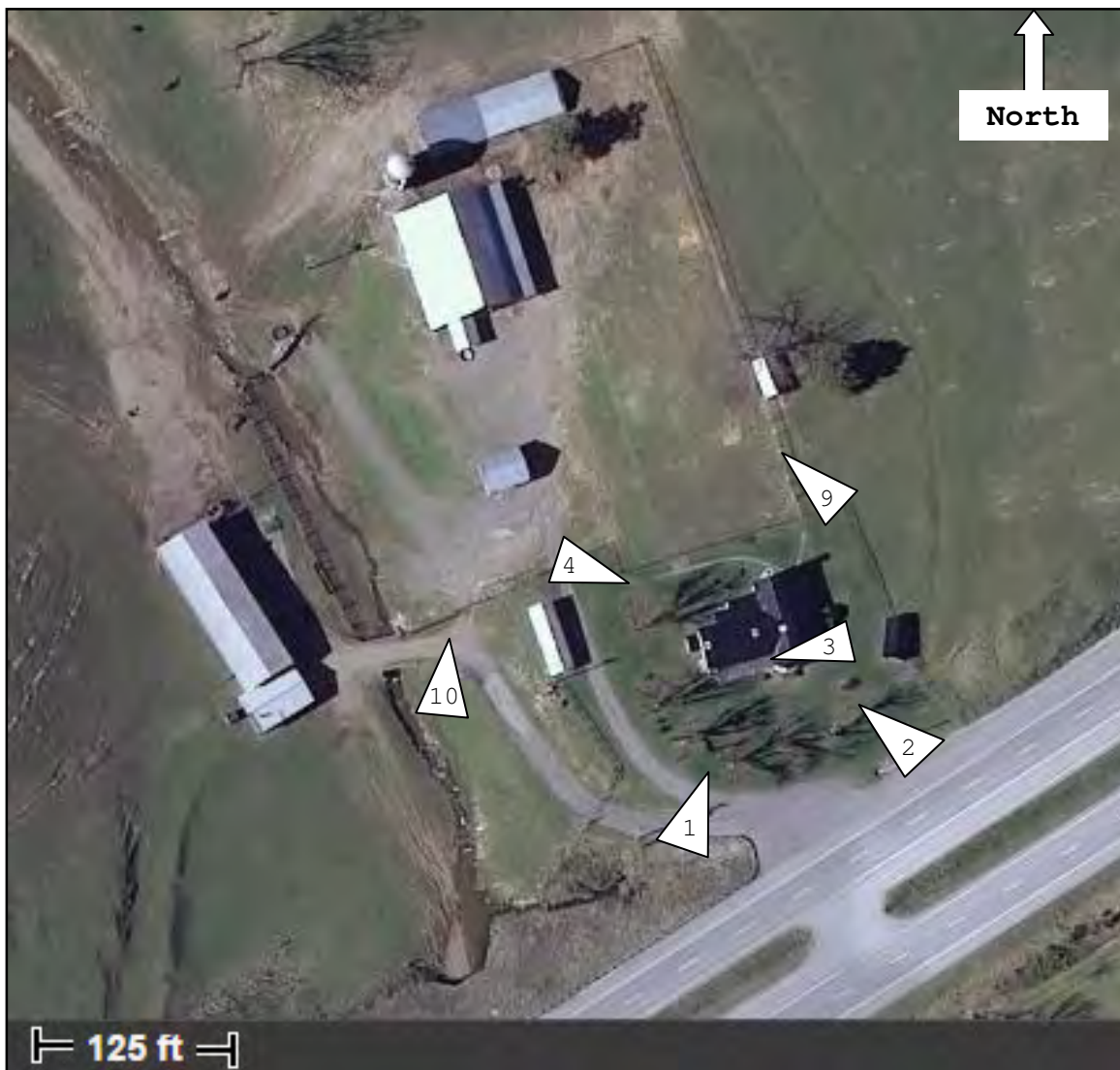
PHOTO KEY. [Number and direction of exterior photos only indicated by numbered arrows.]