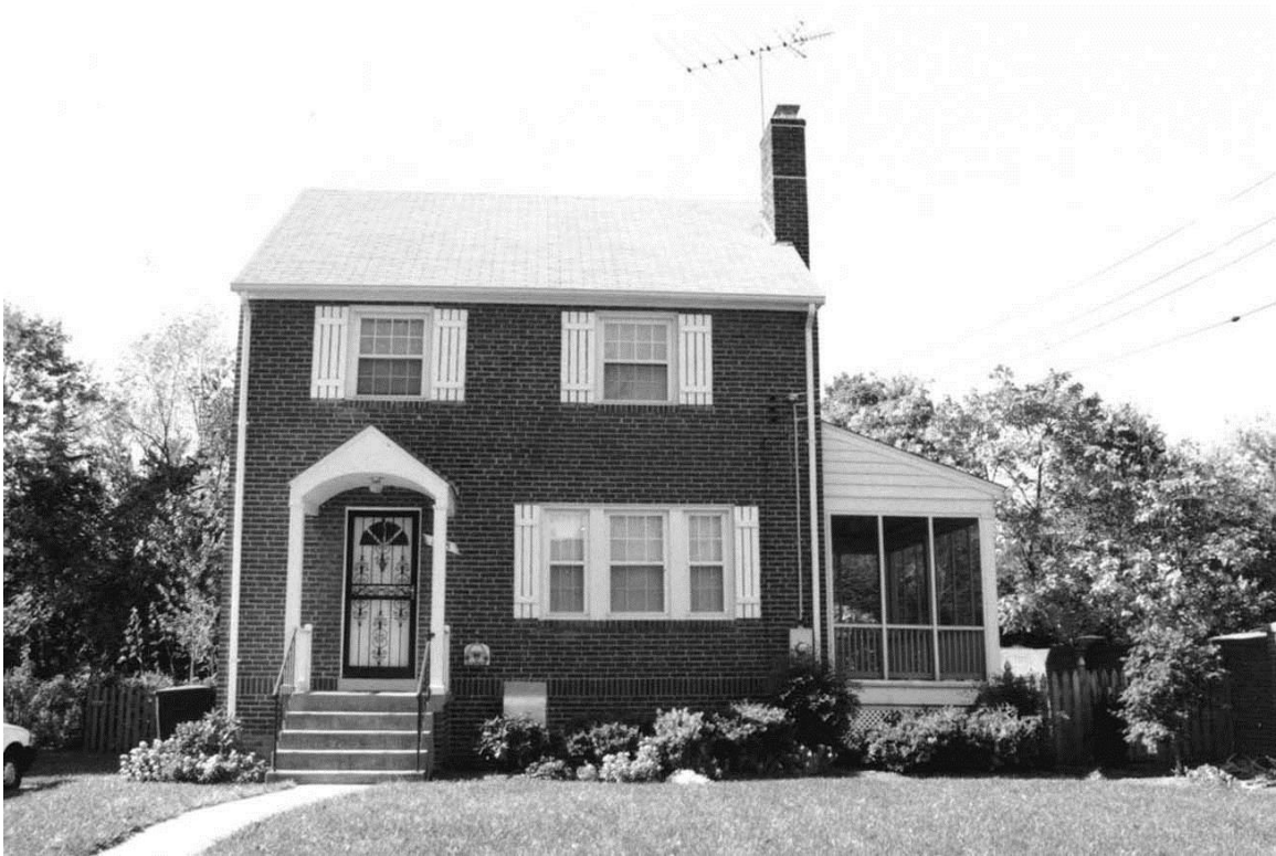
Figure 4: House, 838 North Woodbridge Street (000-7889)

The two-and-a-half-story dwelling at 838 North Woodbridge Street (000-7889) is an excellent example of the Colonial Revival style diluted in form and ornamentation. The brick-clad dwelling has a side entry covered by a wood-frame portico. This structure has a front-gabled roof with a coved ceiling supported by square posts. The 8/8 double-hung, wood sash windows have brick sills and soldier-coursed lintels. The side-gable roof has a shallow cornice largely obscured by the metal drainpipe and gutter. Other noted examples include the dwellings at 839 North Buchanan Street (000-7937), 512 North Wakefield Street (000-7997), 747 North Albemarle Street (000-8041), and 743 North Albemarle Street (000-8042).