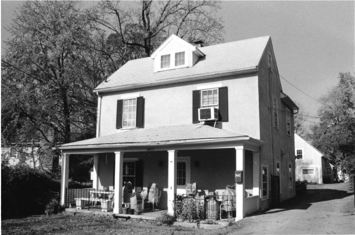
Figure 14: House, 4611 North Carlin Springs Road (000-7994)

The two-and-a-half-story dwelling at 4611 North Carlin Springs Road, erected in 1894, is an excellent vernacular interpretation of the domestic forms commonly erected during this period. The rectangular building is two bays wide with a central entry asymmetrically piercing the façade. The steeply pitched side-gable roof has a dormer with coupled windows and an interior brick chimney. The stylistic ornamentation is confined to the one-story full-width front porch with its large square Tuscan posts and half-hipped roof.