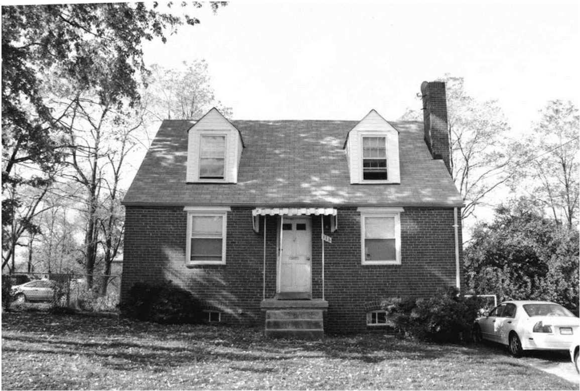
Figure 18: House, 816 North Wakefield Street (000-7881)

The increasing need for mass-produced housing at a low cost led to the reinvention of the “Cape Cod” form, popular during the 18 th century. The form is one to one-and-a-half stories in height with a side-gable roof and a single end chimney. Unlike its ancestor, the 20 th -century Cape Cod house was pierced with dormers that allowed the upper story to be more fully utilized. The façades were commonly marked with entry porticoes or porches. Rear additions and projecting bays on the façade augmented the Cape Cod. The stylistic detailing of the Cape Cod forms generally followed the Colonial Revival style, although elements characteristic of the Tudor Revival style were noted. The most popular form found throughout the survey area, the Cape Cod buildings are typically three bays wide, two bays deep, and have a central-passage plan. Detailing includes the flat door surrounds with shallow Tuscan pilasters supporting a slightly projecting entablature, a corbeled brick cornice across the facade, and rectangular 6/6 double-hung, wood sash windows with brick sills. Examples include 816 North Wakefield Street (000-7881), 838 North Abingdon Street (000-7913), 843 North Buchanan Street (000-7938), 870 North Abingdon Street (000-7940), and 859 North Abingdon Street (000-7947).