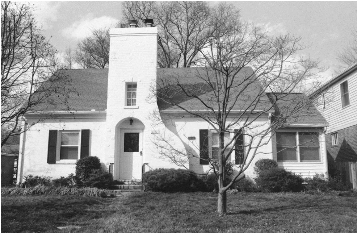
Figure 7: House, 4807 11 th Street, North (000-8664)

The single-family dwelling at 4807 11 th Street, North (000-8664) is worthy of note as an example of the Tudor Revival style with the exterior chimney dominating the façade. The one-and-a-half-story structure, constructed of brick in 1935, measures three bays wide and two bays deep with a one-story side addition. The massive chimney, which is now painted white, is detailed with rough-cut stones, a corbeled cap, and sloping single shoulder. The chimney is pierced on the first story by the primary entry into the dwelling, the only documented example of this treatment in Arlington County to date. The semi-circular-arched opening, detailed with a soldier-coursed lintel, is deeply recessed and holds a paneled wood door. Symmetrically placed above the entry opening is a small six-light window with a rowlock-brick sill and rough-cut stone keystone with soldier-coursed lintel.