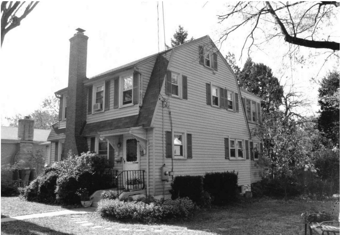
Figure 5: 714 North Abingdon Street (000-8033)

The modest two-and-a-half-story dwelling at 714 North Abingdon Street was constructed in 1936, reflecting the features of the Dutch Colonial Revival style. The wood-frame structure is clad with weatherboard siding on a solid masonry foundation. The side-gambrel roof, indicative of the style, is clad with asphalt shingles and pierced by a full-width shed-roof dormer holding three single window openings. The three-bay-wide façade is defined by the side entry, sheltered by a shed roof supported on brackets, and two single window openings holding 1/1 double-hung replacement windows. The window openings flank the exterior brick chimney that dominates the façade.