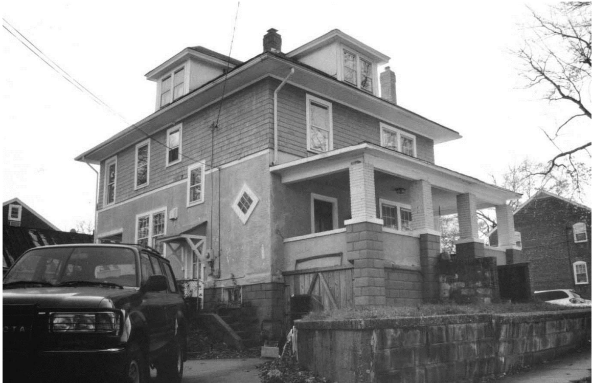
Figure 20: House, 4810 9 th Street, North (000-7953)

Another of the building forms of the early 20 th century noted in the survey area is the American foursquare, which was commonly ornamented with Colonial Revival- and Craftsman-style detailing. The two-story, four-room-per-floor house plan without a hall is a much-used concept that refers to the hall/parlor plan of the 18 th century. One illustration of the several American foursquares exhibiting architectural detailing fashionable in the early part of the 20 th century is the house at 4810 9 th Street, North (000-7953). This imposing freestanding dwelling, constructed in 1900, has the characteristically distinguished two-story height, hipped or pyramidal roof with pronounced eaves and dormers that light an extra half-story, large front porch, and the lack of ornate exterior ornament. The overall shape is a cube, and the main entry opening is located off-center. Other examples of this popular building form are located at 722 North Wakefield Street (000-8008), 4814 Wilson Boulevard (000-8074), 3809 14 th Street, North (000-8195), and 1221 North Utah Street (000-8317).