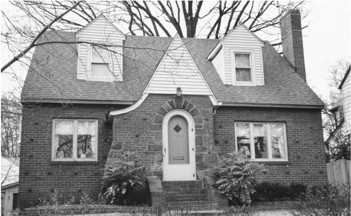
Figure 6: House, 1404 North Vermont Street (000-8409)

The modest Cape Cod form of the dwelling at 1404 North Vermont Street (000-8409) is one example of the varying forms and massing of Tudor Revival-style buildings in Arlington County. Constructed in 1935, the one-and-a-half-story house is constructed of brick laid in stretcher bond with skintled bricks. The central entry is set within a projecting front-gabled bay with a steeply pitched roof and single shoulder. The entry bay is detailed with rough-cut uncoursed stone. The narrow semi-circular-arched entry opening is framed with rough-cut stones and holds a vertical-board wood door with a small diamond light. Front-gabled dormers now clad with aluminum siding pierce the side-gabled roof. An exterior-end brick chimney projects from the side of the structure.