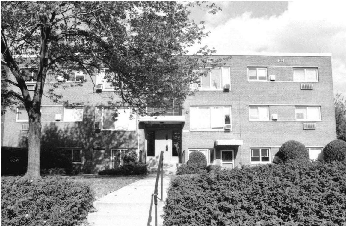
Figure 11: Jordan Manor Apartments, 4525-4527 Wilson Boulevard (000-7882)

Modern building materials similarly influenced the 1956 design of the Jordan Manor Apartments at 4525-4527 Wilson Boulevard (000-7882). The complex consists of two attached buildings, collectively housing twenty-one (21) units. The large casement and fixed windows are held in metal frames with metal sills and lintels uniting the openings. The primary entry, located in the center bay of each building, consists of a single flush door framed by one-light sidelights. A large multi-light window set symmetrically over the entry illuminates the stair hall. The primary and secondary entry openings are sheltered under cantilevered flat roofs of metal with rounded corners. The use of horizontal metal is continued along the edges of the flat roof, which has metal coping on the parapet wall.