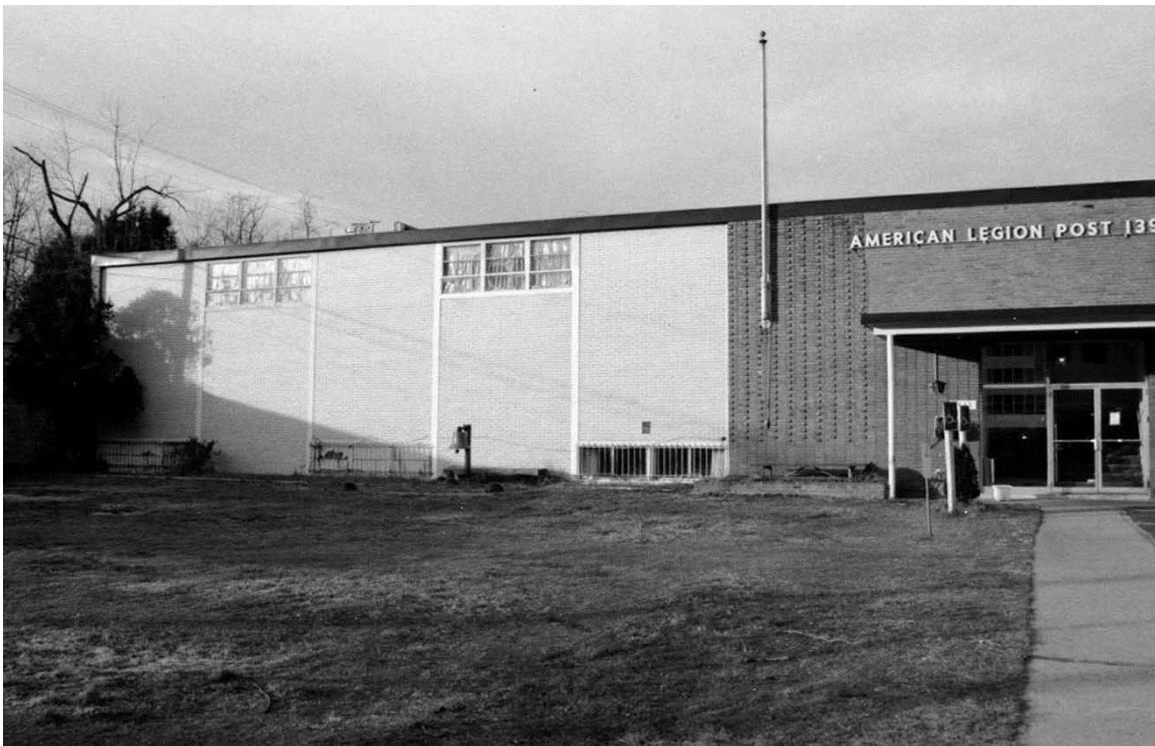
Figure 31: American Legion Post 139, 3445 Washington Boulevard (000-8362)