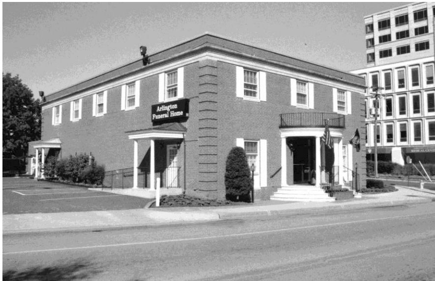
Figure 29: Arlington Funeral Home, at 3901 Fairfax Drive (000-7836)