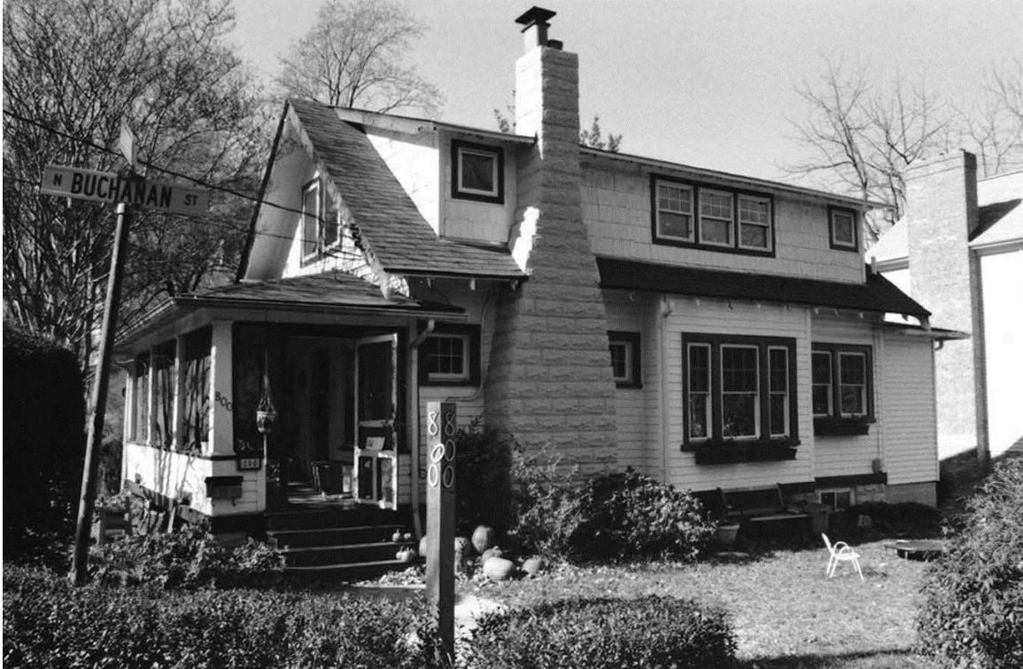
Figure 8: House, 800 North Buchanan Street (000-7932)

(000-8006), 3600 14 th Street, North (000-8153), 3450 13 th Street, North (000-8179), 1303 North Quincy Street (000-8213), 3809 Washington Boulevard (000-8228) 3813 Washington Boulevard (000-8229), and 3901 Washington Boulevard (000-8230).