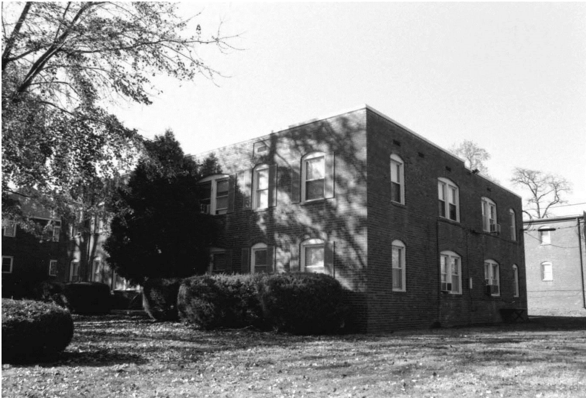
Figure 23: Fairfax Drive Apartments, 4801 9 th Street, North (000-7965)

The construction of garden apartments in the Washington, D.C. metropolitan area reached a peak in the mid-1930s and early 1940s. In Arlington County, local officials and the federal government wanted to avoid the construction of sub-standard, large-scale developments that would dissolve into slums after the housing emergency eased. Thus, one of the focuses of apartment developments between 1934 and 1954 was the need to construct affordable, attractive and permanent housing. Cost efficiency was continuously emphasized in the construction process, especially for projects backed by the Federal Housing Administration.