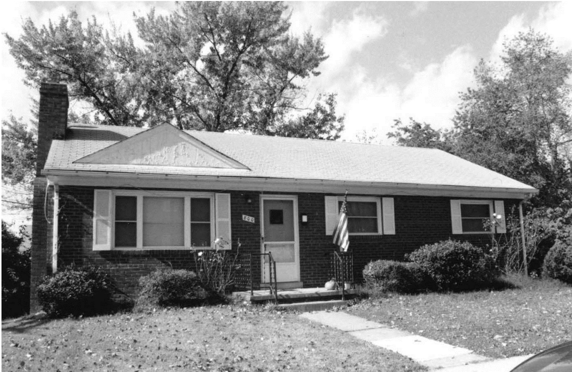
Figure 24: House, 800 North Woodrow Street (000-7896)

In keeping with their historic counterparts, many of the dwellings erected during this modern period embodied the styles, materials, and forms traditionally utilized in Arlington County. One modern plan that emerged was the ranch dwelling. This one-story structure, often constructed of metal or wood frame with brick cladding, is generally rectangular in form with a projecting bay or front gable. The gable or hipped roofs have shallow pitches counterbalanced by the front gable of the projecting bay. The entries are traditionally set off-center, and recessed within the wall plane. There is no symmetry as a variety of window openings are utilized, each opening suggesting the use of the interior space it illuminates. For example, the larger picture windows light the living room and the standard double-hung windows provide a more reduced amount of natural light to the bedrooms. The building at 800 North Woodrow Street (000-7896) is an example of the houses constructed on many of the unimproved lots during the mid- to late 20 th century.