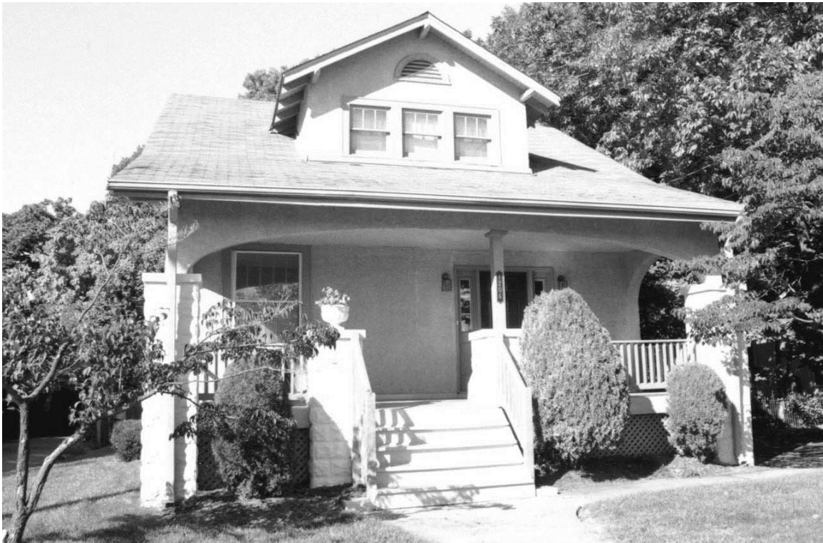
Figure 16: House, 1206 North Stafford Street (000-7841)

Often, in Arlington County, the bungalow form was reduced in scale because of the narrow building lots on which they were construction. The form adapted well, retaining many of its identifying features. This includes a deep porch set within the main roof, dormers with varying window sizes and types, paired and triple window openings, and expansive overhanging eaves. The stylistic ornamentation, albeit vernacular, reflected the Craftsman-style influences with exposed rafter ends and multiple-light upper sash windows. The use of rock-faced concrete blocks in the construction of the foundation, porch supports, and associated outbuildings was common.