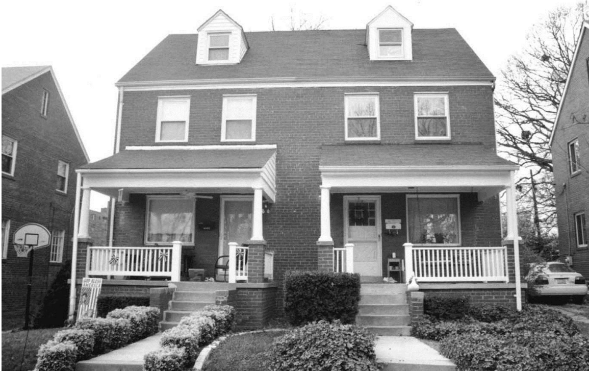
Figure 22: Twin Dwelling, 1222-1224 North Lincoln Street (000-8193)

Commonly, these buildings have side-gabled roofs with shallow boxed cornices and side entries. The form of the front porch and/or cladding materials often suggests the existence of two single-family units within one structure. Similarly, the unification of the twin dwellings to read as a single structure is indicated by the full-width front porch and cladding materials.