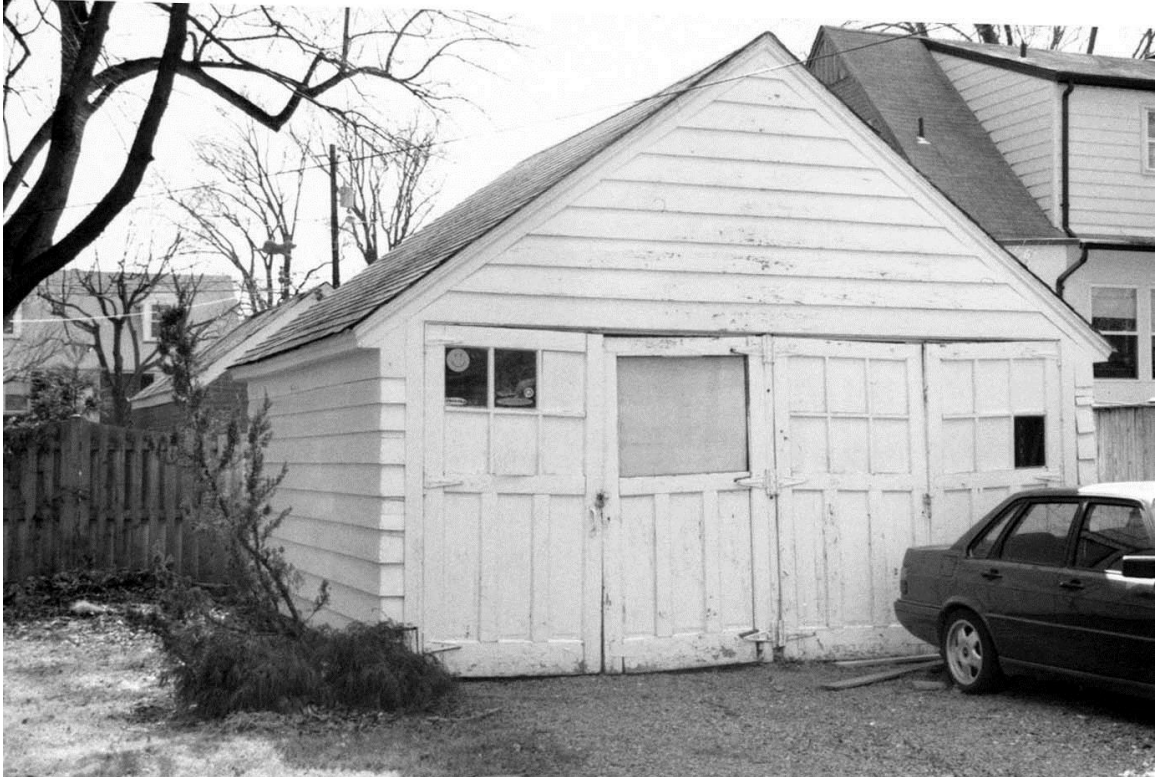
Figure 25: Garage, 1158 North Columbus Street (000-8658)

Typically, domestic resources constructed in Arlington County had associated outbuildings, particularly garages and sheds. These structures were commonly built of wood frame or brick, depending on the construction material of the main dwelling. The most significant number of outbuildings were constructed during the World War I to World War II period, usually simultaneous with the original construction period of the main dwelling.