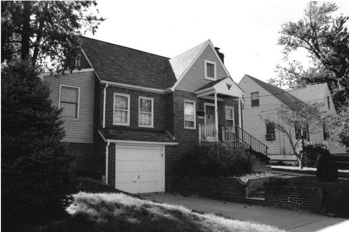
Figure 26: House, 4704 8 th Road, North (000-7919)

In an attempt to attract upper-middle-income residents, many of the dwellings were constructed with the associated garage as part of the main block. Many of the dwellings from the second quarter of the 20 th century present a rectangular three- to five-bay-wide plan augmented by a one-story side wing that houses the automobile. As the dependence on the automobile increased, the garage became an essential part of the dwelling. This is illustrated at 814 North Abingdon Street (000-7819), 4704 8 th Road, North (000-7919), and 4710 8 th Road, North (000-7920).