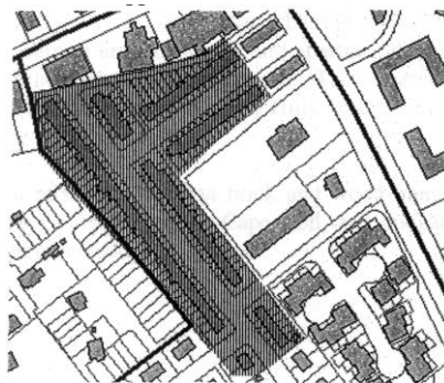
STUDY AREA FOR A PROPOSED HISTORIC DISTRICT IN GLEBEWOOD

Located in Neighborhood Service Area B, GlebeWood contains 105 single-family dwellings presented as seven rowhouses, a distinct building form and cohesive neighborhood in Arlington County. The facades of the individual dwellings are distinctly detailed, with varying roof forms, cladding materials, and stylistic influences. The rowhouses in GlebeWood, located adjacent to late-20 th -century dwellings, are located on North 21 st Road and North Brandywine Street, south of Lee Highway and west of North Glebe Road. Architect-designed, the rowhouses appear to date from the 1940s.