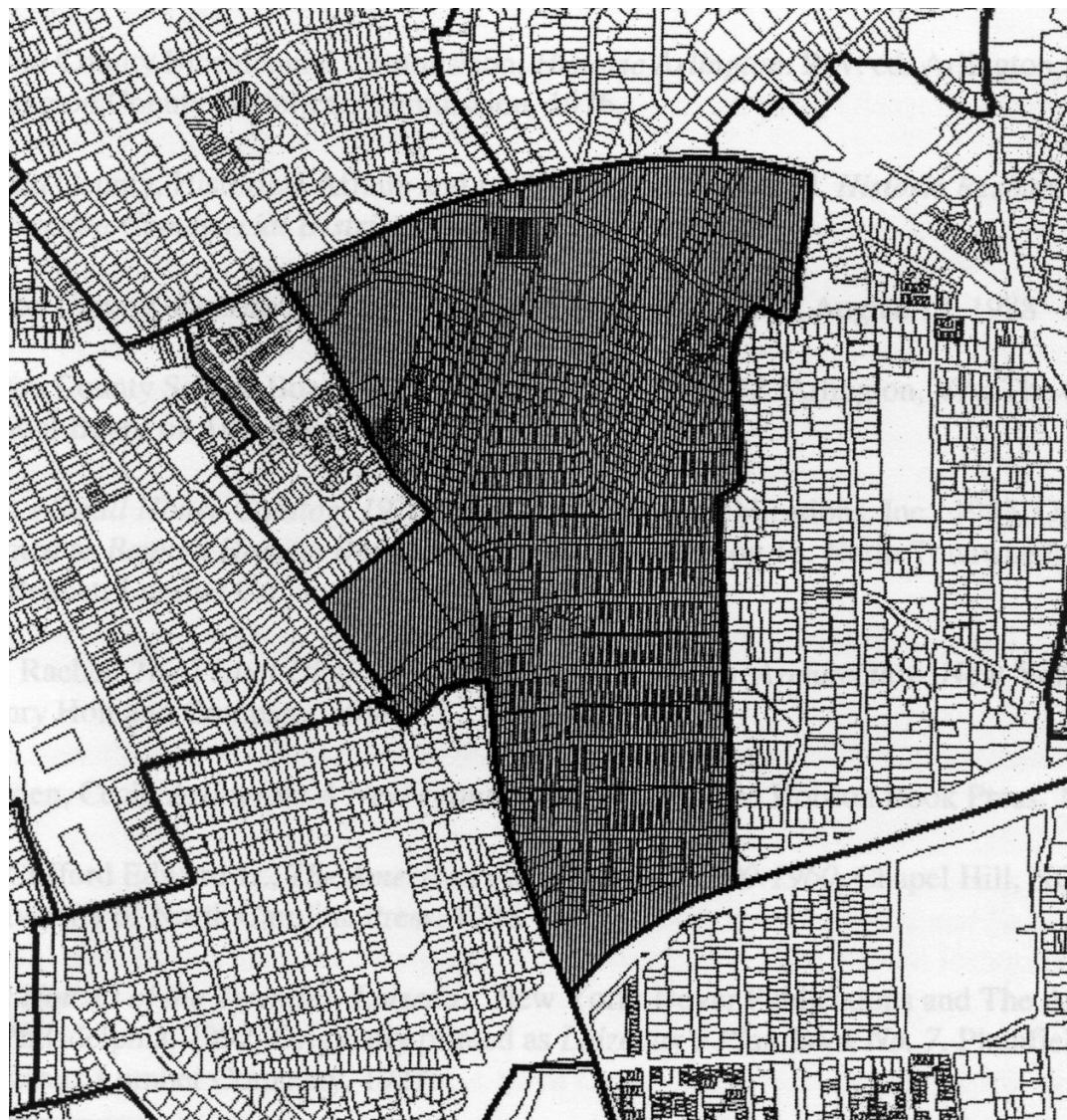
STUDY AREA FOR A PROPOSED HISTORIC DISTRICT IN WAVERLY HILLS