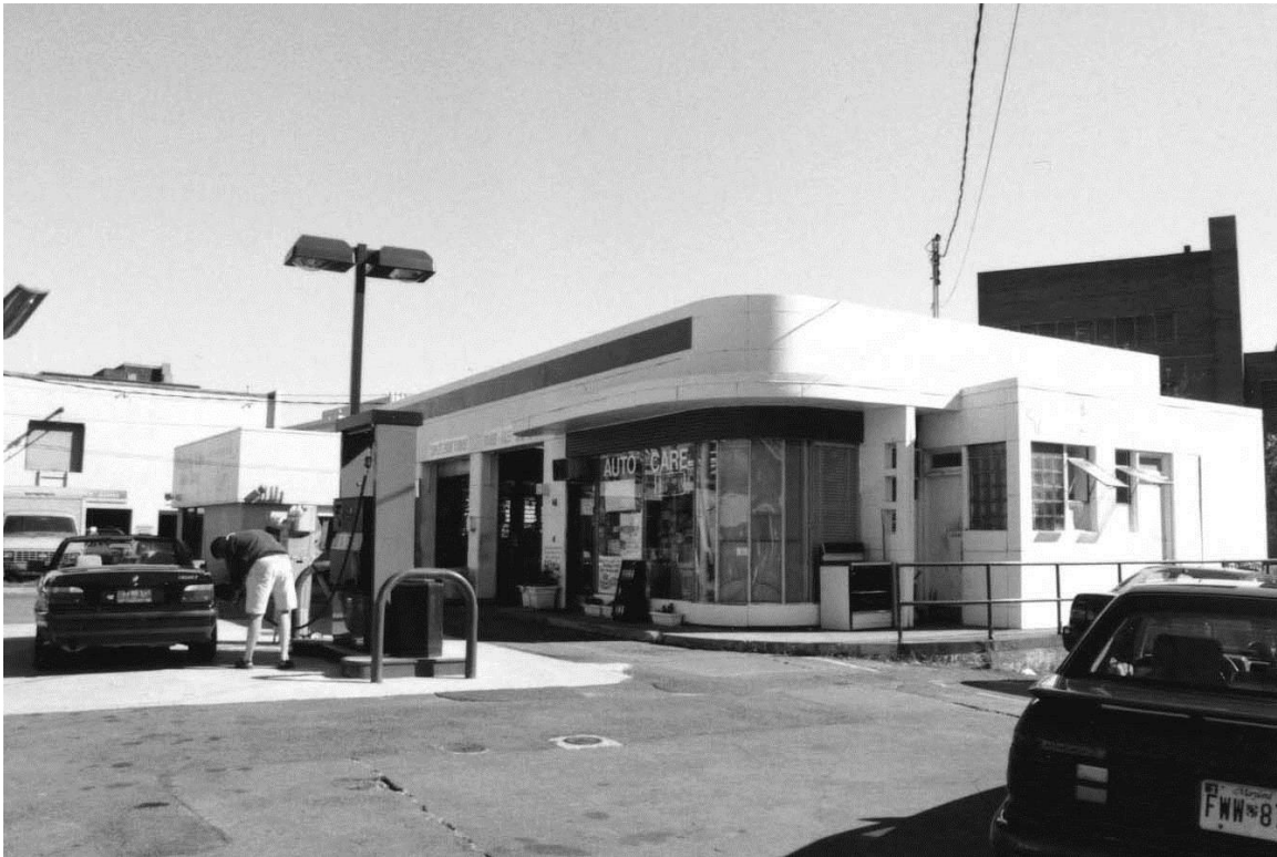
Figure 9: Service Station, 3444 Washington Boulevard (000-7835)

Like the Art Deco style, Art Moderne or Streamline Moderne is a stylistic category that adorned more resources in the central part of Arlington County, particularly along the major transportation corridors. The style typically lends itself well to the commercial and institutional buildings flanking these corridors. Stylistic features, like those associated with the Art Deco, are not generally applied, but are structural. This includes curved wall surfaces, slightly projecting panels or stringcourses, stepped parapets, and multiple-colored building materials. The service station at 3444 Washington Boulevard (000-7835) is an example of this style.