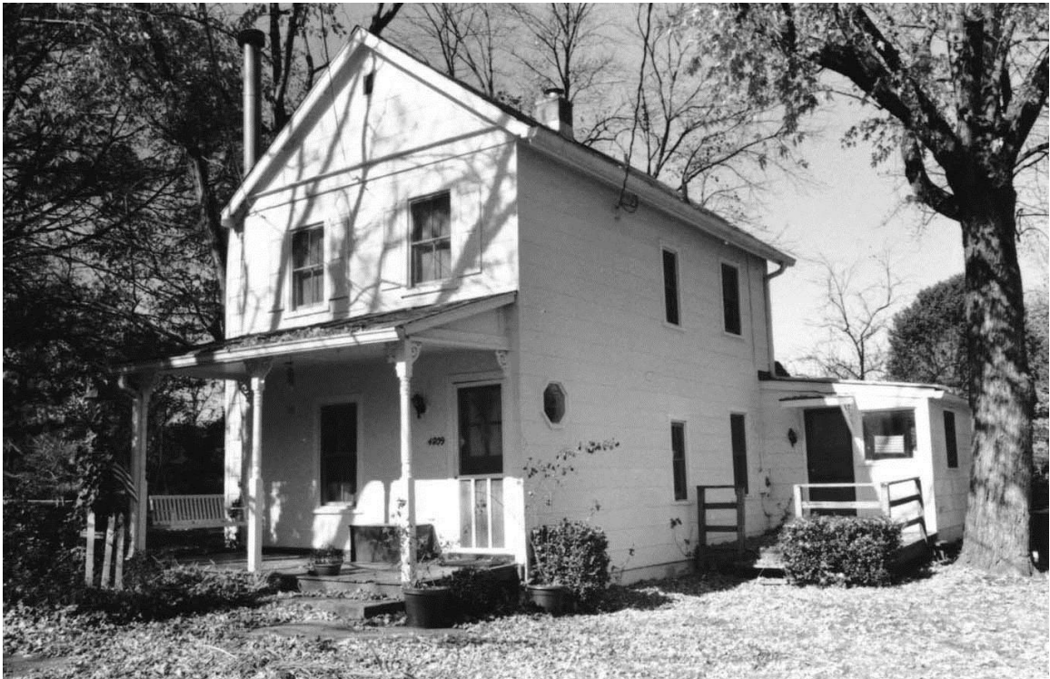
Figure 2: House, 4809 8 th Road, North (000-7930)

By the second quarter of the 20 th century, the irregular form commonly associated with the style was lost in favor of the rectangular box. The front-gabled form, complete with full-width or wrapping porch, displays the turned posts, cornice detailing, and window configurations of the Queen Anne style. These dwellings – 4809 8 th Road, North (000-7930) and 2102 North Dinwiddie Street (000-8502) – show the dilution of the applied detailing in an effort to provide more economical housing on narrow lots. This form of the Queen Anne-style residential building was the most prevalent. Such examples include 4741 Wilson boulevard (000-7928), 4737 Wilson Boulevard (000-7929), 4805 8 th Road, North (000-7931), 4830 9 th Street, North (000-7956), 5008 22 nd Street, North (000-8503), and 5010 22 nd Street, North (000-8504)