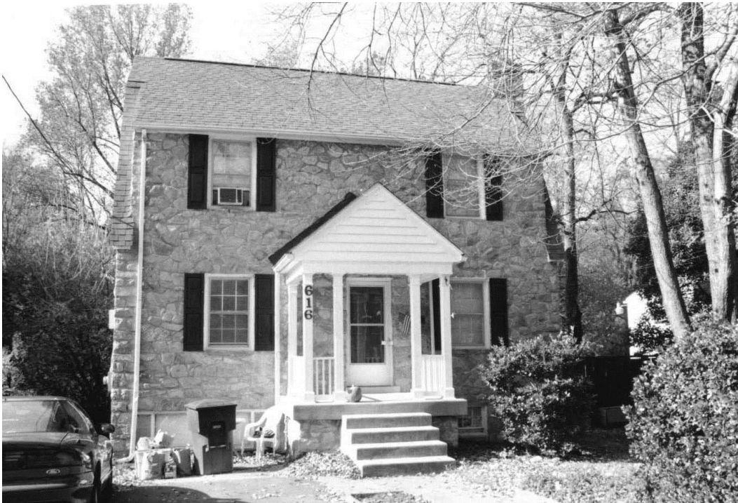
Figure 17: House, 616 North Abingdon Street (000-8028)

The larger dwellings dating from this period more often illustrated the Colonial Revival style, gaining popularity in suburban neighborhoods after the turn of the 20 th century. Typically, the houses display a central-passage plan, although a substantial number of side-passage plans were documented. The rectangular buildings commonly measure three to five bays in width with a variety of rooflines, including side gable and gambrel. Drawing from several popular architectural styles of the early part of the 19 th century, the dwellings exhibit accentuated entry doors, normally decorated with pediments supported by pilasters or slender columns. Dormers range in form from front gable, semi-circular arched, shed, and eyebrow windows. These three- to five-bay-wide dwellings are commonly constructed of wood frame or brick with side-gable roofs clad in asphalt shingles. A minimal number of stone dwellings were also noted in the survey area. These structures presented the same form as their wood-frame and brick counterparts.