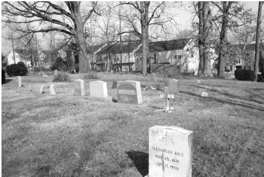
Figure 28: Mount Salvation Baptist Church, 1961 North Culpeper Street (000-8469)

Arlington Funeral Home, dating from about 1945, is located at 3901 Fairfax Drive (000-7836). The purpose-built funeral home draws from the Classical and Colonial Revival styles of architecture, displaying an elliptical portico with Tuscan columns and pilasters. The building, constructed of brick laid in six-course Flemish bond, is detailed with brick quoins, a limestone cornice, and 8/12 double-hung sash windows with jack-arched lintels.