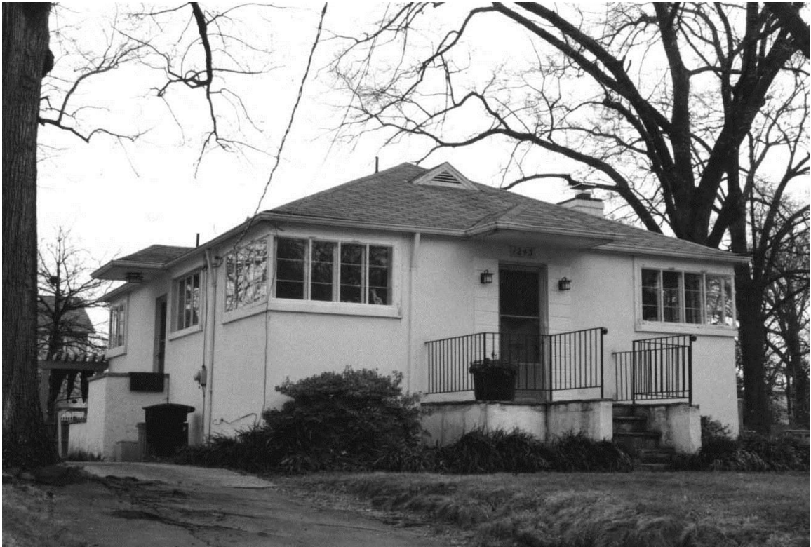
Figure 10: House, 1243 North Stuart Street (000-8262)

Influenced by the Art Deco, Streamline Moderne, and International styles, the buildings designed in the Modern Movement were minimal in their applied ornamentation and utilized contemporary building materials. Typically, the stylistic ornamentation was presented by the materials and forms, such as glass blocks, metal window frames, flat cantilevered roofs, and corner windows. The structures were often constructed of masonry with stretcher-bond brick or stuccoed concrete block. Surrounds were composed of contrasting masonry materials such as stone or exposed concrete blocks.