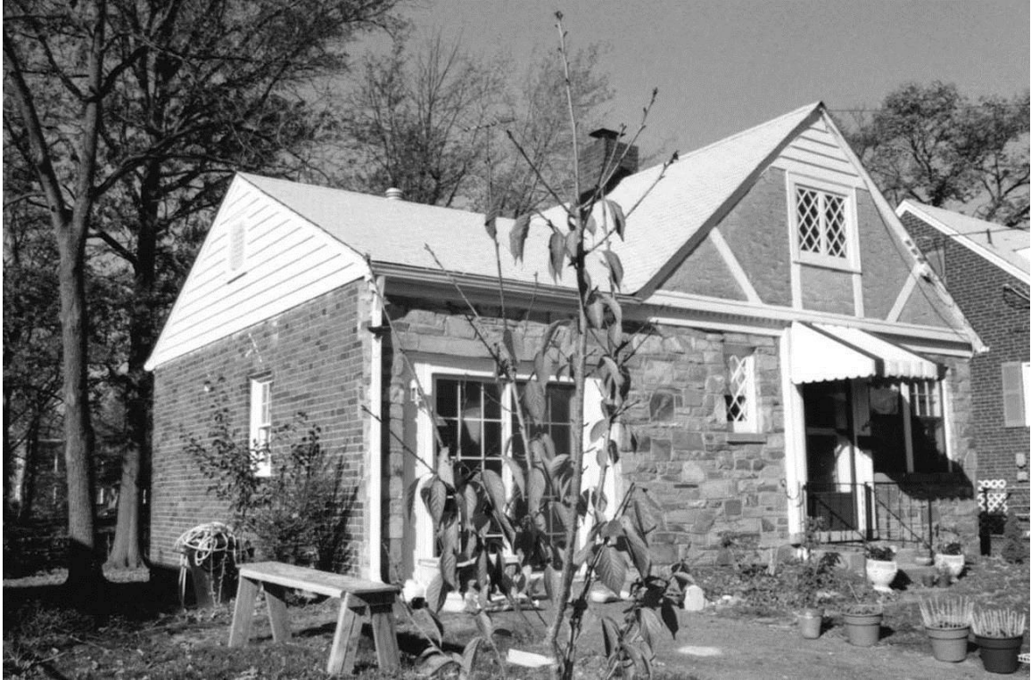
Figure 19: House, 862 North Abingdon Street (000-7942)

second floor of the building. The applied detailing and stylistic interpretation of the buildings varied, further separating the individual dwellings. The house at 862 North Abingdon Street (000-7942), dating from 1940, measures three bays wide and one bay deep on a solid masonry foundation. The one-and-a-half-story structure is faced with uncoursed stone on the façade and stretcher-bond brick on the side and rear elevations. The dominating front gable is finished with rough stucco and half-timbering. It is pierced by a paired diamond-paned casement window with a wide surround detailed with back banding.