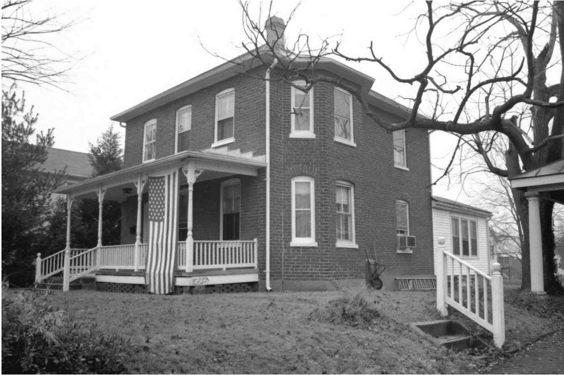
Figure 15: House, 4806 Wilson Boulevard (000-8073)

Constructed in 1895, the brick dwelling at 4806 Wilson Boulevard stands two stories in height with a shallow-pitched hipped roof. The square structure, featuring a side-passage plan, measures three bays wide and two bays deep with a one-story wood-frame addition on the rear. A canted three-sided bay that extends the full height of the structure marks the side elevation. The first-story openings are elongated and the second-story openings are standard, each holding 2/2 double-hung wood sash windows with projecting wood sills and segmental-arched soldier lintels. A full-width front porch presented in the Queen Anne dominates the façade. The porch is set on brick piers and has a half-hipped roof supported by fancy turned posts. It is detailed with scrolled brackets and square balusters.