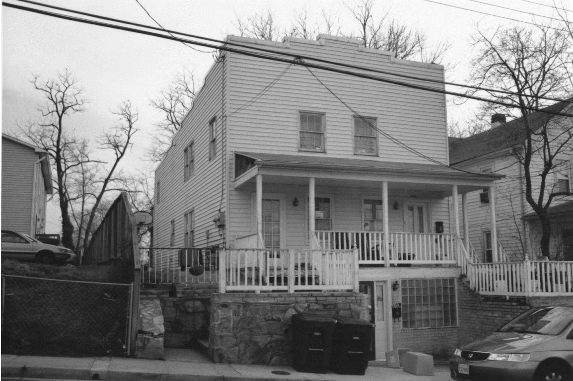
Figure 21: Twin Dwelling 4906-4908 22 nd Street, North (000-8494)

Housing demands also prompted the construction of twin dwellings that provided for more than one family within a single structure. It is one of the more popular domestic building forms in Arlington County. The twin dwelling at 4906-4908 22 nd Street, North (000-8494) is an uncommon example of this form, with its sloped roof and parapet. Reminiscent of the Italianate style in form, the building stands two stories in height on a solid concrete foundation. This wood-frame building, clad now in vinyl siding, has a unifying full-width front porch supported by square posts. The primary façade reads as a single dwelling, pierced on the first story by two single-leaf side-passage entry doors.