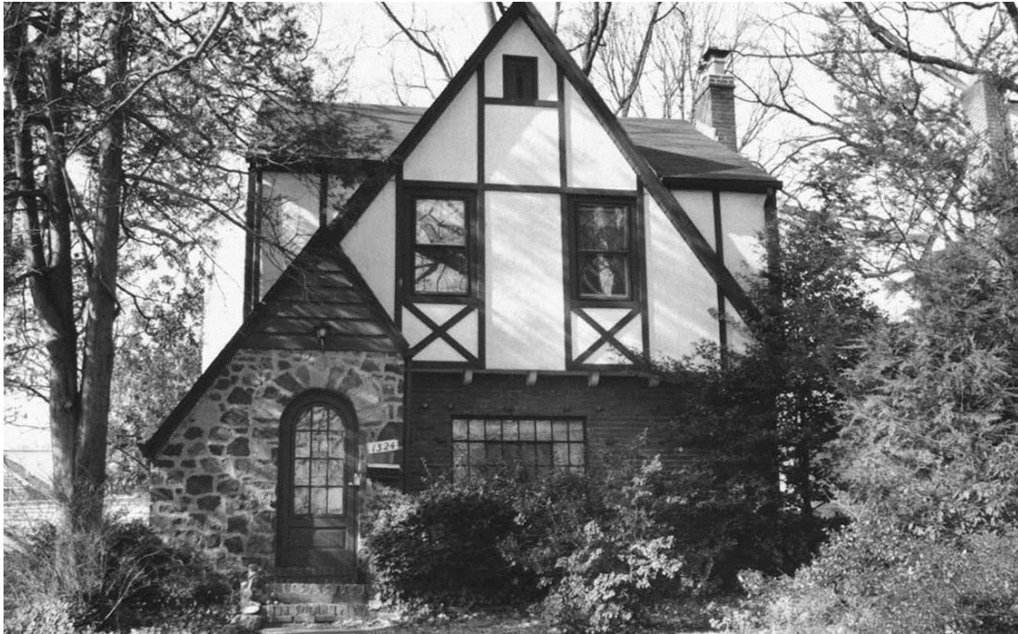
House, 1324 North Vernon Street (000-8398)