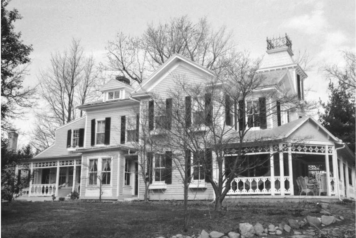
Figure 1: House, 5151 14 th Street, North (000-5787)

shaped form augmented by a wrap-around porch. The wood-frame building is clad with weatherboard. The porch has a half-hipped roof ornamented with square posts, a scroll-sawn spindle rail, and square balusters with cut bracketing. The building displays a corner tower with a mansard roof, overhanging eaves with modillions, and a decorative wrought-iron widow's walk. The two-and-a-half-story house is detailed with projecting enclosed and open gables, cornice returns, bed molding and plain friezeboard, corner boards, single and paired 2/2 double-hung windows, scrolled brackets, and a cross-gabled roof sheathed with pressed metal shingles.