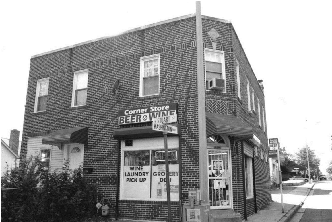
Figure 13: Store/Dwelling, 1142-1144 North Stuart Street (000-7863)