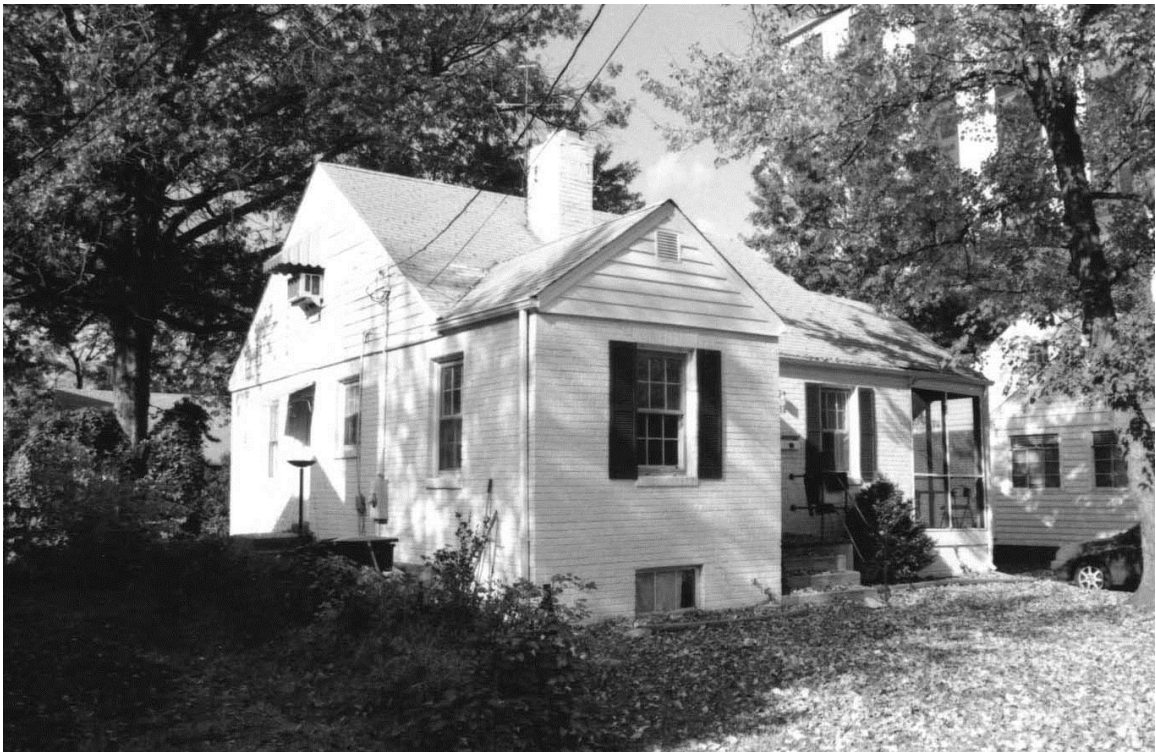
Figure 12: House, 832 North Wakefield Street (000-7877)

The building types that did not reflect a particular style were designated as "Other." This designation was used the majority of the time in the survey area and largely included domestic dwellings that were one-and-a-half stories in height and most of the associated historic outbuildings identified. As noted in previous surveys of Arlington County, the most prevalent form was the L-shaped dwelling with a cut-away front porch. Generally without ornamentation, this building type was constructed during the housing boom of the World War I to World War II Period and the New Dominion Period. The lack of detailing on many of the houses, apartments, and commercial buildings countywide allowed for quick inexpensive construction using readily available materials. Additionally, many of the domestic examples, and several of the commercial buildings, did not conform to any style because the original structure had been severely altered, losing or obscuring the original forms and details.