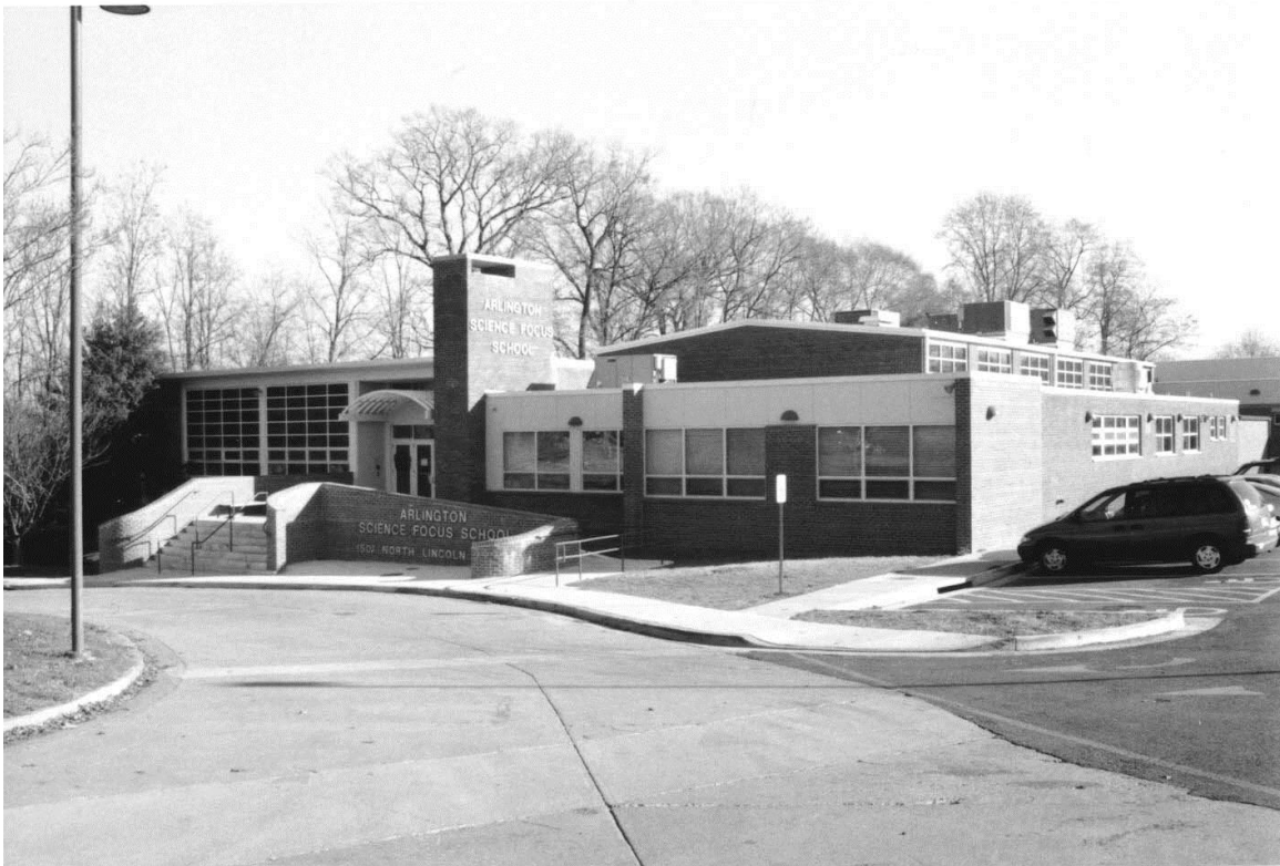
Figure 27: Arlington Science Focus School, 1501 North Lincoln Street (000-8196)

The Phase VI survey effort recorded historic schools, including Arlington Science Focus School at 1501 North Lincoln Street (000-8196) and Washington and Lee High School at 1300 North Quincy Street (000-8243).