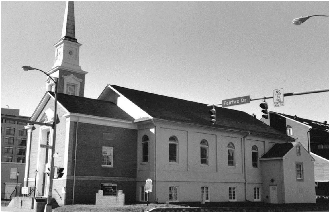
Figure 30: Central United Methodist Church, 4201 North Fairfax Drive (000-7838)

In 1962 the sanctuary and social hall were refurbished for about $160,000 and a new steeple was added by D.A. Foster. The Arlington Historical Society placed a historical marker on the church site in 1969. A chair lift to accommodate the disabled was installed in 1971 and a history room was established on the first floor of the education building on November 23, 1975. A gymnasium was added to the youth center in 1980, and a lighted bulletin board was erected in front of the church in June 1981 and dedicated to the memory of Warren A. Hitt. A room on the third floor of the education building was designated for use by the choir in 1983. The elevator was installed in 1997, making the church accessible to all. 3