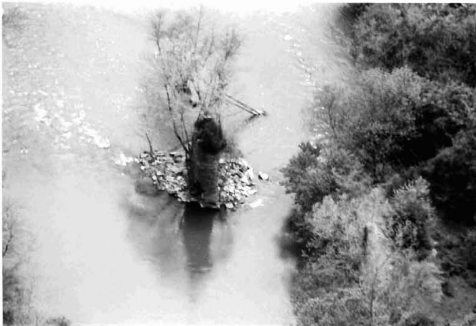
Figure 50 Palmyra Covered Bridge Pier (DHR 32-36) Land and Community Associates