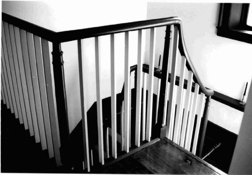
Figure 11 Melrose (DHR 32-19) Land and Community Associates