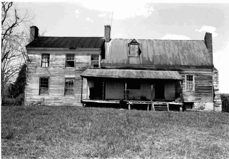
Figure 9 Spring Grove, (DHR 30-74) Land and Community Associates