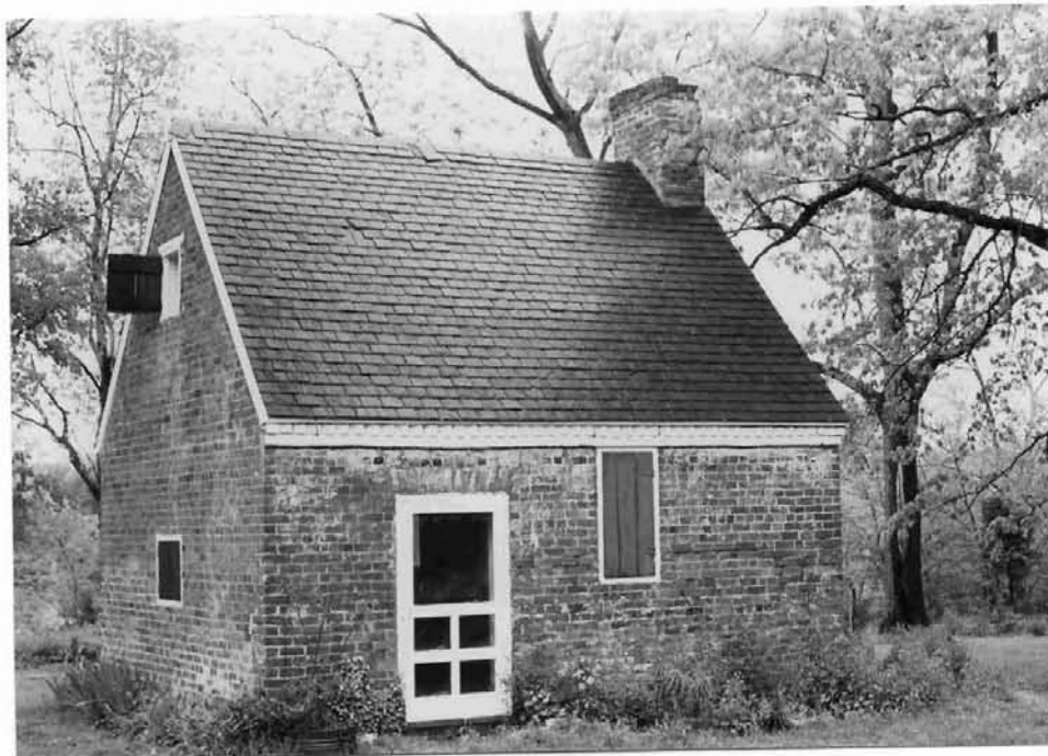
Figure 26 The Oaks, Kitchen, (DHR 32-22) Lindsay Nolting