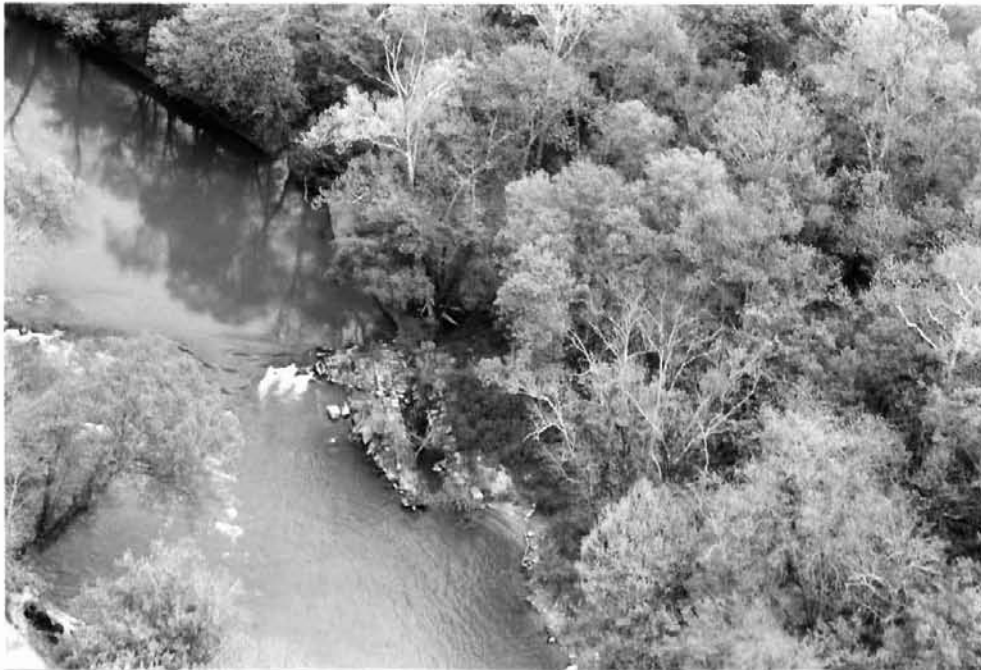
Figure 54 White Rock Lock and Dam (DHR 32-36) Land and Community Associates