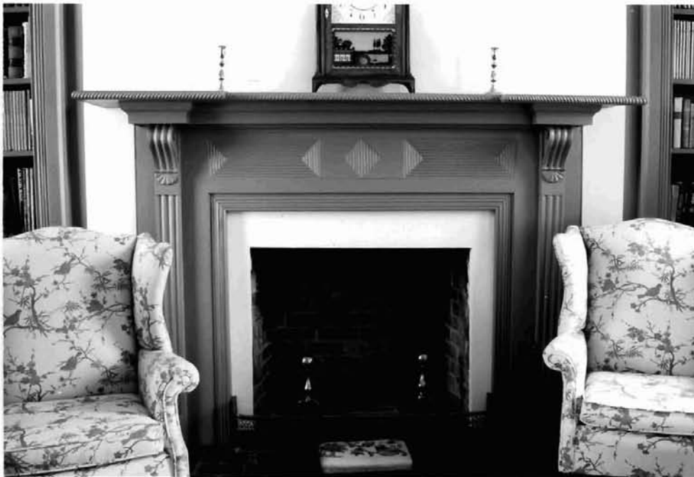
Figure 12 Melrose (DHR 32-19) Land and Community Associates