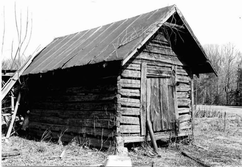
Figure 36 Massie Haden House, (DHR 32-209) Lindsay Nolting