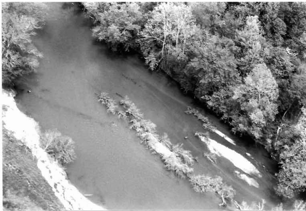
Figure 42 Rock Wing Dam (DHR 32-36) Land and Community Associates