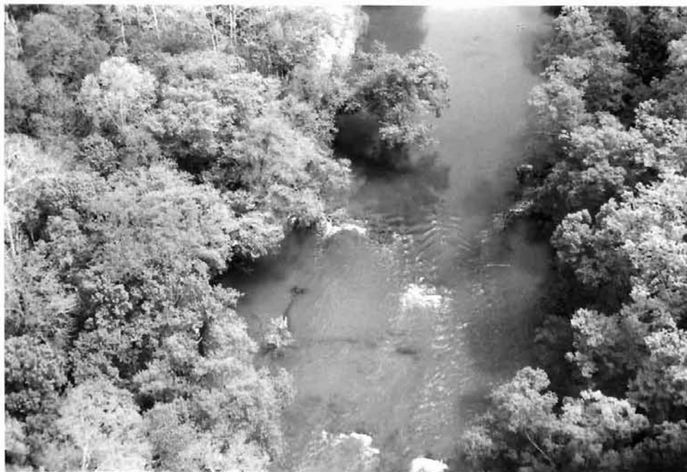
Figure 46 Broken Island Dam (DHR 32-36) Land and Community Associates