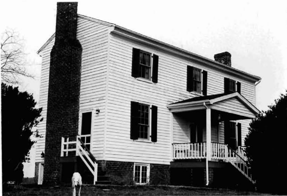
Figure 18 Pleasant Hill (DHR 32-153) Lindsay Nolting