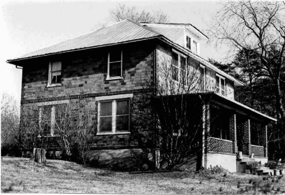
Figure 19 Lilac Terrace (DHR 32-233) Lindsay Nolting