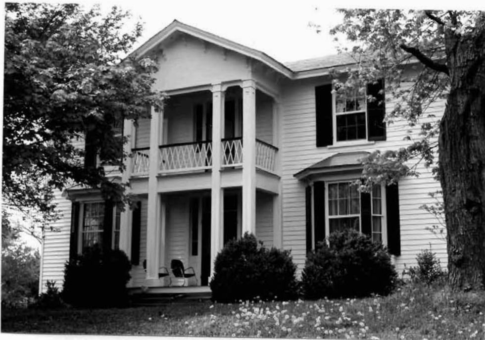
Figure 14 Rivanna Farm (DHR 32-261) Land and Community Associates