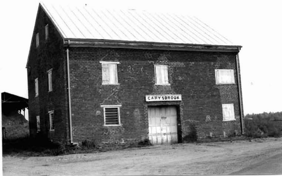
Figure 6 Brick Storehouse at Carysbrook, (DHR 32-7) Land and Community Associates