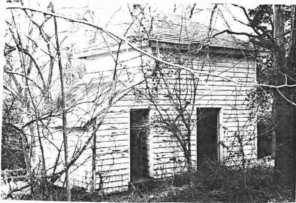
Figure 27 Rose Hill, Smokehouse, Outhouse (DHR 32-xxx) Lindsay Nolting