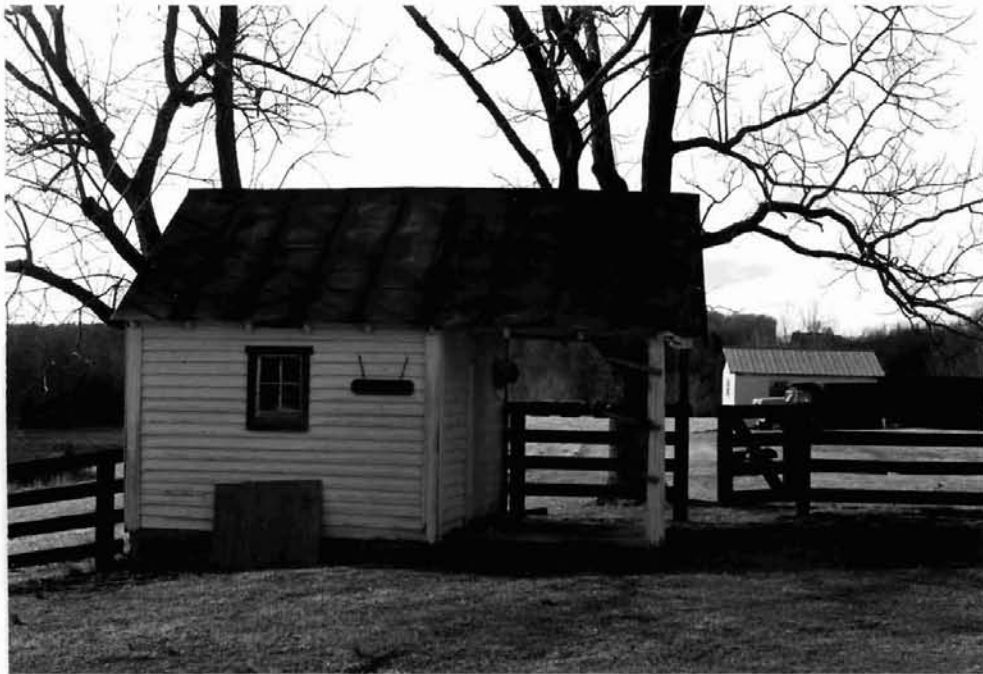
Figure 28 Bryant House, Dairy, (DHR 32-250) Lindsay Nolting