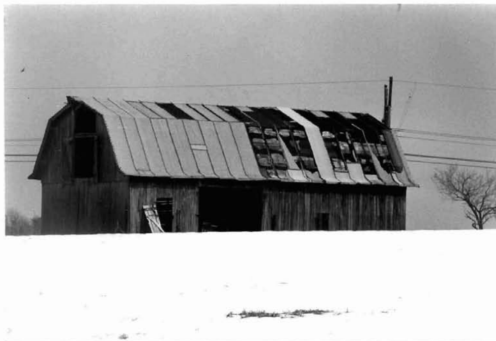
Figure 32 Lewis House, barn, (DHR 32-218) Lindsay Nolting