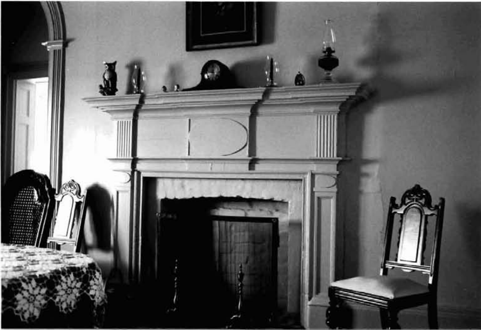
Figure 7 Carysbrook, (DHR 32-7) Land and Community Associates