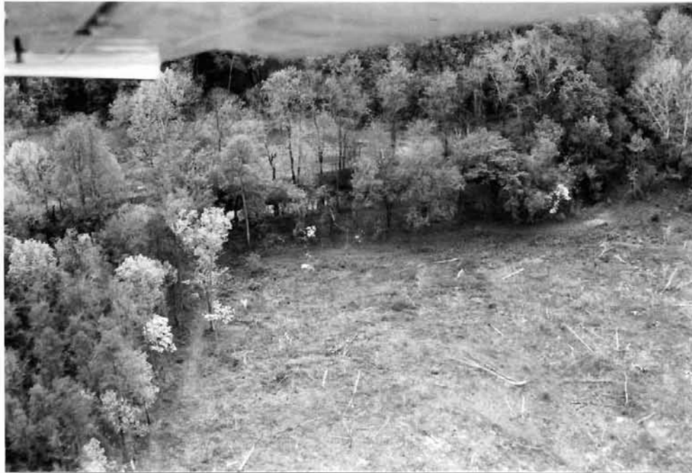
Figure 57 Rivanna Connection (DHR 32-36) Land and Community Associates