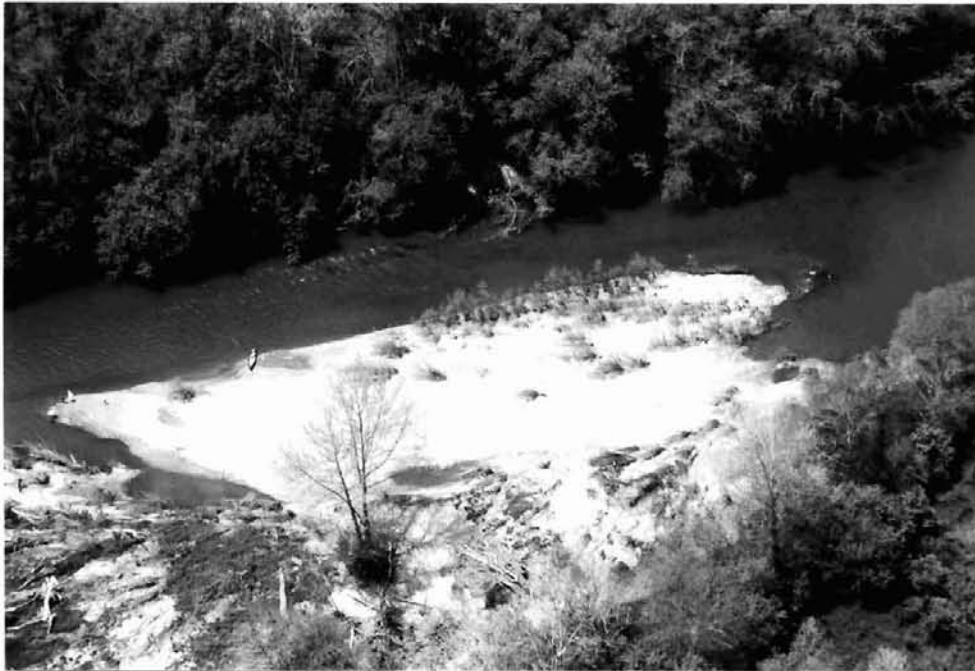
Figure 47 Broken (Pettit's) Island (DHR 32-36) Land and Community Associates