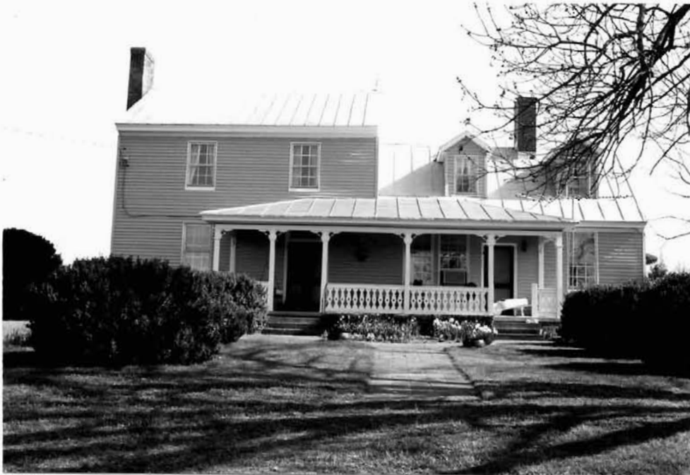
Figure 13 Parrish House (DHR 32-364) Land and Community Associates