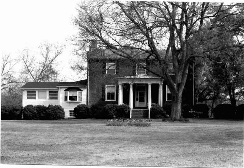
Figure 8 Carysbrook, (DHR 32-7) Land and Community Associates