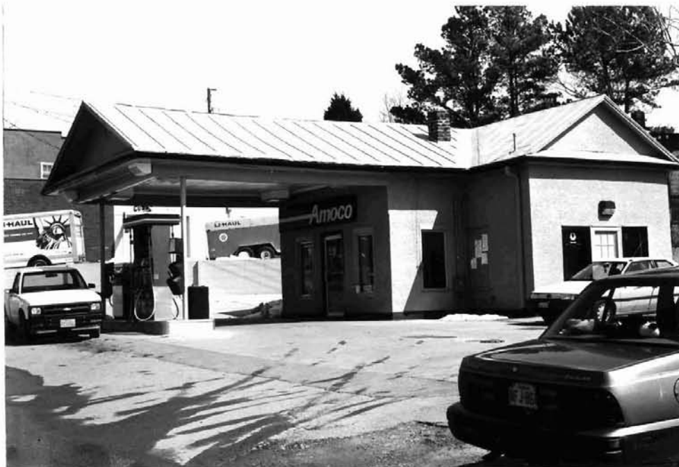
Figure 38 Palmyra Amoco, (DHR 32-372) Lindsay Nolting