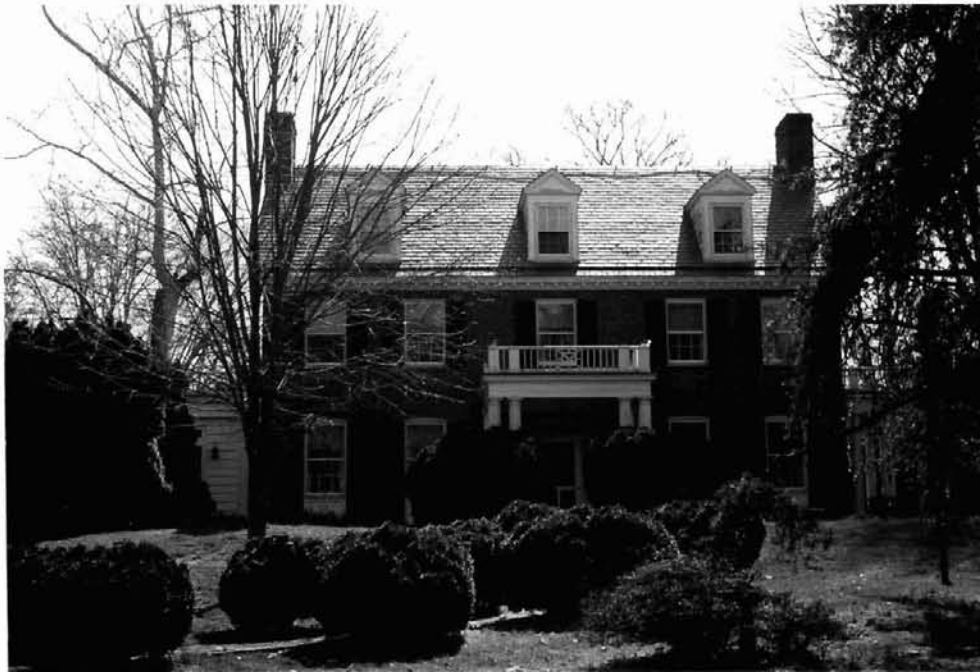
Figure 25 Brides Hill, (DHR 32-196) Lindsay Nolting