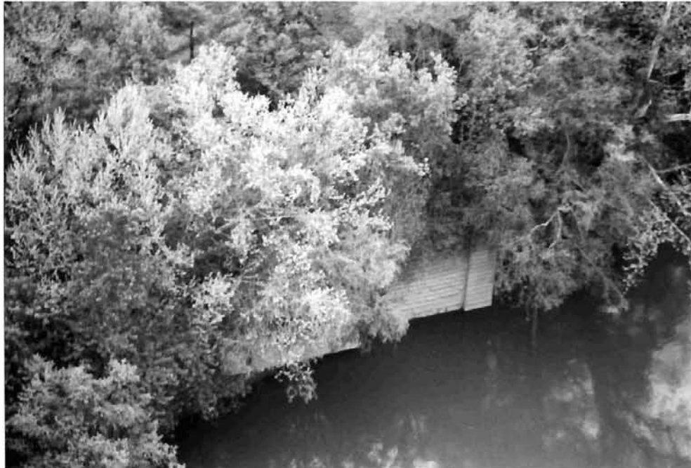
Figure 59 Columbia Lock (DHR 32-36) Land and Community Associates