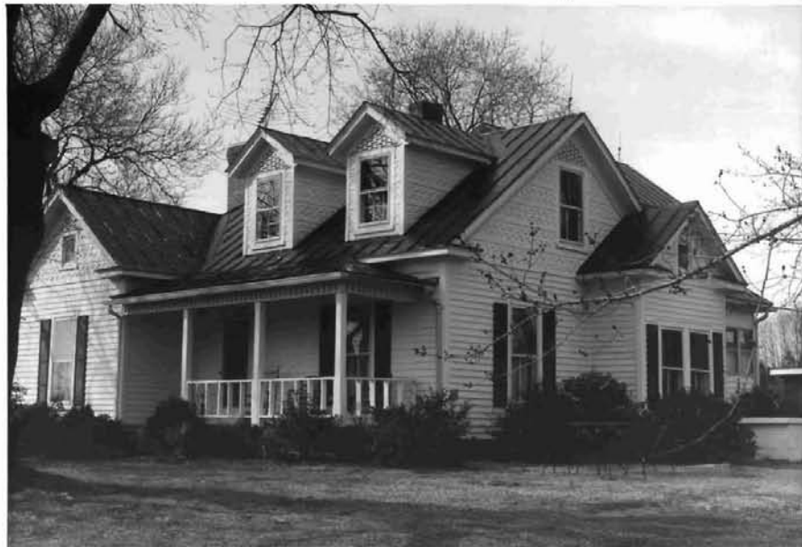
Figure 2 Sears mail-order house (Gillespie), (DHR 32-268) Lindsay Nolting