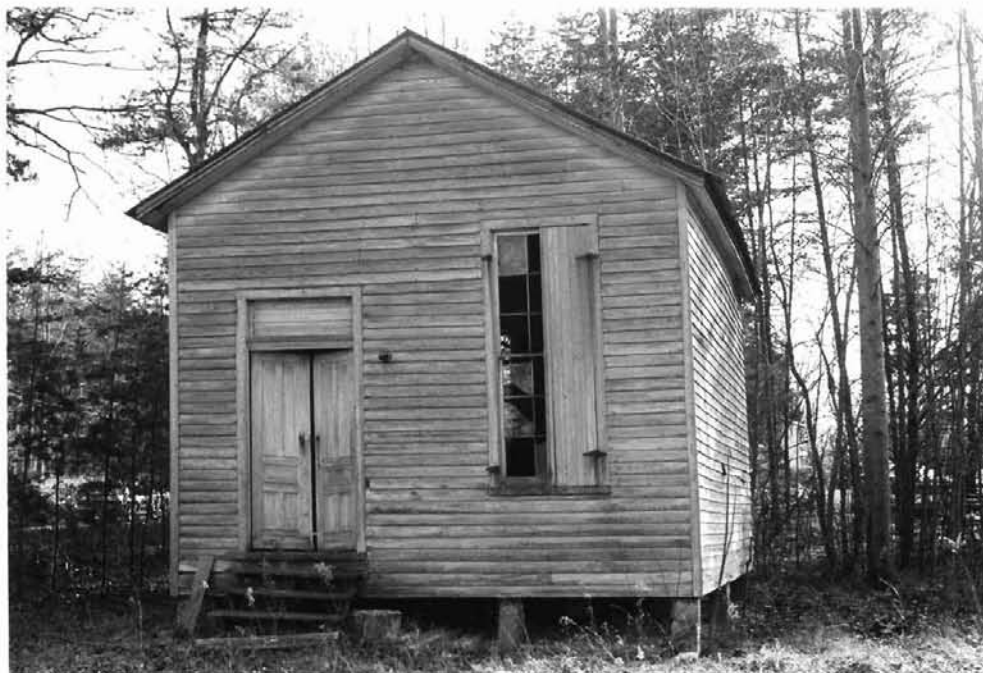
Figure 3 New Fork High School (DHR 32-293) Lindsay Nolting