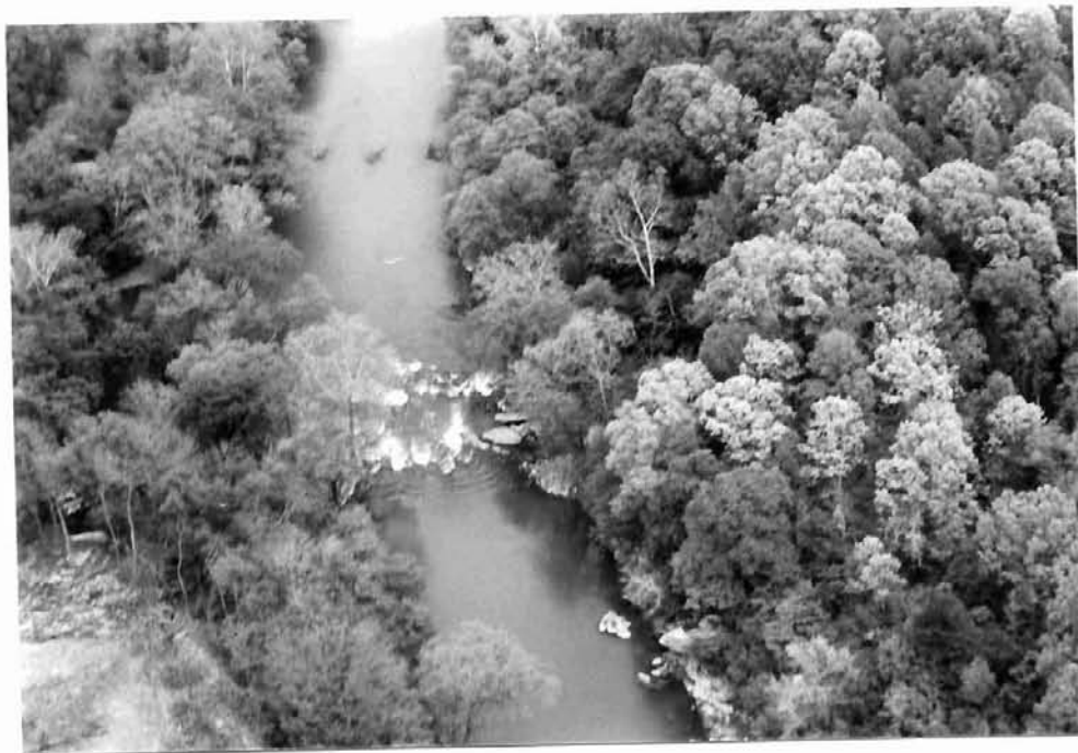
Figure 56 Dam at Rivanna Mills (DHR 32-36) Land and Community Associates