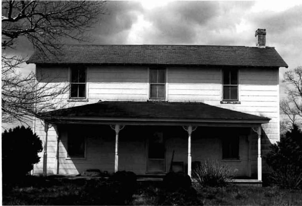
Figure 17 Ritter-Pettit House (DHR 32-282) Lindsay Nolting