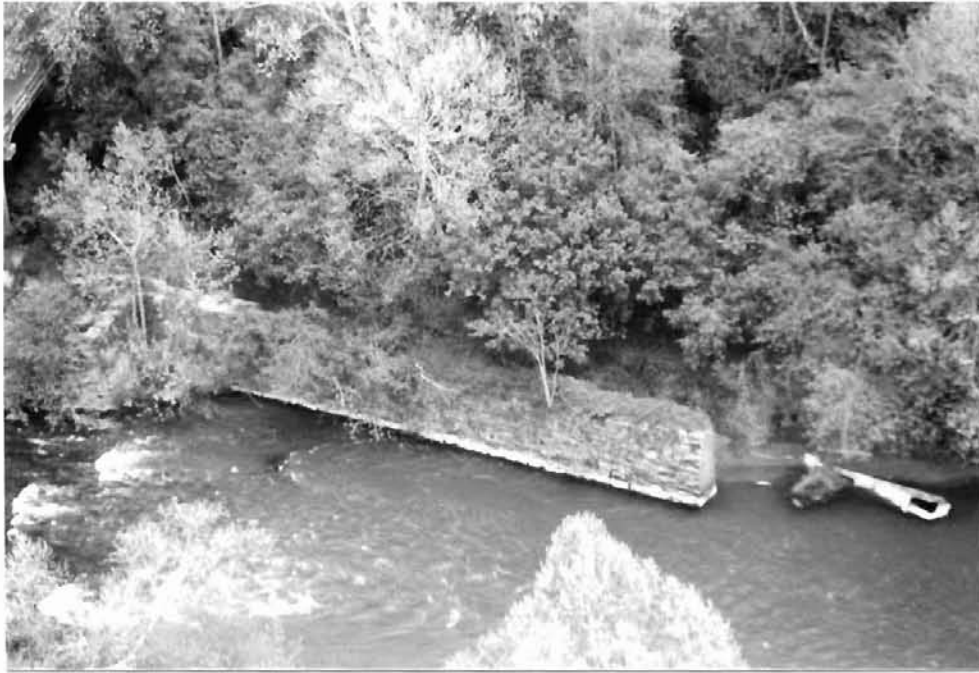
Figure 49 Palmyra Lock (DHR 32-36) Land and Community Associates