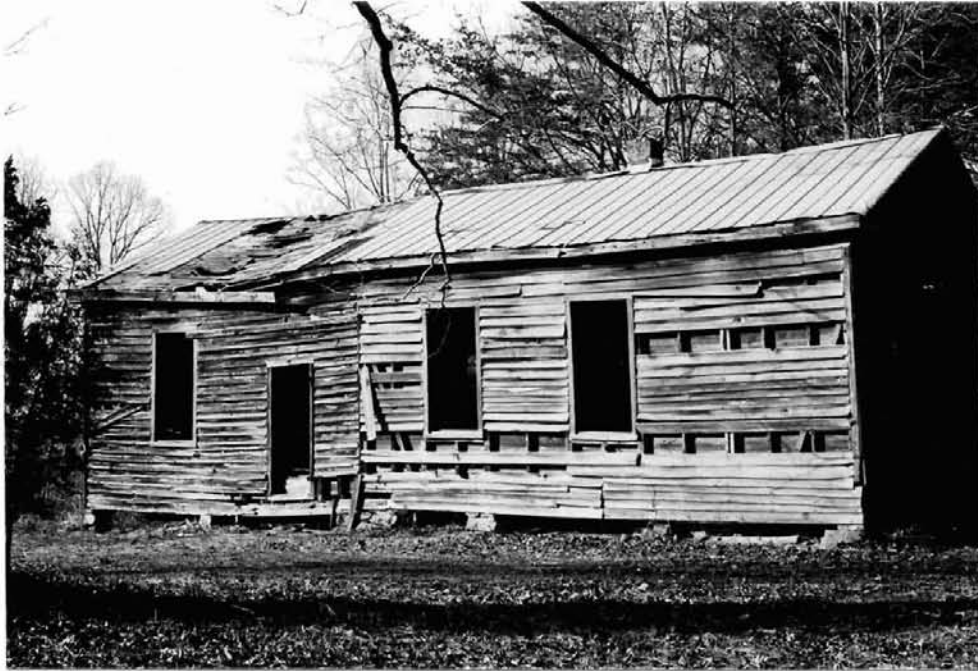
Figure 5 Rivanna School, Hell's Bend Road, (DHR 32-232) Lindsay Nolting