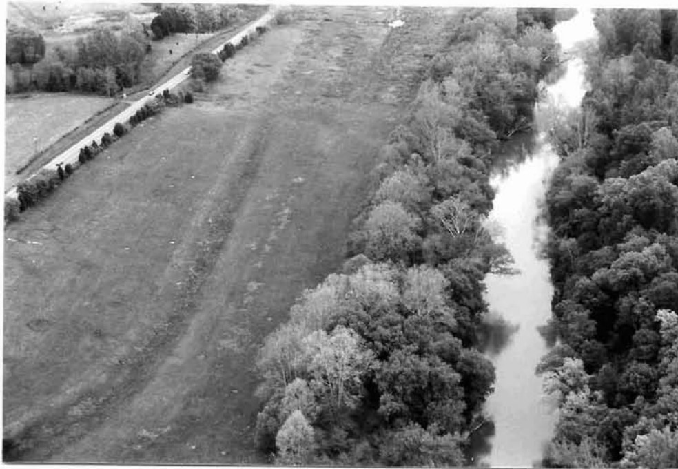
Figure 58 Rivanna Connection Trace (DHR 32-36) Land and Community Associates