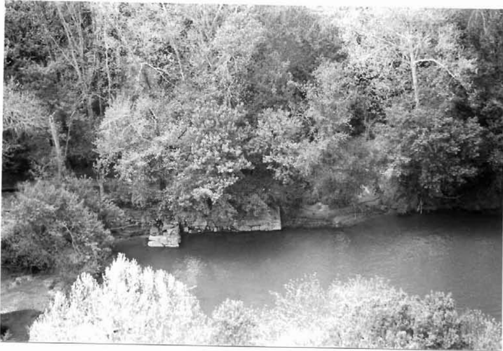
Figure 53 Carysbrook Lock and Dam (DHR 32-36) Land and Community Associates