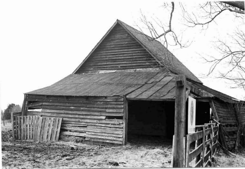
Figure 34 Gilnockie Farm, haybarn, (DHR 32-284) Lindsay Nolting