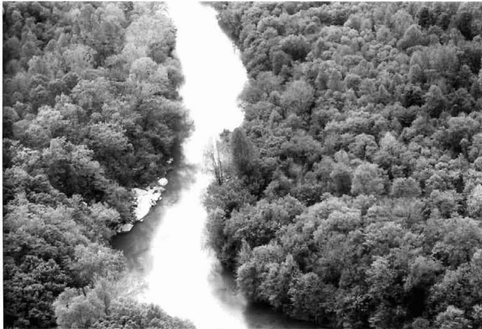
Figure 55 Quarry East of Hell's Bend (DHR 32-36) Land and Community Associates