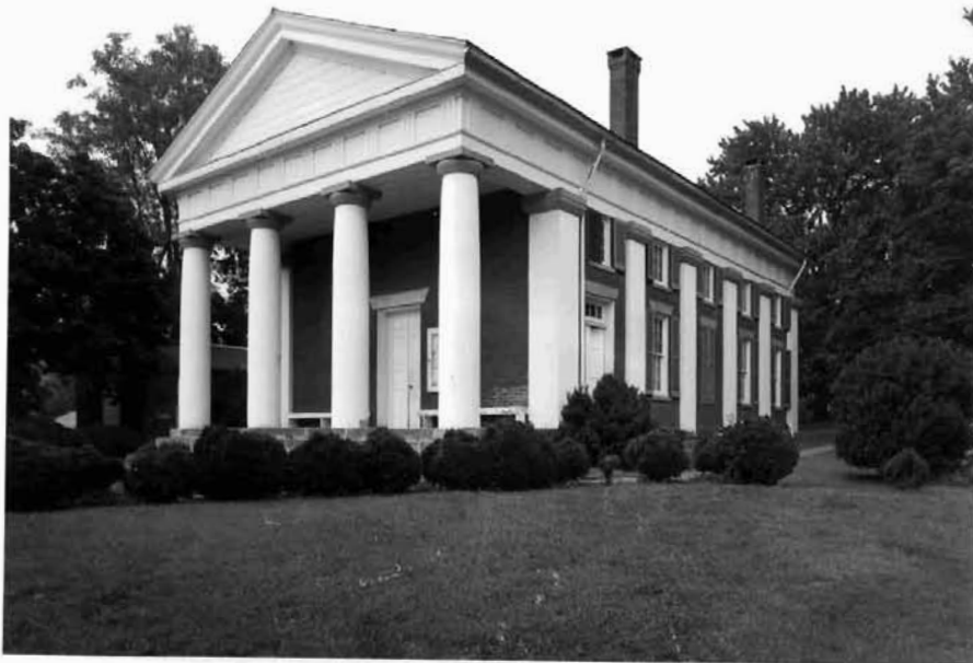
Figure 20 Fluvanna County Courthouse (DHR 32-13) Lindsay Nolting