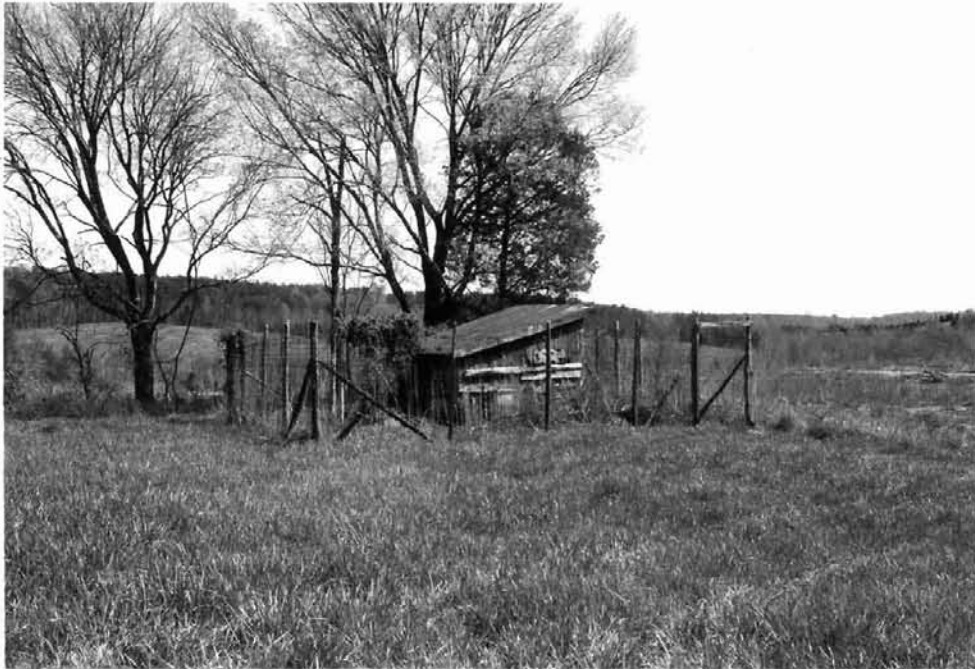
Figure 37 Spring Grove, (DHR 32-74) Land and Community Associates