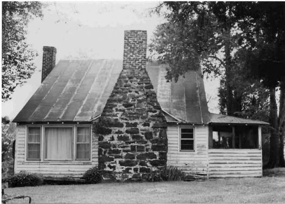
Figure 29 Weaver's Tavern (DHR 32-71) Lindsay Nolting