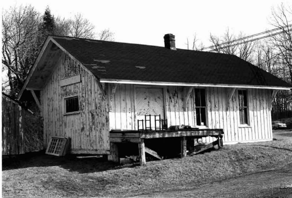
Figure 60 Cohasset Station (DHR 32-42) Lindsay Nolting