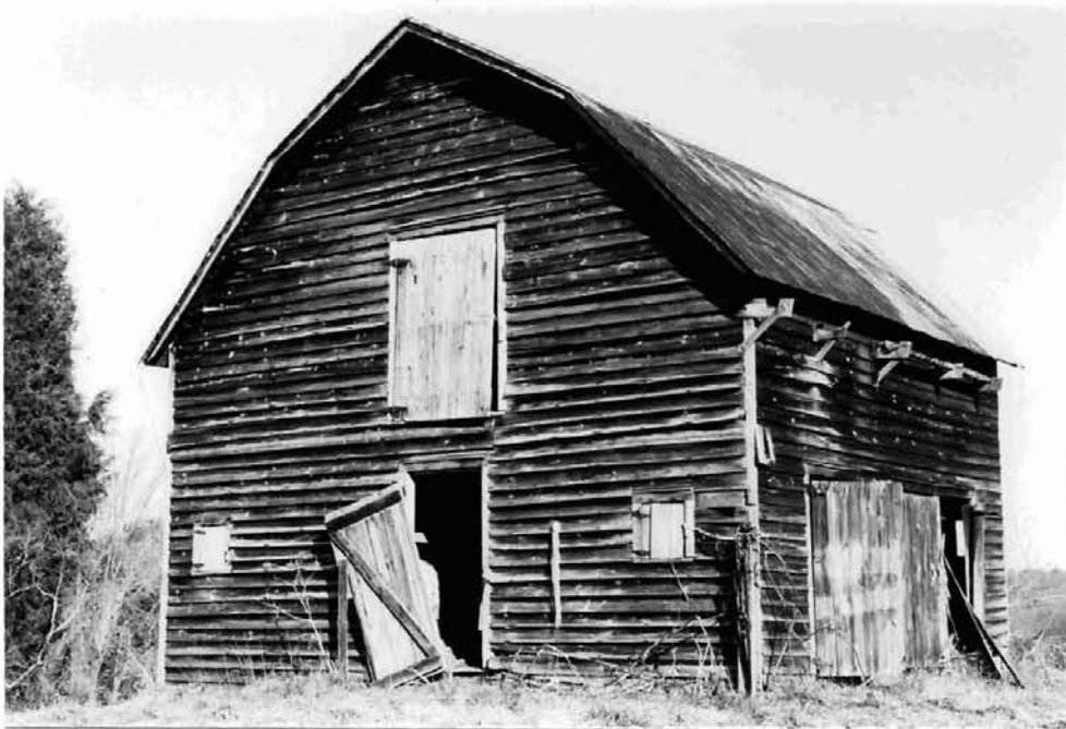
Figure 31 Bowles Farm, gambrel-roofed barn, (DHR 32-325) Lindsay Nolting