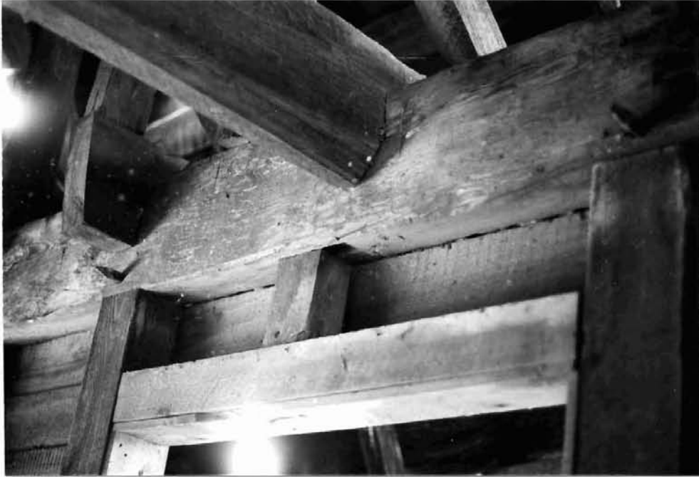
Figure 33 Redlands Barn, (DHR 32-245) Lindsay Nolting