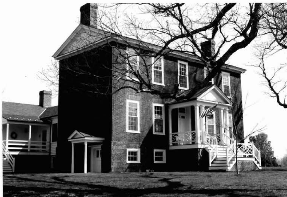
Figure 10 Melrose (DHR 32-19) Land and Community Associates