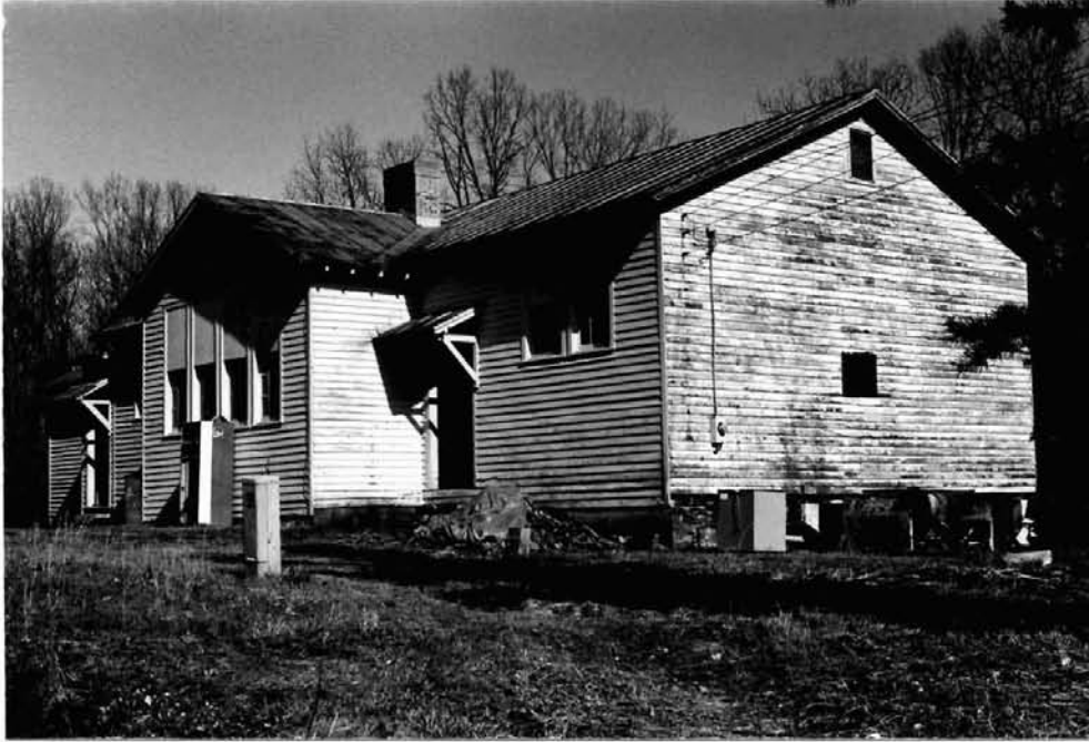
Figure 61 Dunbar School (DHR 32-290) Lindsay Nolting