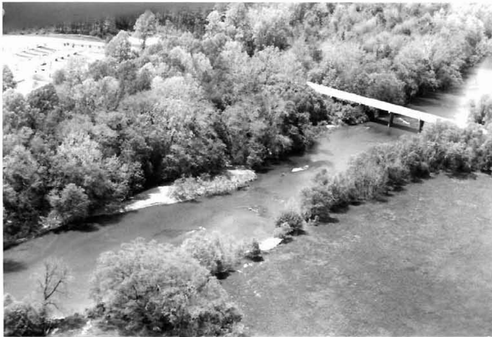
Figure 44 C.C. Cocke Low Level Bridges (DHR 32-36) Land and Community Associates