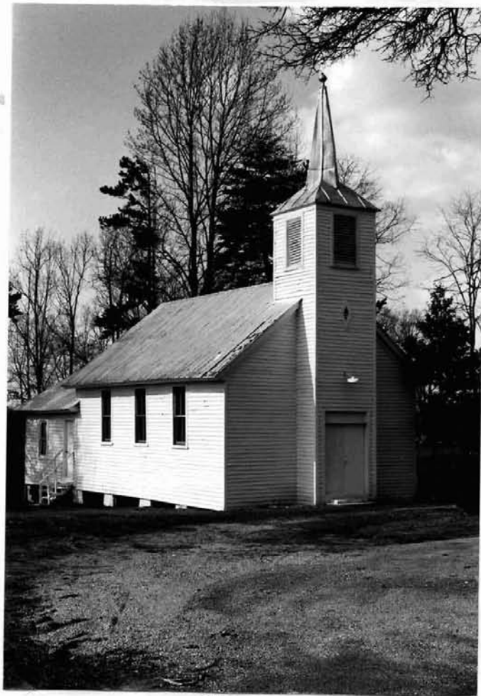
Figure 1 Holy and Sanctified Church (DHR 32-283) Lindsay Nolting