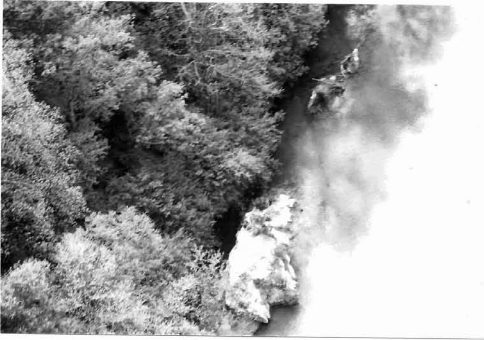
Figure 51 Strange's Lock and Dam (DHR 32-36) Land and Community Associates