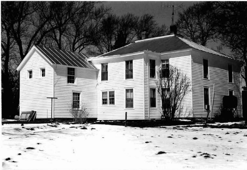
Figure 24 Modesto, (DHR 32-216) Lindsay Nolting