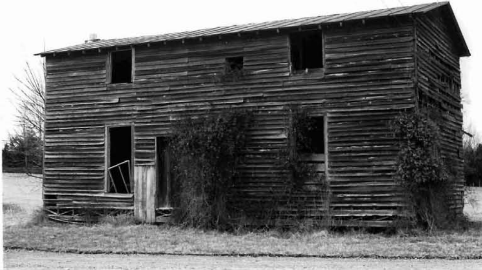
Figure 35 Halterman Farm, Hammermill/granary, (DHR 32-305) Lindsay Nolting