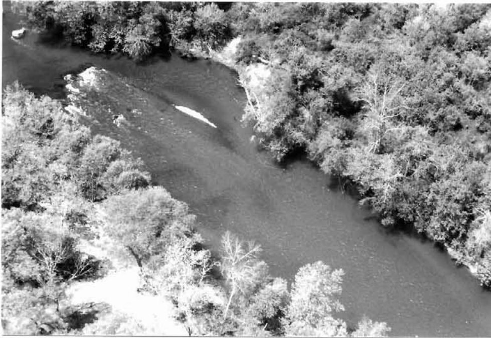
Figure 45 Bowles Rock Sluice (DHR 32-36) Land and Community Associates