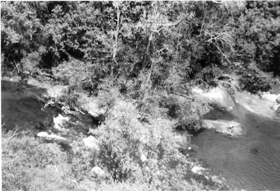
Figure 40 Bateau Canal, Union Mills (DHR 32-36) Land and Community Associates