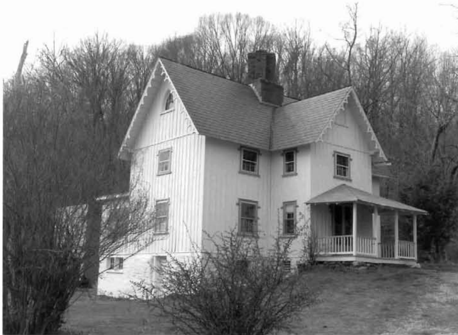
Figure 15 Cocke-Morris House (DHR 32-45) Land and Community Associates