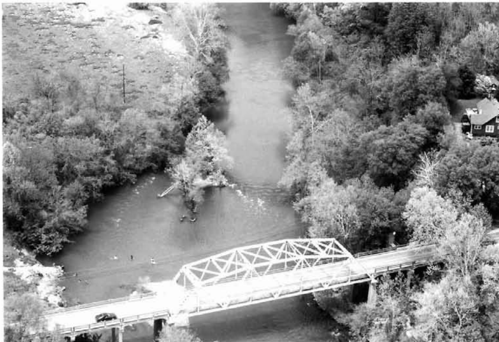
Figure 48 Palmyra Dam #1 & #2, Covered Bridge Piers (DHR 32-36) Land and Community Associates