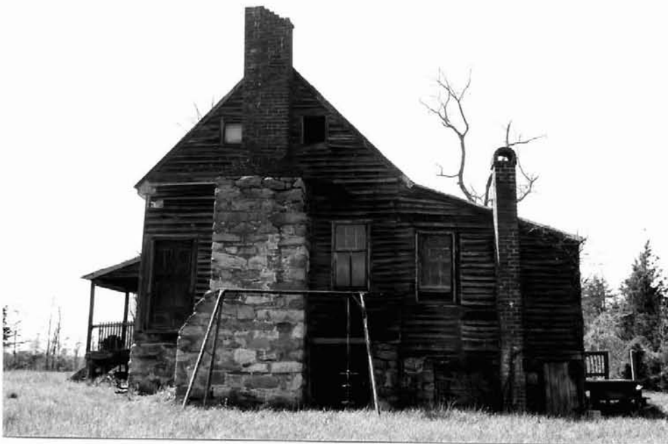
Figure 16 Spring Grove (DHR 32-74) Land and Community Associates