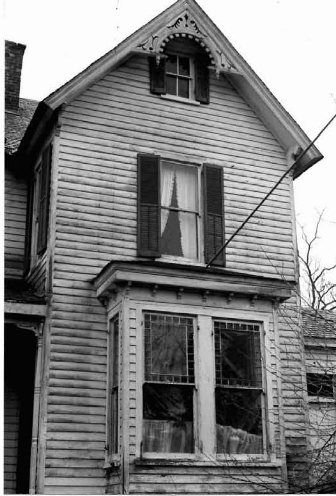
Figure 21 Ferncliff (DHR 32-296) Lindsay Nolting