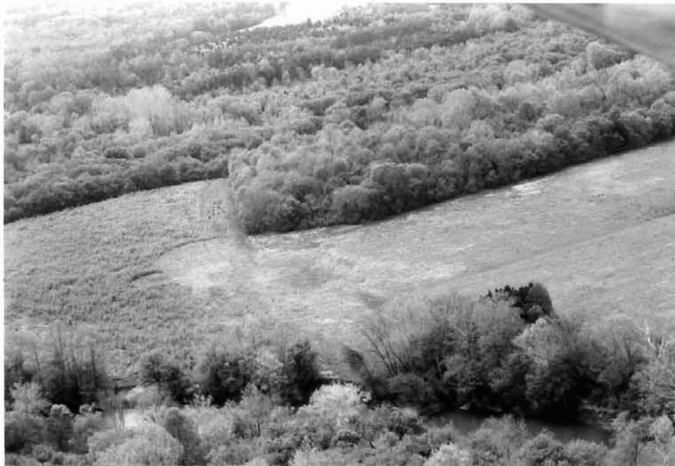
Figure 52 Canal Trace (DHR 32-36) Land and Community Associates