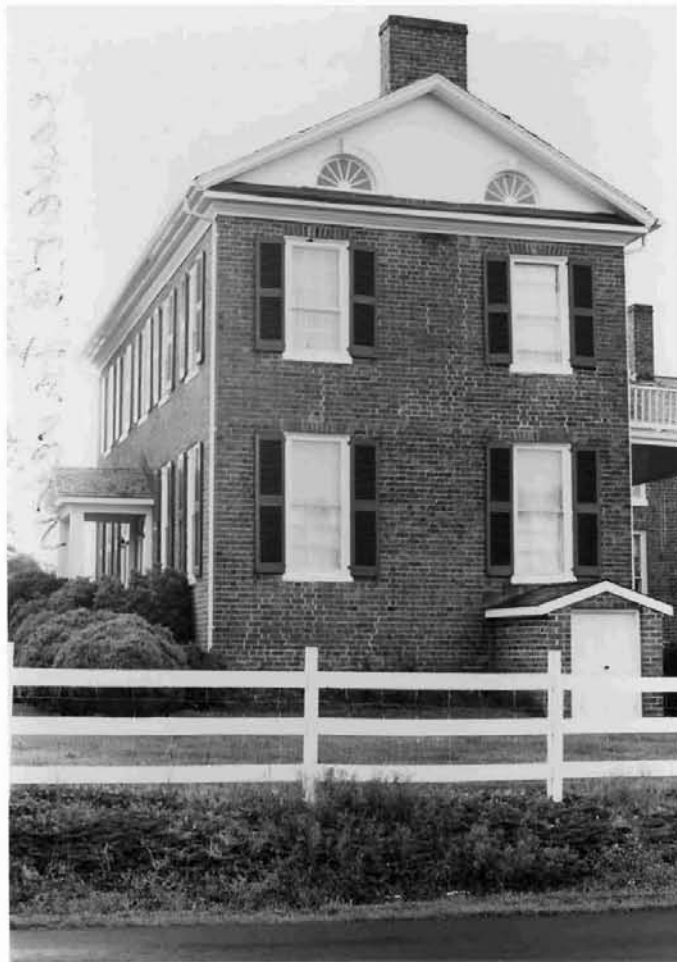
Figure 30 Currin's Tavern, entrance to basement taproom, (DHR 32-11) Lindsay Nolting