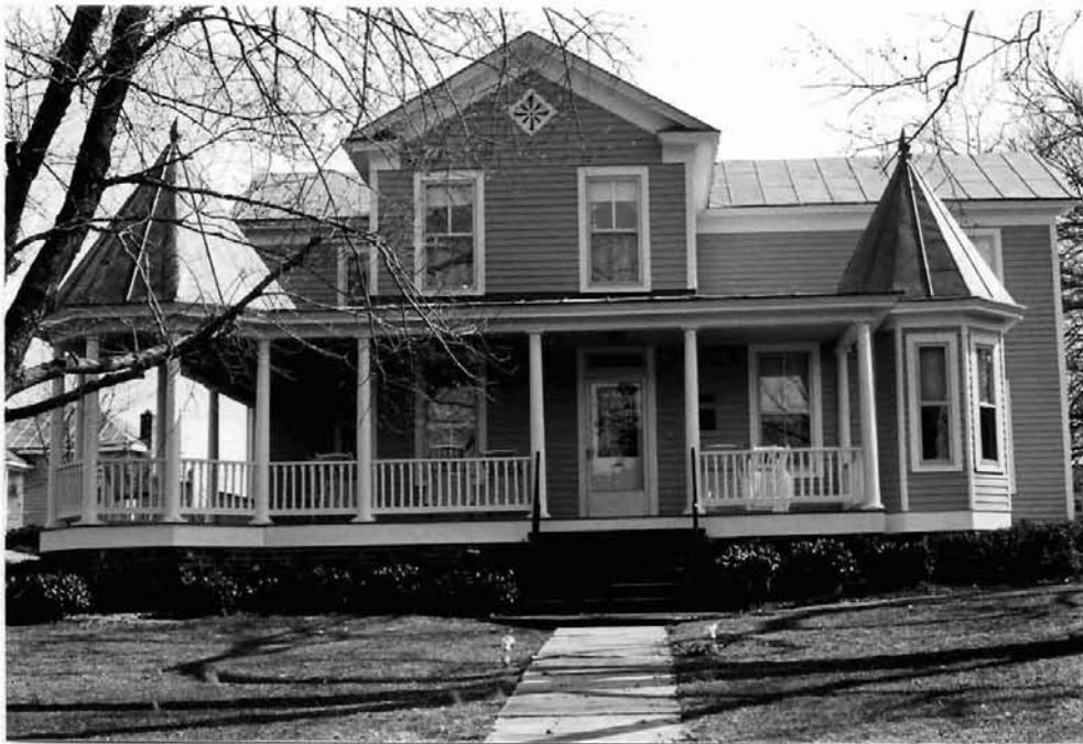
Figure 22 Alumni House, Fork Union Military Academy, (DHR 32-292) Lindsay Nolting