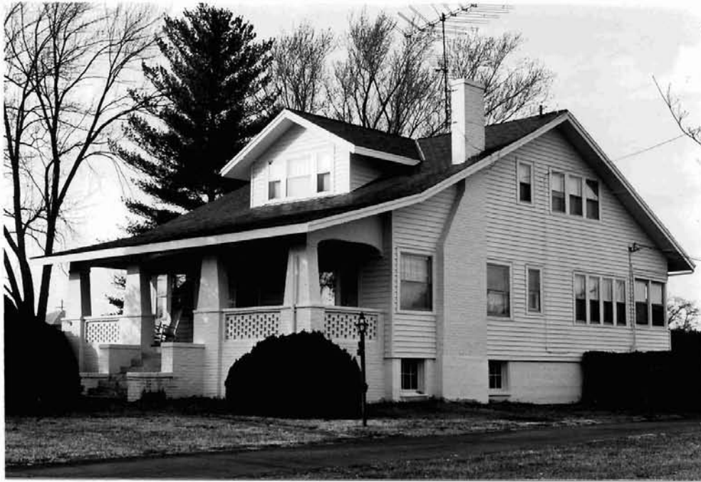
Figure 23 Cohasset Stationmaster's House, (DHR 32-316) Lindsay Nolting