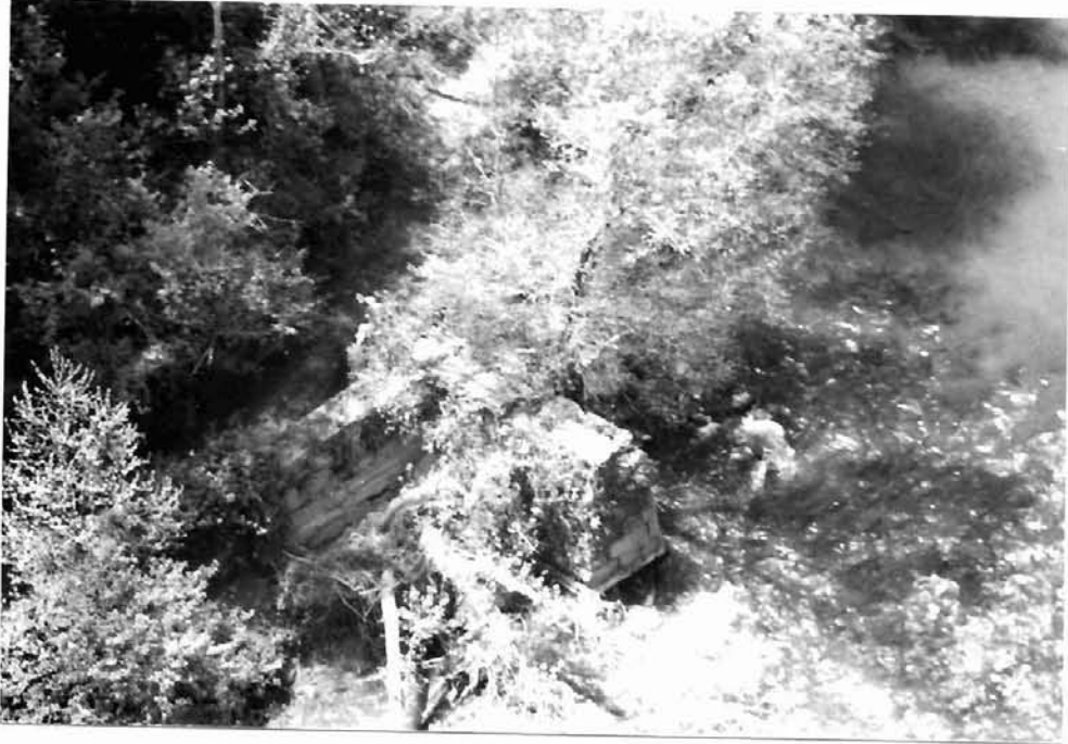
Figure 41 Stone Wall, Union Mills (DHR 32-36) Land and Community Associates