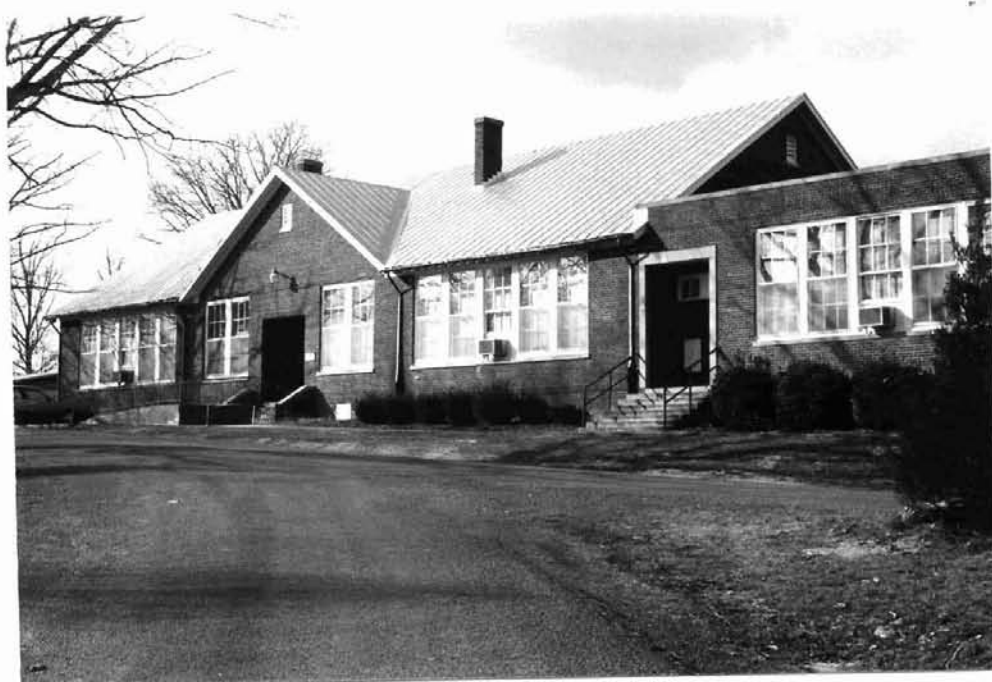
Figure 4 S.C. Abrams High School (DHR 32-319) Lindsay Nolting