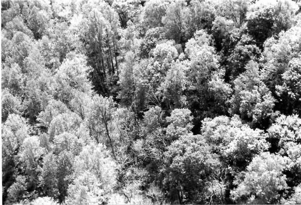
Figure 43 Union Mills Canal (DHR 32-36) Land and Community Associates