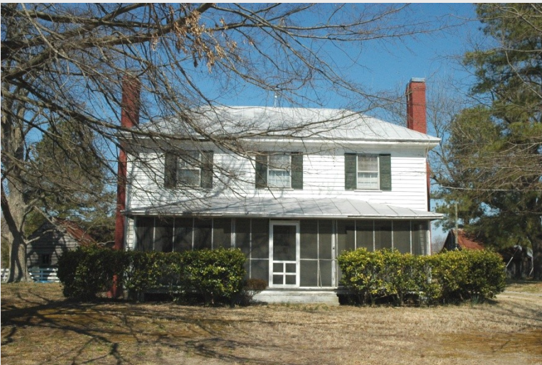
Edwards House (046-5209)