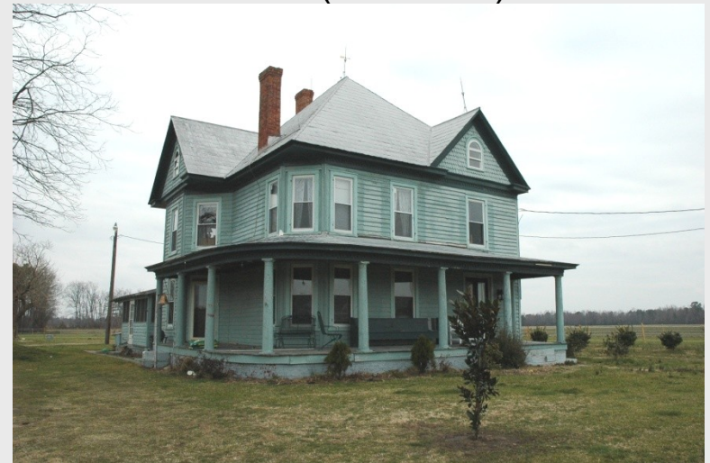
House, Spivey Town Road (046-5194)