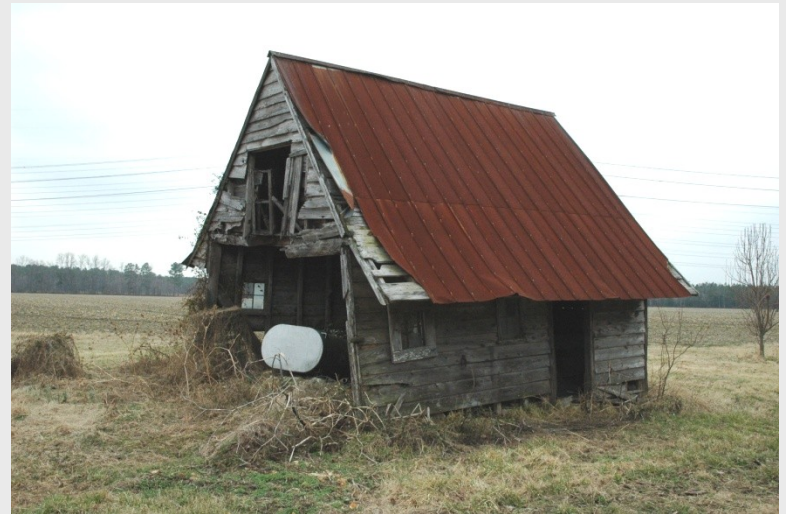
Servants/Slave Quarters at William M. Crocker House (046-5161)