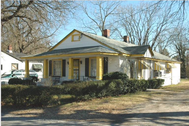
House, Washington Avenue (046-5124)