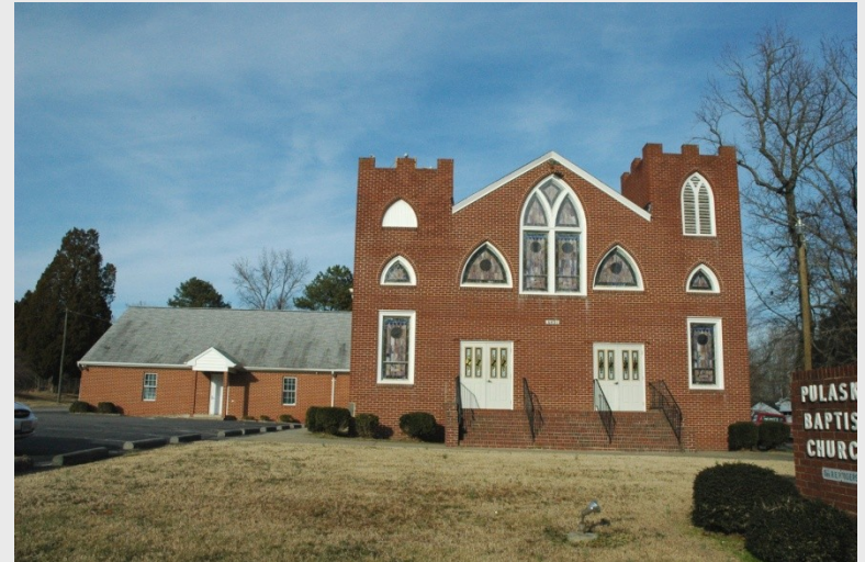
Pulaski Baptist Church (046-5125)