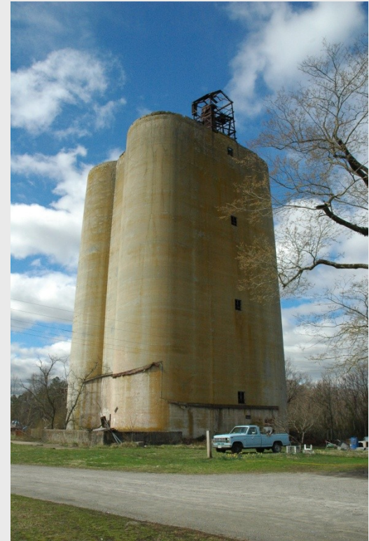
Silo, Silo Lane in Zuni (046-5218)