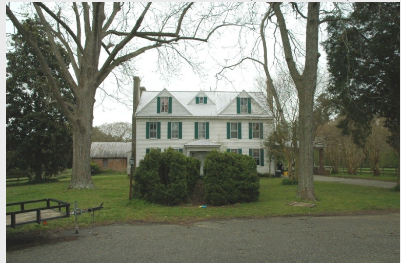
Pitt-Blackwell-Turner House (046-5238)