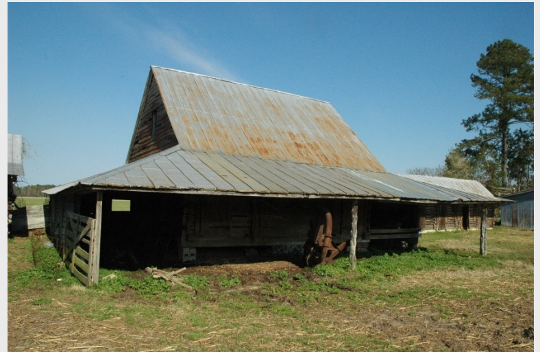
Hay Barn at Strawberry Plains (046-5233)