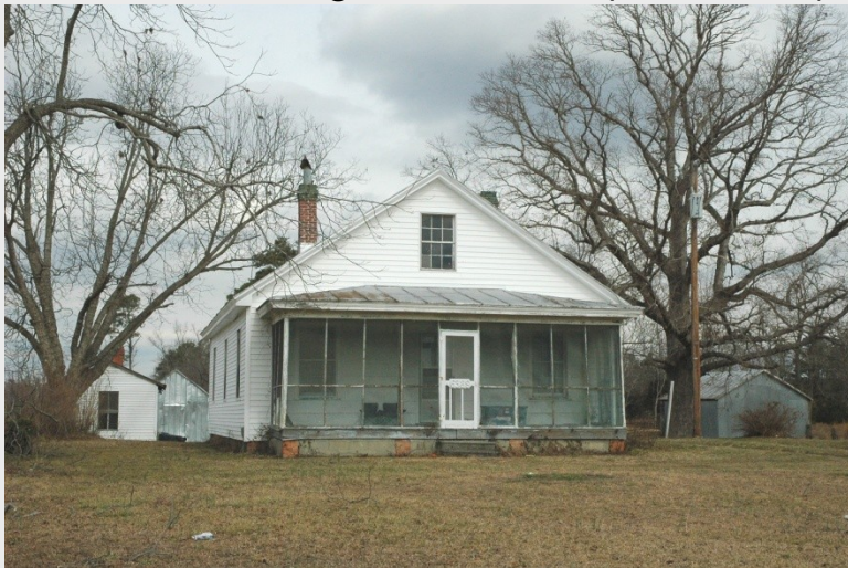
Farmhouse, Barlow Lane (046-5141)