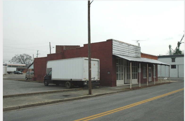
Store, West N&W Street, Town of Windsor (328-5002)