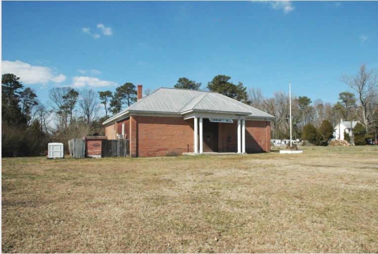
Rescue School (046-5176)