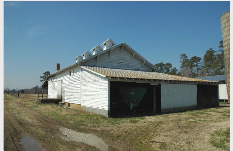
Potato House at Julius Caesar Darden House (046-5188)