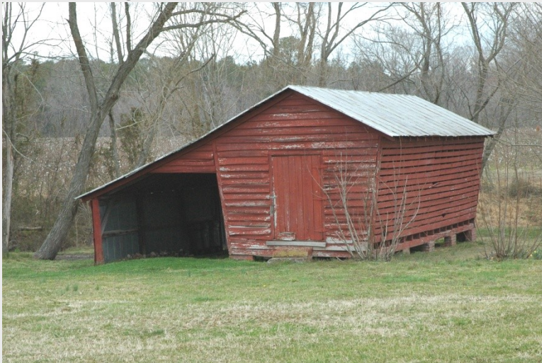
Corncrib at Latimer House (046-5162)