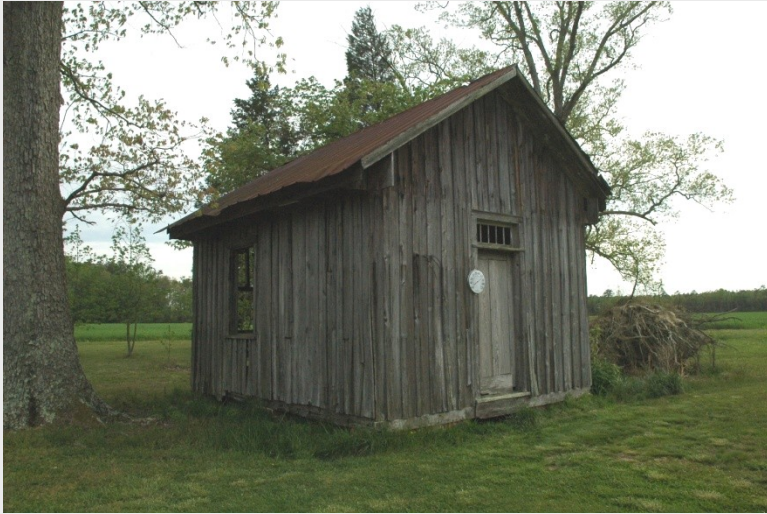
School at Young House (046-5243)