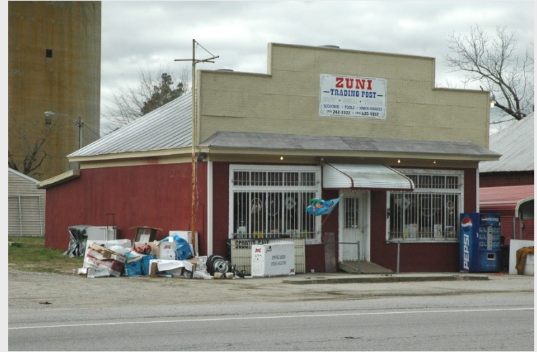
Store, Windsor Boulevard (046-5222)