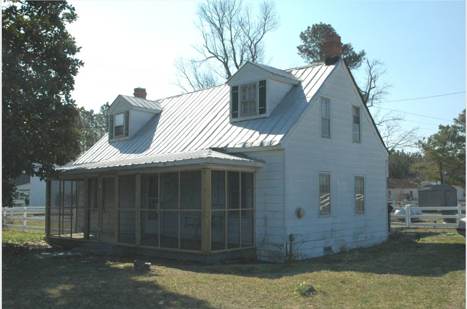
Long Nancy Tynes House (046-5210)