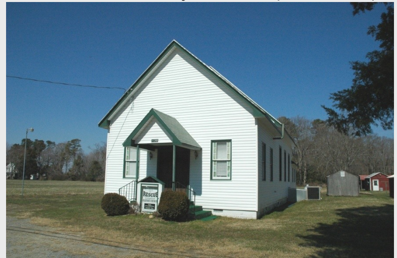
Friends Church (046-5182)