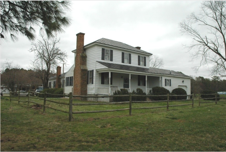
Henry Pruden House (046-5229)