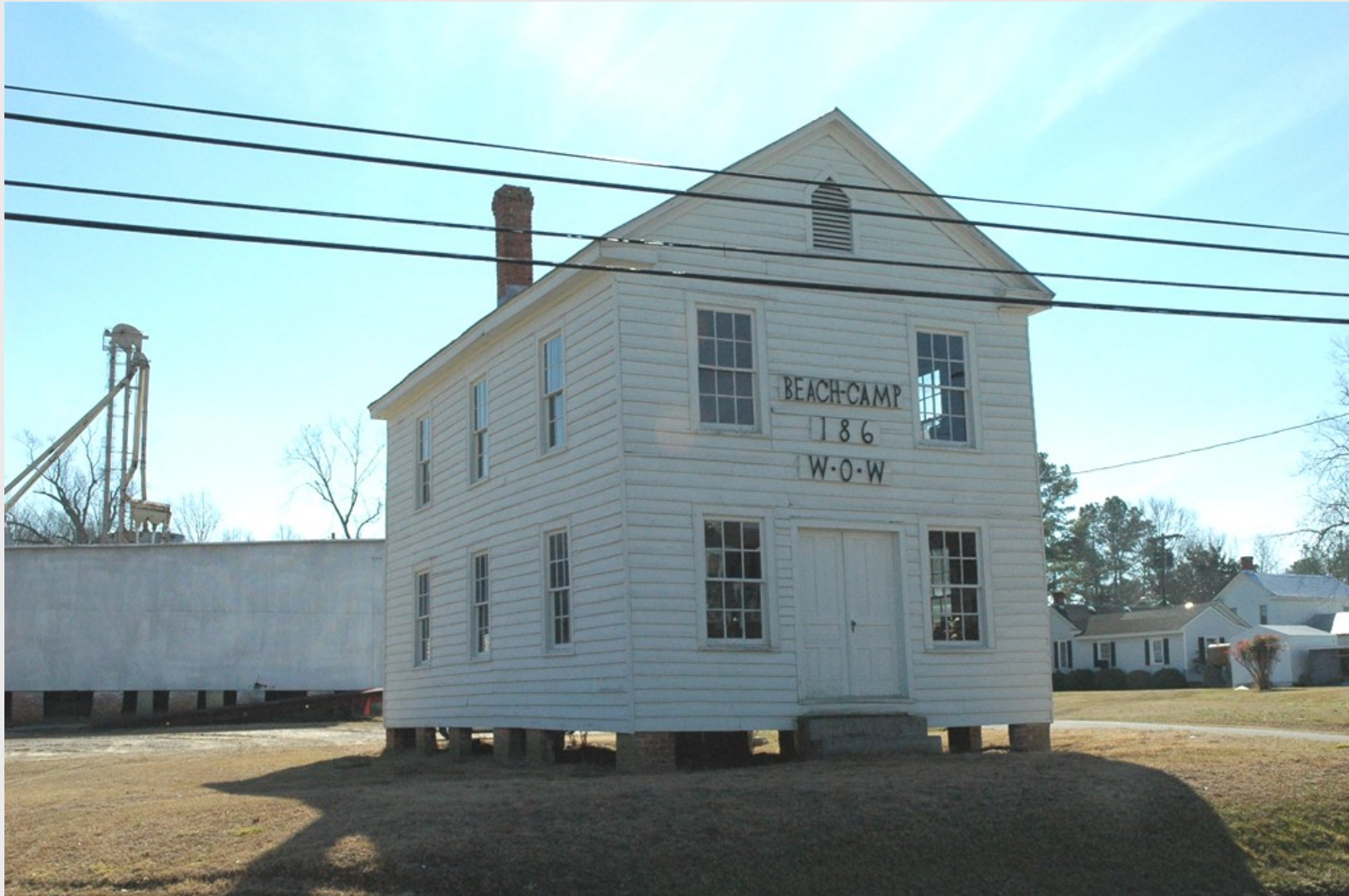
Walters Farmers Union (046-5119)