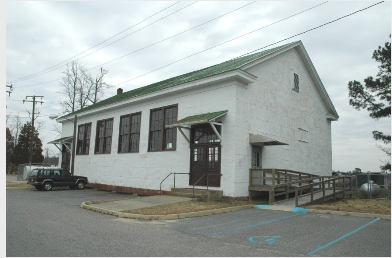
Carrsville Elementary School Gymnasium (046-5200)