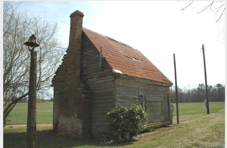
Kitchen at Farmhouse, Stallings Lane (046-5187)