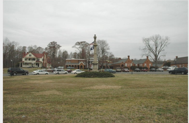
Courthouse Complex Historic District (046-0005)