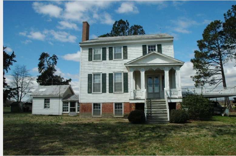
Farmhouse, Ducktown Road (046-5223)