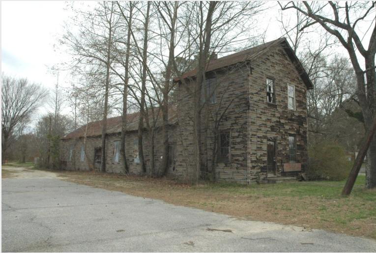
Happy Days Soap Factory (046-5221)