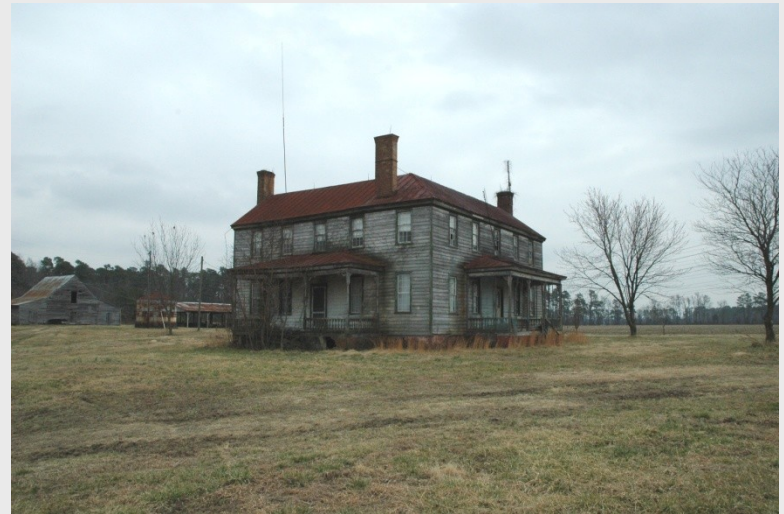
William M. Crocker House (046-5161)