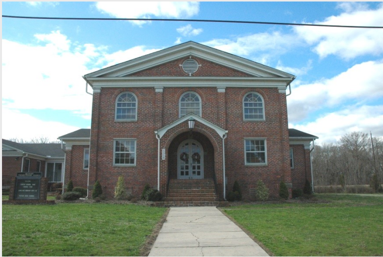
Bethany Presbyterian Church (046-5216)