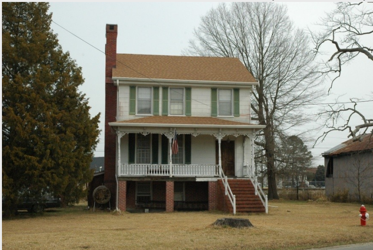
Ashburn House (328-5004)