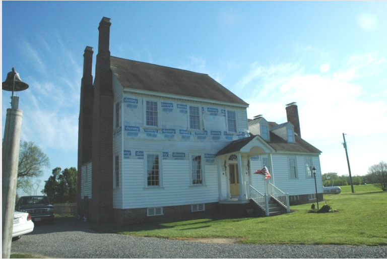
Gray Carroll House (046-0064)