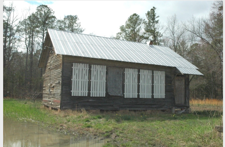
Trinity School (046-5230)