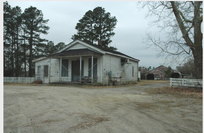
C. T. Chapman Store (046-5157)