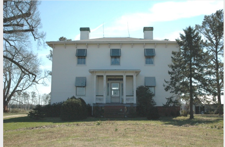
Randolph House (046-5206)