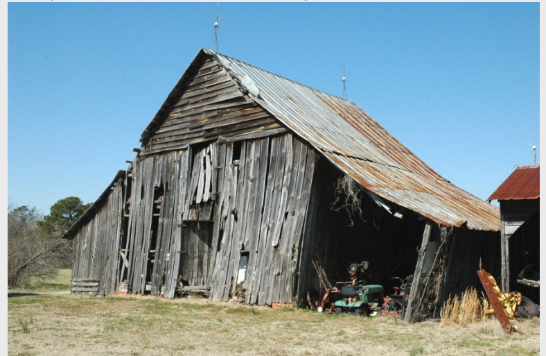
Barn at Edwards House (046-5209)