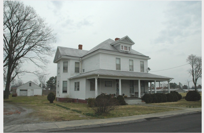
House, East N&W Street, Town of Windsor (328-5006)