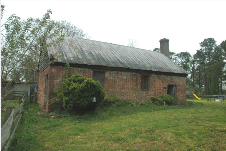
Customs House (046-0087)