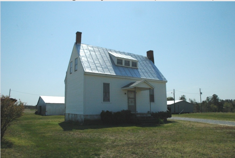
William Gray House (046-5234)