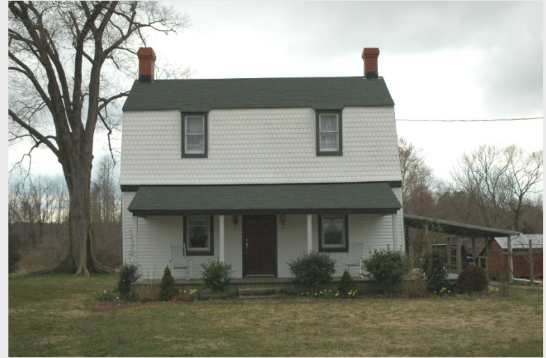
Latimer House (046-5162)