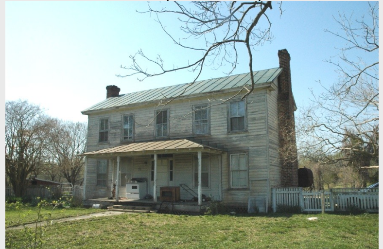
Strawberry Plains (046-5233)