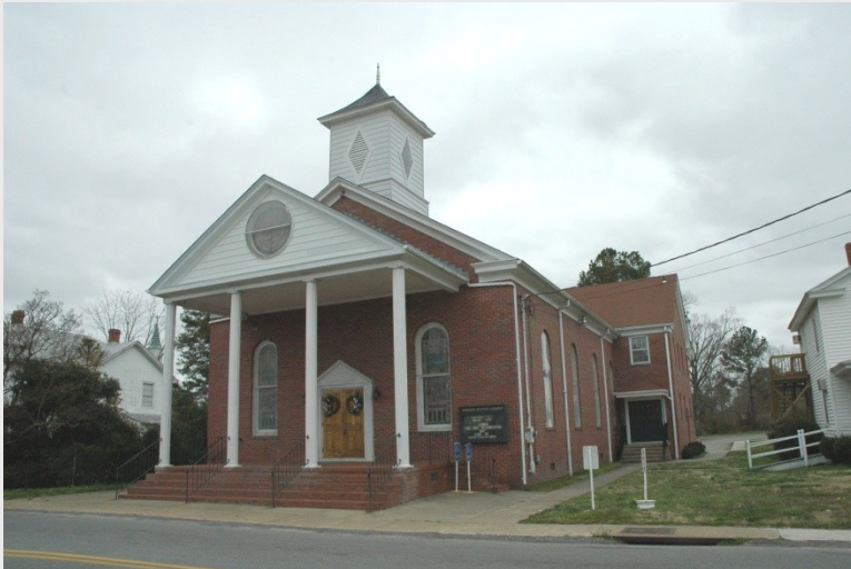
Windsor Baptist Church (328-5008)