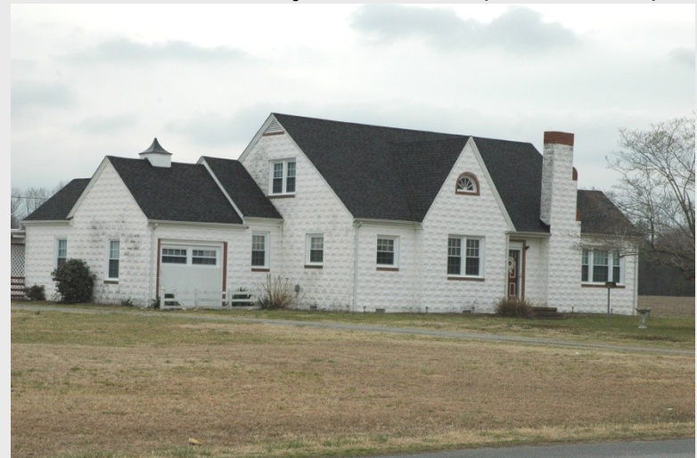
House, Spivey Town Road (046-5225)