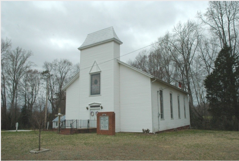
Uzzell United Methodist Church (046-5228)