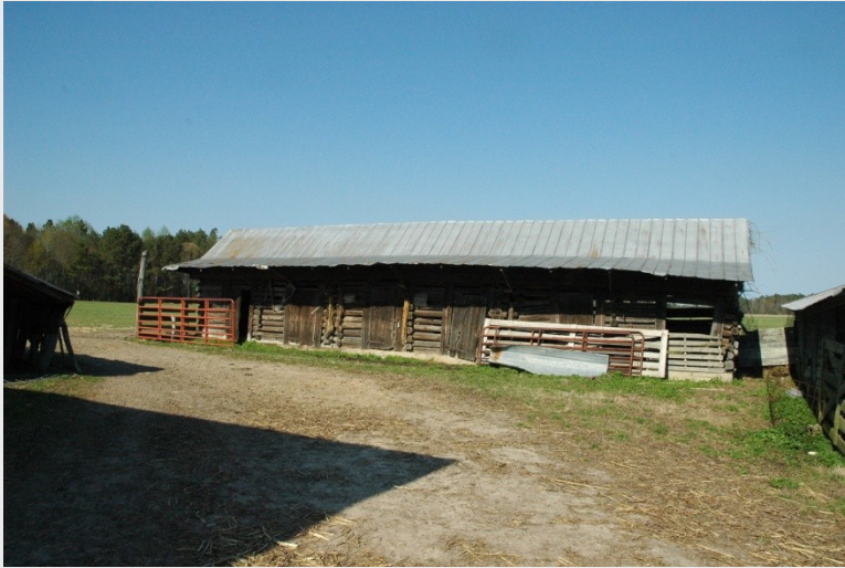
Animal Pens at Strawberry Plains (046-5233)