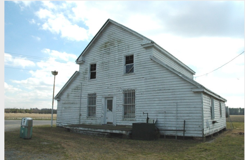
Store, Mill Swamp Road and Sycamore Cross Drive (046-5149)