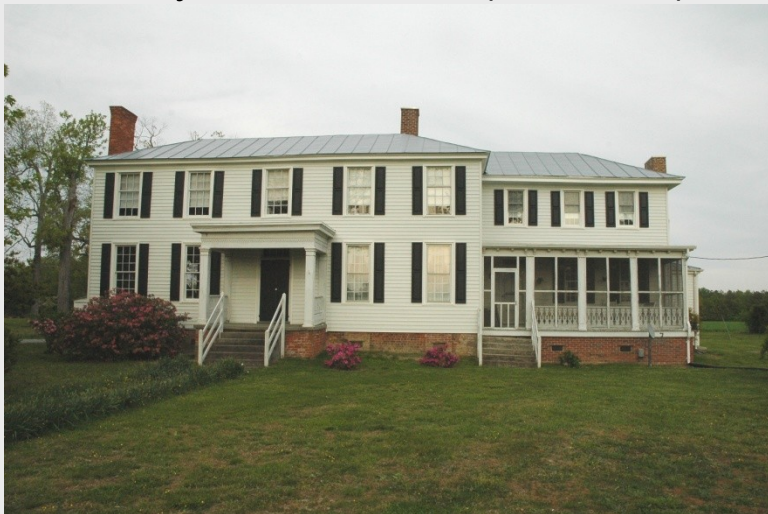
Young House (046-5243)