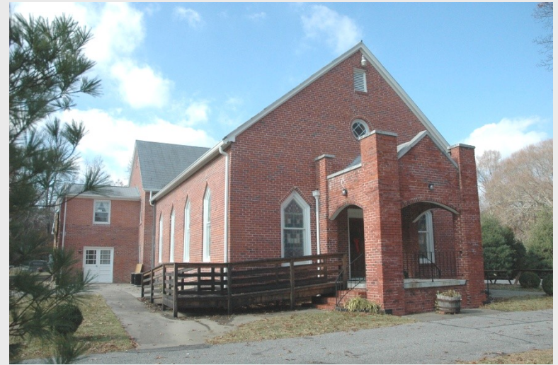
Benns Church (046-5246)