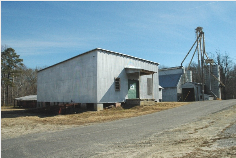
Indika Farms—Walters Buying Plant (046-5120)