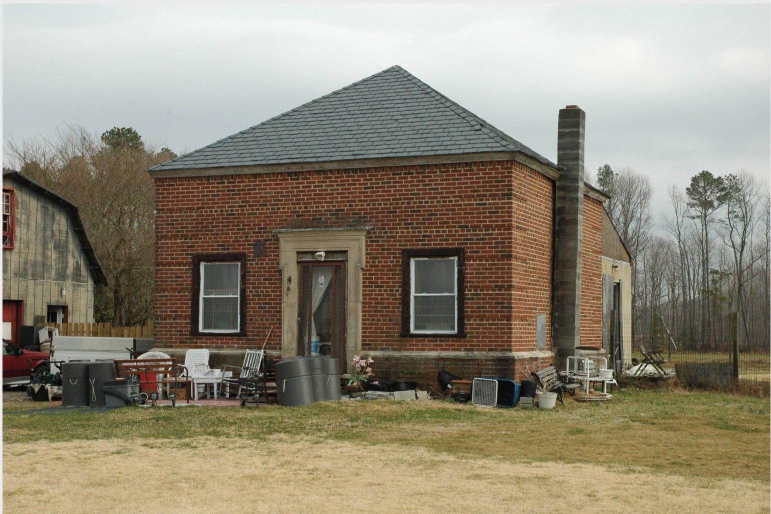
American Telephone and Telegraph Building (046-5164)