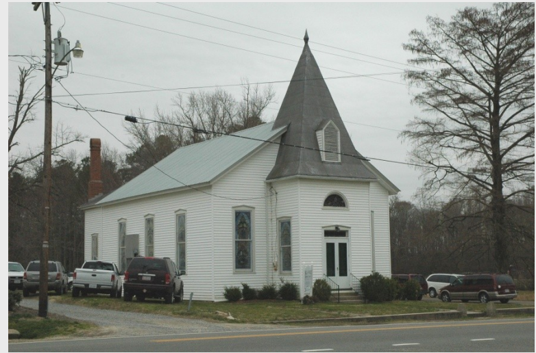
Isle of Wight Christian Church (046-5212)