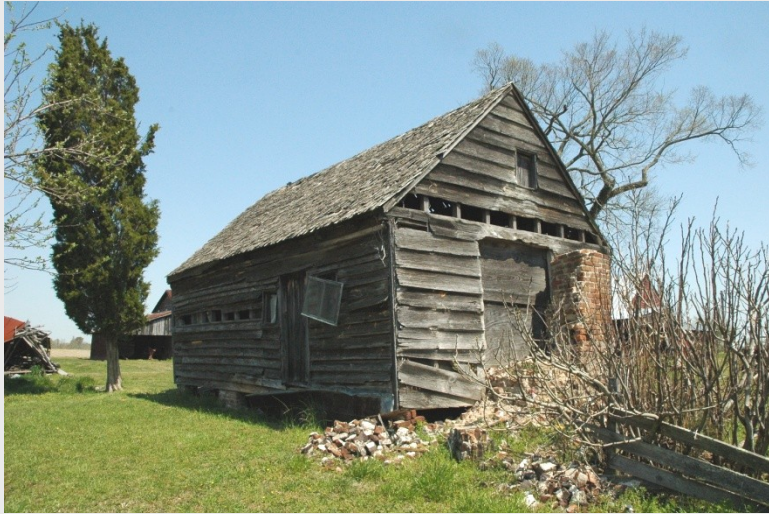
Slave Quarters at Farmhouse, Whispering Pines Trail (046-5237)