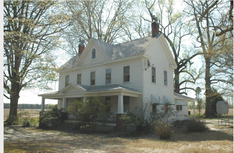
Farmhouse, Raynor Road (046-5235)