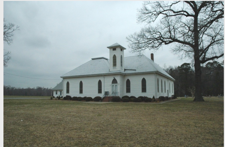
Woodland United Methodist Church (046-5158)