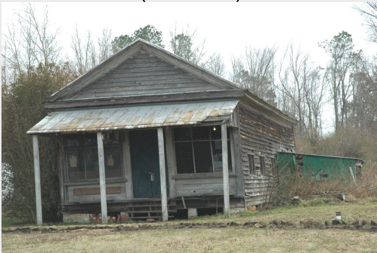
Daughtrey's Store (046-5131)