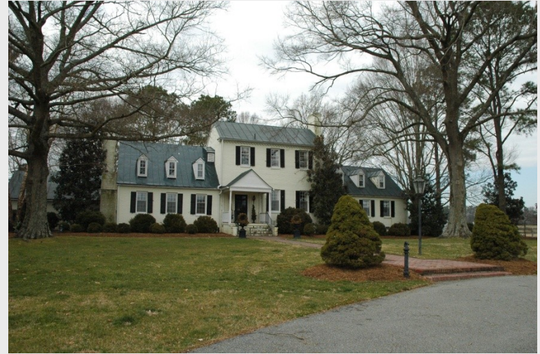
Jacob H. Duck House (046-5201)