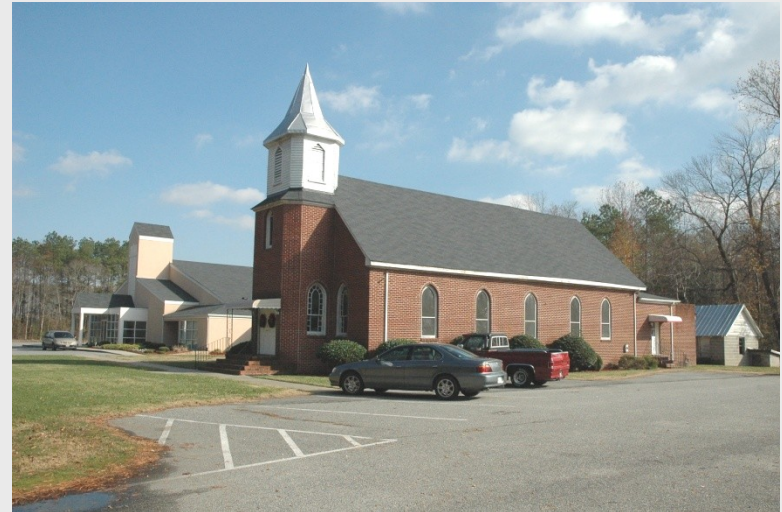
Christian Home Baptist Church (046-5247)