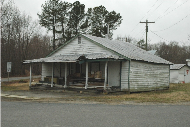
Store, Intersection Mill Swamp Road and Moonlight Road (046-5144)