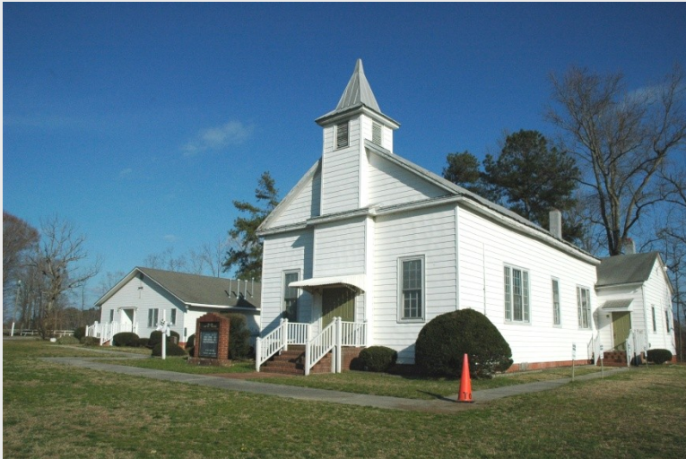
Shiloh Baptist Church (046-5232)