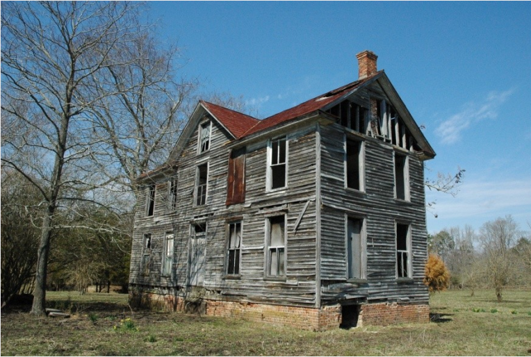
Farmhouse, Scotts Factory Drive (046-5185)