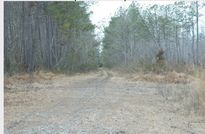
Virginian Railroad Bed (046-5163)