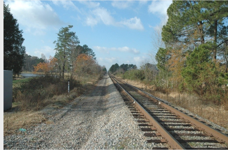
Seaboard and Roanoke Railroad (046-5254)