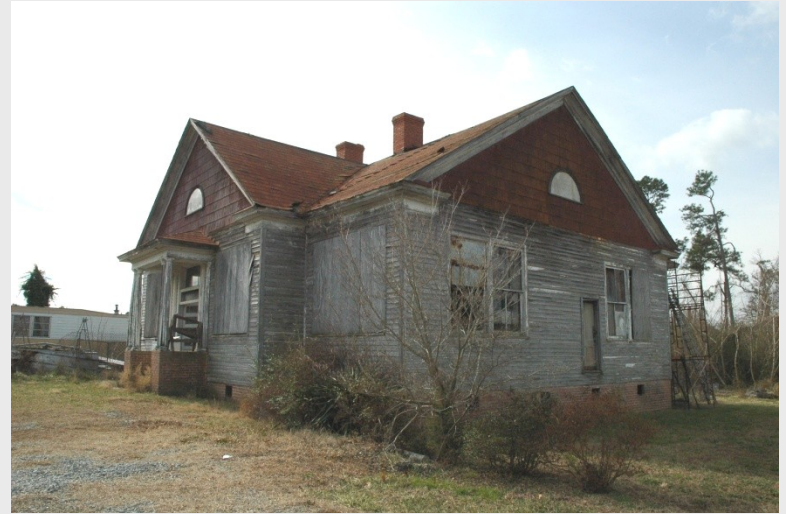
Bay View School (046-5138)