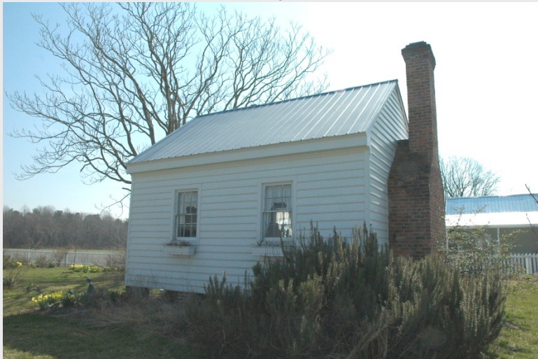
Kitchen at J. C. Darden House (046-5188)