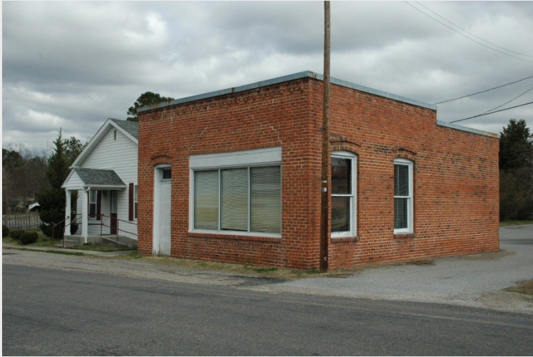
Bank, Zuni Circle (046-5219)