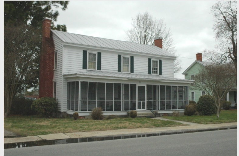
House, Church Street, Town of Windsor (328-5007)