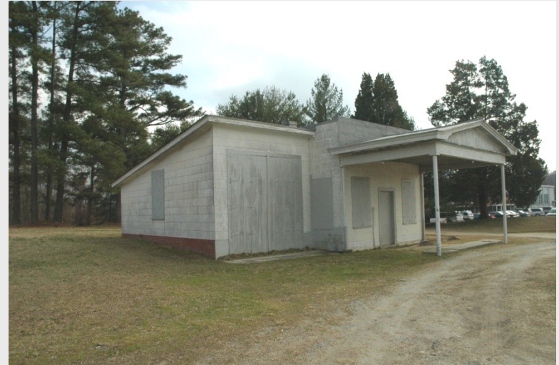
Store, Courthouse Highway (046-5166)