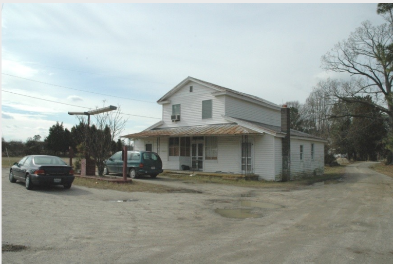
Store, Old Stage Highway (046-5137)