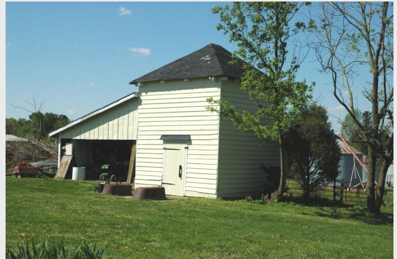
Smokehouse at Homestead (046-5239)