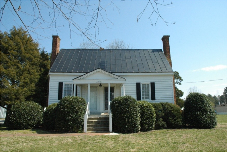
Mills-Daughtrey House (046-0014)