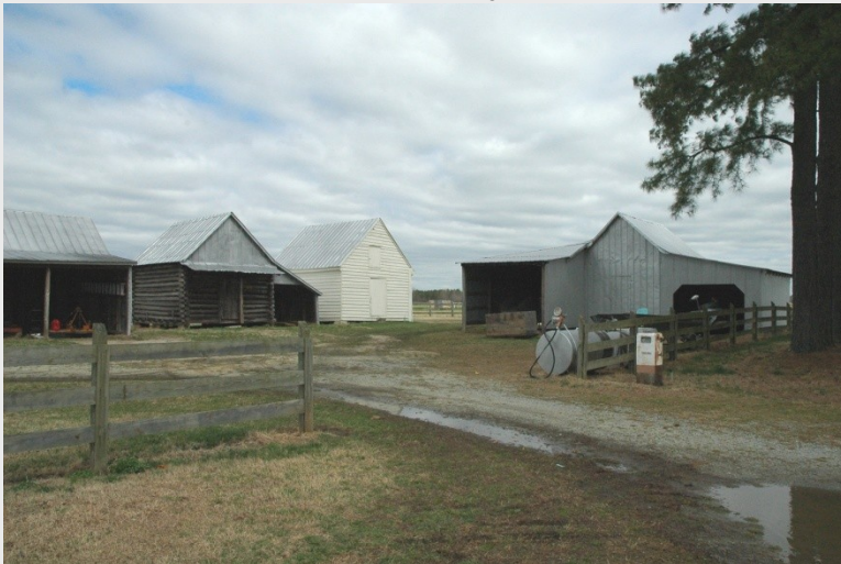
Agricultural Outbuildings at the Farmhouse, Bows and Arrows Road (046-5224)