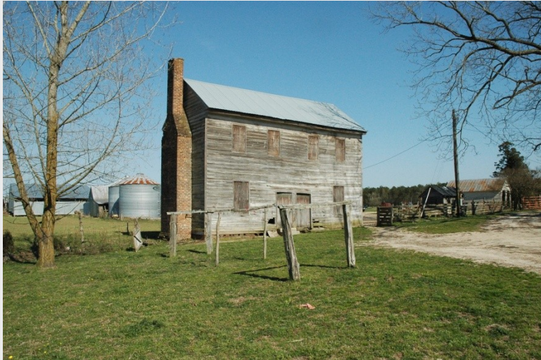
Kitchen at Strawberry Plains (046-5233)