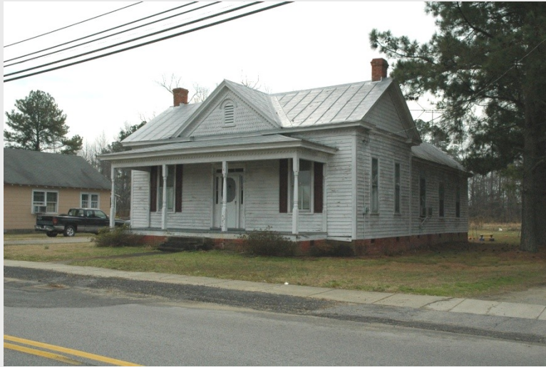
House, Bank Street, Town of Windsor (328-5003)