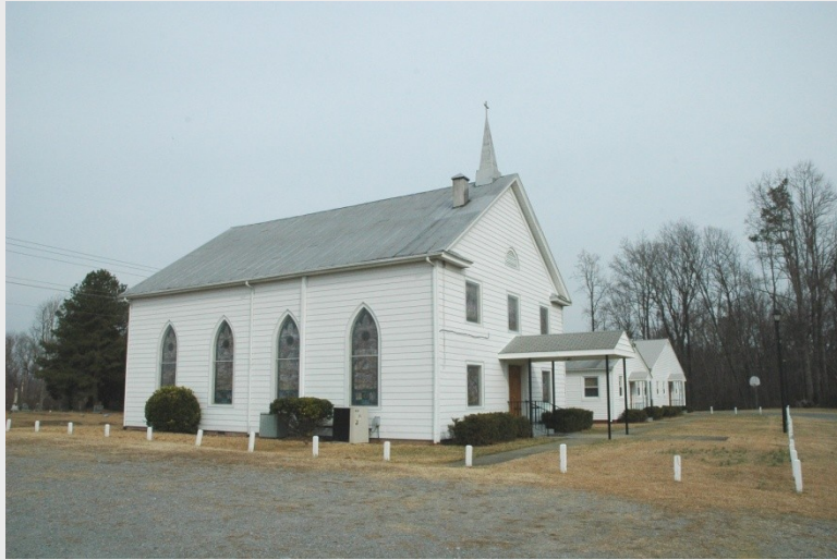
Antioch Independent Church (046-5154)