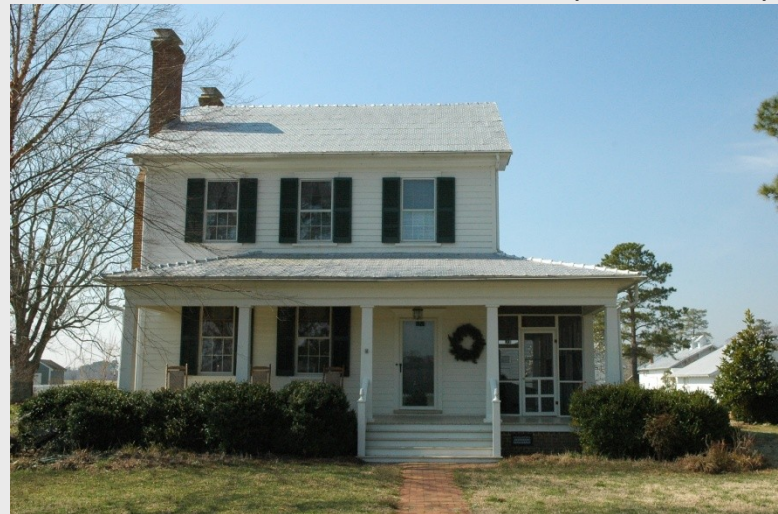
Julius Cesar Darden House (046-5188)