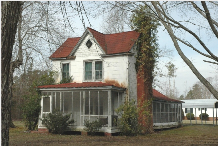
House, Tyler's Beach Road (046-5136)