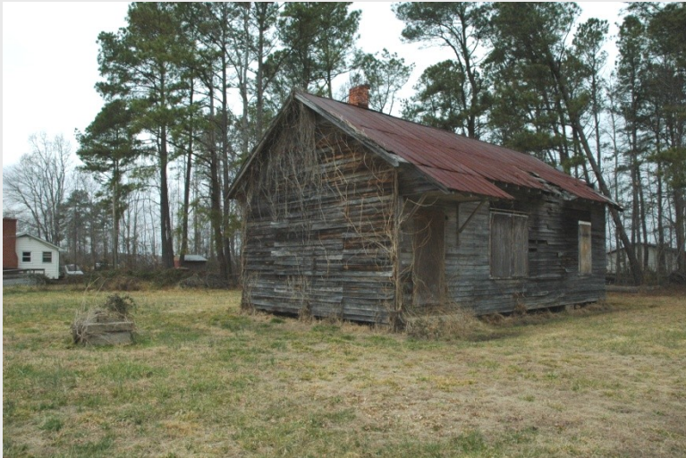
Holly Grove School (046-5156)