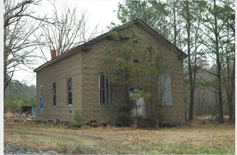
Christian Bethany Church (046-5159)