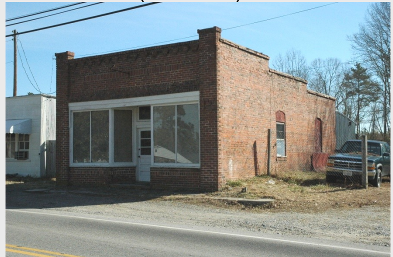
Store, Walters Highway (046-5123)