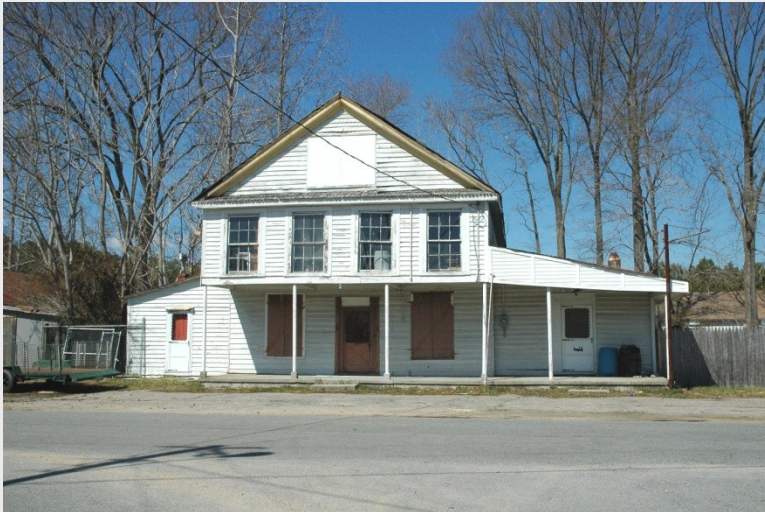
Store, Reynolds Drive (046-5172)