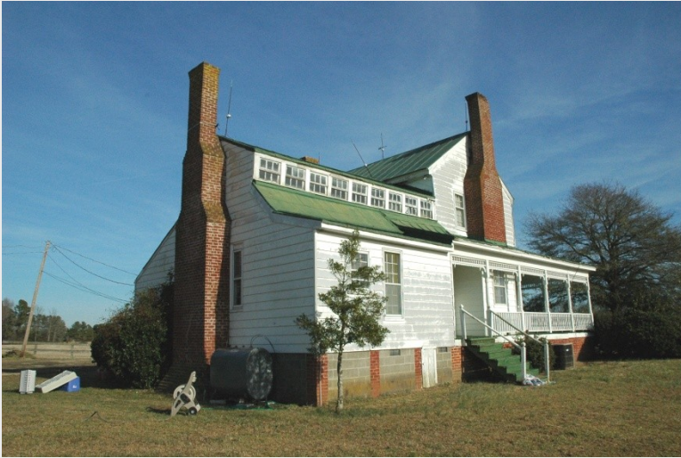
Butler House near Carrsville (046-5127)