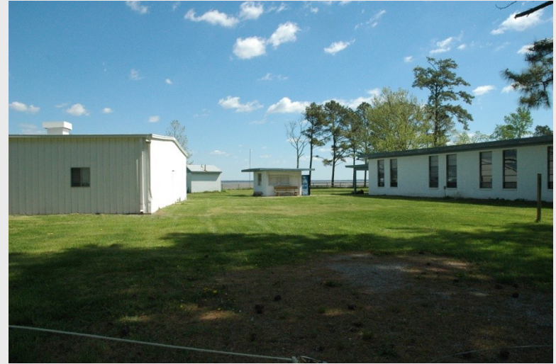
Morgart's Beach Hotel Site, FFA FHA Camp Association (046-5241)