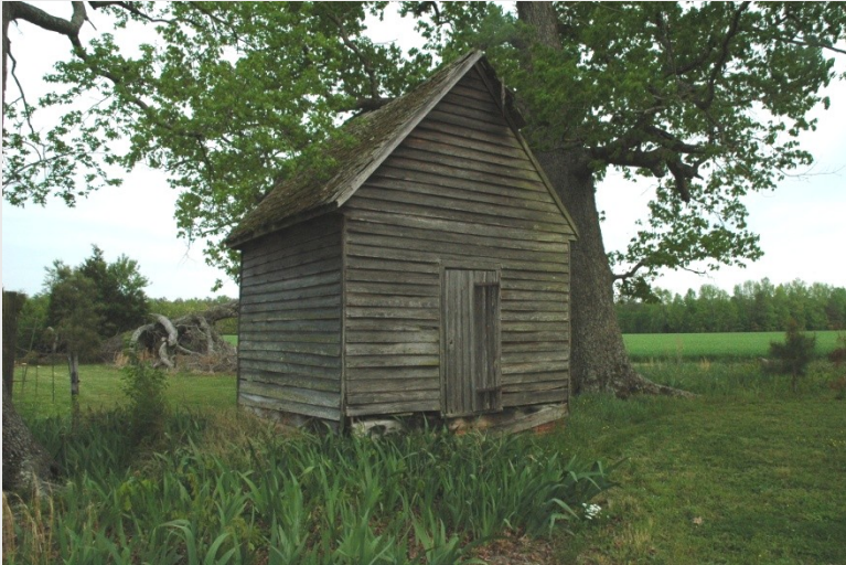
Smokehouse at the Young House (046-5243)