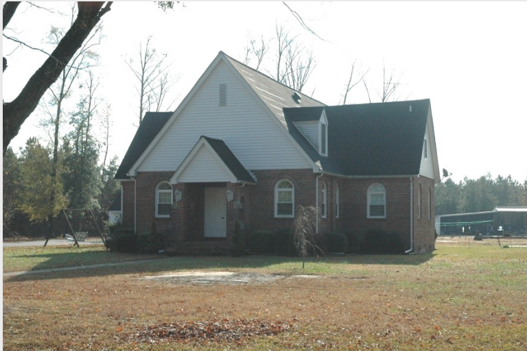
Boaz Presbyterian Church (046-5249)