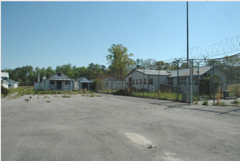
Walters Prison Camp (046-5242)