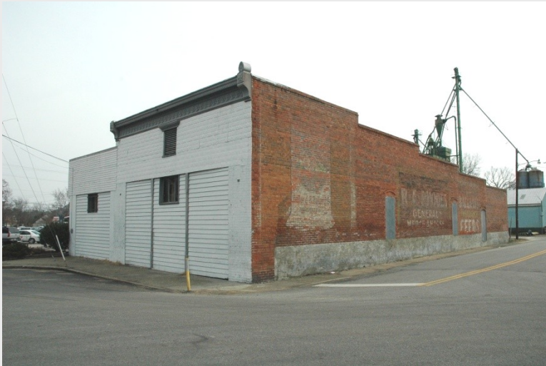
Store, East N&W Street, Town of Windsor (328-5001)