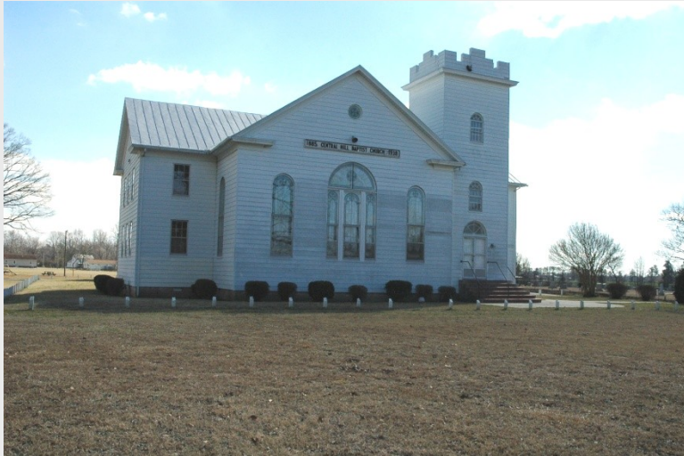
Central Hill Baptist Church (046-5153)