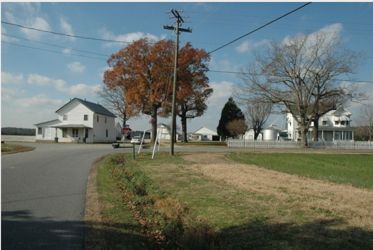
Oliver Store and Farm (046-5239)