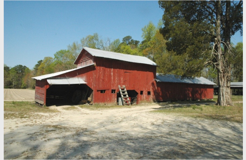
Barn at Farmhouse, Raynor Road (046-5235)