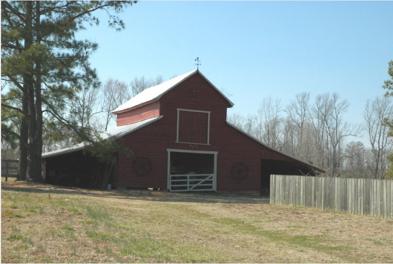
Barn at Vaughan House at Carrsville (046-5203)