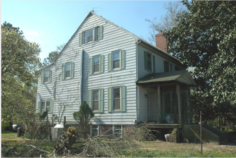
Marshall Edwards House (046-5236)