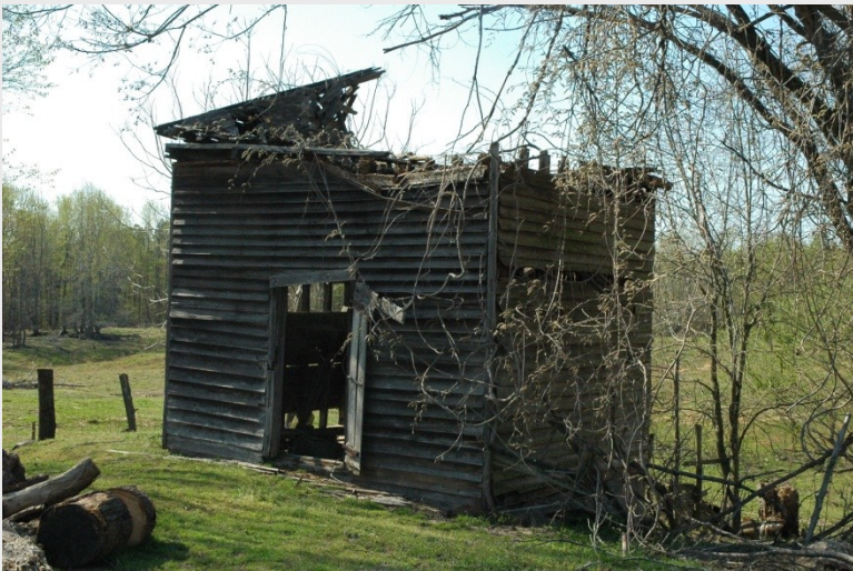
Smokehouse at Strawberry Plains (046-5233)