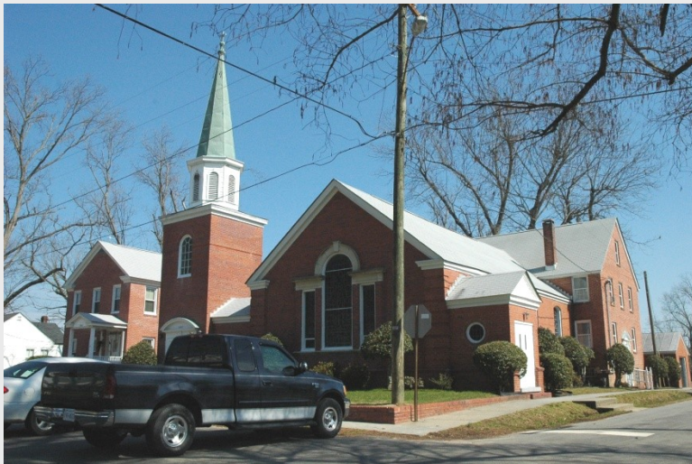
Battery Park Baptist Church (046-5183)