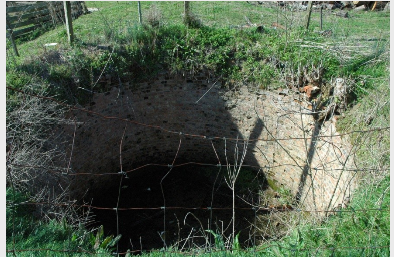
Icehouse at Strawberry Plains (046-5233)