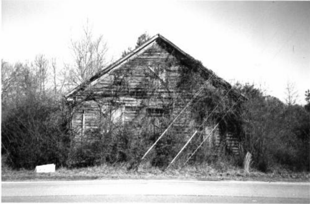
Figure 3.11: Menzel's Fish House (047-5256)