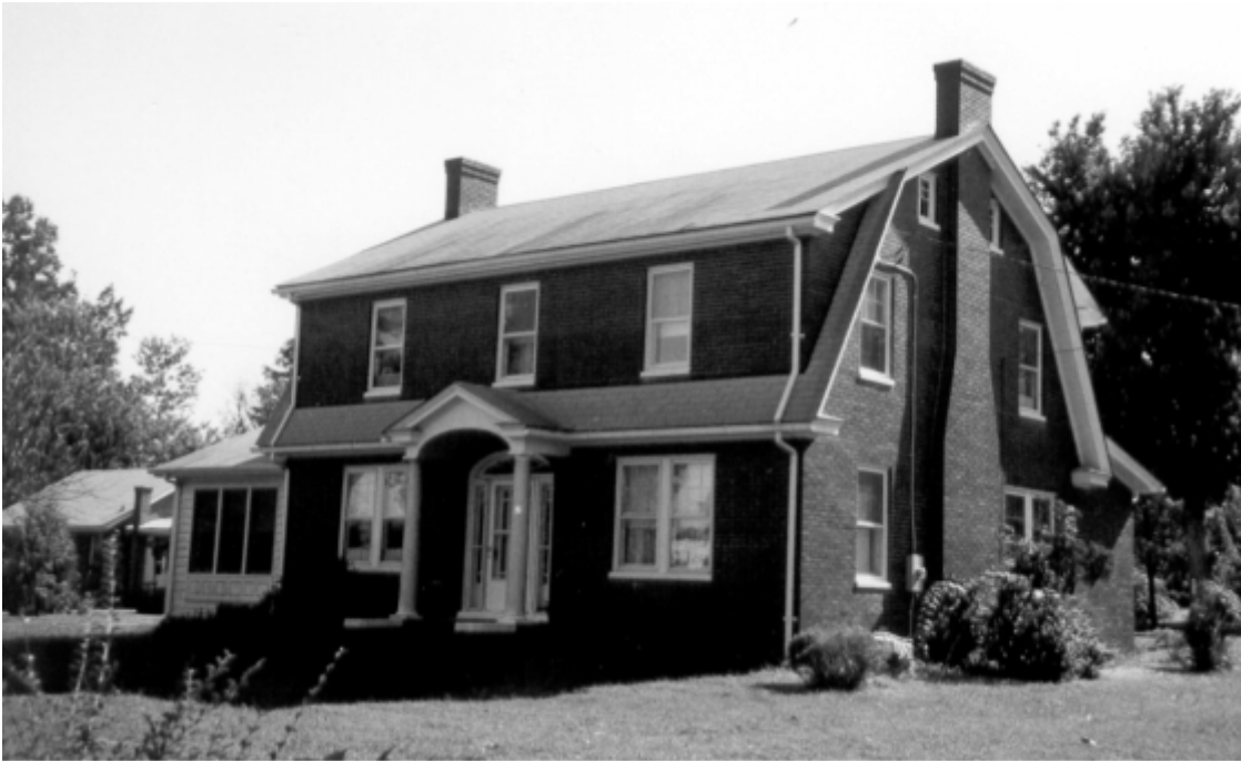
Figure 3.4: Colonial Revival House (047-5147-0014)