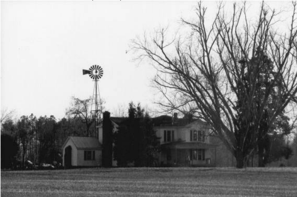
Figure 3.14: Warrens Mill Farm (047-5102)

The Civil War devastated most of the lower peninsula and surrounding areas, so most of the farms that survive in James City County date to well after the war, specifically to the years between 1860 and the first decade of the 1900s. In a community that relied heavily on slave labor, traditional agricultural practice faced a restructuring of the labor market. The farmhouses erected during this period were mostly two or two-and-one-half story frame structures with central or side passage plans. Rear wings have been added to some dwellings over the years to provide families with more space. Examples include the Hazelwood Farm House (047-5160), the Diascund Farm (047-5098), and the Gilley House (047-5115) (Figure 3.15). The addition of a rear wing has given these structures an L or T shaped floor plan.