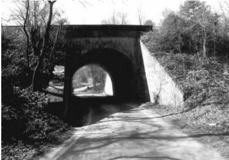
Figure 3.13: CSX Highway Tunnel (047-5175)

While very few structures exist to illustrate the influence of technology and engineering on the built environment of James City County, the Route 601 CSX Highway Tunnel (047-5175) is one example (Figure 3.13). The arched tunnel, measuring 10.5 feet in clearance, was erected in 1915 under the Chesapeake and Ohio Railroad. The presence of boards in the interior arch indicates that they were used to shore up the concrete when it was originally poured. Reinforced concrete was used for construction in Europe as early as the mid-nineteenth century, and introduced to American engineers by about 1870, although it was not widely used in bridge construction until the early twentieth-century (Delaware's Historic Bridges 200:150).