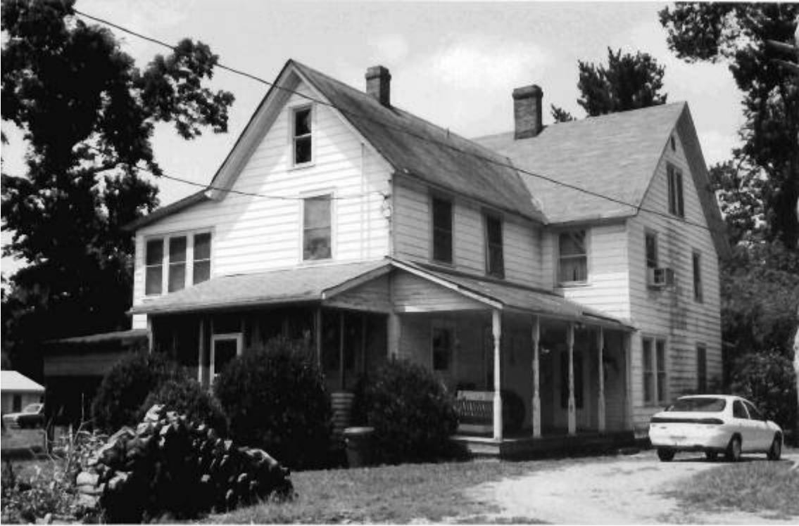
Figure 3.15: Gilley House (047-5115)

on a center aisle plan with storage bins located either in a singular center aisle or two side aisles (Lainer and Herman 1997:216).