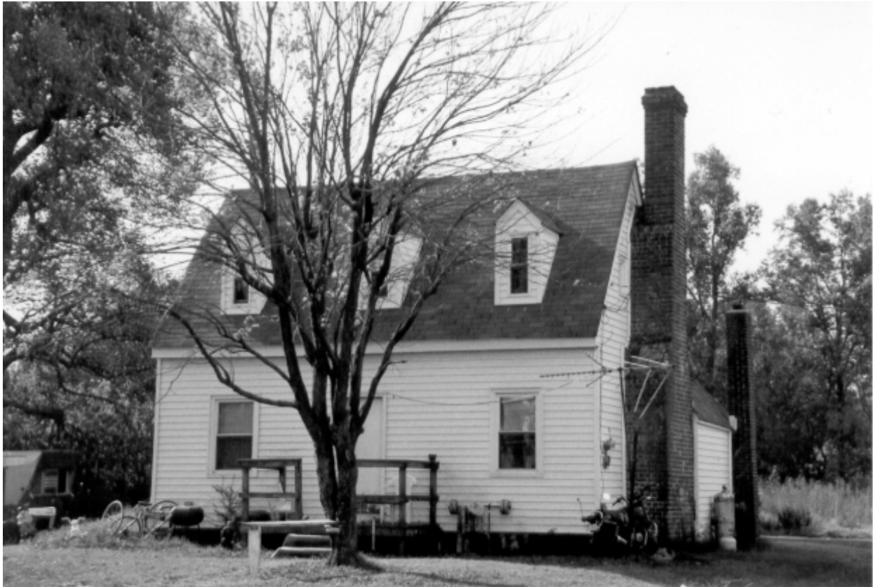
Figure 3.2: Col. William Allen House (047-0022)

The Antebellum Period (1830-1860) was characterized by growth and prosperity, mostly in the form of agriculture, although a few residential buildings were constructed in order to accommodate the growing population. During the mid-nineteenth century, the established plantation-oriented colonial settlement patterns remained largely intact. However, public funding began to flow and internal improvement projects succeeded. A systematic network of transportation, including canals, turnpikes, railroads, and riverboats shrunk the travel time necessary to move goods and people around the Commonwealth. Populations in the towns and counties increased and urban commercial and industrial centers flourished.