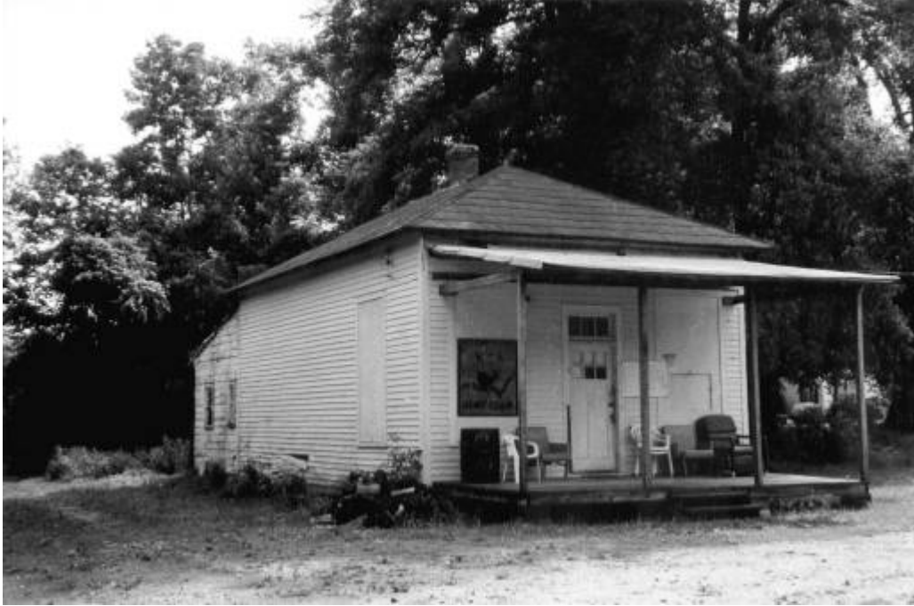
Figure 3.6: Grove School (047-5121)