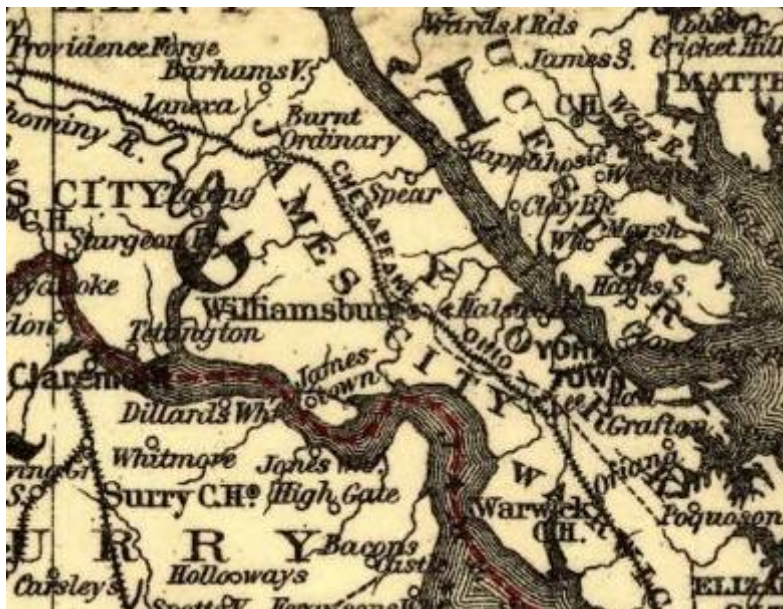
Figure 2.3: 1881 Map of the Chesapeake and Ohio Railroad in James City County.

There is little architecture that survives from this period. There were some changes and improvements made to older houses of this period but the lack of cash did not permit extensive construction. There were at least three log structures from this period known to exist, indicating that financially, it was desirable to utilize natural resources available for dwelling construction. Nathan Batchelder built one of the three log structures (047-5001).