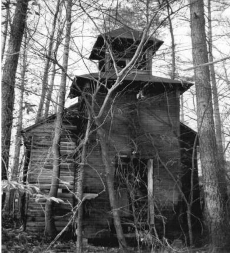
Figure 3.5: Brick Bat School (047-5246)

supported by decorative brackets, and tall paired windows on its side elevations. It is the only stone school structure that remains in the county. Today the school is currently used for offices and is part of a professional office complex. Peach Park School (047-5239) was constructed in 1820 and is part of an agricultural complex that includes a main house, outbuilding, kitchen, and a possible slave cabin. The original location of the school is unknown but it is thought that school consisted of only two rooms. The school is in very poor condition with most of the walls either collapsing or broken altogether. It seems as though the school at some point was converted into a barn. The Grove School (047-5121) is a one- to two-room frame structure which was established in Grove in 1893 (Figure 3.6). It served as a schoolhouse until 1943, when it became the headquarters of a hunt club. Last, but not least, is the Diascund School (047-5239). Built in 1920, the Diascund School is a one-story, three-bay, central-passage Colonial Revival building. It once served as a one-room schoolhouse, however now it is a private residence.