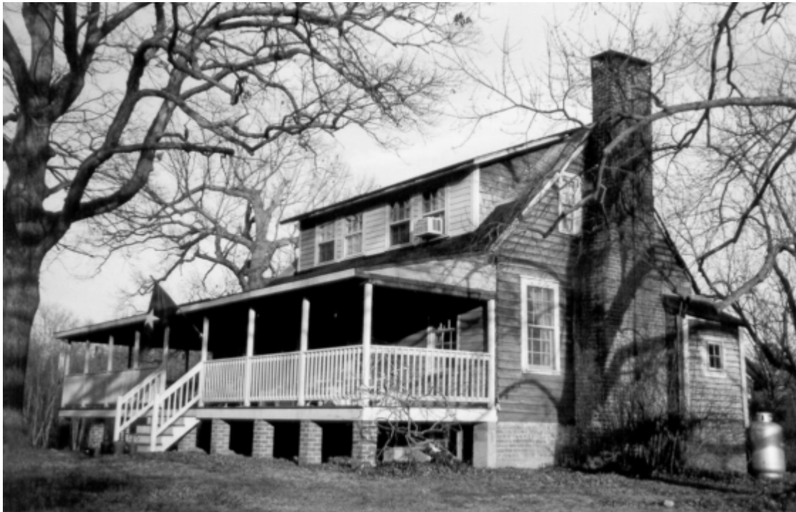
Figure 3.1: Oakland (047-5243)