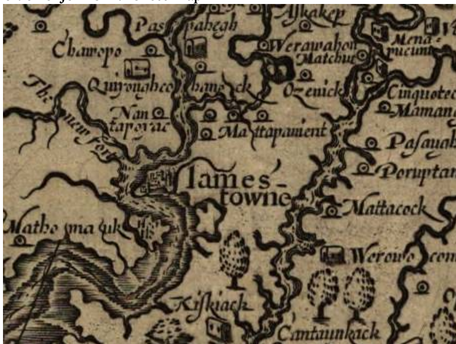
Figure 2.1: Portion of John Smith's 1607 Map

As European settlement began to grow and expand along the coast and the navigable waterways of the Chesapeake Bay and its tributaries, relations between the Native Americans and the colonists slowly began to deteriorate. Incidents of theft and murder can be traced to both sides, but the increasing size of the English colony soon began to encroach upon native lands. Native villages were overtaken by the colonists. Many Native