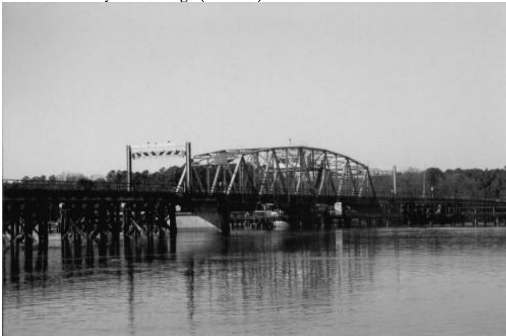
Figure 3.12: Chickahominy River Bridge (047-5247)

With the increased use of automobiles in the 1920s and 1930s, ferrying traffic across rivers via boats became inefficient. A system was needed that would allow both river traffic and road traffic to pass freely. In order to accomplish this, moveable bridges were built that could be raised and lowered according to the density of traffic. The two-lane, single-span Chickahominy River Bridge (047-5247) carries Route 5 over the river, and is an example of Pratt-truss swing-bridge with a bridge tender shack in the superstructure (Figure 3.12).