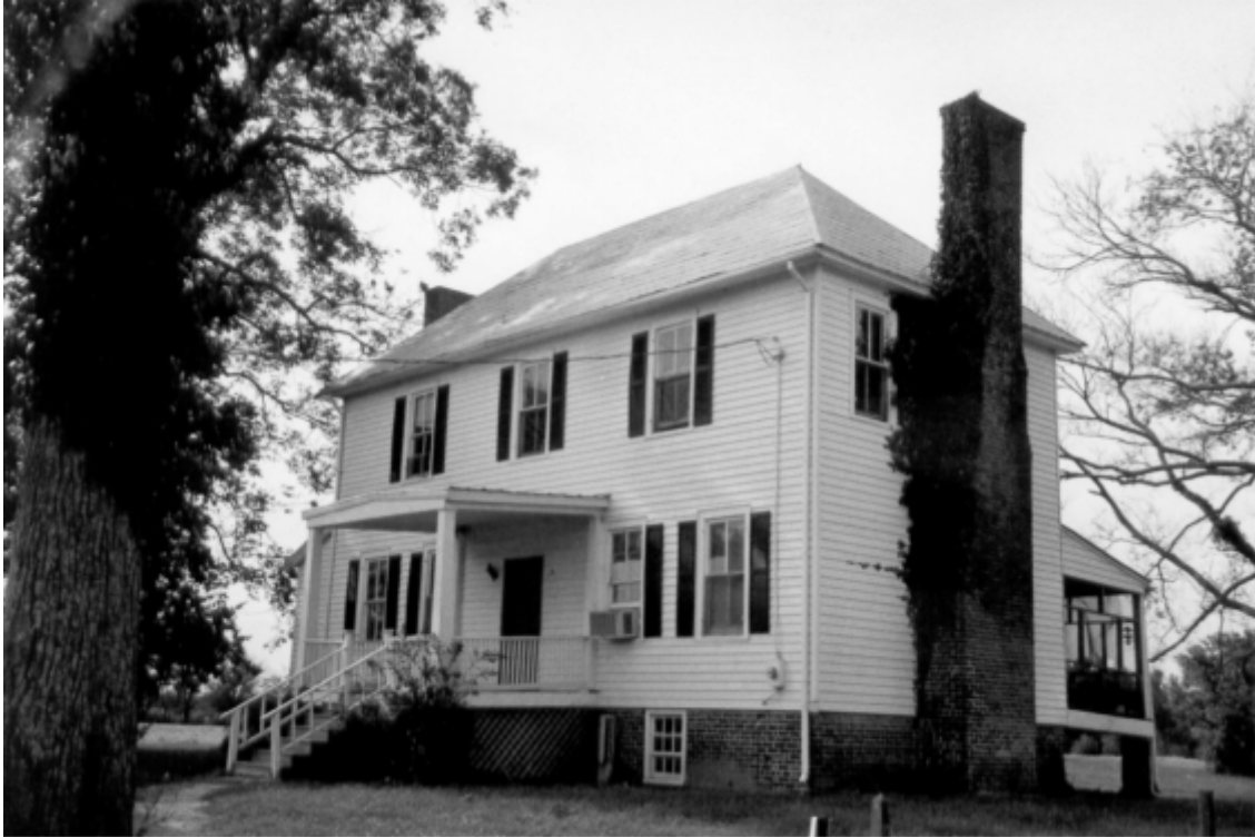
Figure 3.3: Breezeland (047-5156)

After the Civil War (1881-1865), the Reconstruction and Growth Period (1865-1917) embodied a broader diversity of styles than earlier periods. In James City County, some houses built during this period were mail-order types, or styled after this type, and were extremely popular throughout southeastern Virginia. Other popular styles included the Colonial Revival four-square, either single or two-story, and also the vernacular single and two-story gabled styles, sometimes with added wings.