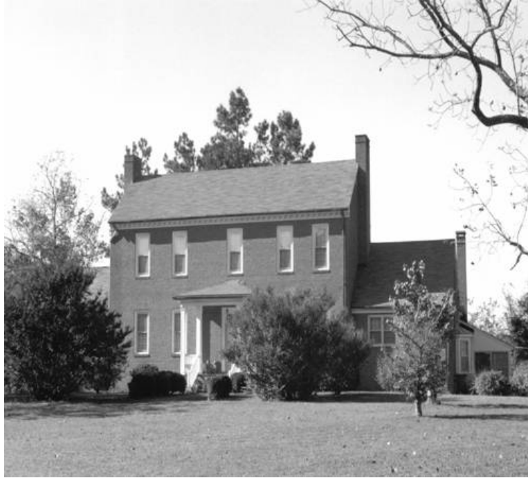
Figure 3.1: Riverview Farm (087-5379)

Many of the small farmstead dwellings built in the mid-eighteenth century were built on a modest rectangular one or two room house plan, with a loft. This was probably the most frequent type constructed in colonial Southampton County. The original portion of Beechwood (087-0002), has been assigned a construction date between 1722 and 1756 (Joyner 1978:89). This house was apparently built in three stages, with additions in 1814 and 1860 (Figure 3.3). The original portion was described as a one-room, one-story house, built in the third quarter of the eighteenth century by Jordan Denson who died in 1806. The Denson family was prominent in the Society of Friends. Jordan Denson owned 197 acres of land in 1782, when the property was first taxed. Beechwood is another rare example that dates to the late colonial period (1750-1789) or perhaps earlier, and it has already been placed on the National Register of Historic Places. Additions to smaller early structures were fairly common occurrences in Virginia. As families grew or as more space was required, additions to meet those needs were constructed adjoining original buildings.