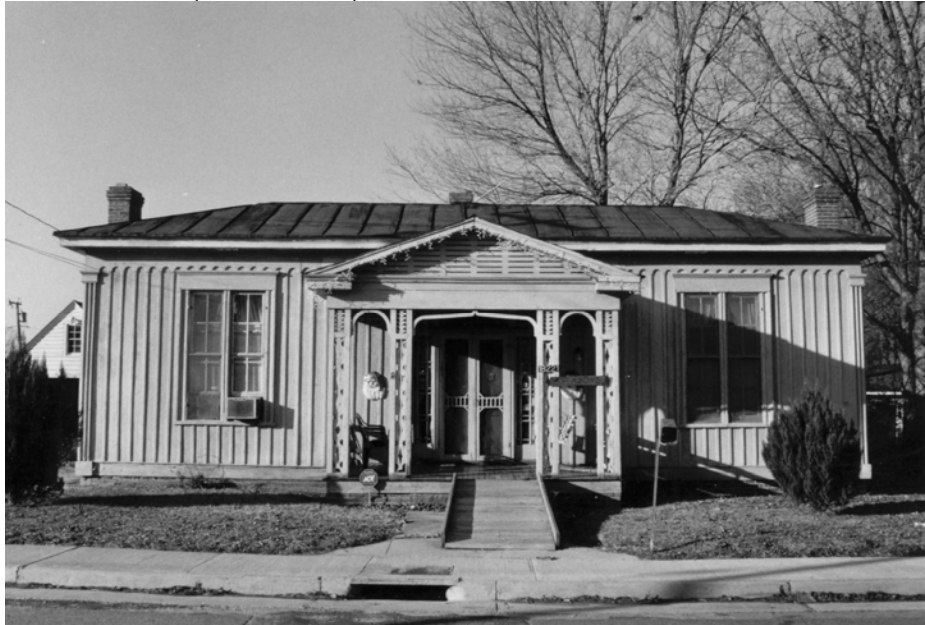
Figure 3.10: Beaton House (174-5002-003)

The style most often observed in Southampton County is vernacular Victorian (referred to as “folk”). Adapted into existing traditional building styles such as the I-house (two-story, one-room deep, central hallway) plan, one or two-story gable-front with side-wing (L-shaped) dwellings, pyramidal hipped with recessed porch, plus front or side-gabled structures, vernacular Victorian was common during the period from about 1870 until about 1910. The Victorian features added to these folk buildings are usually Italianate or Queen Anne inspired decoration, which are typically less elaborate than the high style Victorian interpretations. Typical features might be a full return cornice with brackets under the eaves and/or spindle work porch detailing. The Charles Pretlow Farmhouse (087-5448) at 37165 Pretlow Drive, is a good example of the vernacular Victorian styles (Figure 3.11). A frame, two-story, five-bay, central hallway building with interior gable-end chimneys; the house is one-room deep and has a rear one-story kitchen ell. This dwelling has a shallow gable roof with a box cornice with partial returns and decorative brackets. The front entrance porch is supported by paired square wood posts with a cut-out star decoration on each side, filigree trim, and scroll brackets.