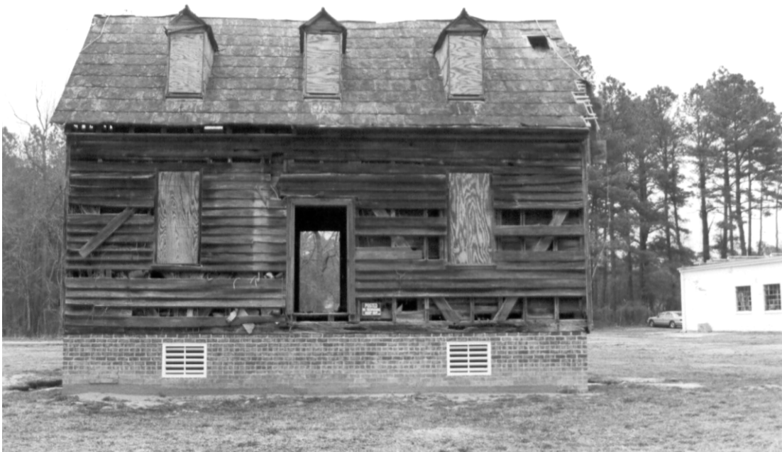
Figure 3.7: Rebecca Vaughan House (087-0047)

Domestic architecture during the Antebellum Period (1830-1865) usually reflected the relative economic status of the landowner. The larger plantations had grander and more impressive dwelling houses. Smaller hall and parlor type houses were utilized from the earlier part of this period and before, often with later, two-story additions. The Federal-style Catherine Whitehead House (087-0034), where Nat Turner's group killed four family members, and the Rebecca Vaughan House (087-0047), where they committed their last murders, are examples of the smaller hall and parlor type houses (Balfour 1989:26-27). The Rebecca Vaughan House has been listed on the NRHP (Figure 3.7).