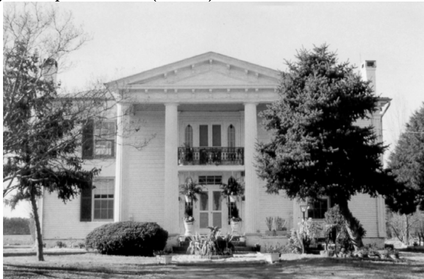
Figure 3.9: Benjamin Pope Homestead (087-5419)

While, the Early Classical Revival style of architecture was popular during the late eighteenth and early nineteenth century, the Greek Revival style was popular with the more affluent during the period 1820-1860. The Early Classical Revival builds on the Georgia and Federal styles, with an entry porch or portico that dominates the front façade of the building and is usually supported by four simple classic columns (Roman Doric or Tuscan types). An elliptical fanlight usually is present above a paneled central hall doorway, and windows are aligned vertically and horizontally in symmetrical rows. This style occurs into the mid-nineteenth century (McAlester 1998:169). The Benjamin Pope Homestead (087-5419) at 28210 Meherrin Road has the classic pediment, two-story portico porch of the Classical Revival style (Figure 3.9). This frame two-story, hip-roofed dwelling house was built in the 1840s and reflects a classic grandeur. There is a perpendicular wing on the rear, with porches. The detached kitchen is a brick one and a half story, side-gabled structure. The Benjamin Pope plantation (087-5419) is a rare resource and would likely be found eligible for the National Register. It was one the ten resources surveyed at the intensive level.