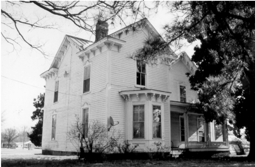
Figure 3.12: 22125 Main St in Courtland (201-5001-0008)

The Victorian Queen Anne style appeared at the beginning of the Growth period (1880-1890) and was popular into the early twentieth century in Southampton County. The latter style often had steeply pitched roofs with irregular shapes, a dominant front-facing gable, patterned shingles, bay windows, and decorative turned spindles and sawn brackets. The towns of Courtland, Boykins, Capron, Drewryville, Sedley, Ivor and Newsom all have some excellent examples of houses built during this period. An example of this style in Courtland is the house at 22125 Main Street (201-5001-0008) (Figure 3.12).