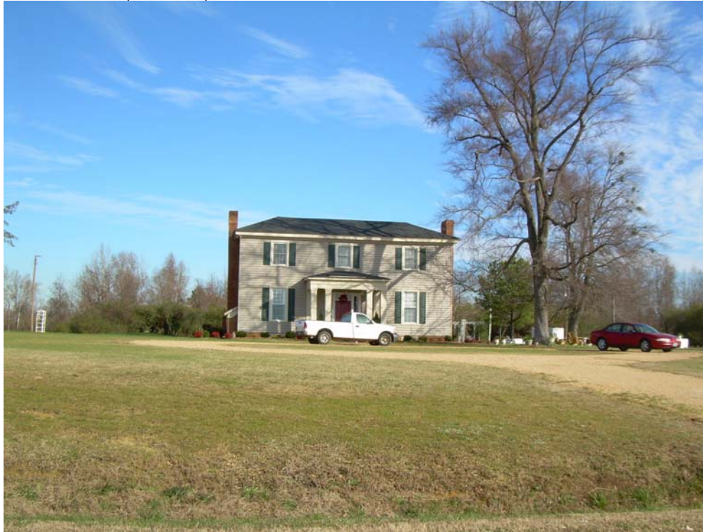
Figure 3.18: Cedarview (087-5395)

The Smith Ferry Road Farm (087-5330), located near Sunbeam, dates from 1840. The house is a two-story frame structure with gable-end chimneys, a central passage entrance, and a full front porch. The house has a one-story addition on the rear. Outbuildings are located some distance from the rear of the house and include an open bay equipment storage building, a gabled frame barn with one-story, shed-roofed, side-bay additions, and a grain storage bin. The outbuildings date to the mid-twentieth century. The house is potentially eligible for the National Register.