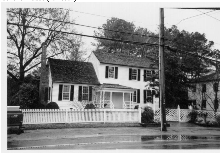
Figure 3.5: Rochelle House (201-0002)

Southampton County has a number of excellent examples of middle-income housing from the 1790-1830 period. Among those listed on the National Register of Historic Places are Elm Grove (087-0103) (Figure 3.2) and Rose Hill (087-0052) (Figure 3.6). Elm Grove in Courtland is a late eighteenth century building that was expanded in the early nineteenth century using the profits from a number of agricultural activities. In addition to the house, the property contains a number of nineteenth century outbuildings. Rose Hill was built between 1805 and 1815. Like Elm Grove, it has exterior gable-end chimneys and a central passage plan. Rose Hill in Capron, has its kitchen incorporated into a rear wing of the house. These buildings have been previously inventoried but Rose Hill was visited during the present survey.