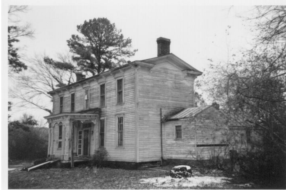
Figure 3.11: Charles Pretlow Farmhouse (087-5448)

The Victorian Queen Anne style appeared at the beginning of the Growth period (1880-1890) and was popular into the early twentieth century in Southampton County. The latter style often had steeply pitched roofs with irregular shapes, a dominant front-facing gable, patterned shingles, bay windows, and decorative turned spindles and sawn brackets. The towns of Courtland, Boykins, Capron, Drewryville, Sedley, Ivor and Newsom all have some excellent examples of houses built during this period. An example of this style in Courtland is the house at 22125 Main Street (201-5001-0008) (Figure 3.12).