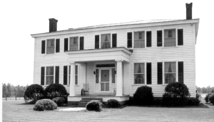
Figure 3.4: Rotherwood (087-0045)