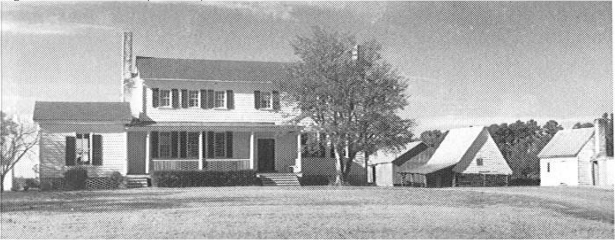
Figure 3.6: Elm Grove (087-0103)

Domestic architecture during the Antebellum Period (1830-1865) usually reflected the relative economic status of the landowner. The larger plantations had grander and more impressive dwelling houses. Smaller hall and parlor type houses were utilized from the earlier part of this period and before, often with later, two-story additions. The Federal-style Catherine Whitehead House (087-0034), where Nat Turner's group killed four family members, and the Rebecca Vaughan House (087-0047), where they committed their last murders, are examples of the smaller hall and parlor type houses (Balfour 1989:26-27). The Rebecca Vaughan House has been listed on the NRHP (Figure 3.7).