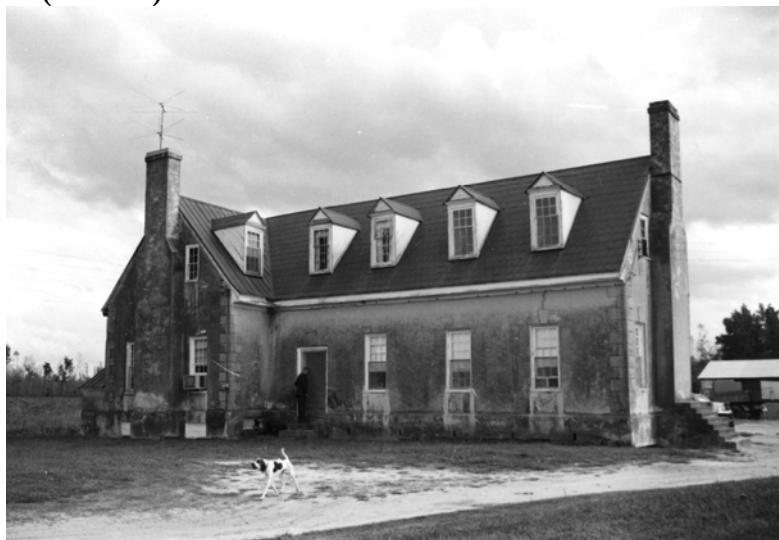
Figure 3.1: Clements (087-0011)

While Georgian styles and their derivatives exist in Southampton County, they seem to be primarily found at