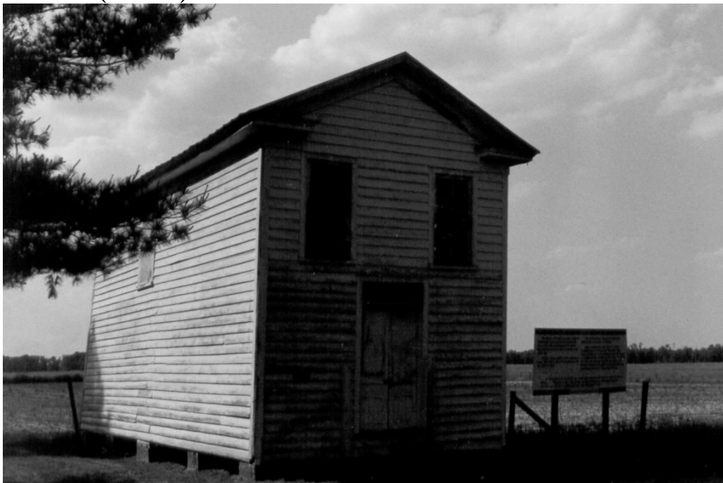
Figure 3.15: Berlin (087-5339)

The old Ivor school (243-5009), built about 1900, was first a two-room school and then was used as a small high school in 1908 (Babb 1965:33-34). The one-story Colonial Revival style building has a hipped roof and does not appear to have been altered from its rectangular plan. It is in good condition. In 1920, the town of Ivor built a larger one-story school of brick, also in the Colonial Revival style. This school served as the high school for the