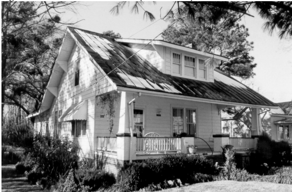
Figure 3.14: 22160 Main St. Courtland (201-5001-0020)