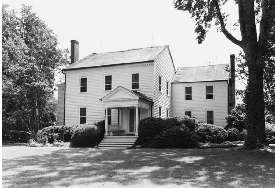
Figure 3.3: Beechwood (087-0002)

Architecturally, the large brick or frame plantation houses and the in-town homes of the planter elite often receive the most attention. While they can be spectacular or extensive, they do not represent the average dwelling in Southampton County or those in most of the Southern and Middle-Atlantic states. During the first 200 years of European settlement in America, the house styles copied the traditional or vernacular patterns brought from Europe. For the most part, they tended to be small one and two-room plans with one or two stories high. Most of the rooms in the dwellings were used for a combination of purposes such as service work, cooking, crafts, and family spaces. There was little private space. Slowly, this changed during the early eighteenth century with the introduction of hallways into house patterns. Floor plans began to be organized around a central passage or a side passage plan. Hallways permitted a measure of privacy and also began to encourage householders to designate single-purpose rooms. The concept of privacy, leisure time and houses with “style,” developed in the 1700s, and this fostered the symmetrical Georgian center hall plan that evolved, creating larger and more rooms designed for special uses, such as a dining room and library (Carley 1994:76; Rifkind 1980:18). New houses of the planter elite and city dwellers were often well proportioned, built for a formal effect, and decorated with ornamentation.