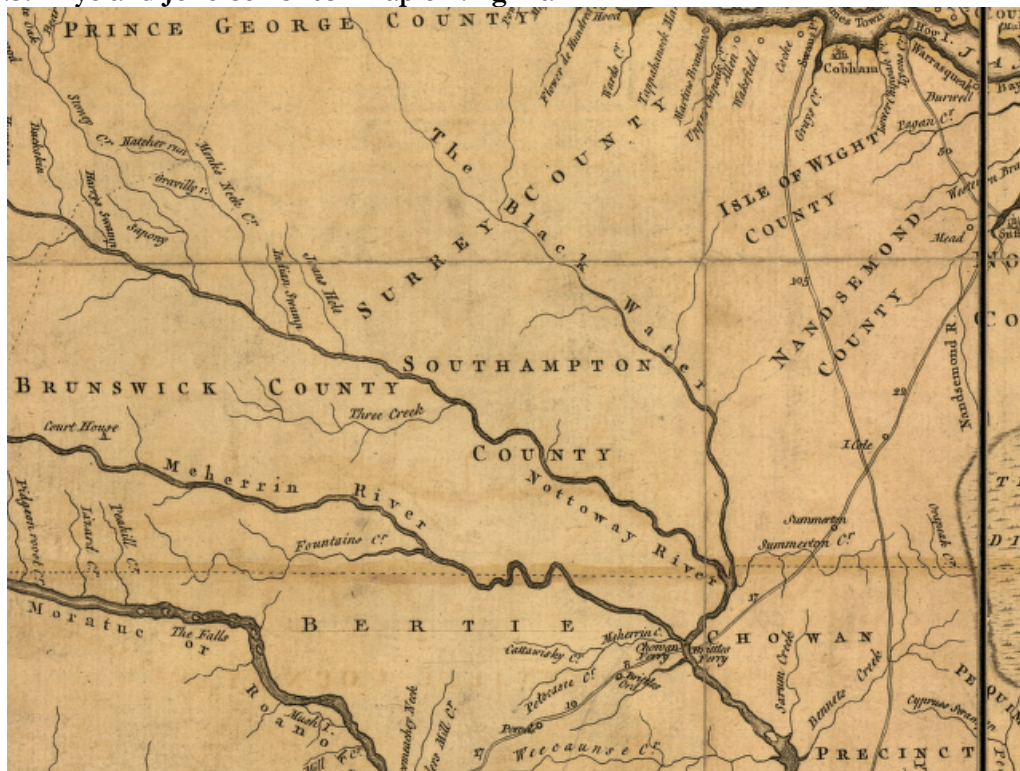
Figure 2.3: Frye and Jefferson's 1751 Map of Virginia

Six years after the county was formed, the 1755 list of tithables for Southampton County recorded 2,009 people. These were the people who were eligible to vote and who were the visible part of the county. The tithables most likely represent a total population of about 4,000 European Americans and 2,000 African Americans. (Parramore 1978: 30).