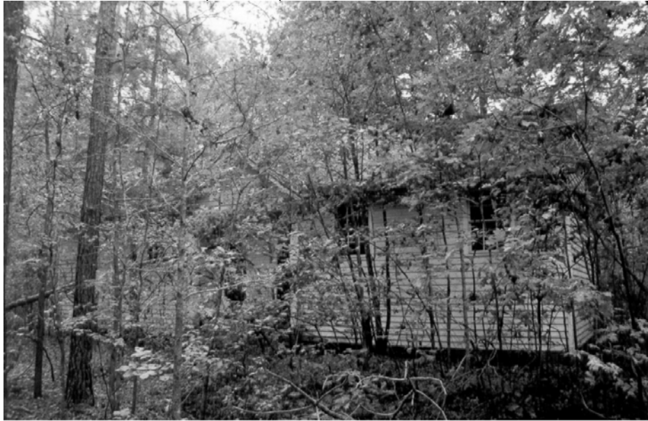
Figure 3.16: Old Wakefield School (087-5411)

Historic photographs indicate that the small rural schools for the African-American students in Southampton County in the 1920s and 1930s were built in a variety of rectangular plans. None of these buildings are still in use, but some have survived. Most were abandoned, but some were converted to other uses, such as the Sandy Ridge School (087-5329). It was built about 1900 and is now used as a farm building. The larger communities, such as Adams Grove, had larger schools. The photographs of the schools show that some had front gables with a central entrance and banks of windows on each side. Some had a corner entrance with an integral porch. Others had a five-bay, central-passage, gable-end, single-pile plan, with windows located on each side of the entrance (Balfour 1989:68).