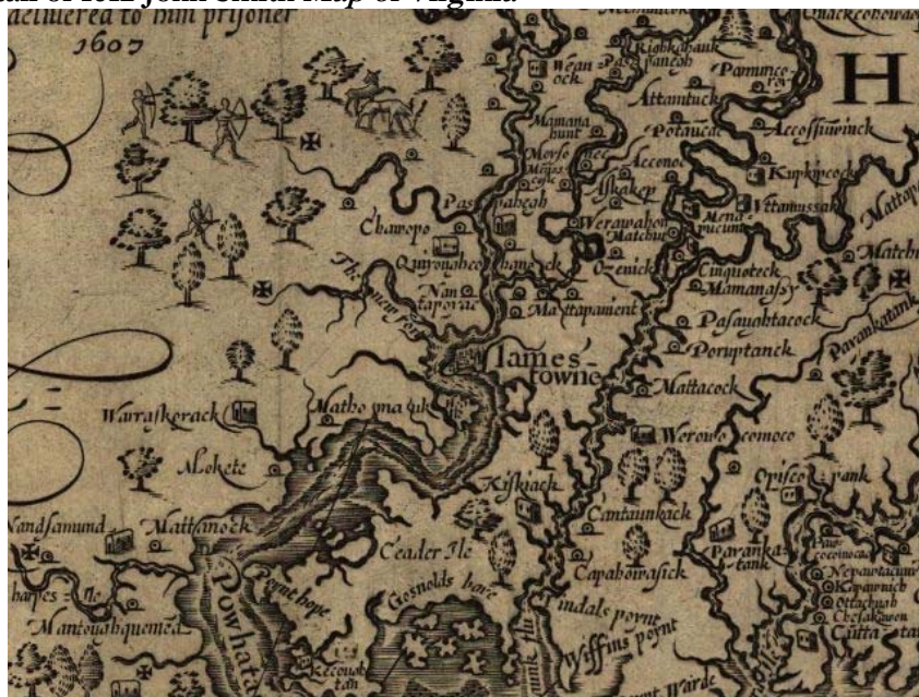
Figure 2.2: Detail of 1612 John Smith Map of Virginia

As the Virginia Colony grew during the seventeenth century, the colonial settlement began to expand along the Coast and along the navigable waterways of the Chesapeake Bay and its tributaries. However, except for fur trading and other contacts, the farms and villages of the Colony remained north of the James River for the first ten years. Eventually, the colonists spread south over the James River and began to fill in the region to the Blackwater River. As the settlement expanded, relations between the Native Americans and the colonists began to deteriorate. Incidents of theft and murder can be traced to both sides but the increasing size of the English colony was soon felt by the Nottoway and the Meherrins of the region and, most certainly, by the Powhatan chiefdom which were directly in the path of the aggressive colonists.