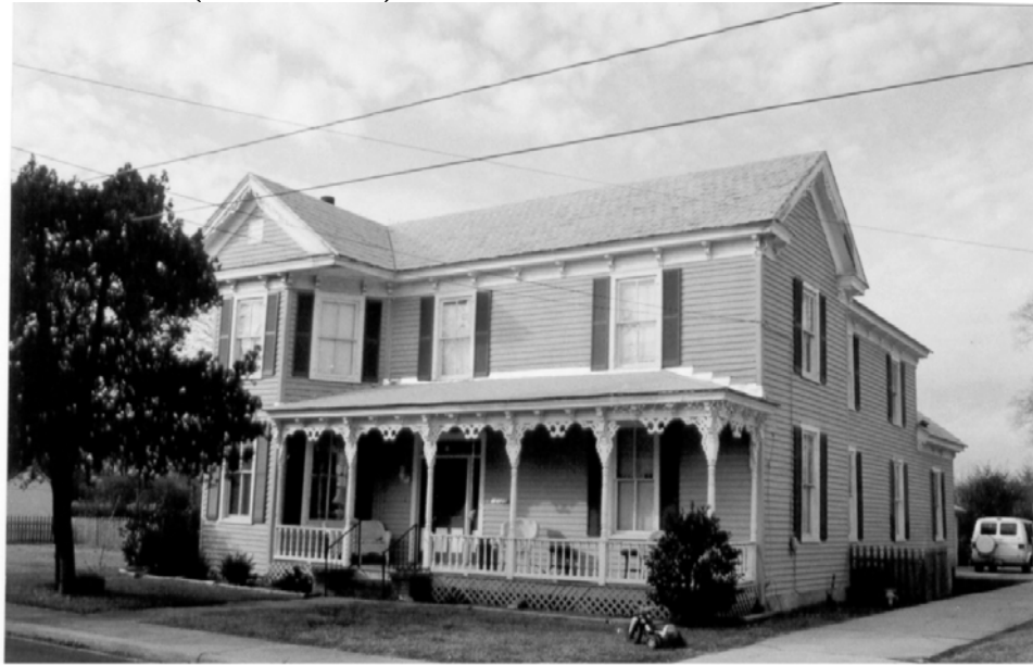
Figure 3.13: Feltz House (174-5002-0023)