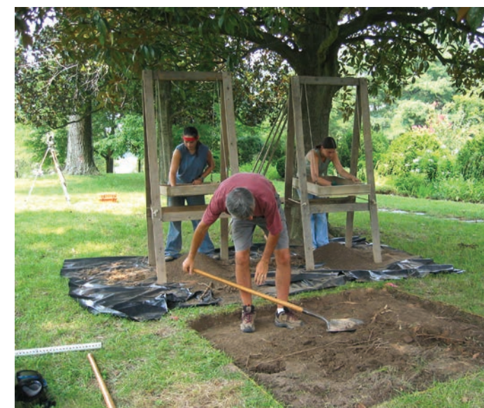
Example of typical technique for excavating the rectangular pits called test units similar to the ones dug at the Gouldman Oyster Shell Midden. One archaeologist carefully removes the soil according to the layers of soil observed, while others sift the soil through large screens to recover artifacts. The finds are placed in bags according to the unit number and distinct soil layer where they were found. When the artifacts are brought to the lab, they are washed and then identified and catalogued according to where they were recovered on the site.

Based on the kinds of plant remains found at the site and the lack of others, the inhabitants of the Gouldman Oyster Shell Midden inhabited the site mostly or perhaps only in the spring. Over 650 liters of sediment were processed to find charcoal, mostly from burned wood. Edible plants identified among the charcoal fragments include nut shell (mostly from thick-walled hickory nuts) and seeds (two holly, three pigweed, and one each of hackberry, raspberry or blackberry, and grape; the rest are unidentifiable). Conditions within the oyster shell midden were excellent for preserving plant remains left on site by inhabitants during the pre-colonial era. Oyster shell has the effect of neutralizing soil acidity that would otherwise hasten the decay of plant material. Therefore, the small number edible plant remains that survive suggests that the inhabitants were not there during summer or fall, when edible plants would have been collected and many remains discarded.