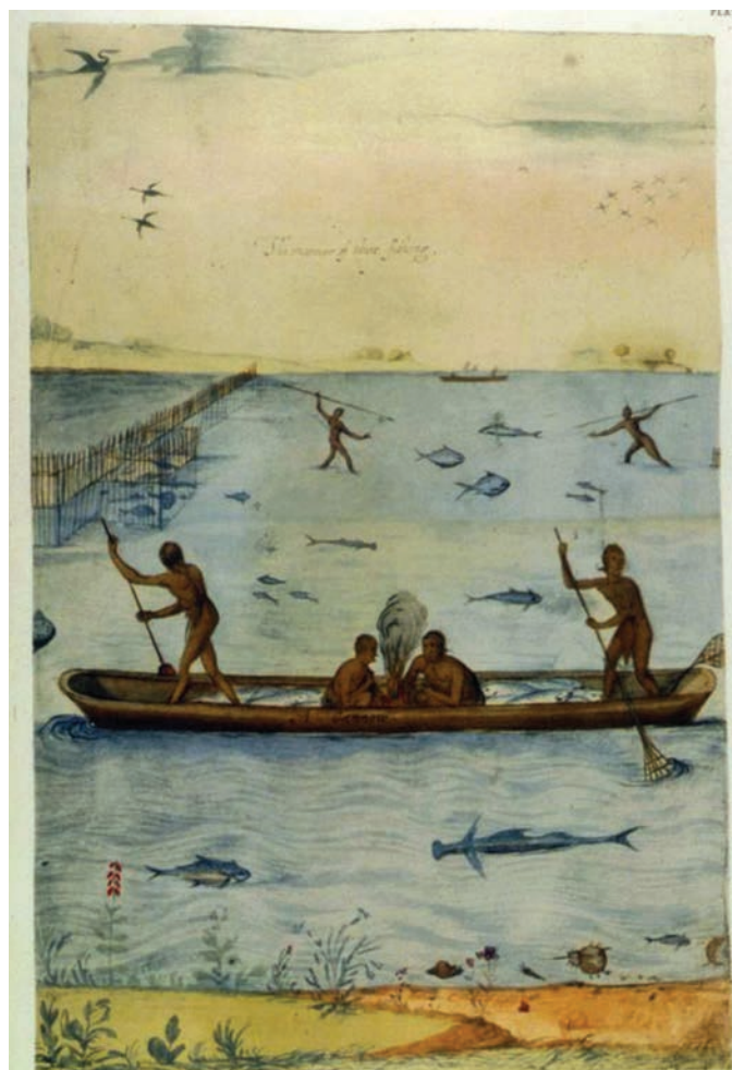
John White's painting of North Carolina Algonkians fishing (White 1984:73). The man in the stern is holding what appears to be a rake, perhaps to gather shellfish as mentioned in an account of Virginia Indians collecting oysters along the Chesapeake Bay (Wennersten 1981:5).

ants trampled on shells that lay scattered about the camp. Shucking requires a thin, durable tool to slide between the two halves of the bivalve to force the shells apart. The site inhabitants probably would not have shucked their oysters because the tools available to them would have been too thick (stone tools) or not durable enough (wooden tools).