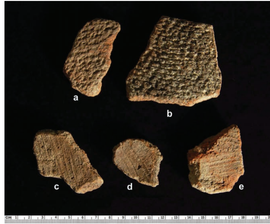
Examples of the Popes Creek pottery from the site. Note the net-impressed surface treatment on sherds "a" and "b" and evidence of scraping the clay before it was fired on the interior of sherds "c," "d," and "e."