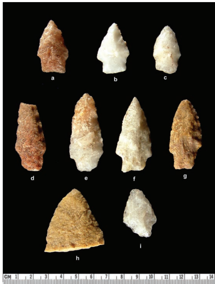
Examples of hafted bifaces from the site. Specimens "a" through "g" are the Bare Island type, while specimens "h" and "i" are fragments for which the type could not be identified.