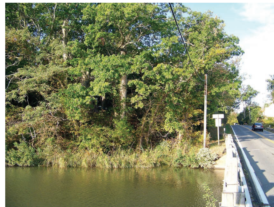
Gouldman Oyster Shell Midden Site (44WM0304), view to the west. The oyster shell midden is on top of the ridge behind the thick growth of trees along a creek near the Potomac River.

In 2007, archaeologists from the William and Mary Center for Archaeological Research (WMCAR) rediscovered that campsite (Figure 1). At the request of the Virginia Department of Transportation (VDOT), they conducted an archaeological survey because of plans to improve the nearby bridge and approaches. Before a road can be built or widened, engineers need to know what kind of soils are present, how the road will affect run-off from rain, and whether any important archaeological sites lie in the path of the road. Archaeologists visited this stretch of road and looked for evidence of pre-colonial Virginia Indian and/or any other historic occupation of the area.