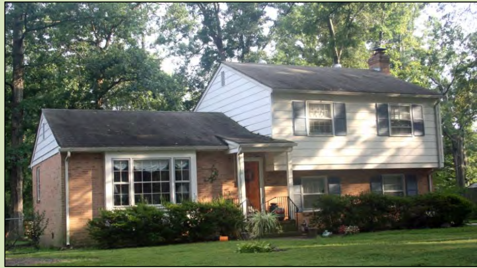
Richmond, VA