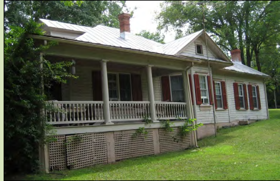
Asymmetrical House in Flint Hill Historic District, ca.1915, Rappahannock, VA (from National Register nomination form)