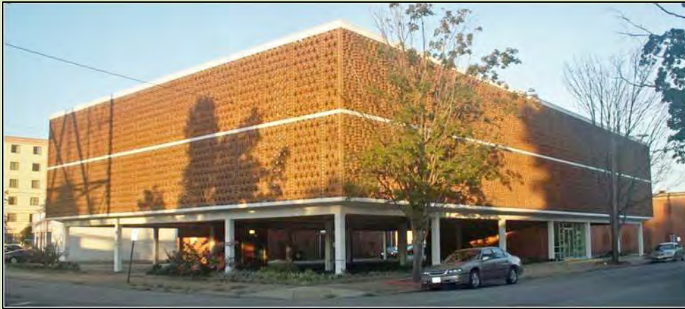
Richmond, VA (2013)