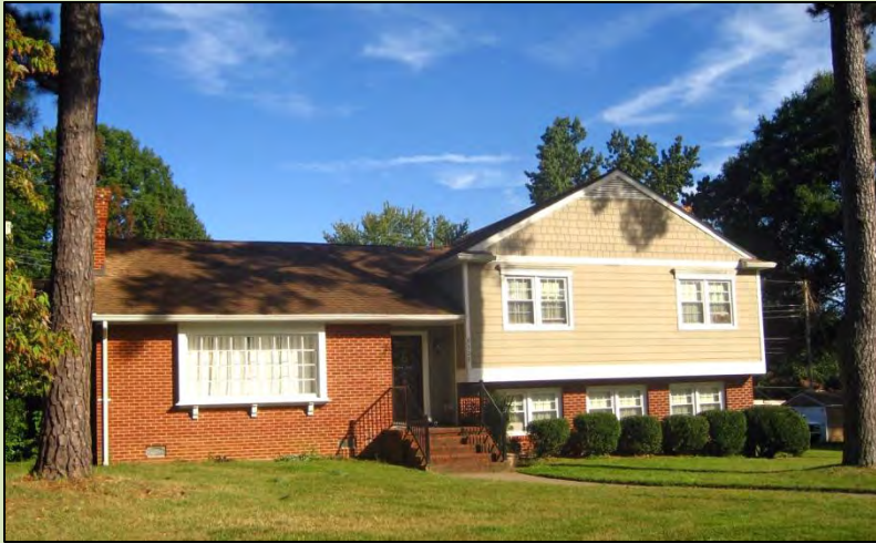
Henrico, VA

Developed in the mid-1950s, the Split Level house is essentially a multi-story modification of the Ranch. This style allows for the spatial separation of different functions onto three different stories, resulting in a quiet living area, a noisy living and service area, and a sleeping area.