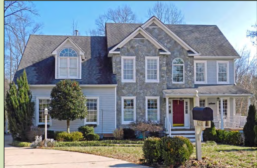
Chesterfield County, VA