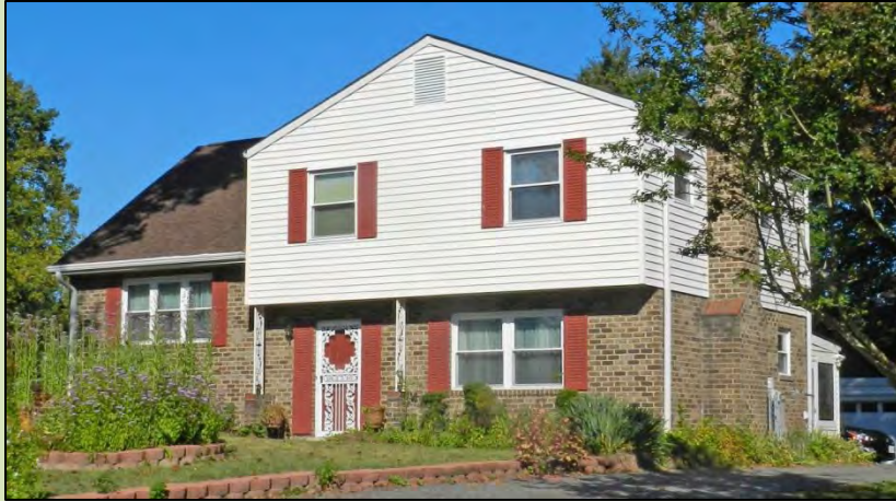
Chesterfield County, VA