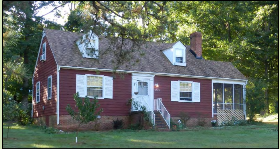
Chesterfield County, VA