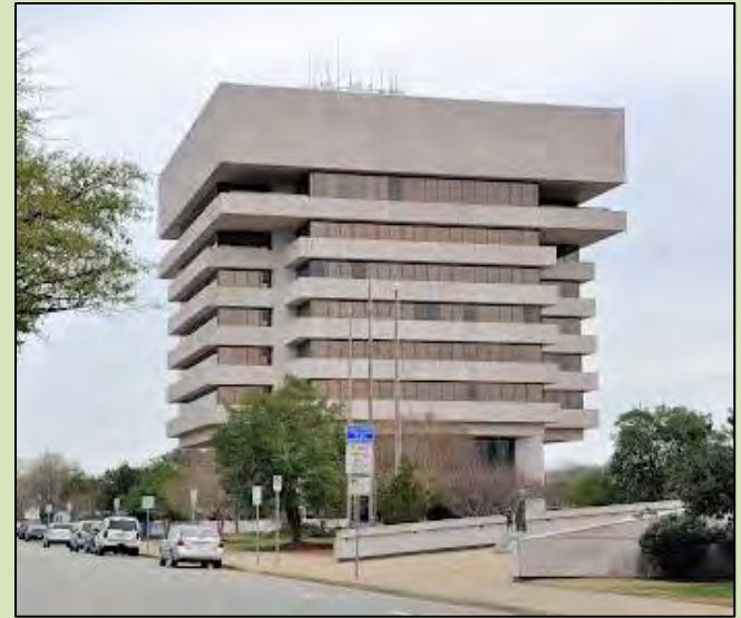
Hampton City Hall, Hampton, VA