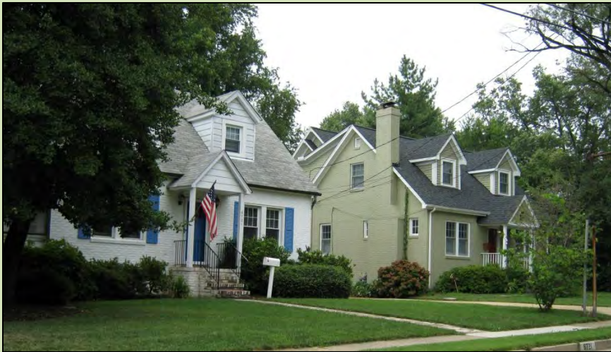
Arlington County, VA

Cape Cod Cottages have rectangular plans and symmetrical facades. Roofs are steeply pitched with a side gable and often include dormers. The main entrance usually has a central stoop flanked by windows.