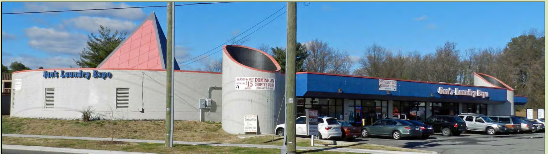
NeoExpressionist Commercial Laundromat, Chesterfield County, VA