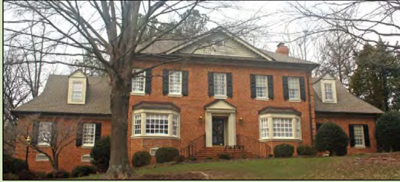
Greek Revival and Classical influences, Henrico, VA