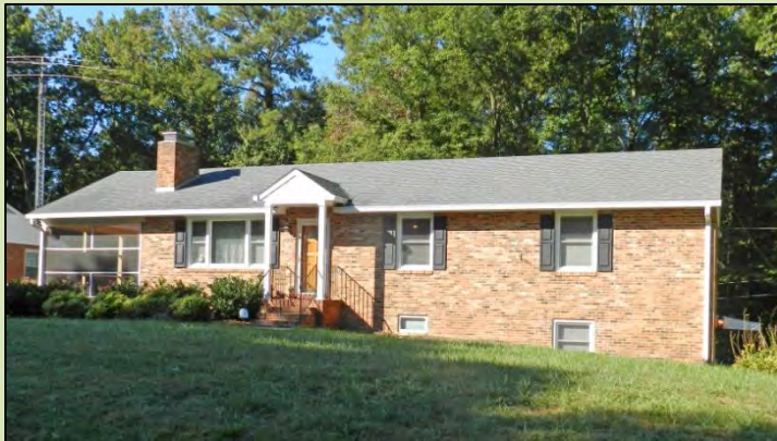
Chesterfield County, VA

Like the Ranch, the Raised Ranch house features a single living floor. However, unlike its one-story predecessor, the Raised Ranch is elevated one-half story above grade, resulting in two stories total. The house lot may be naturally sloping or may have been graded to accommodate a ground-floor entry and windows. The Raised Ranch differs from the Split Level in that it features only one story of living space on the upper level. The lower story is left semi-finished with an integrated garage and is essentially a service area.