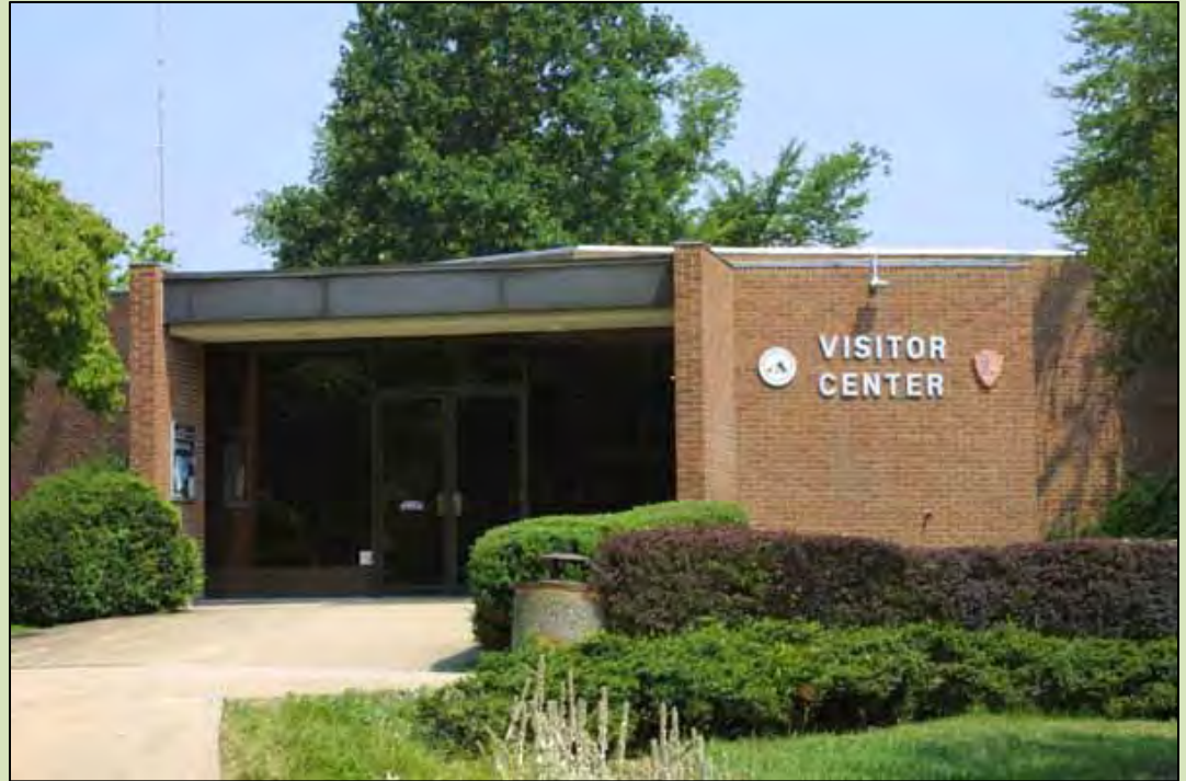
Petersburg Battlefield Visitor Center, Petersburg, VA