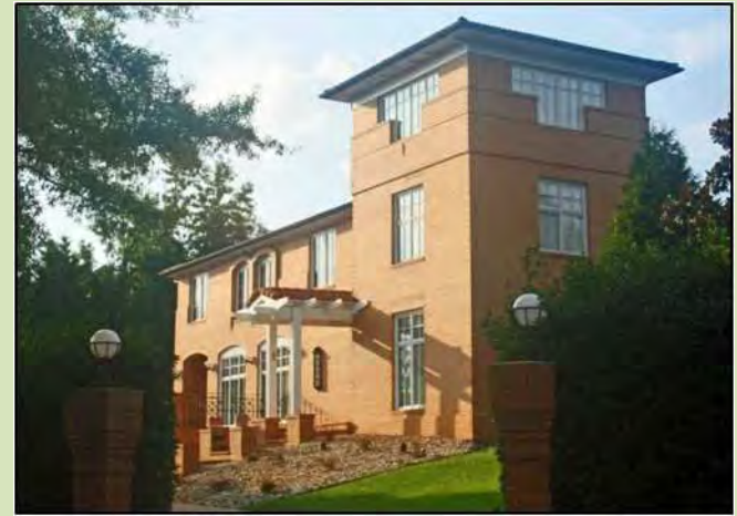
Mediterranean influence, Henrico, VA

Unlike most styles, Neo-Eclecticism was not created by architects but by builders and contractors who develop large, suburban houses. Although typically used for houses, this style has also been used for smaller commercial and public buildings.