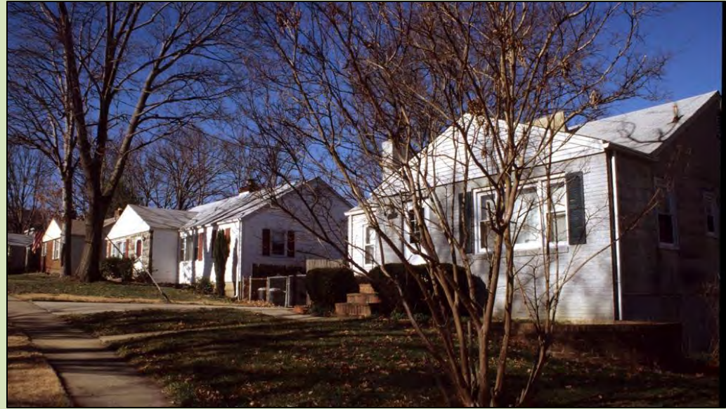
A row of Minimal Traditional houses in Arlington County, VA (Virginia Heights Historic District, Arlington, VA, National Register nomination form)