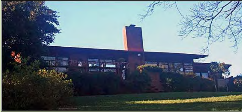
House on Riverside Drive, Richmond VA