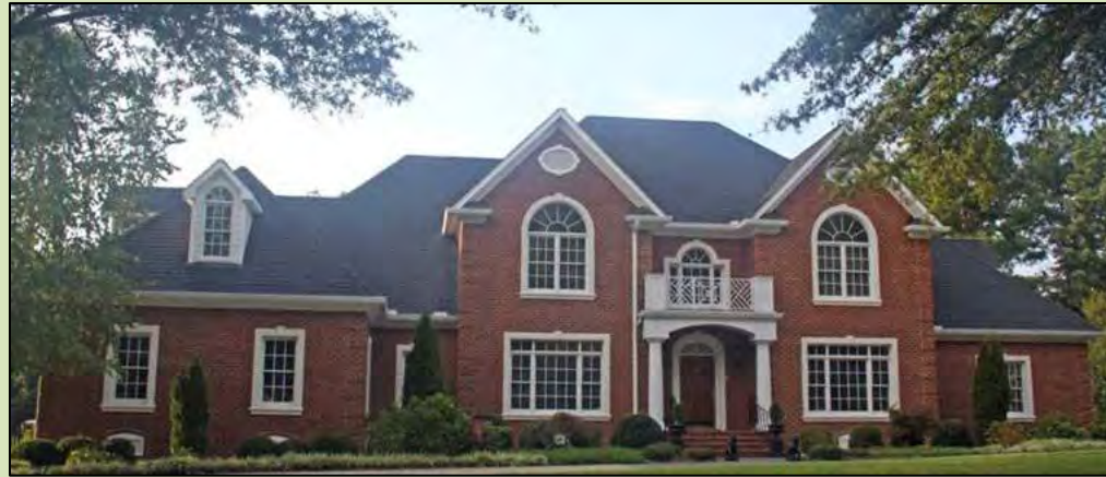
Neoclassical and Palladian influences, Henrico, VA