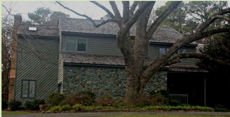
Henrico, VA

The Contemporary style was favored in the 1950s through 1970s primarily for architect-designed houses, but was sometimes used for commercial buildings such as offices and banks. Though they all eschew traditional forms and details, Contemporary buildings can be divided into those with flat or gabled roofs.