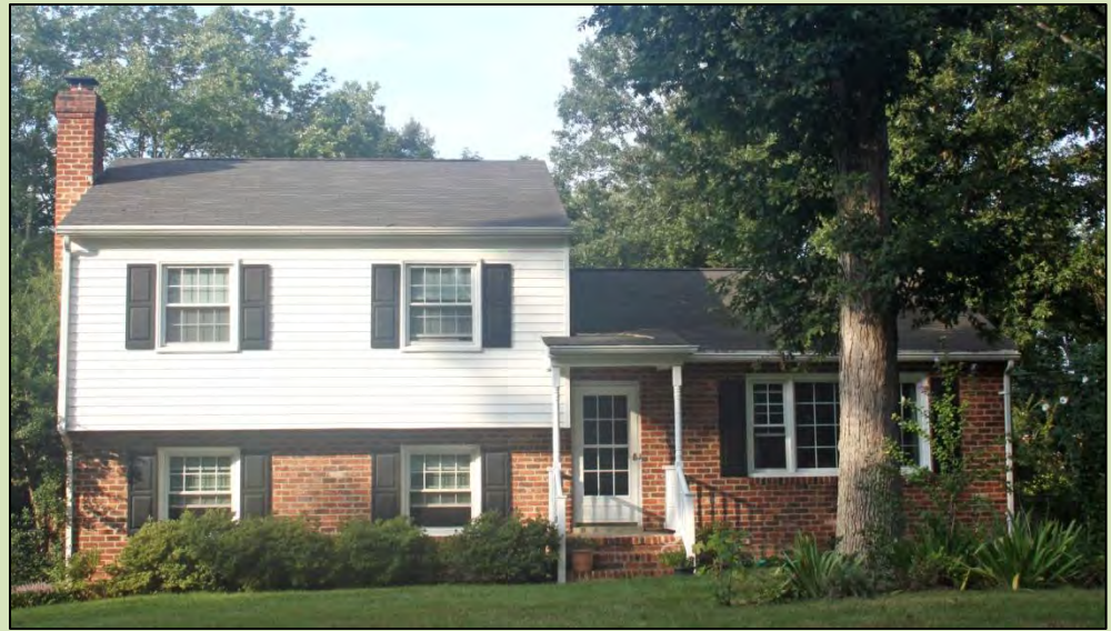
Richmond , VA (photo by Melina Bezirdjian , 2013)