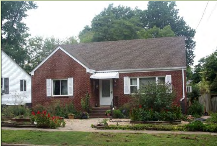
Richmond, VA (photo by Melina Bezirdjian , 2013)

First appearing during the Great Depression, Minimal Traditional houses flourished in the late 1940s and early 1950s . Simple and economical, this style was particularly well-suited to large tract-housing developments which gained popularity after WWII.