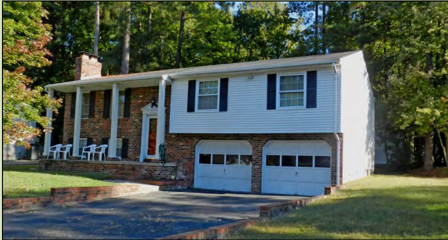
Chesterfield County, VA