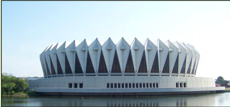
The Hampton Coliseum, during the day....