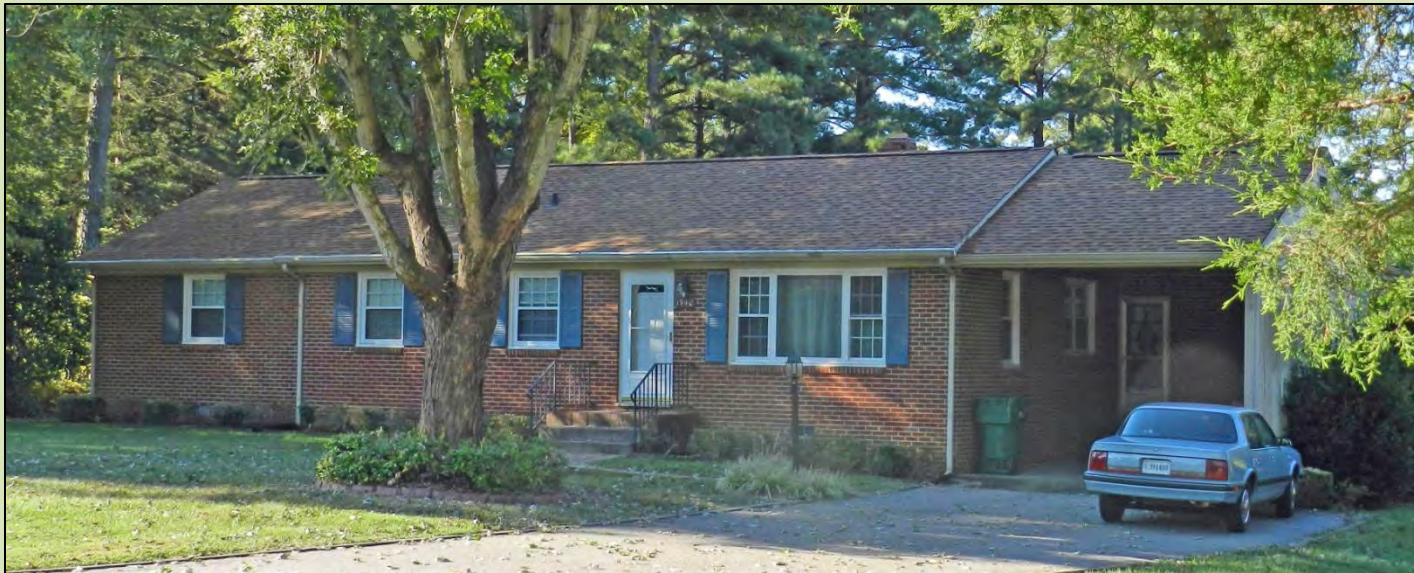
Chesterfield County, VA