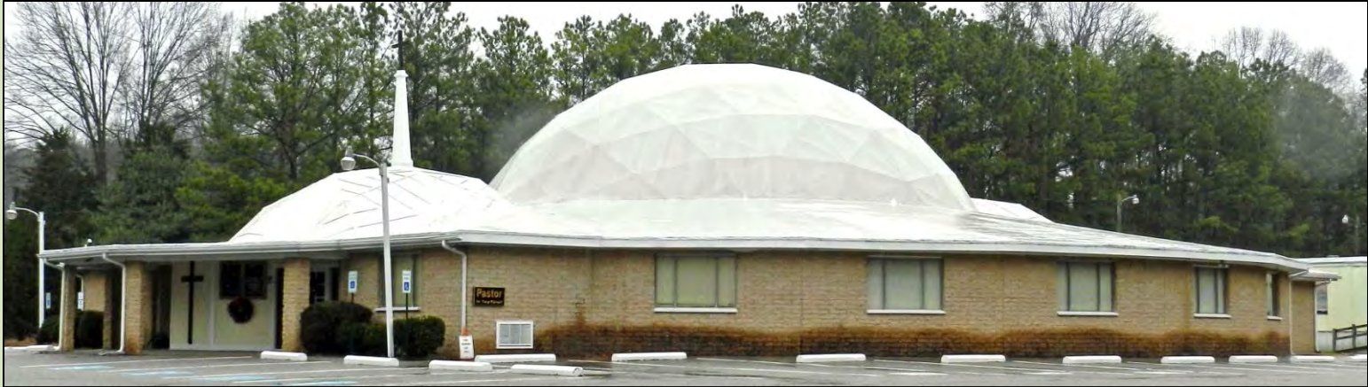
Buford Road Baptist Church, Chesterfield County, VA