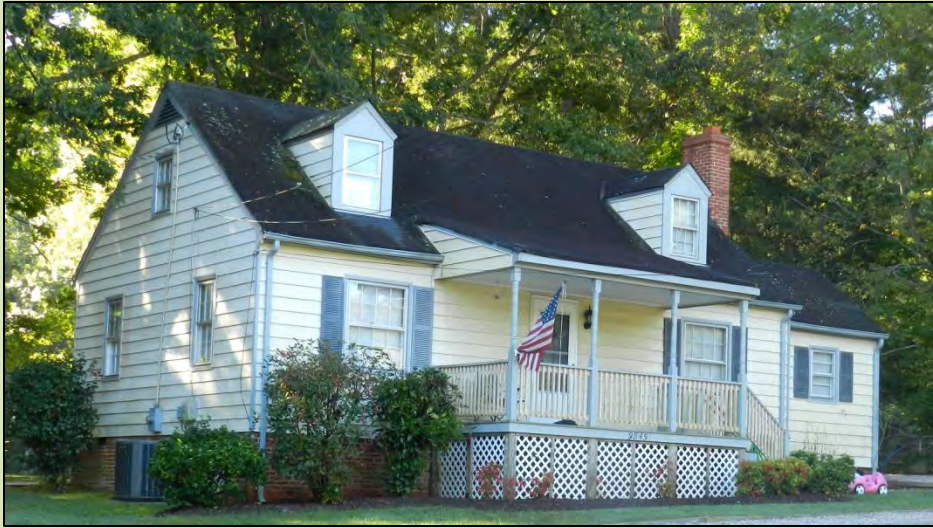
Chesterfield County, VA