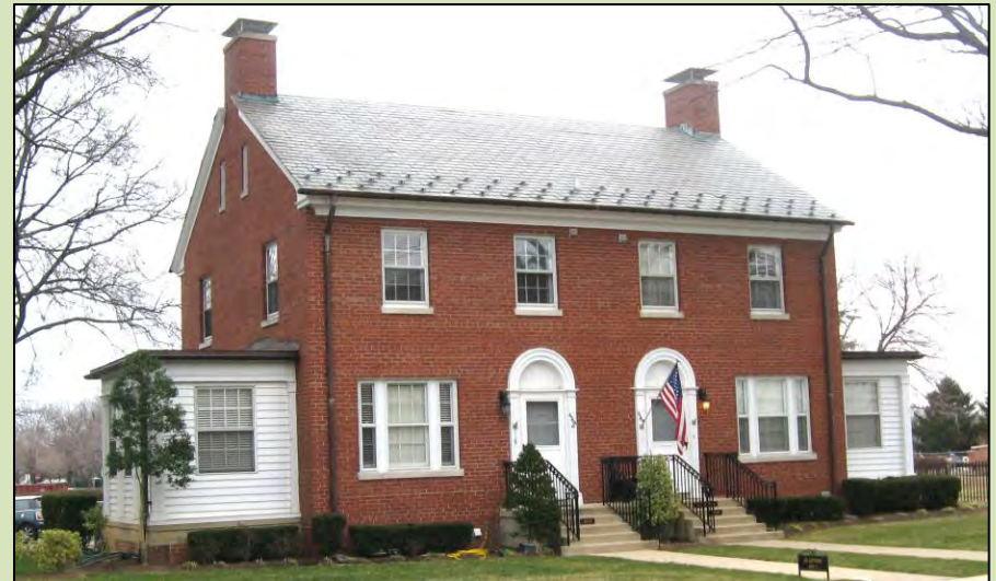
Officer's Quarters 6, ca.1895, Arlington, VA (from Fort Meyer Historic District National Register nomination form)