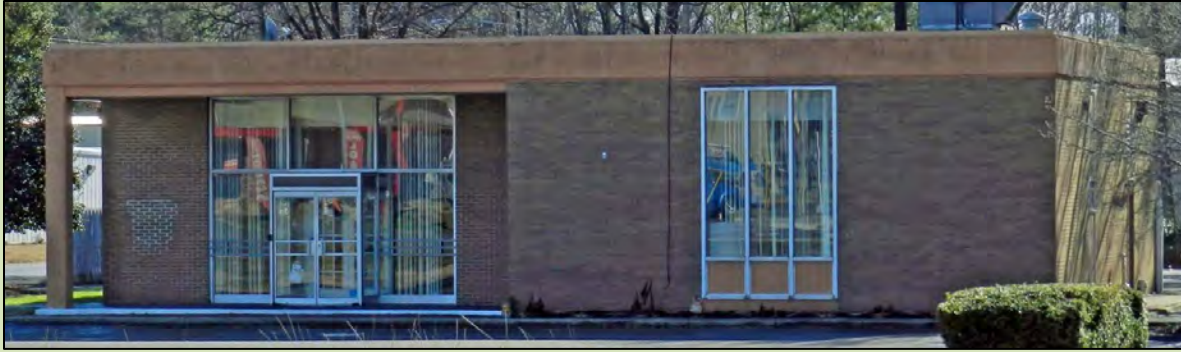
An individual office Building, Richmond, VA (photo by Lena McDonald , 2013)