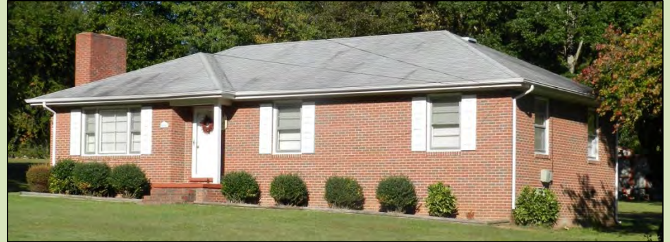
Hipped roof variation, Chesterfield County, VA