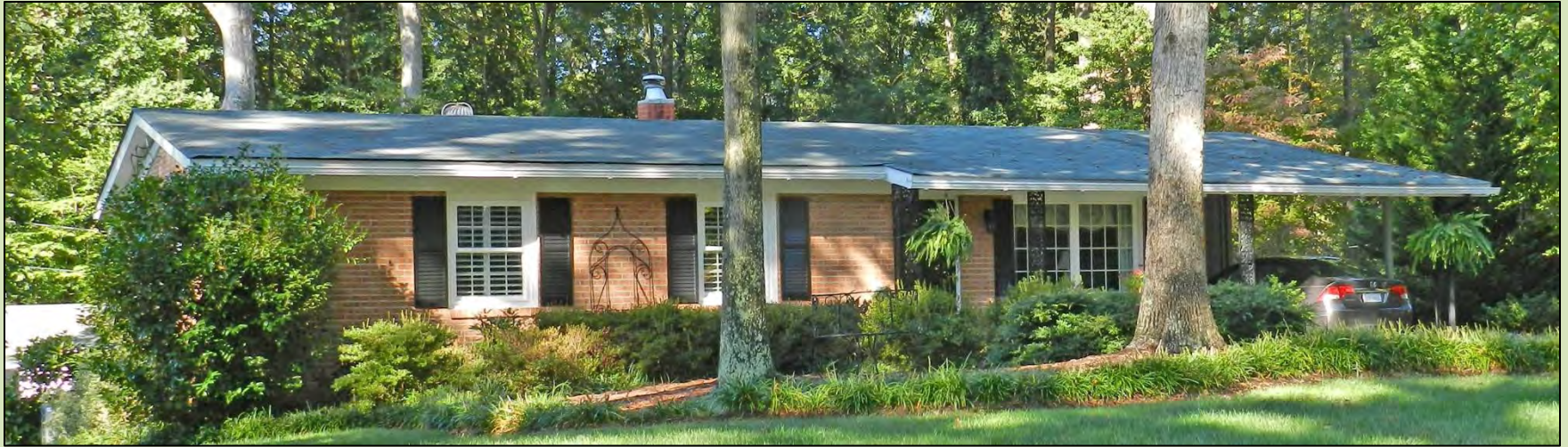
Ranch House with attached carport, Chesterfield County, VA (photo by Lena McDonald , 2013)