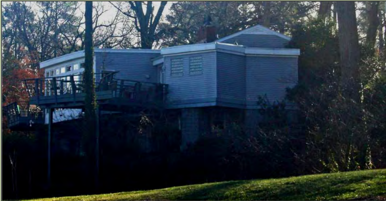
House on Riverside Drive, Richmond VA