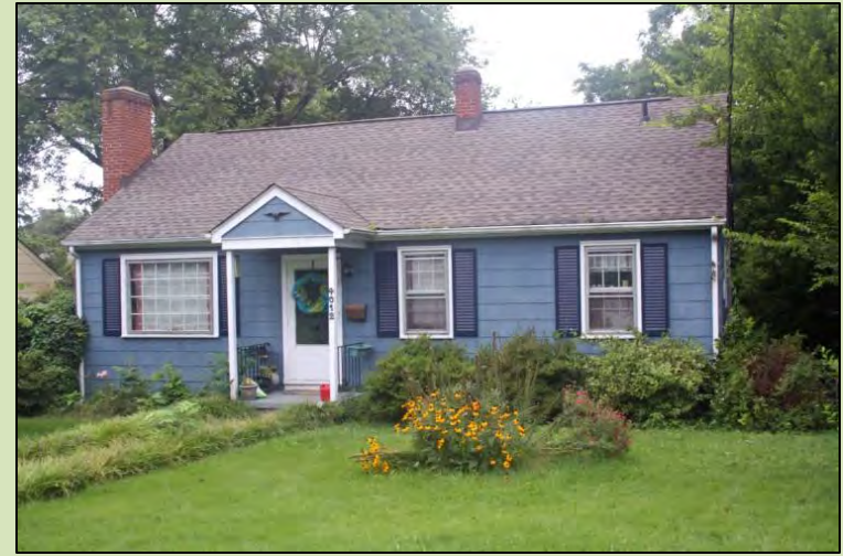
Richmond, VA

First appearing during the Great Depression, Minimal Traditional houses flourished in the late 1940s and early 1950s . Simple and economical, this style was particularly well-suited to large tract-housing developments which gained popularity after WWII.