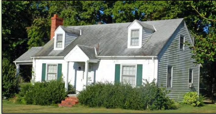
Chesterfield County, VA