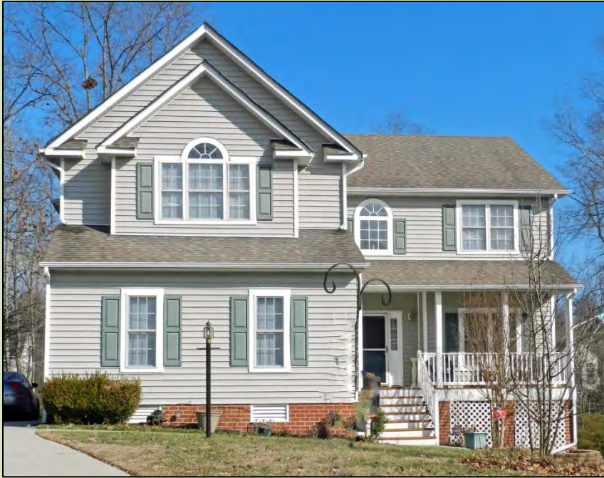
Chesterfield County, VA