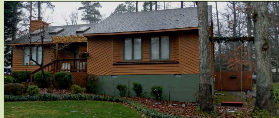
Chesterfield County, VA