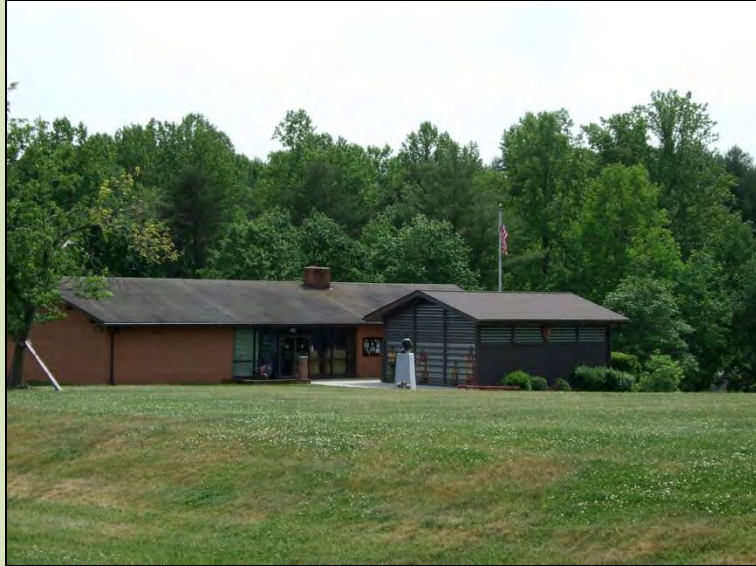
Booker T. Washington National Monument, Hardy, VA (Note: Central portion of building is original Mission 66 project; new wings have been added to the left and right)