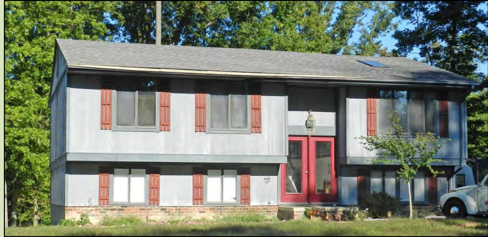
Chesterfield County, VA