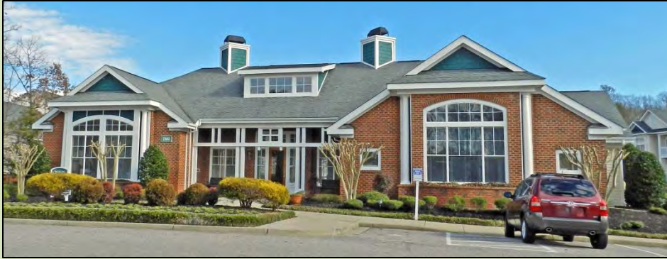
Office building, Chesterfield County, VA