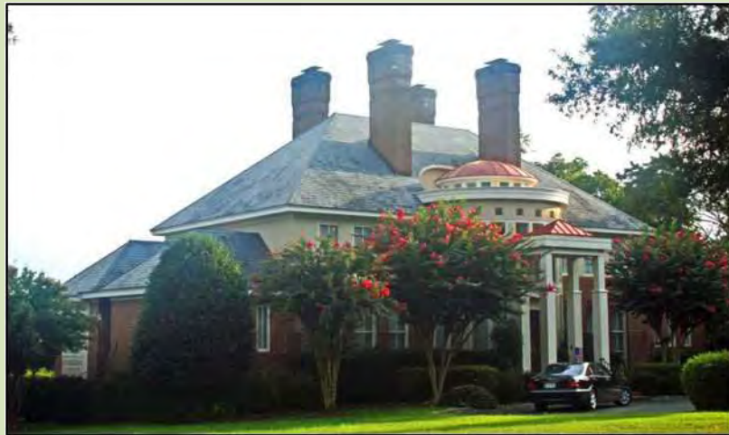
Henrico, VA (photo by Melina Bezirdjian , 2013)

Neo-Eclecticism draws from historic styles and details, but uses and combines them in non-traditional ways with modern materials such as vinyl and composites. Buildings are typically two or three stories high with two-bay garages. Roofs are high, vaulted and contain multiple gables or hips.