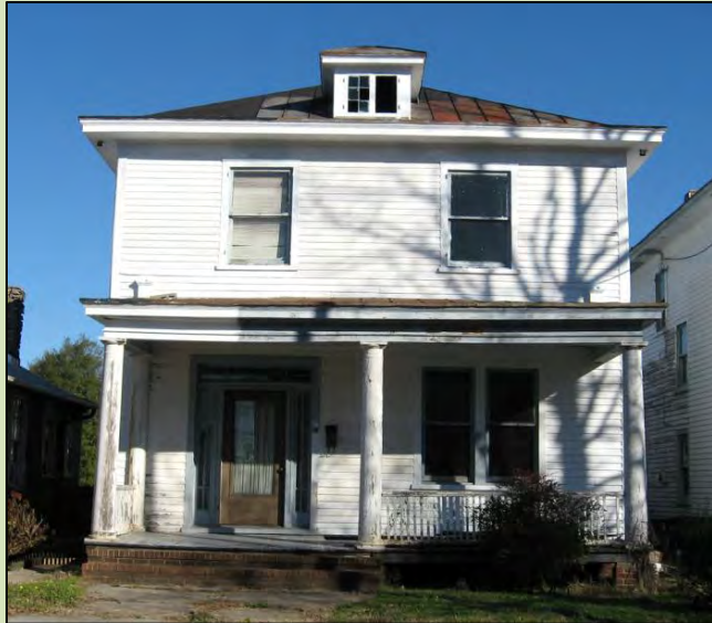
House, Ca. 1914, Petersburg, VA

Due to Virginia's colonial heritage, the Colonial Revival style is not only abundant throughout the state, it has influenced several other styles of the New Dominion period. Used primarily for houses, the Colonial Revival style is based on historic Georgian and Adamesque precedents, but grew to include a vocabulary of colonial and classical motifs. These could be combined in an almost limitless array ranging from vernacular to high style interpretations.