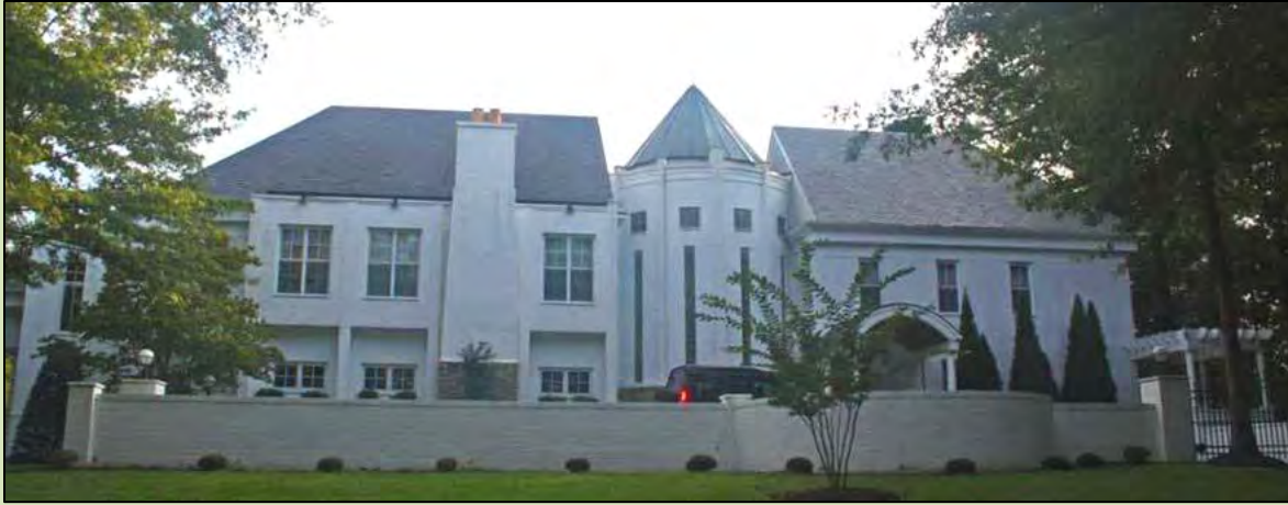
Henrico, VA