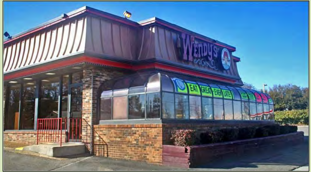
Metal Mansard roofs are a typical feature of the Wendy's chain. Richmond, VA