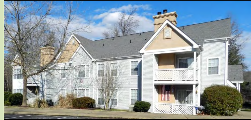
Multi-unit apartment building, Chesterfield County, VA