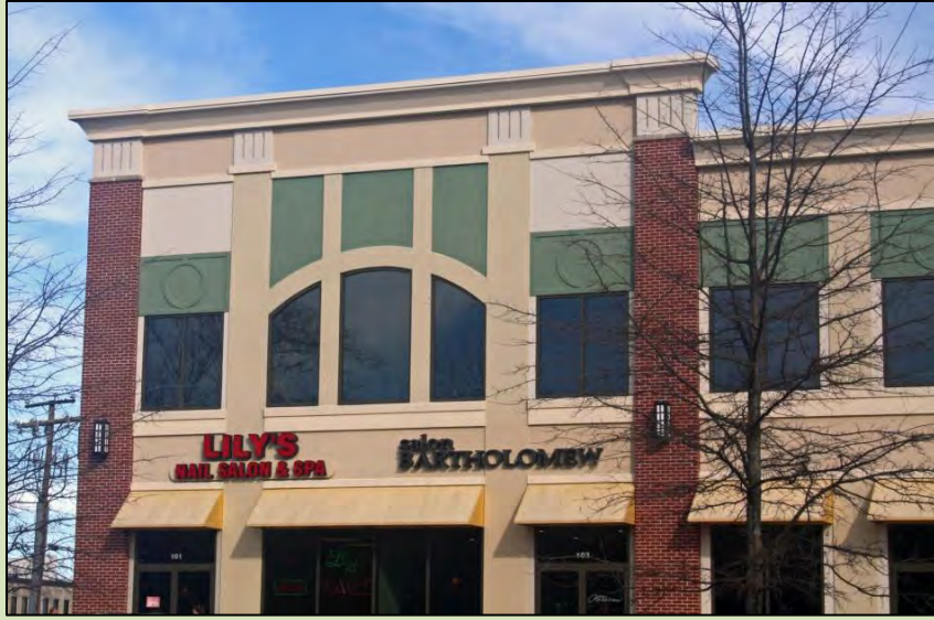
Two views of a Shopping Center near Willow Lawn, Henrico, VA