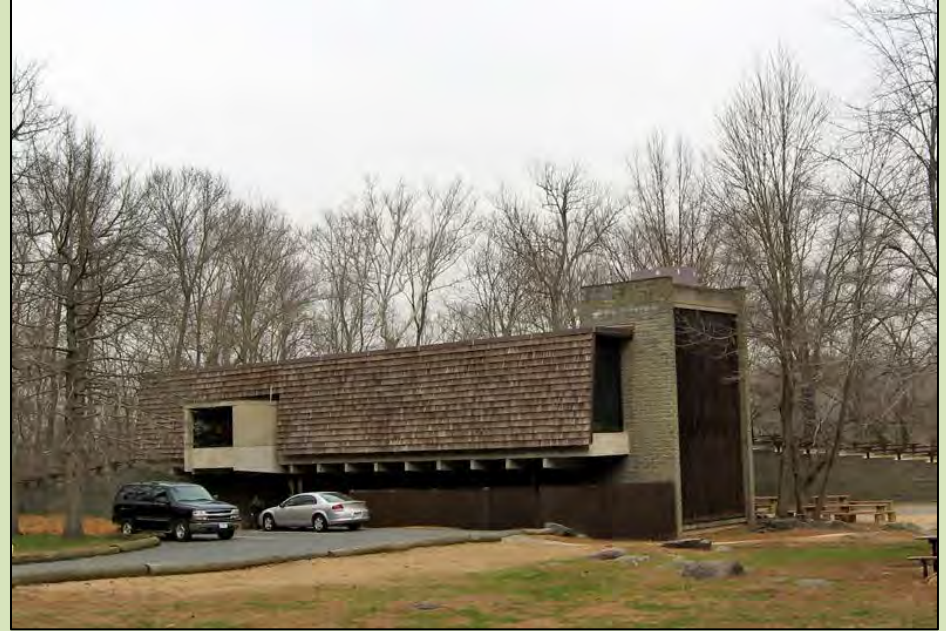
Great Falls Park Visitor Center, Fairfax County, VA