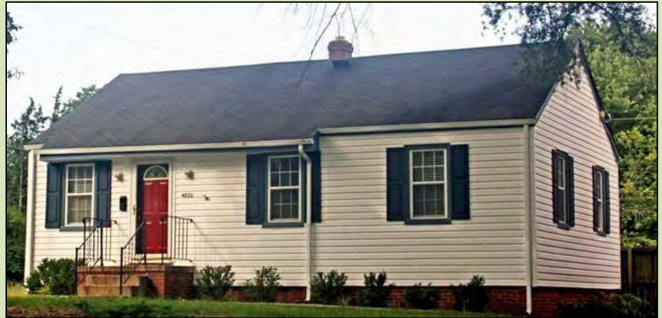
Richmond, VA