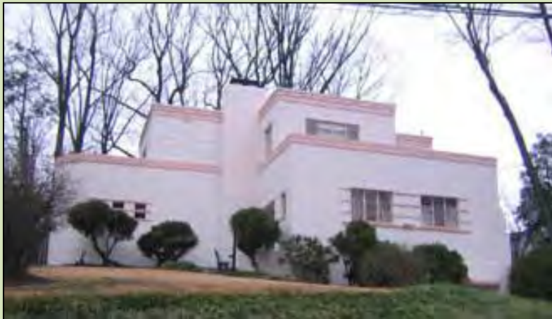
Rare example of Moderne house in Arlington County, VA (from Streamline Moderne Houses in Arlington County Multiple Property Documentation form)