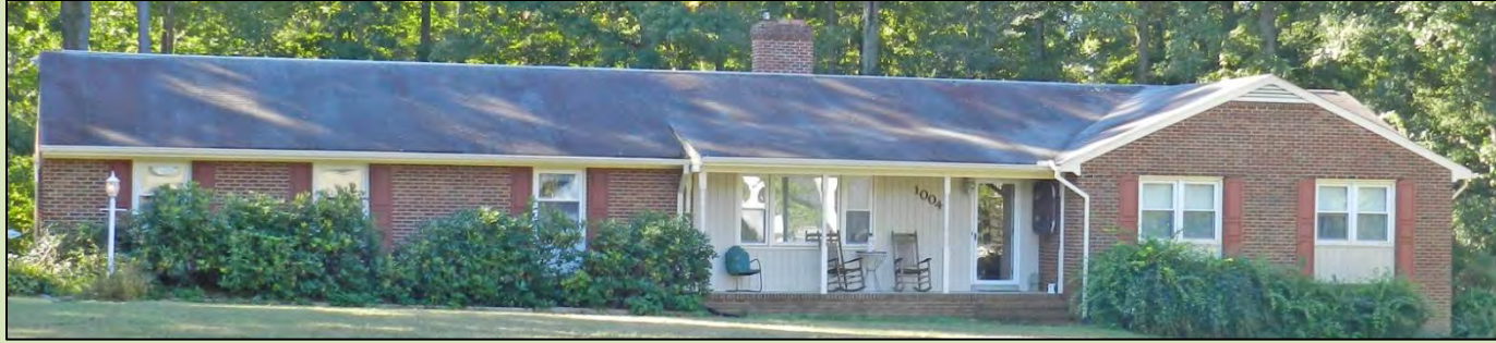
Ranch with an L-shaped plan, Chesterfield County, VA