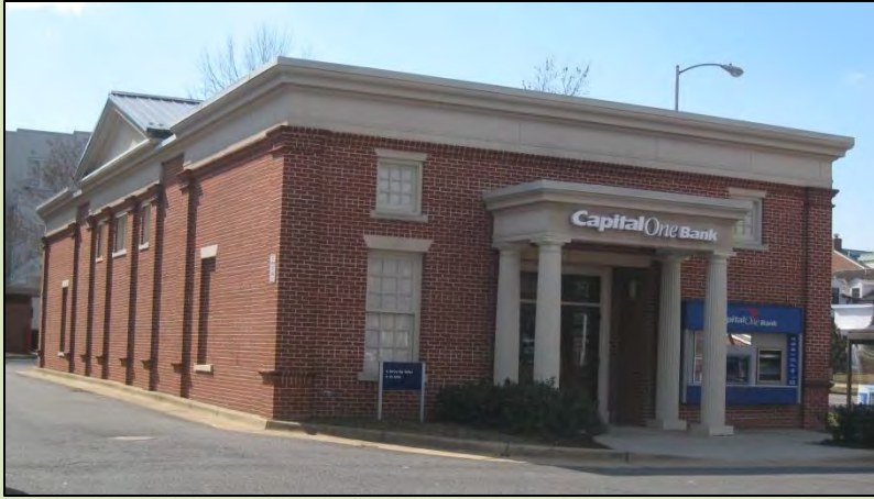
A Colonial Revival style bank built ca. 1990, Alexandria, VA

Colonial Revival houses constructed after World War II began to feature more stripped-down and economical interpretations of the style. Window and doors surrounds were simplified, shutters became fixed instead of operable, stylistic references all but disappeared from secondary elevations, and building forms and massing became more symmetrical. To a large extent, these simplifications were dictated by mass production, lighter materials, and accelerated construction schedules.