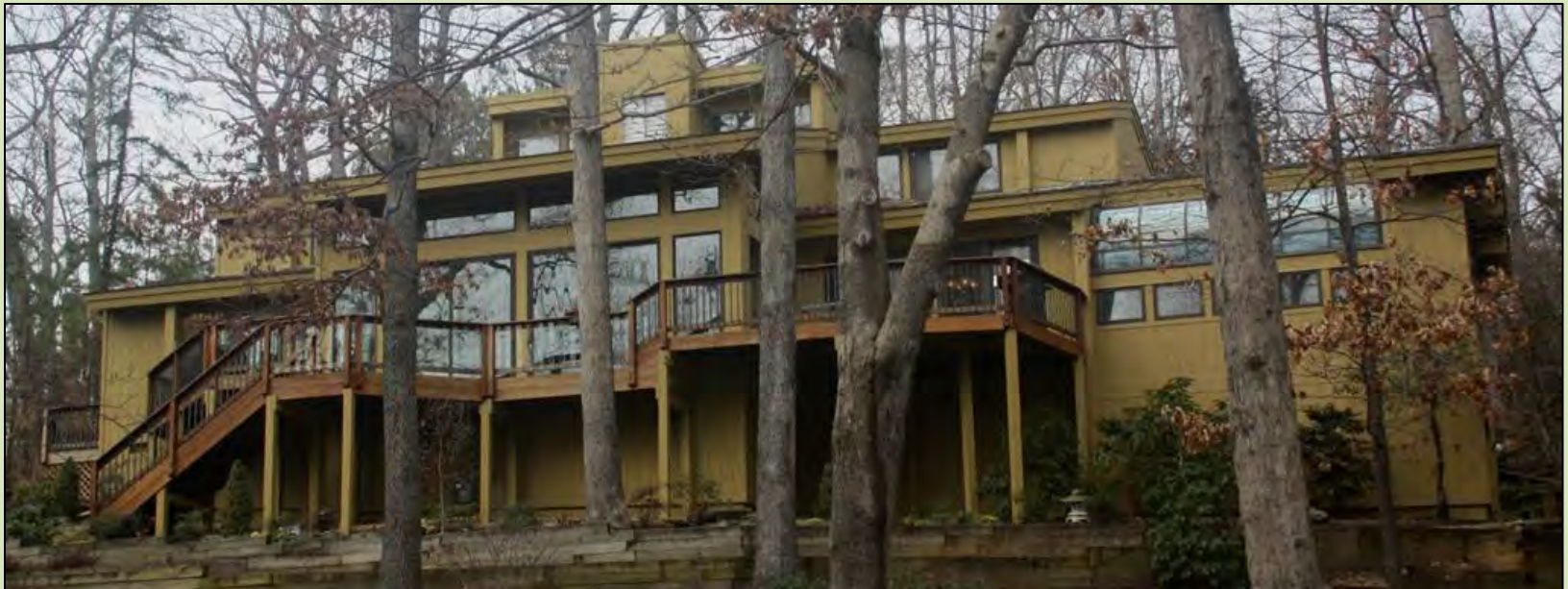
Flat roof subtype, Henrico, VA