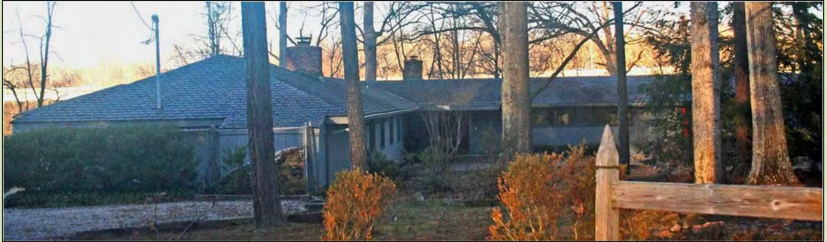
Ranch with L-shaped plan, Richmond, VA