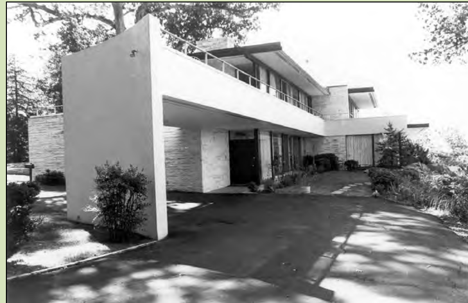
Rice House by Richard Neutra, Richmond, VA (from National Register nomination form)