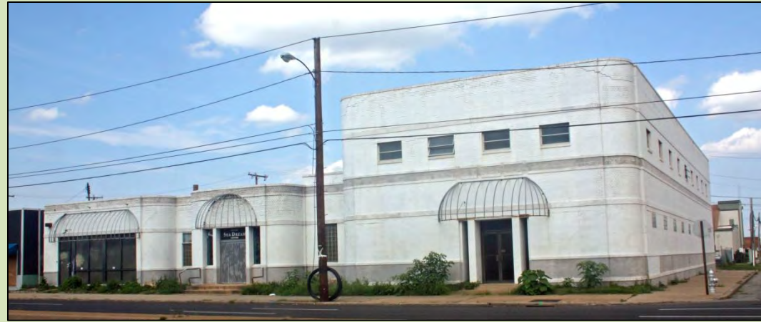
Richmond, VA (photo by Melina Bezirdjian, 2013)

An offshoot of Art Deco, the Moderne style incorporates elements of streamlined design originally developed for vehicles and aircraft. As a result, this style is also known as Streamlined Moderne . Primarily used for commercial architecture, the Moderne style was frequently used for movie theaters, Greyhound bus stations and diners.