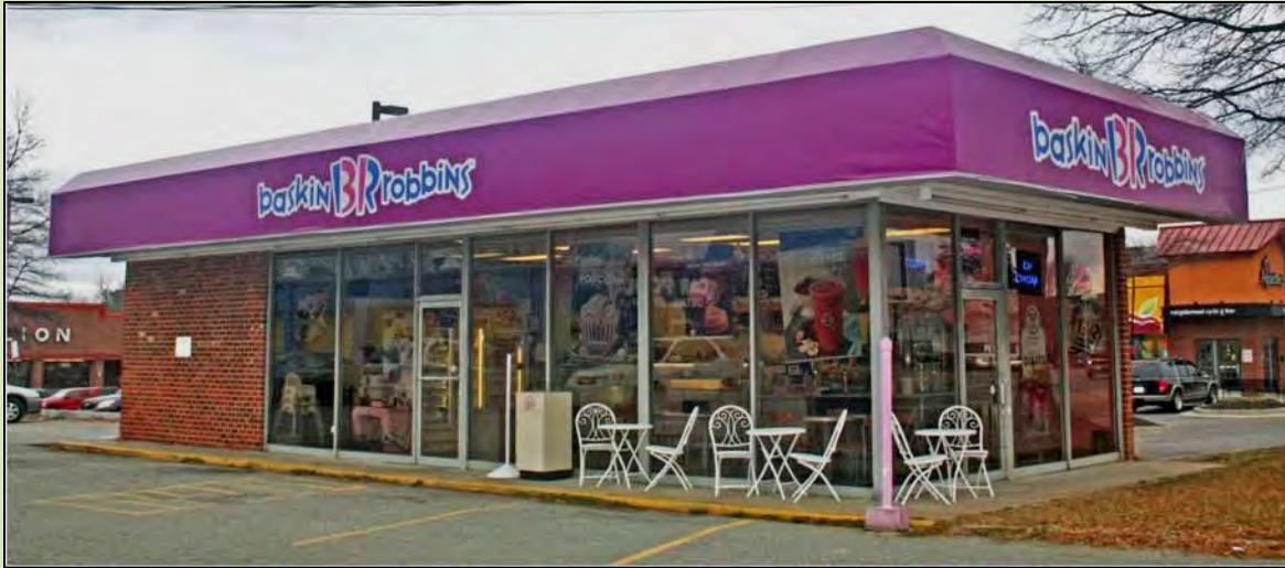
Baskin Robbins locations typically use small, rectangular plans with pink awnings. Henrico, VA (Photo by Melina Bezirdjian , 2014)