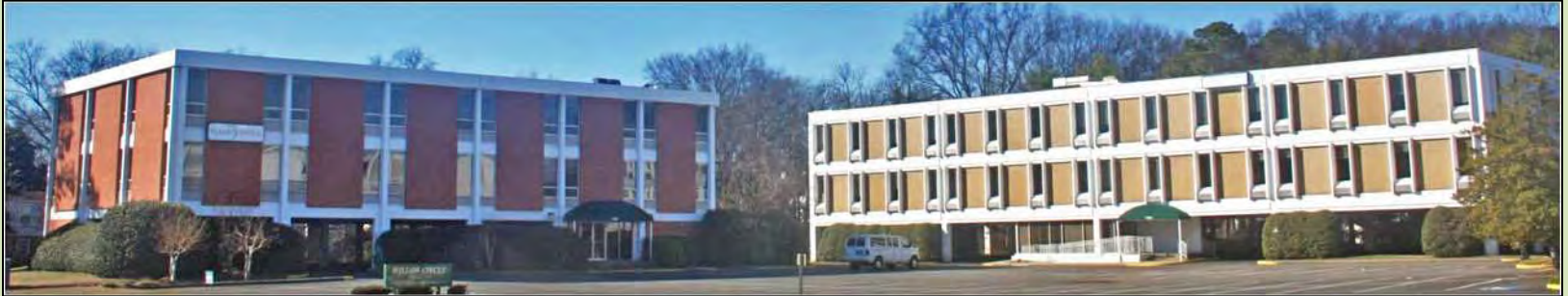
The Willow Circle office park, Henrico, VA