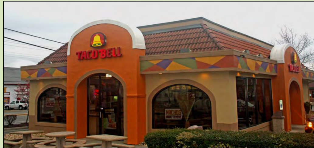
Taco Bell locations use arches, terra cotta shingle roofs, stucco siding and warm, bold colors to reflect the company's Southwestern identity. Richmond, VA (Photo by Melina Bezirdjian , 2014)