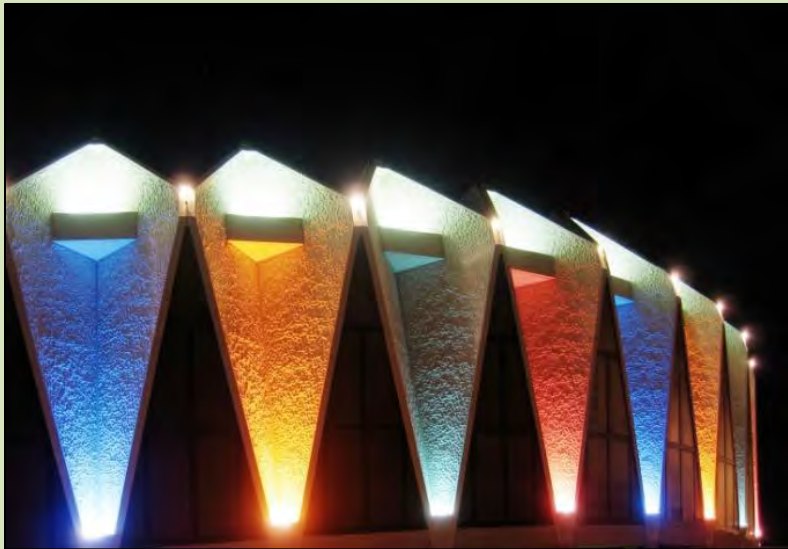
...and at night, Hampton, VA