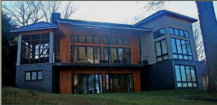
House on Riverside Drive, Richmond VA