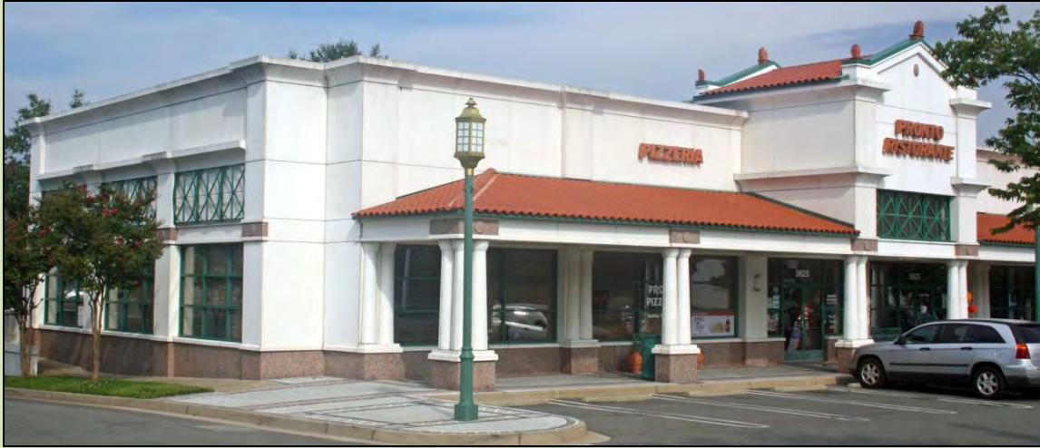
Three views of Libbie Place Shopping Center, Henrico, VA