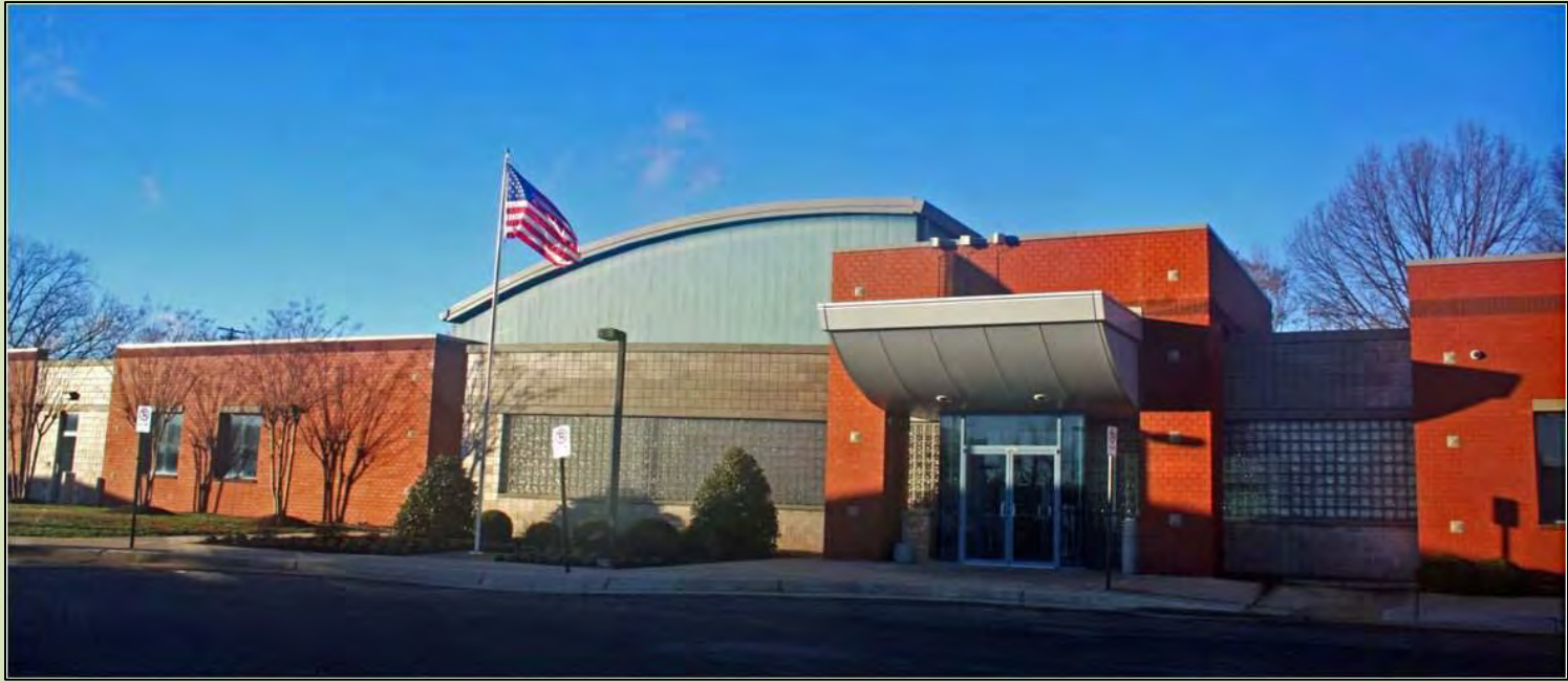
Richmond Ambulance Authority, Richmond, VA