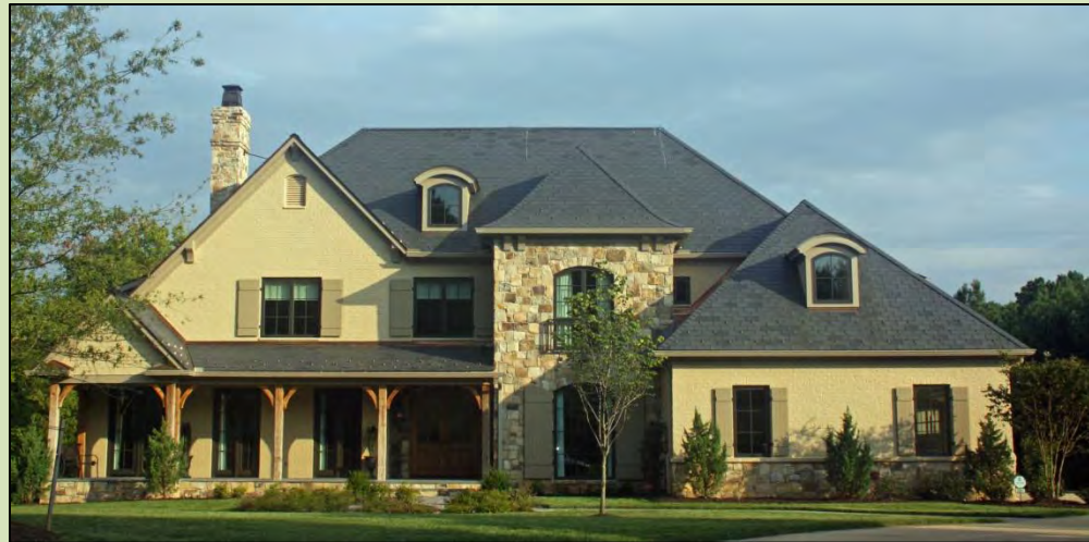
Rustic influence, Henrico, VA (photo by Melina Bezirdjian , 2013)