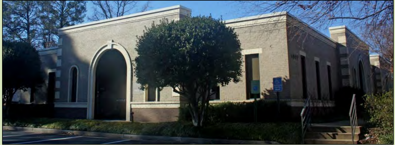
Richmond, VA