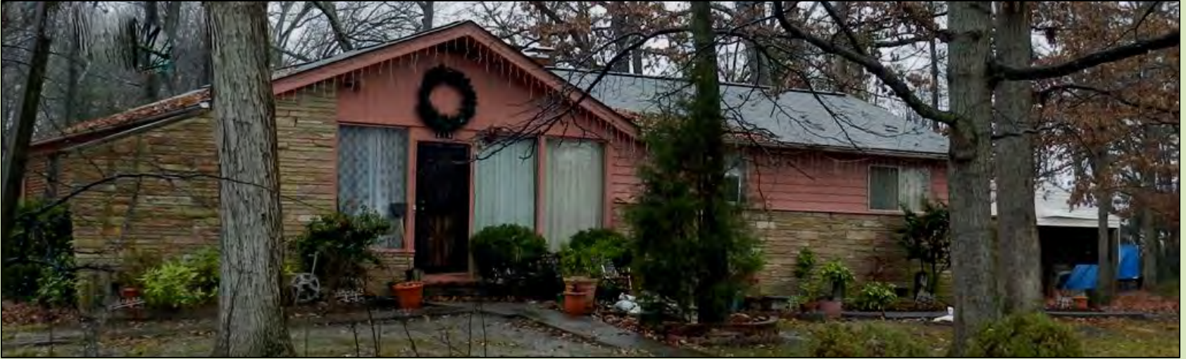
Gabled roof subtype, Chesterfield County, VA – also note the wing wall on the left side, extending beyond the side elevation's plane