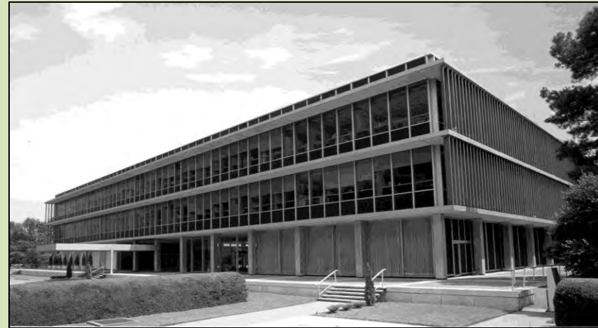
Reynolds Metal Corporation Headquarters, Henrico, VA (from National Register nomination form)