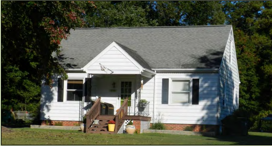
Chesterfield County, VA