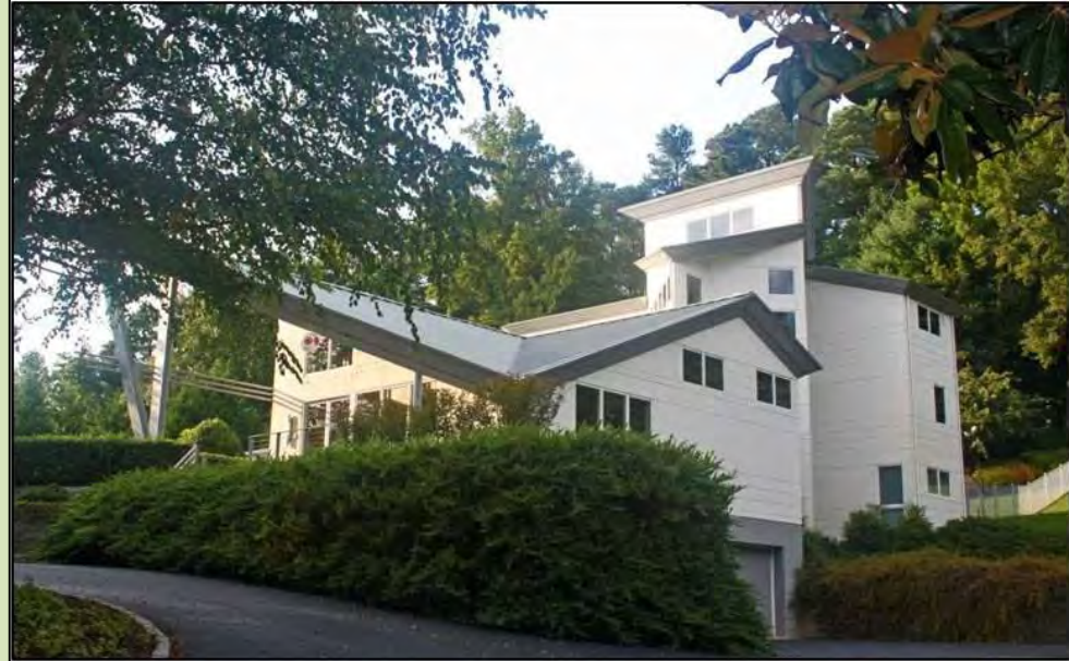
Rare example of a Neo-Expressionist house, Henrico, VA