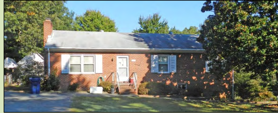
Chesterfield County, VA