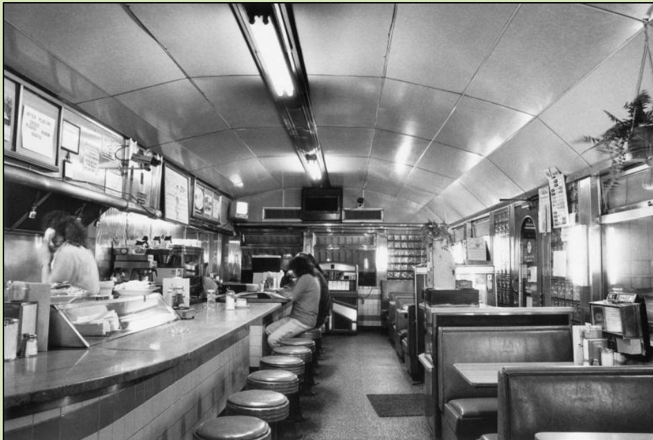
Exterior and interior views of the Tastee 29 Diner, Fairfax, VA