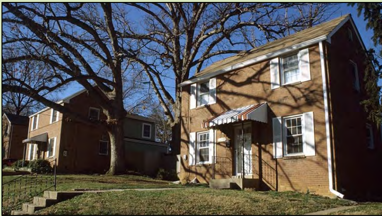
Two Colonial Revival style houses built ca. 1947, Arlington, VA

Colonial Revival houses constructed after World War II began to feature more stripped-down and economical interpretations of the style. Window and doors surrounds were simplified, shutters became fixed instead of operable, stylistic references all but disappeared from secondary elevations, and building forms and massing became more symmetrical. To a large extent, these simplifications were dictated by mass production, lighter materials, and accelerated construction schedules.