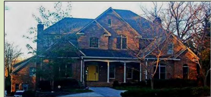
Richmond, VA