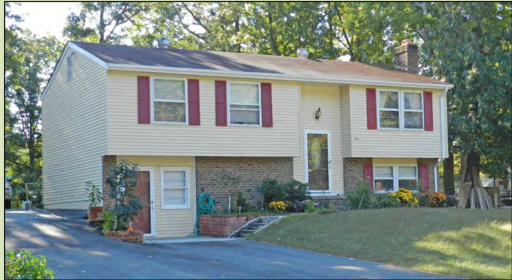
Chesterfield County, VA