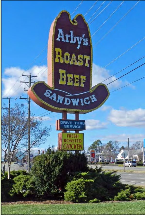
Typical Arby's Signage used in the 1950s, Chesterfield County, VA