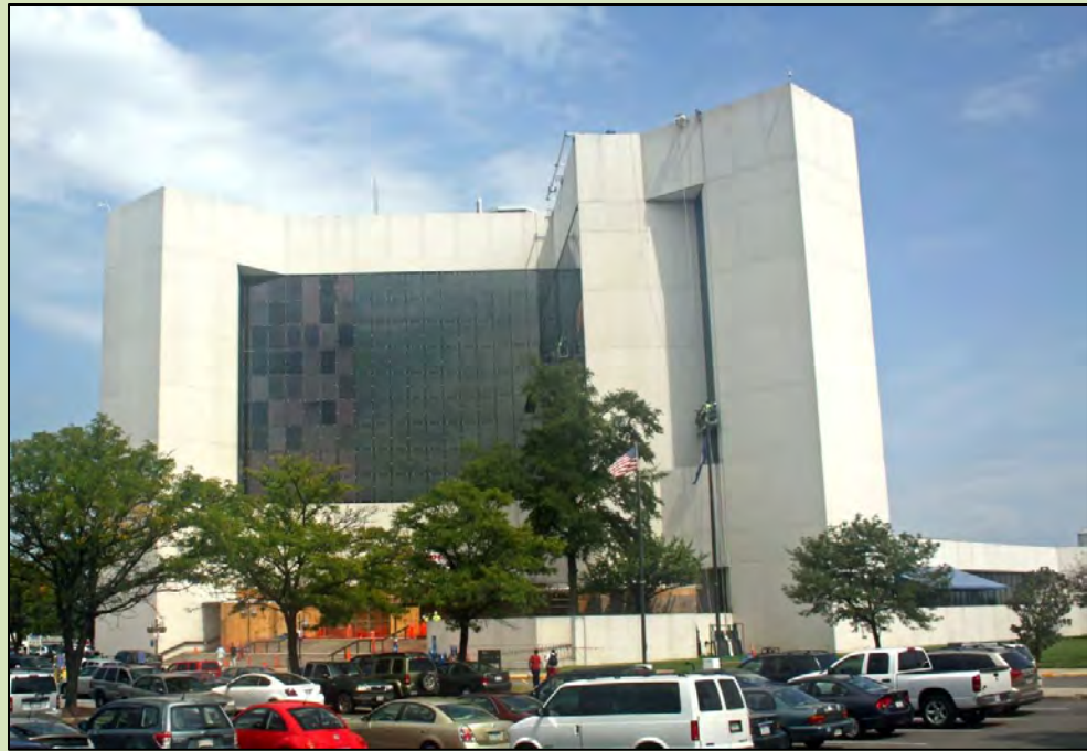
Department of Motor Vehicles, Richmond, VA (2013)