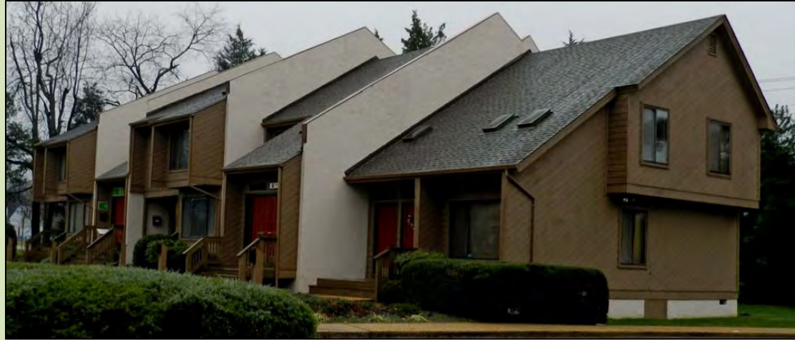
Office buildings, Midlothian, VA