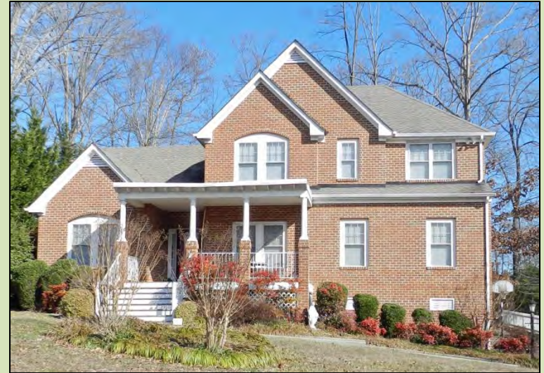
Chesterfield County, VA