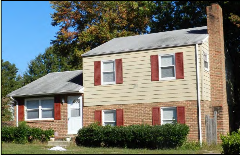
Chesterfield County, VA