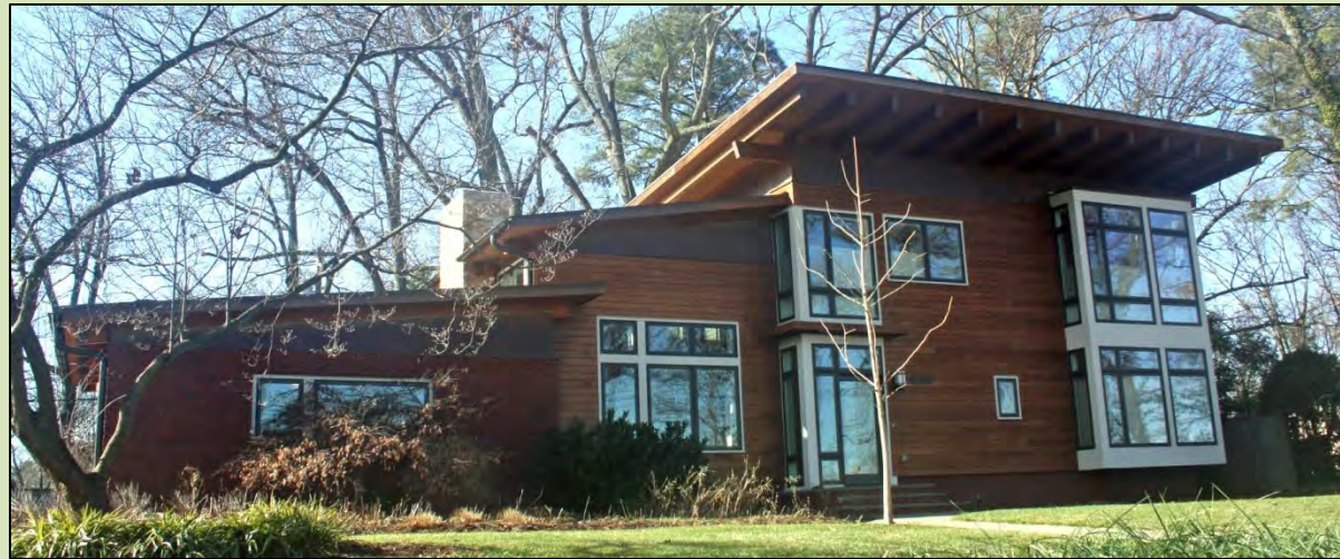
House on Riverside Drive built 1954, Richmond VA