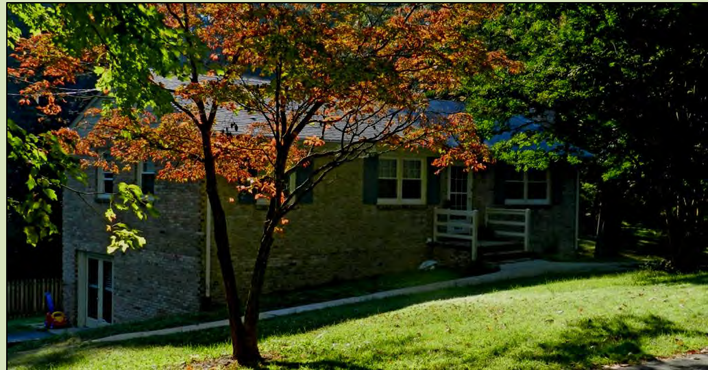
Chesterfield County, VA