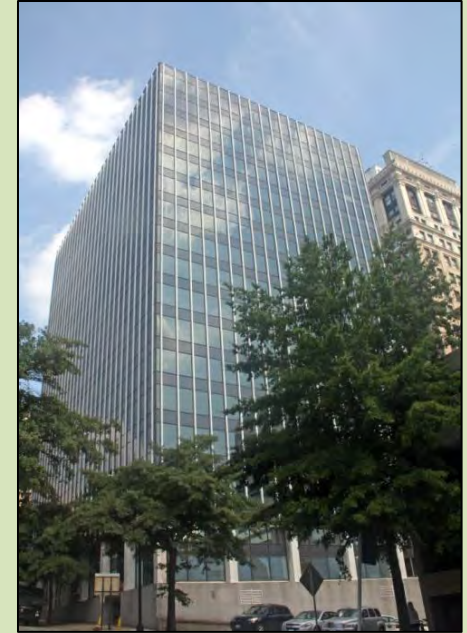
Richmond, VA