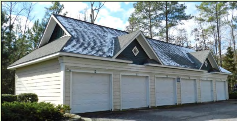
Multi-unit garage, Chesterfield County, VA