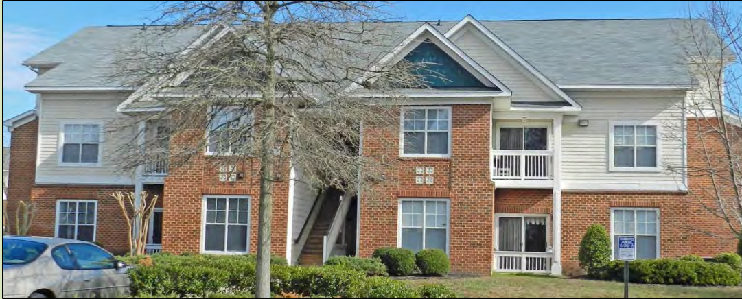
Multi-unit apartment building, Chesterfield County, VA (photo by Lena McDonald, 2014)