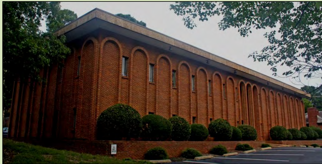
Richmond, VA (2013)