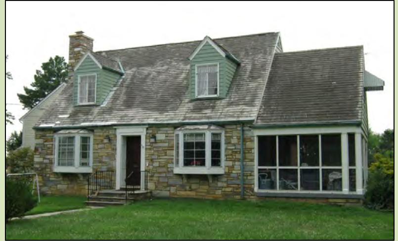
Arlington County, VA

Based on the traditional houses of Colonial New England, the Cape Cod Cottage is a simple, one-and-one-half-story house often considered a subset of the Colonial Revival style. Cape Cod Cottages were extremely popular in post WWII suburbs such as Levittown. Unlike their colonial models, the Cape Cod Cottage is stripped of ornament and often mass-produced.