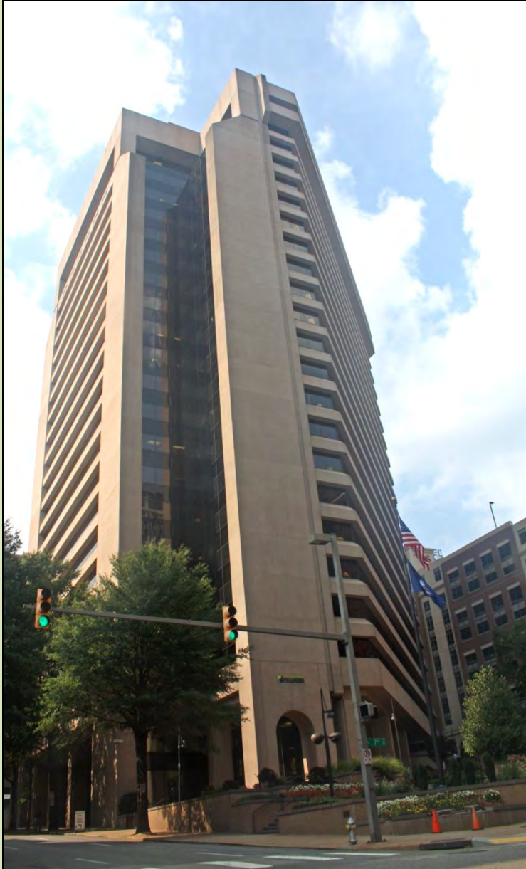
Greater Richmond Chamber, Richmond, VA