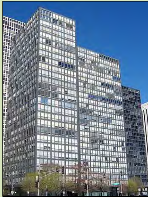
Lakeshore Drive by Mies van der Rohe, Chicago, IL (photo © Jeremy Atherton, 2006)