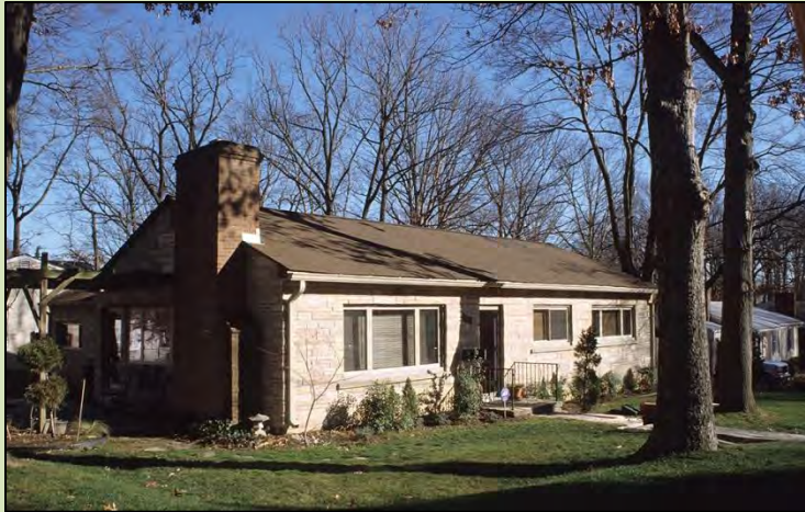
Virginia Heights Historic District, Arlington County, VA (from National Register nomination form , 2013)