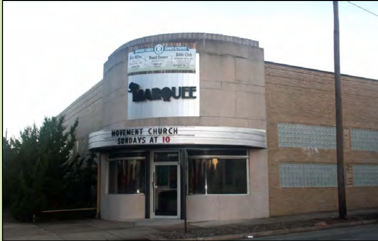
Richmond, VA