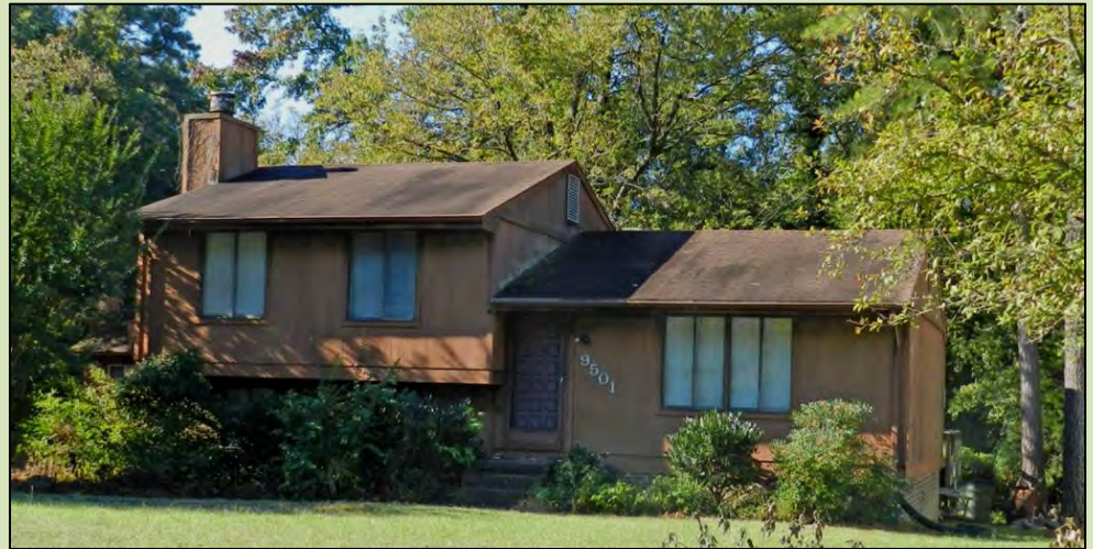
Chesterfield County, VA