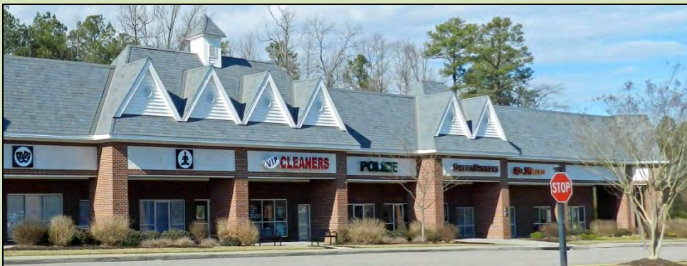
Shopping center in Chesterfield County, VA