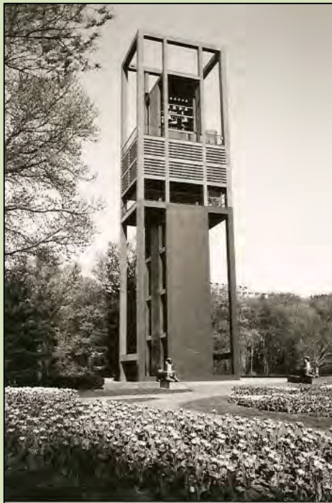
Arlington Ridge Park Memorial, Arlington, VA