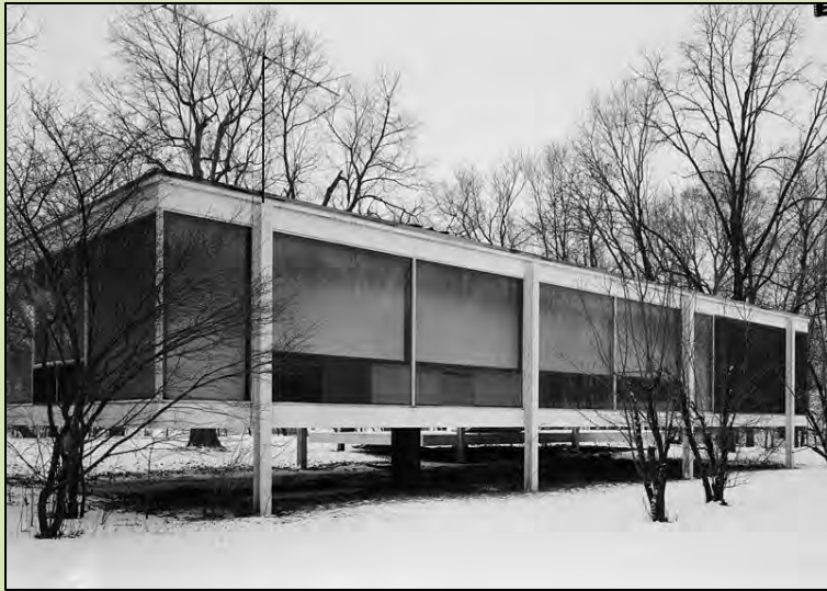
Farnsworth House by Mies van der Rohe, Plano, IL