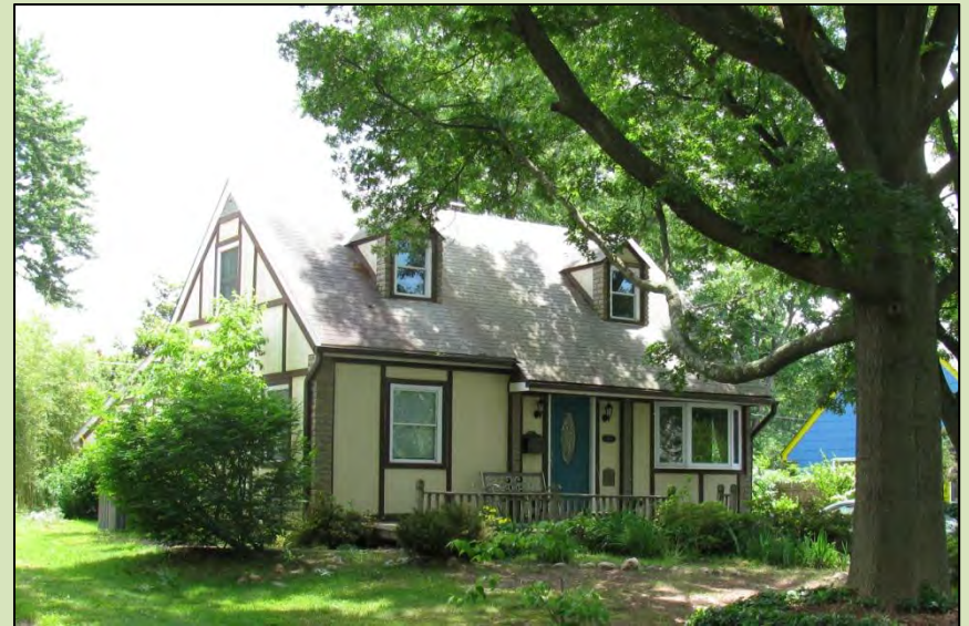
Fairfax County, VA