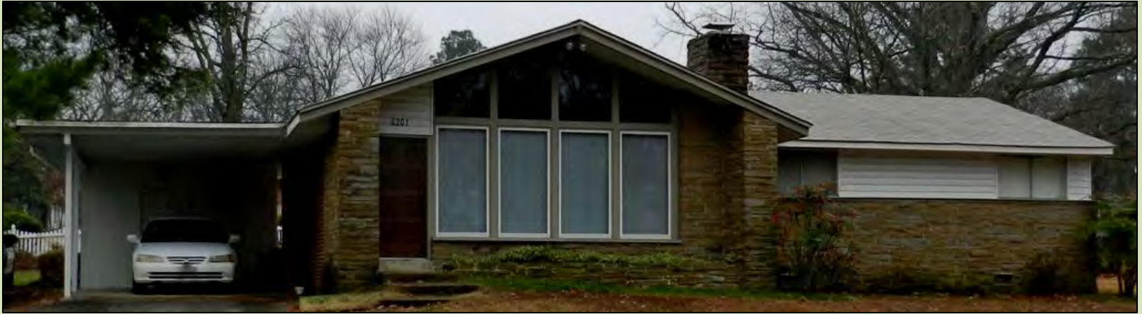
Gabled roof subtype, Chesterfield, County VA