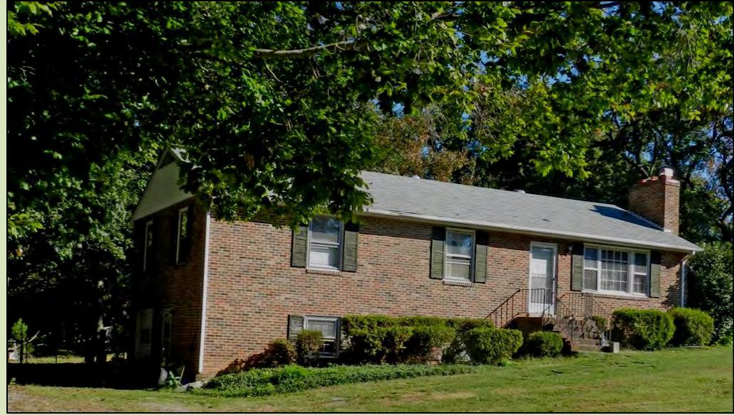
Chesterfield County, VA