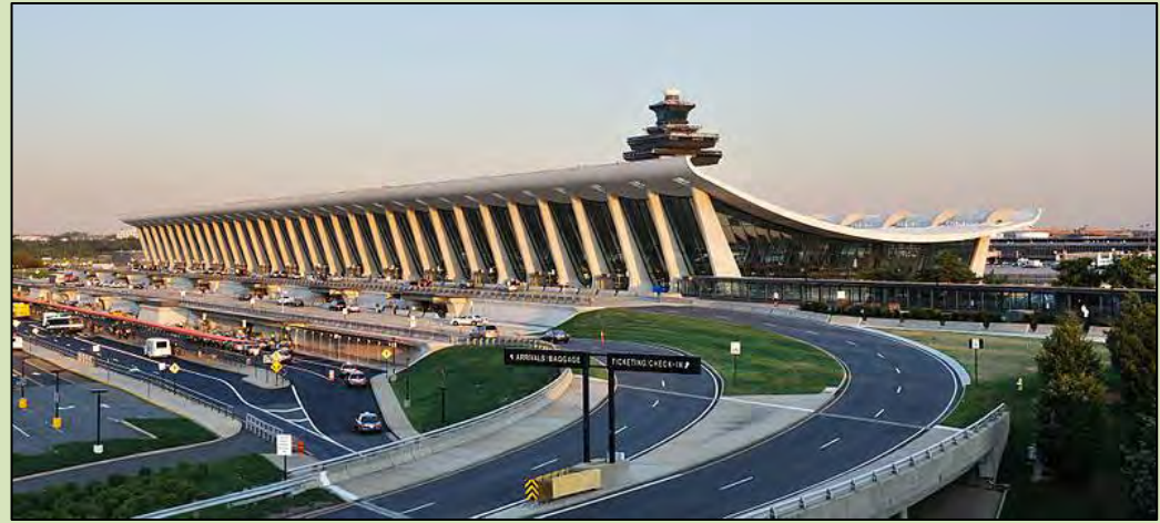
Dulles International Airport by Eero Saarinen

Although it has roots in early 20 th -century Expressionism, Neo-Expressionism is not merely a continuation of an earlier style. Rejecting the tenets of Modernism, Neo-Expressionism seeks to convey meaning on an emotional level directly through the architectural form itself. This style is mostly used for public or religious buildings.