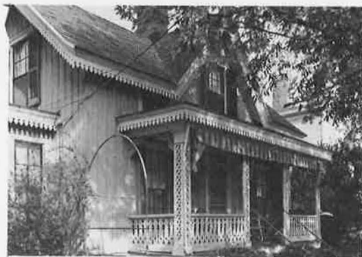
Boykin House, Smithfield

HICKORY NECK CHURCH, JAMES CITY COUNTY: This tiny brick building, the remaining portion of the Lower Church of colonial Blisland Parish, was reconsecrated in 1907 following prolonged service as an Academy.