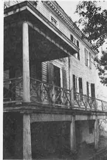
Todd House, Smithfield

YORKTOWN WRECKS ARCHAEOLOGICAL SITE, YORK COUNTY: This site includes the underwater remains of those British warships, transports, and assorted boats sunk off Yorktown during the siege of 1781.