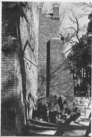
Test Trench at Jamestown Church Tower