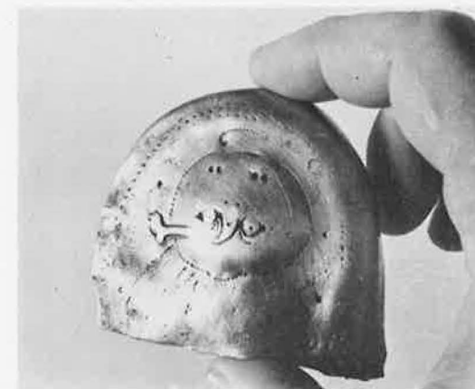
Copper tobacco can lid embossed with an owl smoking a mid-seventeenth century style pipe found at the bottom of a seventeenth century well on the Pettus' Plantation at Kingsmill.

a porch or shed to the west. Two additional post buildings, one with a cellar, were found to the west along with the brick-lined well, abandoned ca. 1690. The two outbuildings will be more fully explored in the spring.