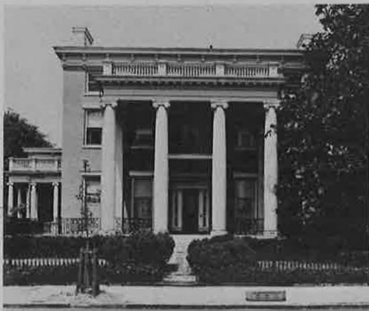
Kent-Valentine House, Richmond

*KENT-VALENTINE HOUSE, RICHMOND: Successively the home of two prominent Richmond families, the Kent-Valentine house was built in 1845 with the portico and other extensive alterations being added in 1904. The house and grounds, now the headquarters for the Garden Club of Virginia, recall the grandeur of old Franklin Street.