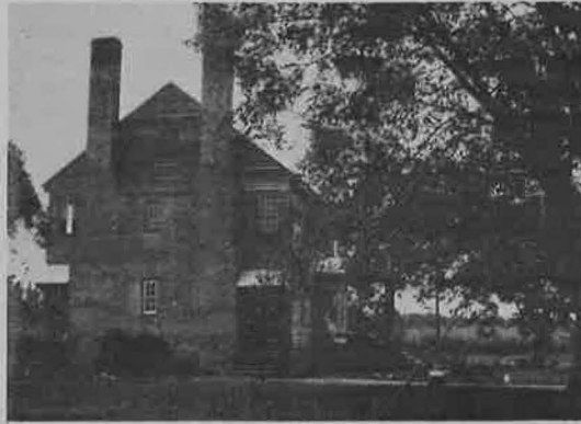
Chester, Sussex County

*CHESTER, SUSSEX COUNTY: This unusually-large, 18th-century farm dwelling has well-preserved interior woodwork, and an, all but unique, set of massive coupled-exterior chimney stacks.