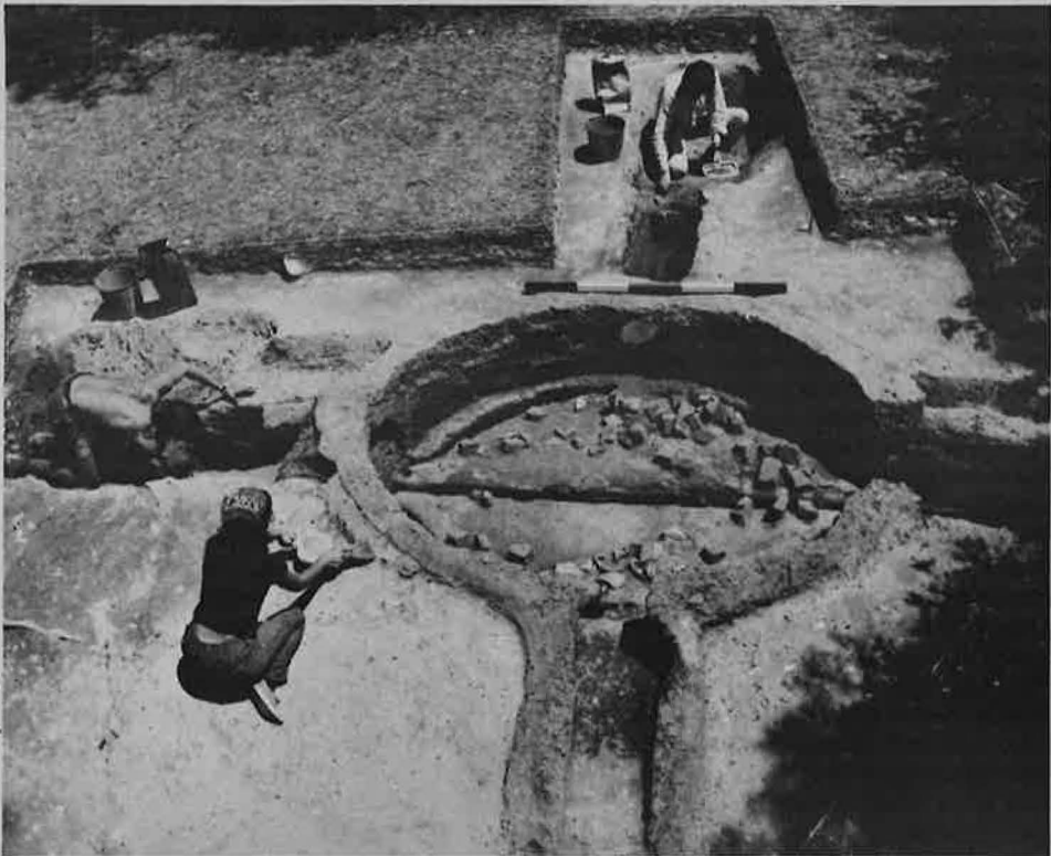
VHLC Excavation of Morgan Jones Kiln (Circa 1677), Westmoreland County, story on page 11.

VIRGINIA HISTORIC LANDMARKS COMMISSION Morson's Row 221 Governor Street Richmond, Virginia 23219