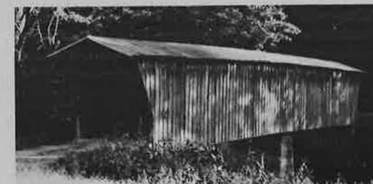
Bob White Covered Bridge, Patrick County

BOB WHITE COVERED BRIDGE, PATRICK COUNTY: This especially fine, eighty feet long, oaken-timbered structure is, with Meems Bottom Bridge in Shenandoah County, the last of Virginia's covered bridges still in service as part of the State Highway system.