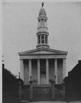
Petersburg Court House

PETERSBURG COURT HOUSE: Constructed between 1838 and 1840 after the eclectic design of the prominent New York architect Calvin Pollard, the Classical Revival Courthouse has long been a prominent and visually-pleasing landmark of downtown Petersburg.