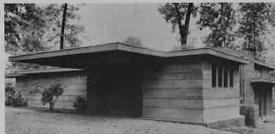
Pope-Leighey House, Fairfax County

*POPE-LEIGHEY HOUSE, FAIRFAX COUNTY: A monument in domestic architecture to the egalitarian, democratic faith of Frank Lloyd Wright, the Pope-Leighey House was an example of Wright's Usonian-style dwellings designed to be dignified yet practical and economical.