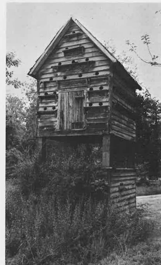
"Dovecote at Hickory Hill, Hanover County"

The Society of the Descendants of Peter Francisco has acquired a 99-year lease on the PETER FRANCISCO HOUSE (formerly Locust Grove), Buckingham County. The Society plans to restore the home of this folk hero of the Revolutionary War era.