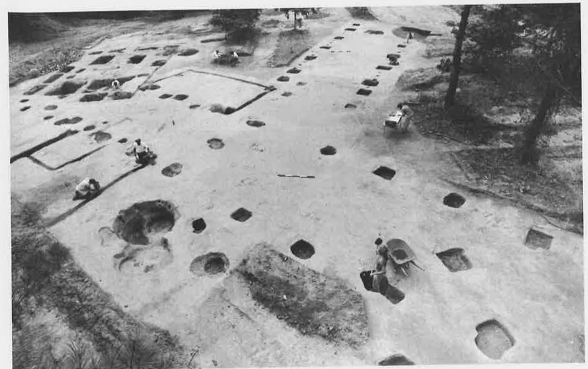
"Post Holes indicating lines of 17th & 18th century structures at Kingsmill"

The eighteenth-century riverport village of Hanover Town (see Virginia Register section in this issue of Notes) along with the Governor's Land Archaeological District discussed in the last issue of Notes are examples of the significant archaeological complexes that the VHLC is eager to locate and preserve until competent excavation can be undertaken.