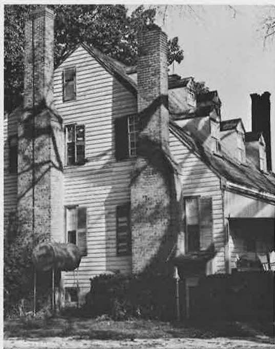
"Wolftrap Farm, Isle of Wight County"

WESTERHOUSE HOUSE, NORTHAMPTON COUNTY: Although in a state of advanced deterioration, this compact farmhouse remains an outstanding and exceptionally rare example of Stuart-period Southern vernacular architecture. The massive exterior end pyramidal chimney with its steeply sloped tiled weatherings is an interesting regional feature.