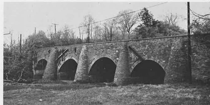
"Goose Creek Stone Bridge, Loudoun County"