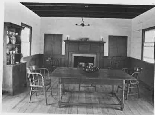
CARTER'S TAVERN, HALIFAX COUNTY: Long a familiar landmark on historic and scenic River Road, Carter's Tavern is a handsomely restored example of an early Southside Virginia ordinary.

MILEY SITE, SHENANDOAH COUNTY: A Late-Woodland Indian village of significant size existed at this site. Archaeological test excavations provide evidence of a palisade upperwards of 250' in diameter.