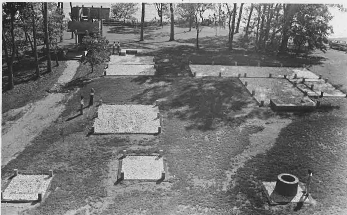
"Park at Pettus Site"

The Richmond Educational Television station WVEC is currently producing a half-hour program on the archaeology at Kingsmill. Excavation of the Colonel Thomas Pettus site (1972-73) and the first phase of the recently concluded work near the Kingsmill mansion site will be featured. The Kingsmill developers, Busch Properties, Inc., have finished construction of a park at the Pettus site which provides for the preservation and display of archaeological remains indicating the outlines and arrangement of house and outbuildings (see photograph). Preservation and integration into the development scheme of such materials is another important byproduct of the VHLC-developer program at Kingsmill.