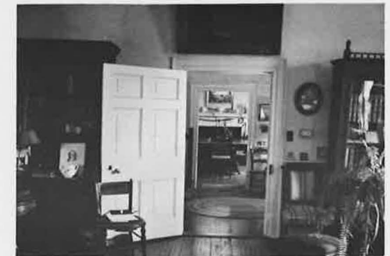
"An Old Virginia Plantation House: Meadow Farm, Henrico County"