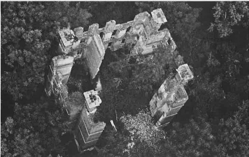
"A Classical Ruin, Gloucester County – see lead article"

VIRGINIA HISTORIC LANDMARKS COMMISSION Morson's Row 221 Governor Street Richmond, Virginia 23219