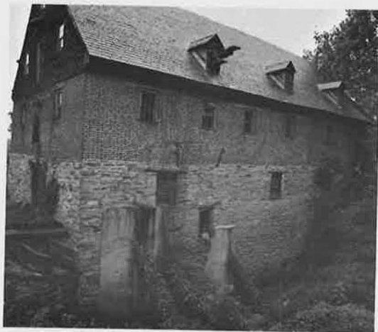
"Muddy Creek Mill, Cumberland County"