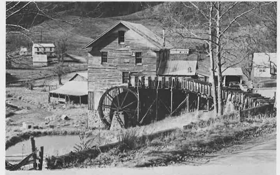
"White's Mill, Washington County"

Archaeological sites, particularly colonial sites in the Alexandria-Richmond-Hampton Roads corridor are the most fragile of historic and cultural resources. The Commission, through its Office of Archaeology (see pages 14-15 of this issue of Notes) has undertaken a survey, with selected test and salvage excavations, of archaeological sites throughout the Commonwealth. Co-operation between Busch Properties, Inc. and the Landmarks Commission has transferred the development of the Kingsmill Plantation tract near Williamsburg into one of the single most significant archaeological digs in progress anywhere in America, and also into a classic example of how large-scale development can take place without sacrificing cultural resources.