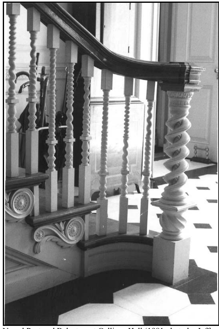
Figure 5. Detail of Staircase Newel Post and Balusters at Gallison Hall