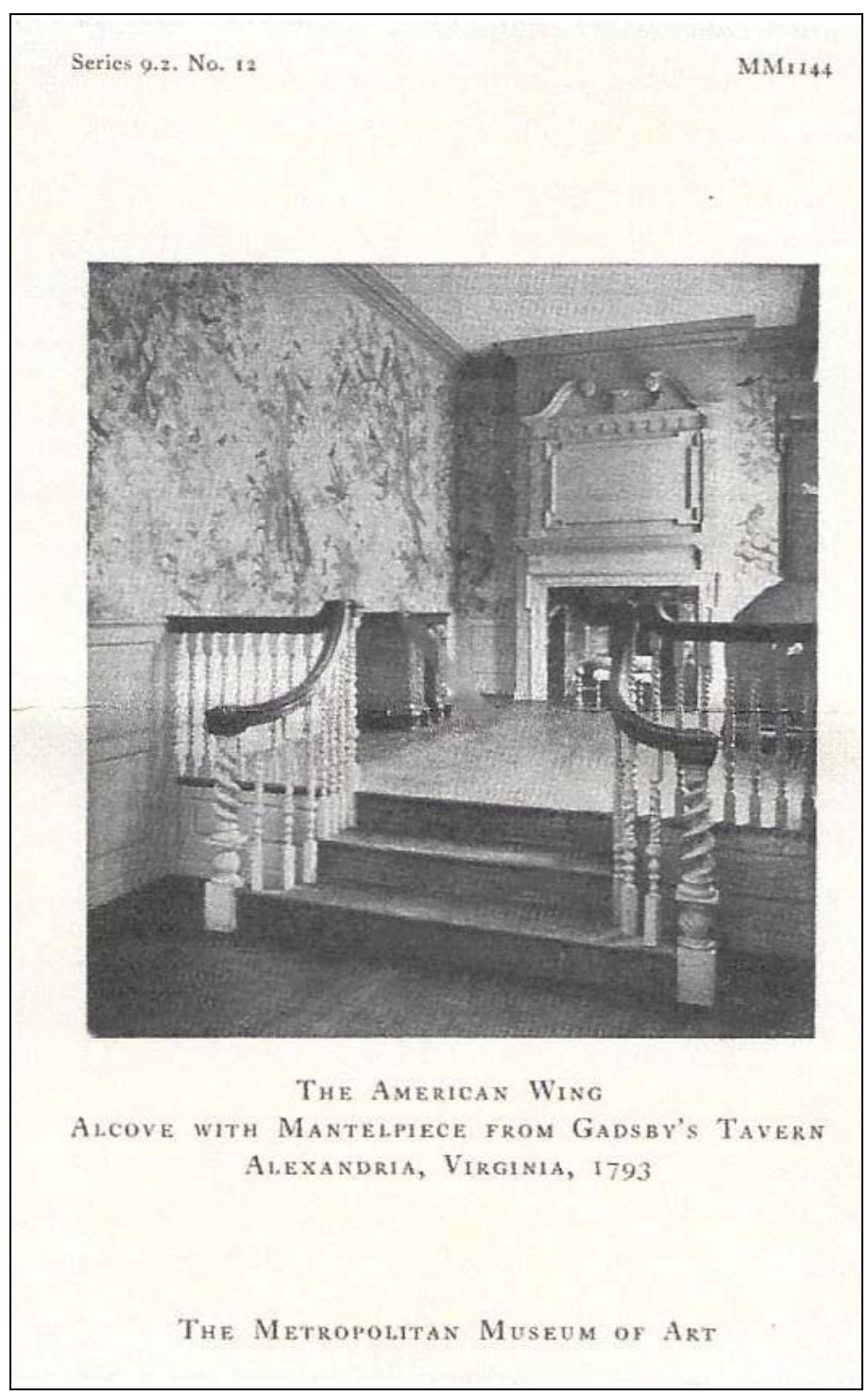
Figure 1. Image from Bulletin of the Metropolitan Museum of Art (Volume XIX, New York, November 1924, Number 11) , p. 258.