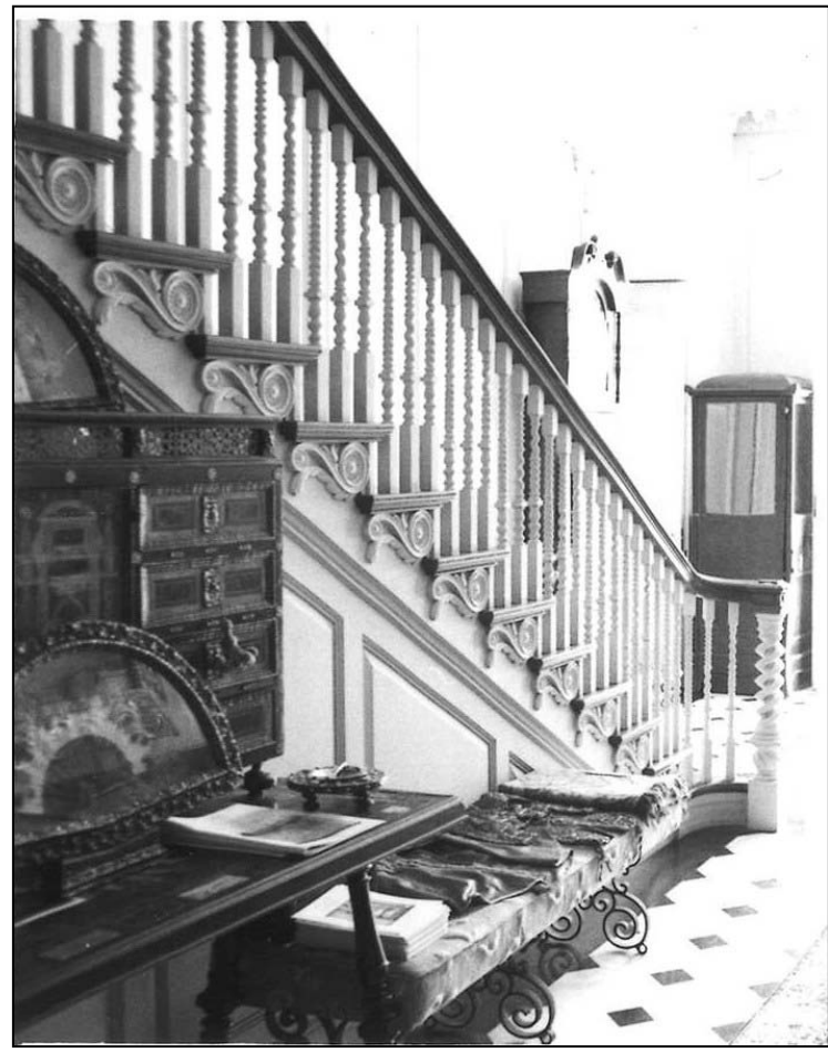
Figure 4. Staircase at Gallison Hall (1981 photo by Jeffrey M. O'Dell, collection of the Department of Historic Resources, Richmond, VA)