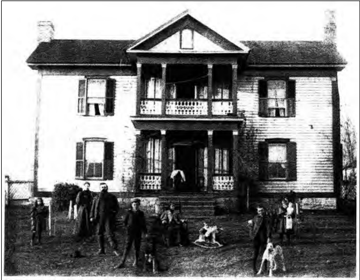
Figure 1. 1890s Photograph of the Primary Dwelling at Doe Creek Farm