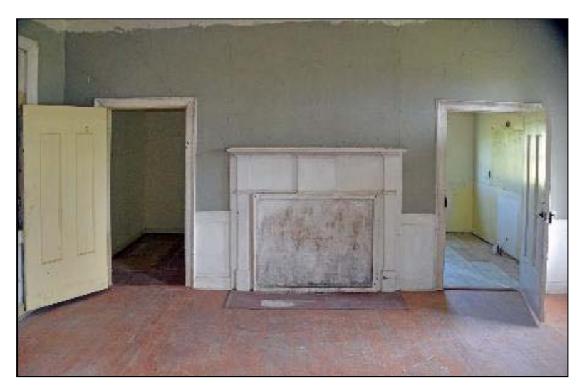
Figure 6. First-Floor Room in East Addition.

It is not entirely clear why this addition with the second staircase was created, perhaps to accommodate an extended family under a single roof after some misfortune wrought by the war. What this expansion did do was to create two distinct apartments. The expanded house now had two separate entrances on the south façade. The present porch dates from the early twentieth century, but it is easy to imagine that it replaced an earlier one of a similar configuration to accommodate the two entrance doors. The new east door opened into a narrow stair passage. Inside the passage, two steps to the left led up to a doorway cut into the original section of the house.