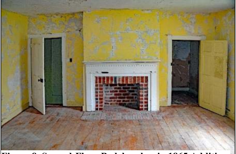
Figure 8. Second-Floor Bedchamber in 1865 Addition.

Scars of shelving survive on the north side of the 1865 gable-end chimney. Doors into the two shed rooms on either