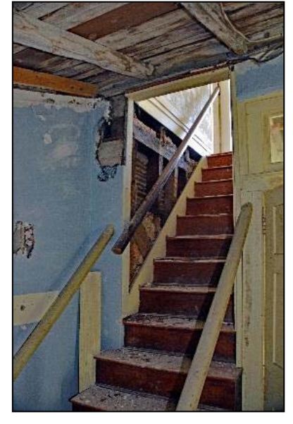
Figure 5. Staircase Rising from Shed Room to Garrett.

Because the new wing was a story-and-a-half in height, the heated garret room over the ground-floor entertaining room had more space and height than the 1826 garret across the passage. Four dormers, two on the front and two on the back, lit the upstairs chamber. Access to this room was by way of a pair of steps down to the floor in the original upstairs passage.