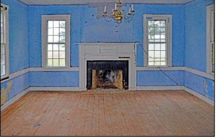
Figure 4. First Floor, 1829 Wing.

fluctuating bonding patterns ranging from three to seven consecutive rows of stretchers between a