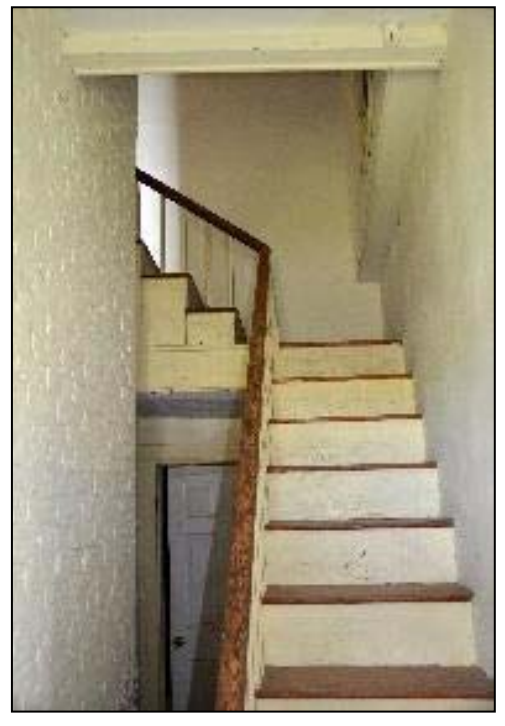
Figure 7. Staircase in the 1865 East Addition.

before it turns west at the second-floor level and rises a few additional steps to a doorway cut through the old wall just north of the chimney (Figure 7). This door opens into a bedchamber in the reconstructed second floor of the 1826 section. The area below the staircase was not enclosed at the time and there was no back door at the north end of the passage.