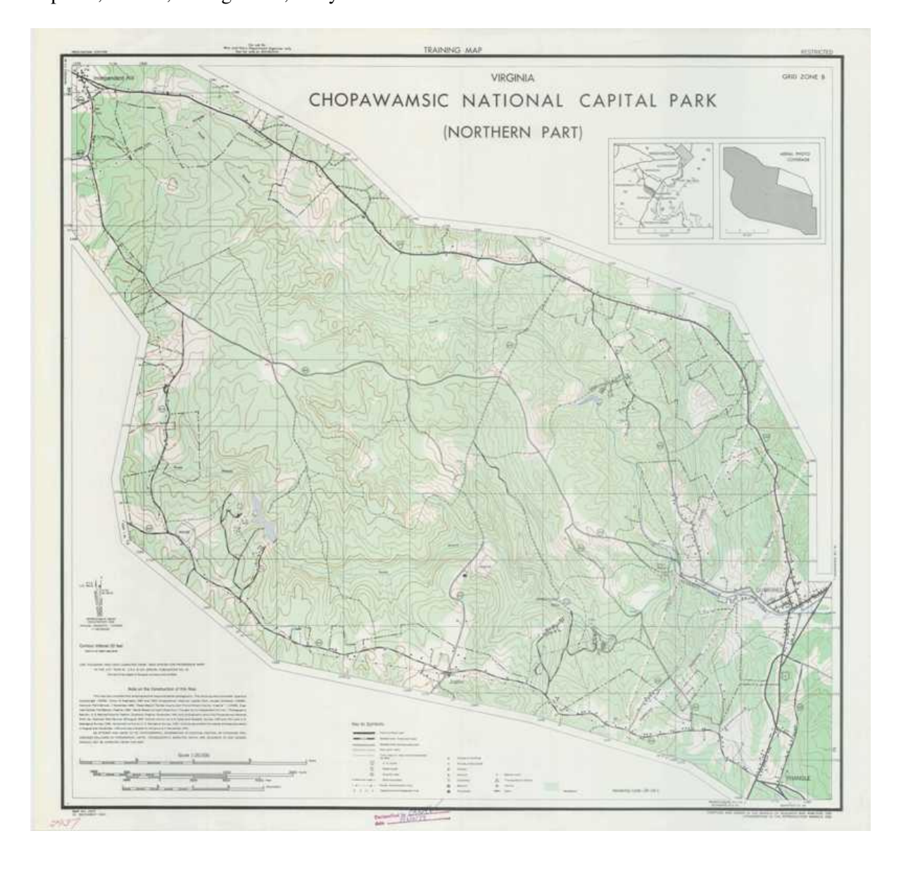
Figure 5. Office of Strategic Services Map entitled, "Chopawamsic National Capital Park."