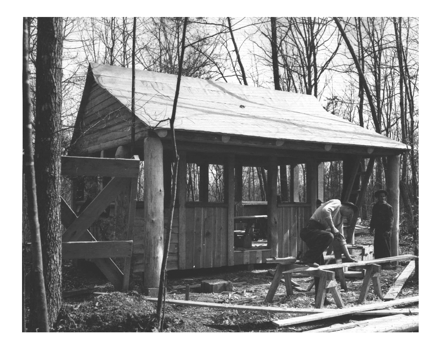
Figure 1. View of CCC workers constructing cabins at Chopawamsic (PRWI) in April 1936.