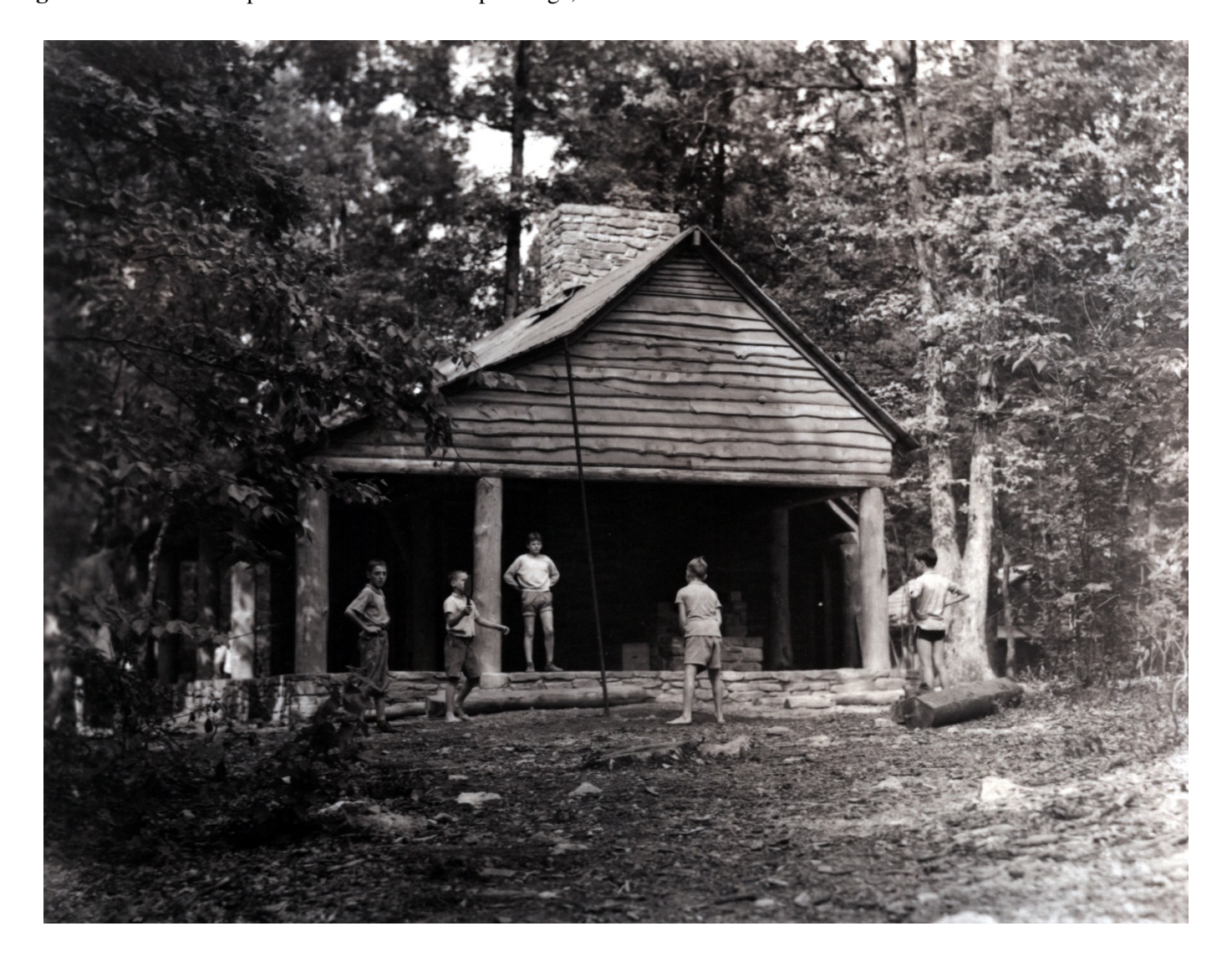
Figure 3. View of campers around Cabin Camp 1 lodge, 1936.