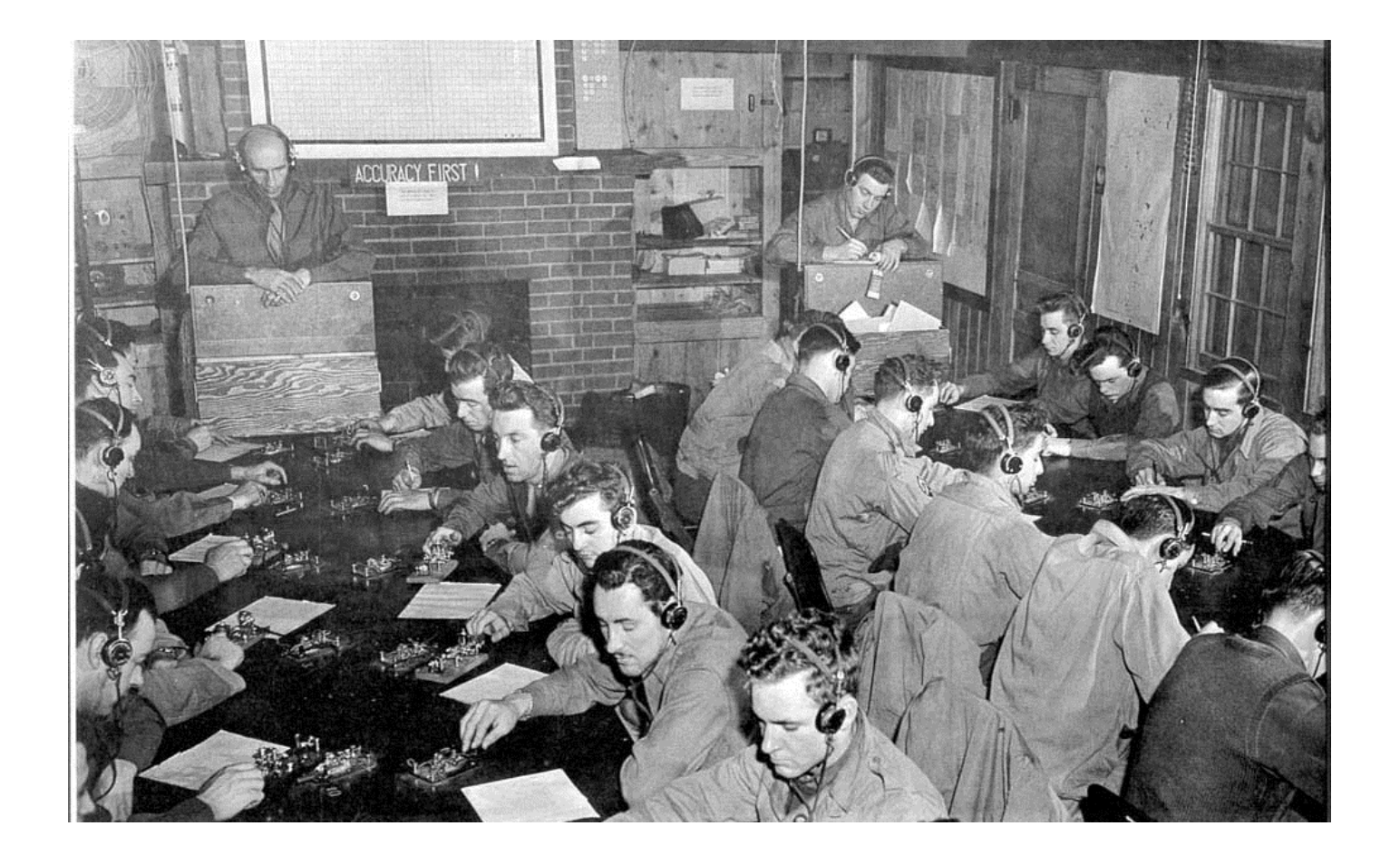
Figure 4. View of OSS communications training in Area C, ca. 1942.