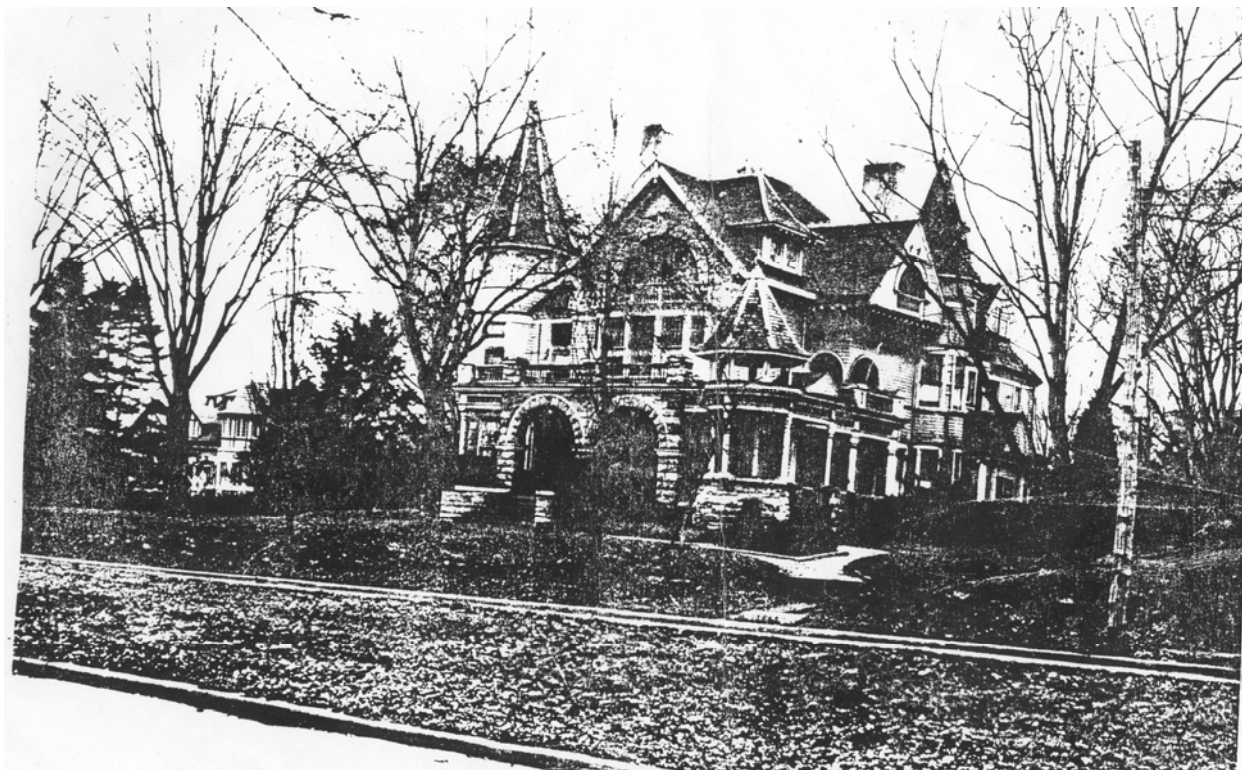
Figure 2: The Hugh E. Graves House on Euclid Avenue which burned ca. 1928. The carriage house at left remains extant.

One of the most ornate Queen Anne style houses built in Bristol was the Hugh E. Graves House completed ca. 1895 facing Euclid Avenue (Figure 2). Known as "The Towers," this dwelling was three-stories in height with two conical towers, inset balconies on the third floor, and a large porch with stone arches on the main façade. The property was the home to Hugh E. Graves a prominent businessman who also served on the city council in the 1880s. A two-story carriage house/servant's quarters was also built as part of this property at 809 Euclid Avenue. This building was designed in the Tudor Revival style with a corner turret and exterior of stone veneer and stucco and half-timbering. The Hugh E. Graves house burned ca. 1928 but the carriage house/servant's quarters remains extant. 4