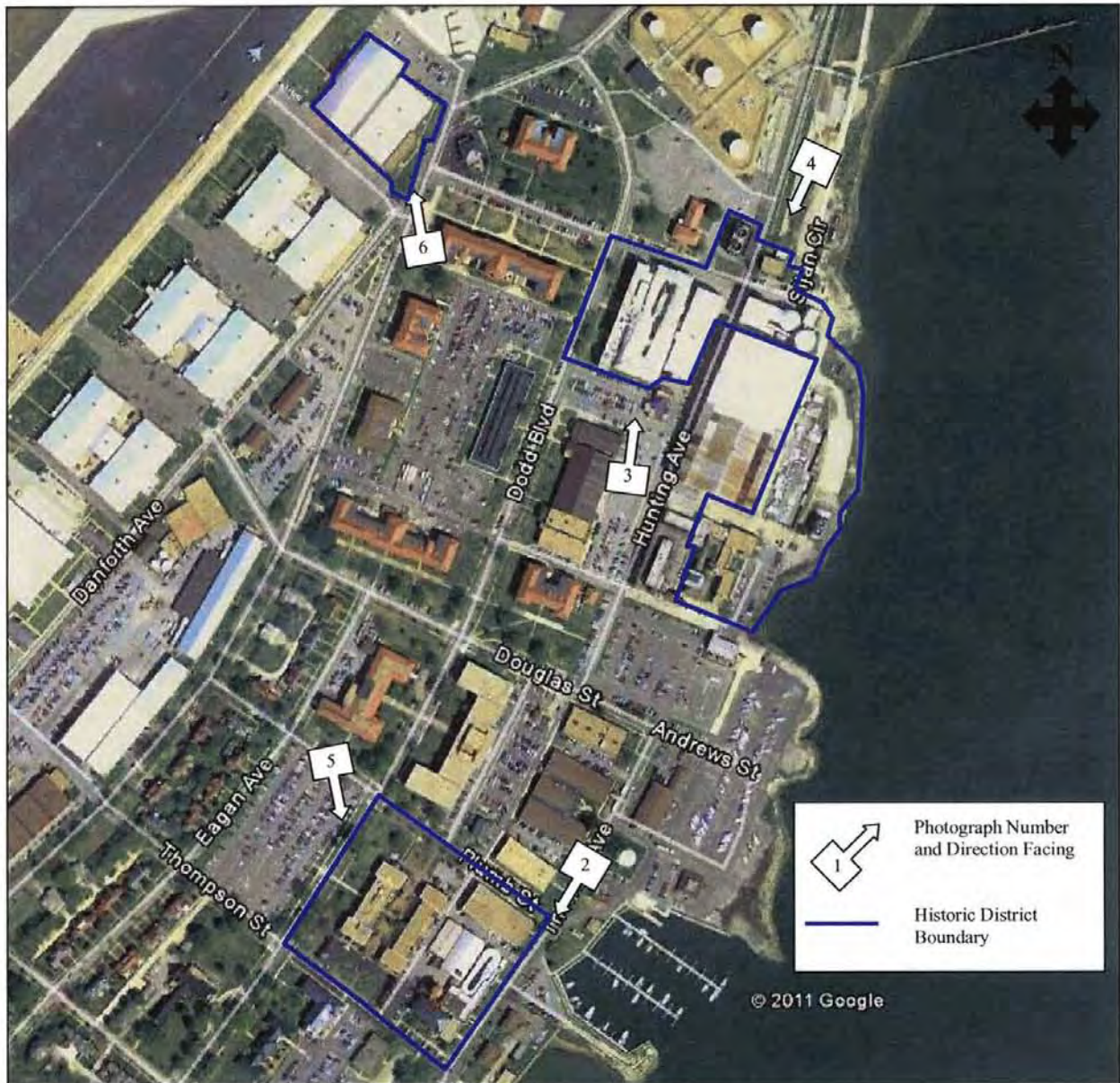
NASA LaRC Historic District Photograph Location Key: East Area