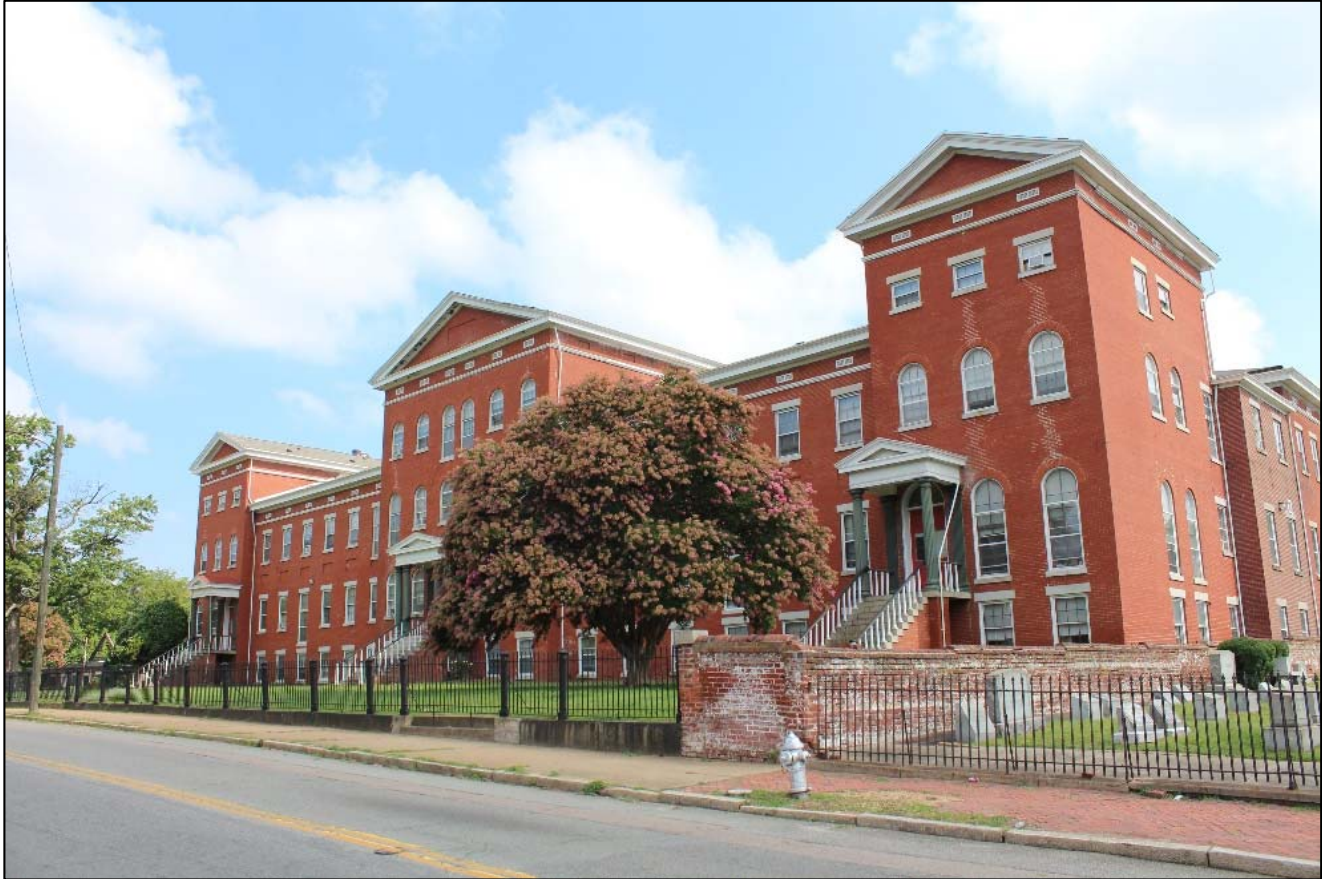
Almshouse façade (southwest elevation), view northwest. Photograph by EHT Tracerics (July 12, 2018). 1 of 8.

The Almshouse Name of Property Richmond, Virginia County and State 81000647, 89001913 NR Reference Number