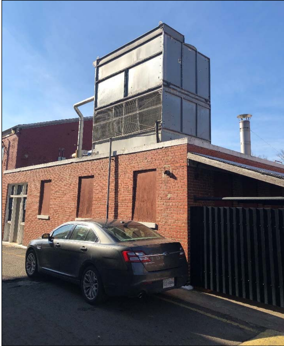
Boiler Room, view west. Southeast elevation at image center, northeast elevation at image right. Garage pictured in background. Photograph by ZAD Architecture (January 10, 2019).

The Almshouse ----- Name of Property Richmond, Virginia ----- County and State 81000647, 89001913 ----- NR Reference Number