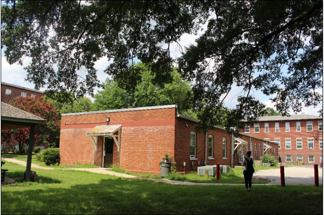
Southeast and northeast elevations of the Administration Building, view southwest. Photograph by EHT Tracerics (July 12, 2018). 6 of 8.

The Almshouse ----- Name of Property Richmond, Virginia ----- County and State 81000647, 89001913 ----- NR Reference Number