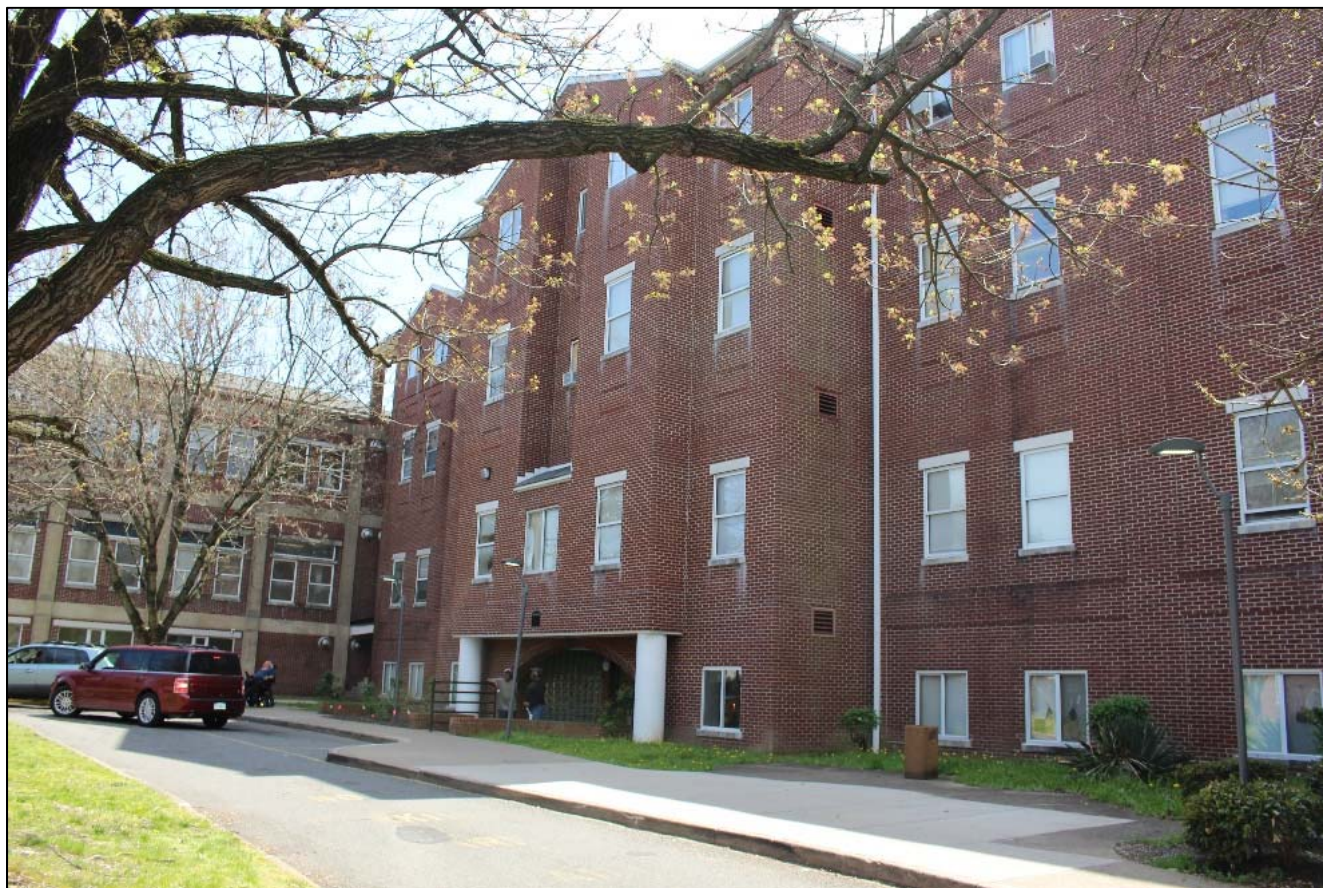
Almshouse rear (northeast) elevation, view southeast. Photograph by EHT Tracerics (April 12, 2018). 2 of 8.

The Almshouse Name of Property Richmond, Virginia County and State 81000647, 89001913 NR Reference Number