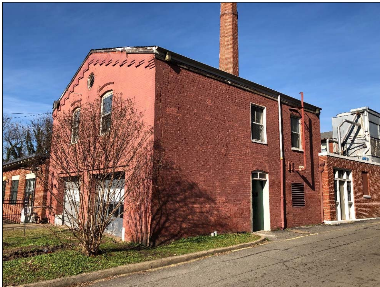
Façade (southwest elevation) and southeast elevation of the Garage, view north. Note the Police Building (outside of historic boundaries) is at image far left and the Boiler Room is at image far right. Photograph by ZA+D, LLC (January 10, 2019). 3 of 8.

The Almshouse ----- Name of Property Richmond, Virginia ----- County and State 81000647, 89001913 ----- NR Reference Number