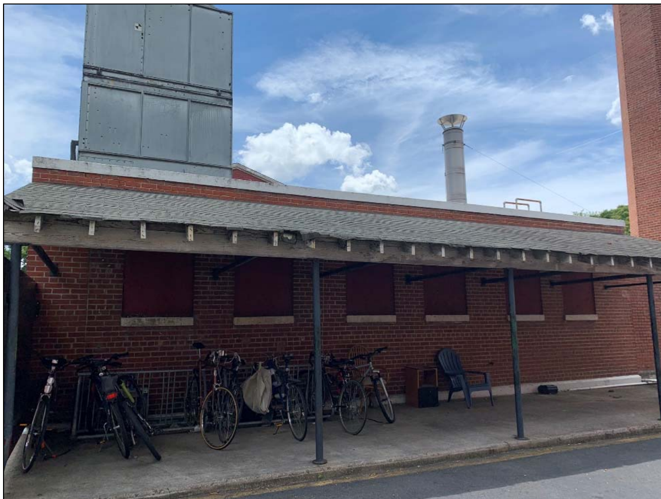
Rear (northeast) elevation of the Garage, view southwest. Photograph by EHT Tracerics (June 25, 2019). 8 of 8.

The Almshouse ----- Name of Property Richmond, Virginia ----- County and State 81000647, 89001913 ----- NR Reference Number