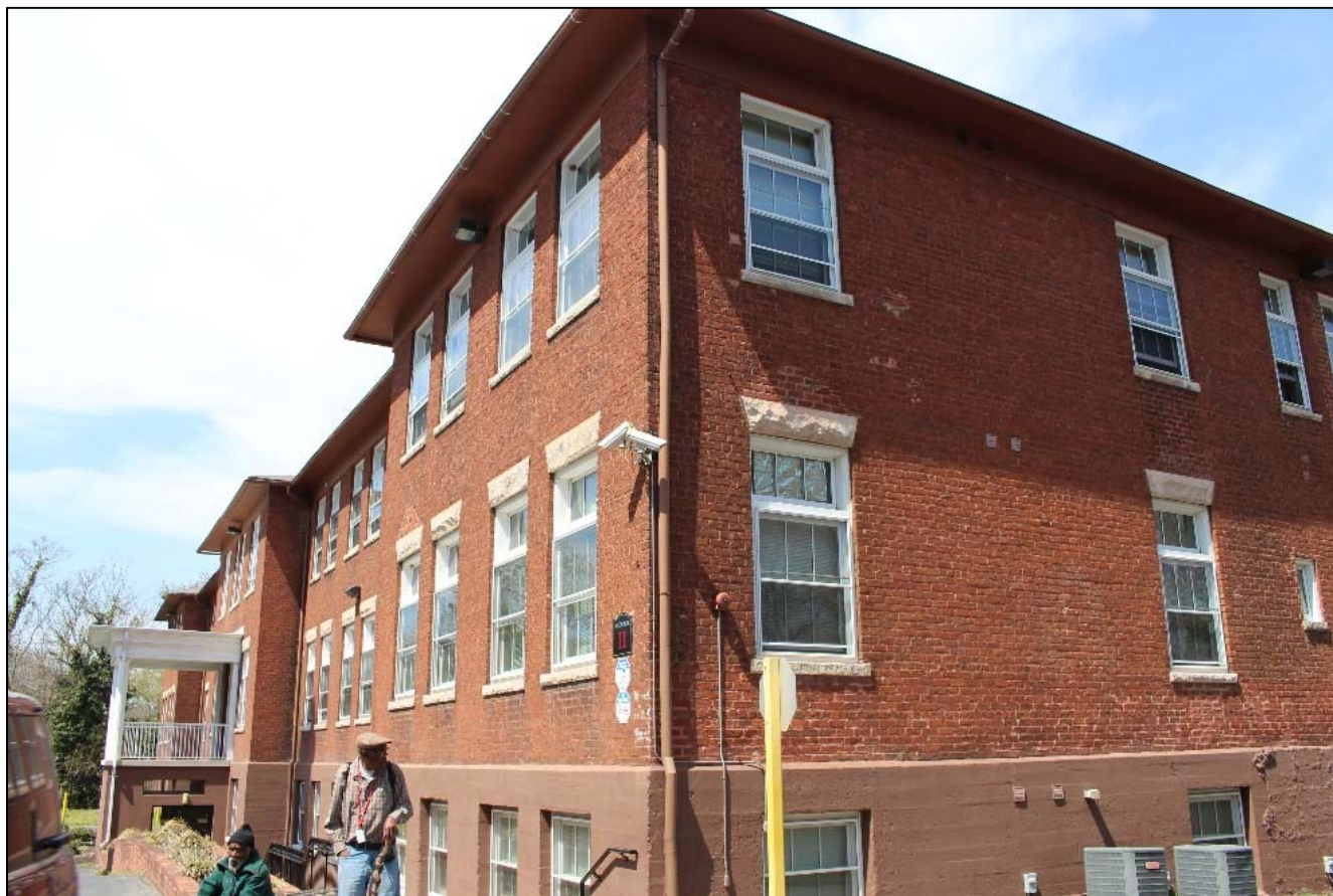
Façade (southwest elevation) and southeast elevation of the West Building, view northwest. Photograph by EHT Tracerics (April 12, 2018).