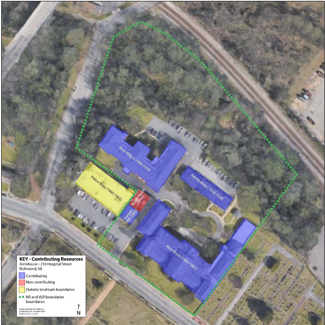
Site map by EHT Tracerics, 2020. The green line represents the historic boundaries updated in 1990. The Police Building sits outside of the historic boundaries.