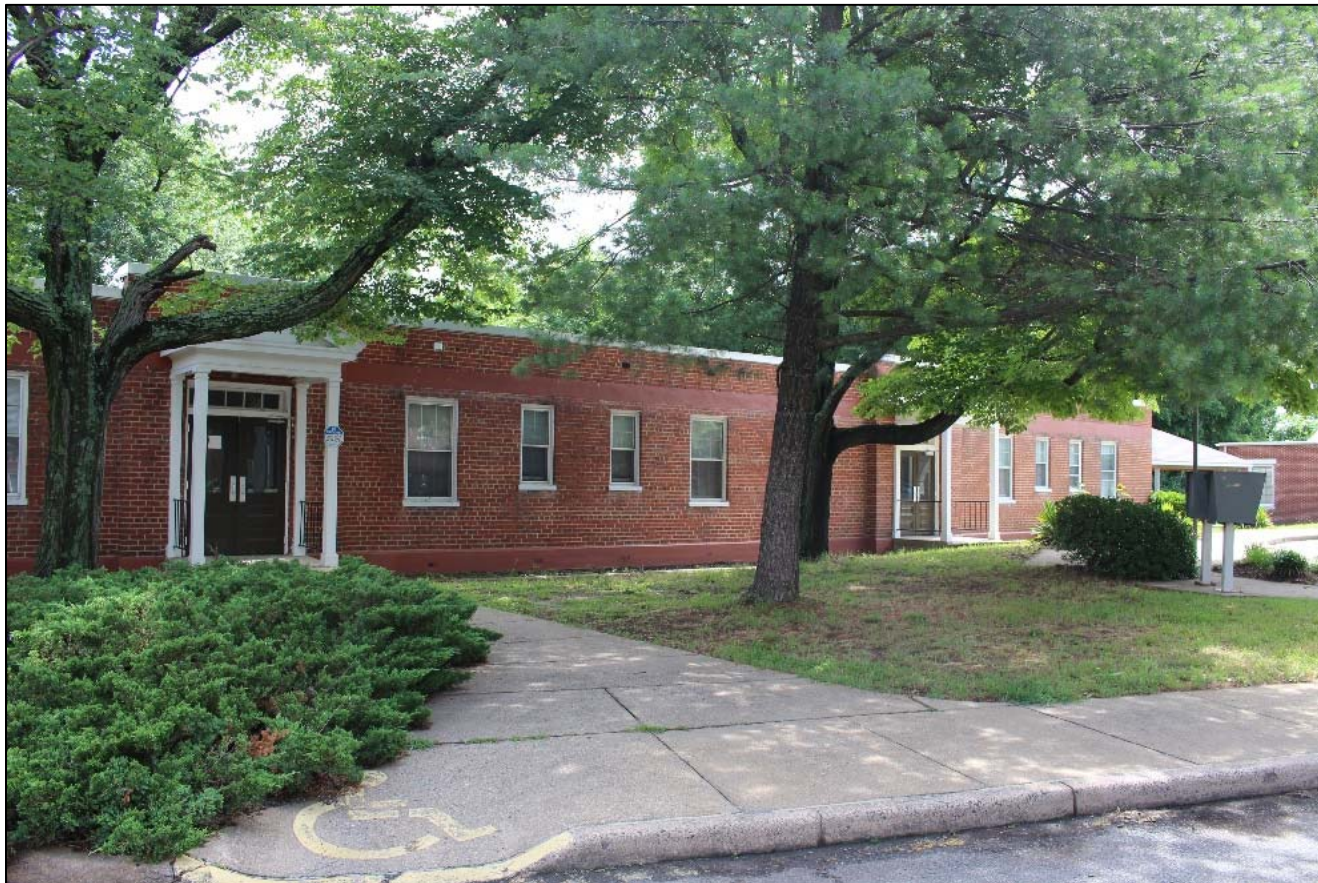
Administration Building façade (southwest elevation), view east. Photograph by EHT Tracerics (June 12, 2018). 5 of 8.

The Almshouse ----- Name of Property Richmond, Virginia ----- County and State 81000647, 89001913 ----- NR Reference Number