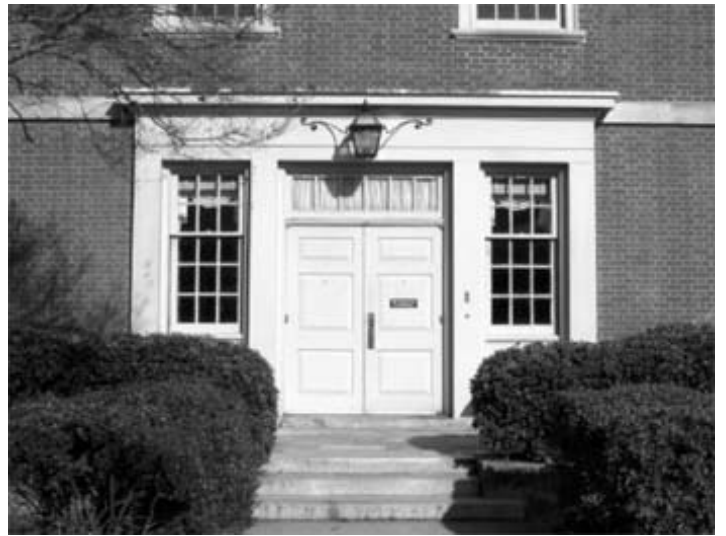
RMH School of Nursing, North Elevation Main Entrance