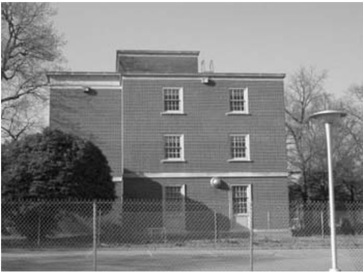
RMH School of Nursing, South Elevation