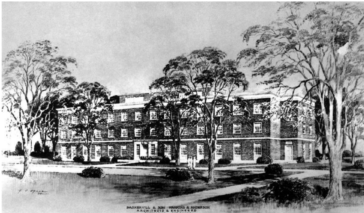
Original Rendering of the Richmond Memorial Hospital School of Nursing Building by Baskervill & Son, 1960.

Section Supplemental Materials Page 6 =====