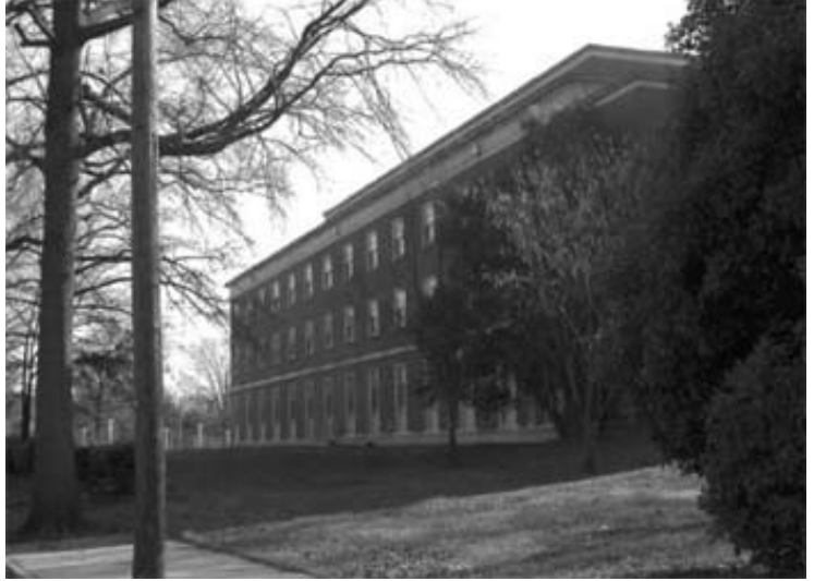
RMH School of Nursing, East Elevation