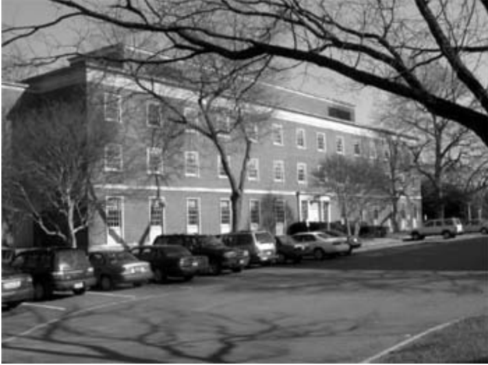
RMH School of Nursing, West Elevation