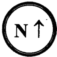
IRVINGTON HISTORIC DISTRICT LANCASTER COUNTY, VIRGINIA August 1999