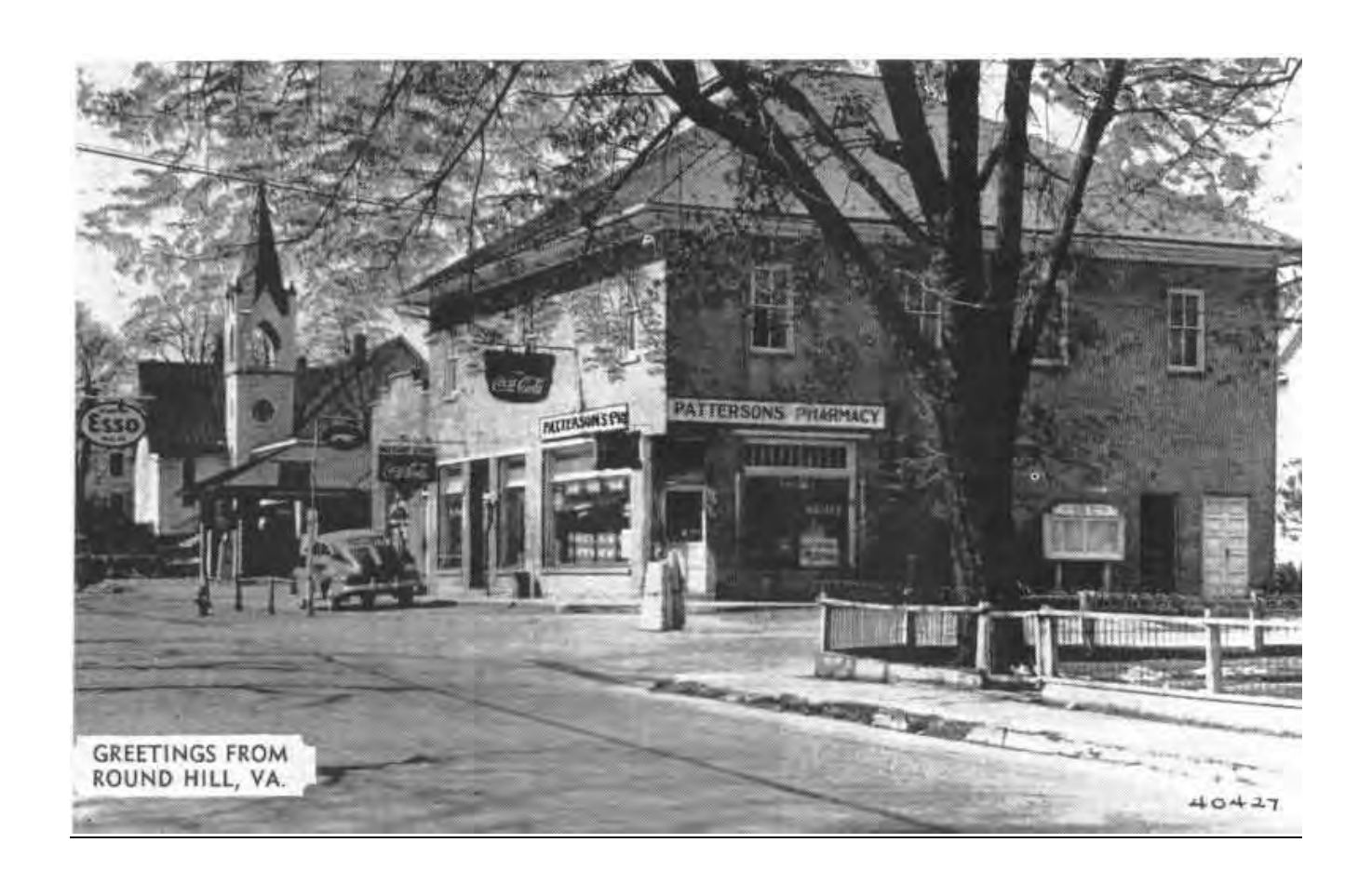
FIGURE 2: INTERSECTION OF MAIN AND LOUDOUN STREETS CIRCA 1950

Round Hill Historic District (From: www.roundhill.va.org) Loudoun County, Virginia