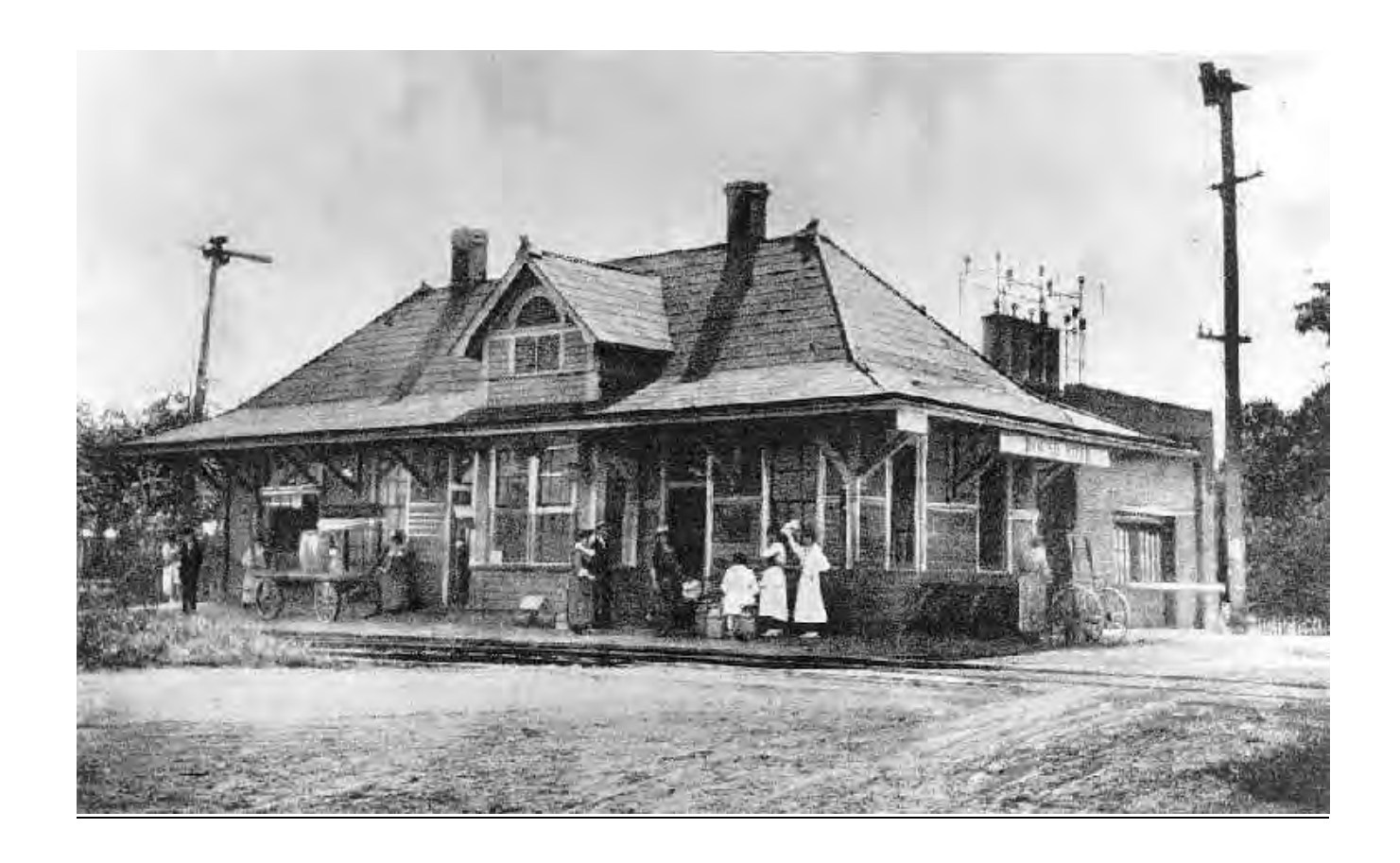
FIGURE 1: ROUND HILL W&OD TRAIN STATION CIRCA 1905

Round Hill Historic District Loudoun County, Virginia