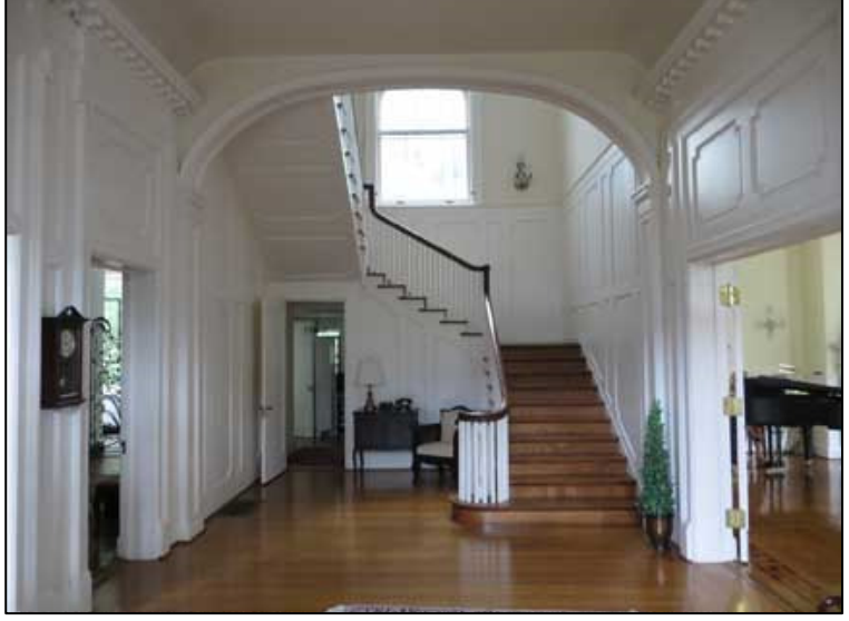
2. Barton Lodge was listed in the Registers in 2013 for its significance under Criteria A, B, and C in the areas of Commerce, Social History, and Architecture.

PHILOSOPHY - The theoretical study of Control thought, knowledge and the nature of the universe.