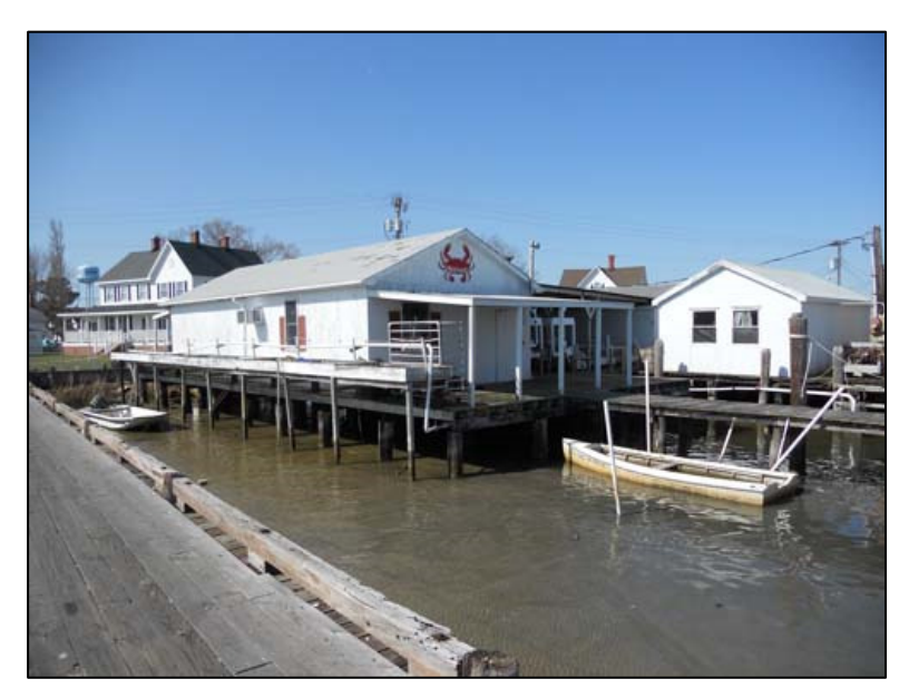
4. Listed in the Registers in 2014, the Tangier Island Historic District is significant at the statewide level in the areas of Commerce; Ethnic Heritage: Native American, African American; Industry, Maritime, Military, and Religion, and at the local level in the areas of Architecture and Archaeology: Prehistoric and Historic.