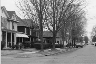
Pierce Street HD, Lynchburg

Even among districts of the same general type, such as residential, great variety can be found.