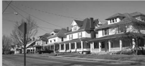
Riverland HD, Roanoke