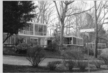
Hollin Hills HD, Fairfax County