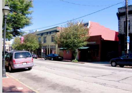
Broad Street Commercial HD, Richmond

This definition of historic districts is, by design, a broad definition meant to encompass a great swath of historic property types, such as residential, commercial, manufacturing, maritime, military, transportation, religious, recreational, agricultural, educational, and mining properties, to name just a few.