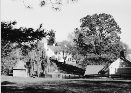
Goose Creek Rural HD, Loudoun County

For example, districts can range from rural to urban settings: