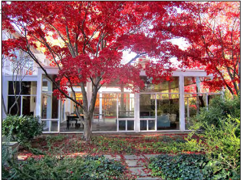
3. The Charles M. Goodman House was listed in the National Register in 2013.