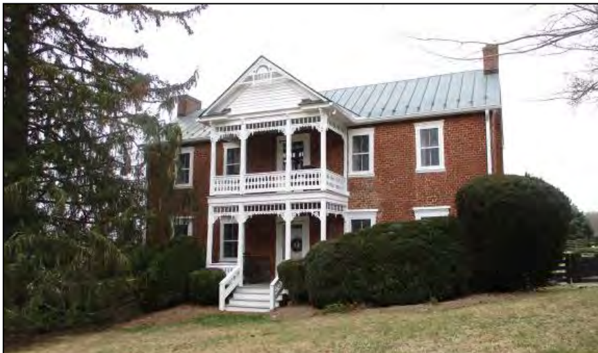
Figure 5. Bellevue, in Craig County, was listed in the Registers in 2020.

If your computer is equipped with a disc burner, you can burn the image files to a CD and include that with the rest of your nomination materials. You also may be able to have a photo CD created by a commercial photo lab; as CDs fall out of use, this may become more difficult to do. But if you use a disc created by a commercial lab, you are not required to rename the files. That disc may be submitted as received from the lab.