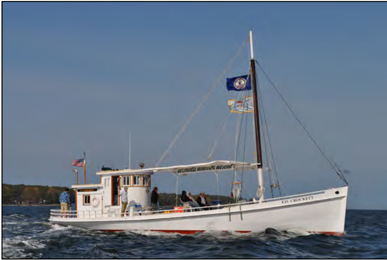
1. The F.D. Crockett was listed in the National Register in 2012.

Photographs are one of the key components of a nomination to the Virginia Landmarks Register and the National Register of Historic Places. Without photos, a nomination cannot be considered final and a property will not be listed in the Registers even if all other pieces of the nomination packet are complete. The photos that accompany a nomination are meant to provide an overview of the historic property's current condition and to demonstrate that the nominated property has the characteristics necessary for listing in the Registers. 1