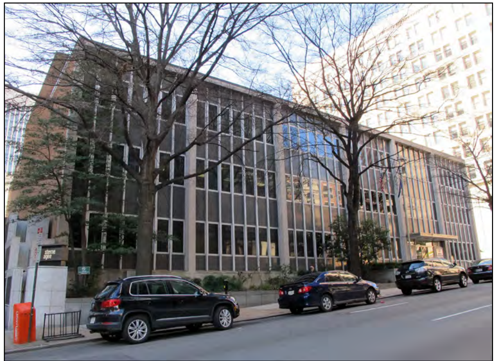
4. Located at 703 Main Street, this building was included in the 2013 Boundary Increase to the Main Street Banking Historic District in Richmond.