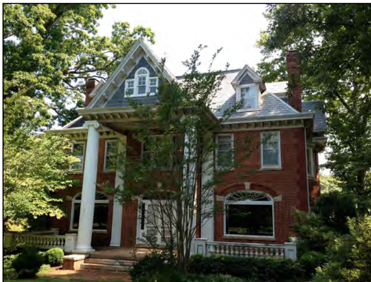
2. Dulwich Manor was listed in the National Register in 2013.

Most cameras use the JPG format as their default setting. Recently, Apple introduced a new photo format for images taken with iPhone cameras. If you have photo editing software, you can convert the HEIF or HEVC files to JPGs. You also can find instructions for changing your iPhone's camera settings by searching online or going to www.support.apple.com . As a last resort, DHR has the capability to convert HEIF and HEVC files to JPGs.