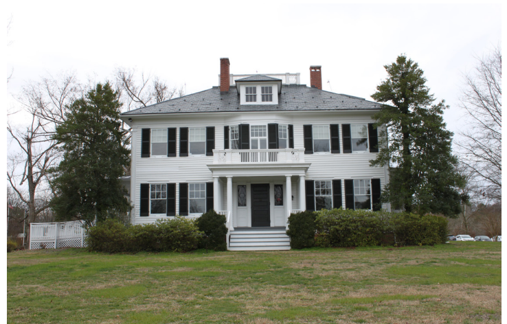
Pictured above: VCCS Rappahannock Community College's Chinn House in 2020.