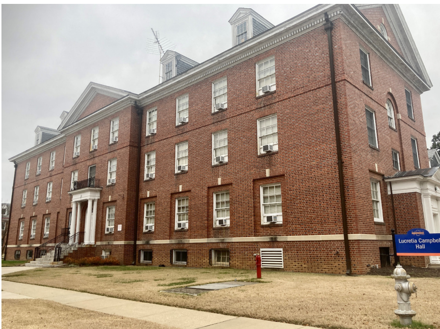
Pictured left: Lucretia Campbell Hall on the VSU campus in 2023.