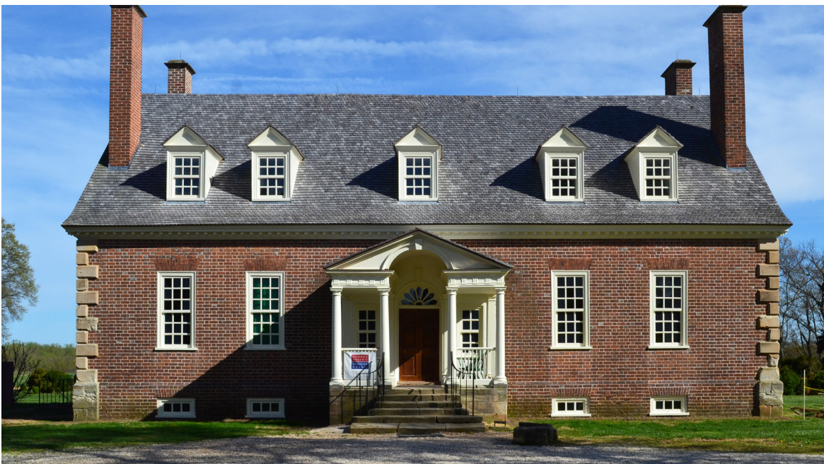
Pictured left: Gunston Hall in 2017.