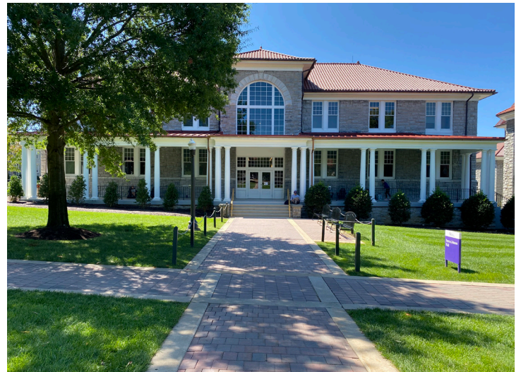
Pictured right: Darcus Johnson Hall at JMU.

JMU completed a restoration to Darcus Johnson Hall (formerly Jackson Hall). This building contributes to the JMU Historic District. JMU worked closely with DHR on this project, which included bringing the elevation back to its original layout with the large window over the opening. The project also restored the columns and fascia at the porch.