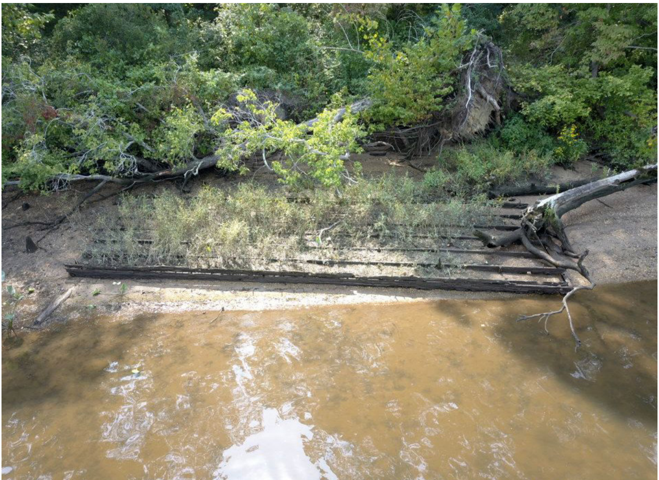
Pictured above: The DeFarge Barge site in 2021.