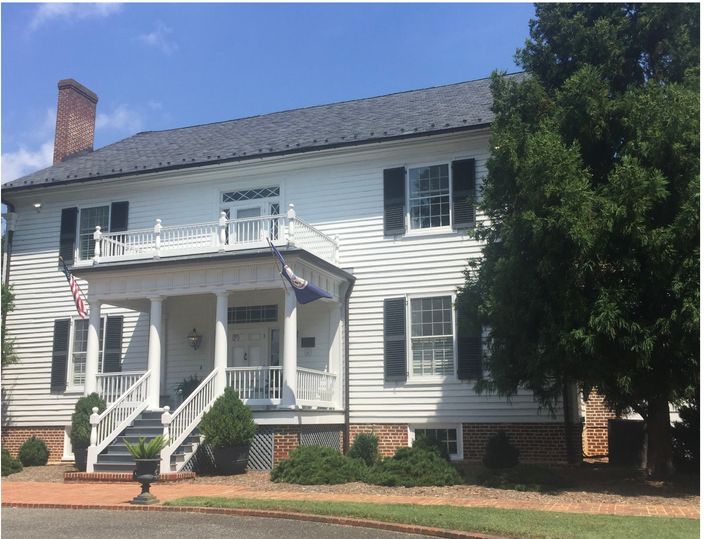
Pictured above: Longwood House in 2018.

The University has also made several repairs to the Longwood House to eliminate a water leak in the basement and repaired damage and rotten members of the building's front porch and side porch posts. In 2021, the University hired a consultant to perform a home inspection for this facility. The University's in-house staff have repaired the interior items listed in the report except for the windows. The University understands that the next step is to hire a design team to prepare design documents to address the remainder of the issues identified in these reports.