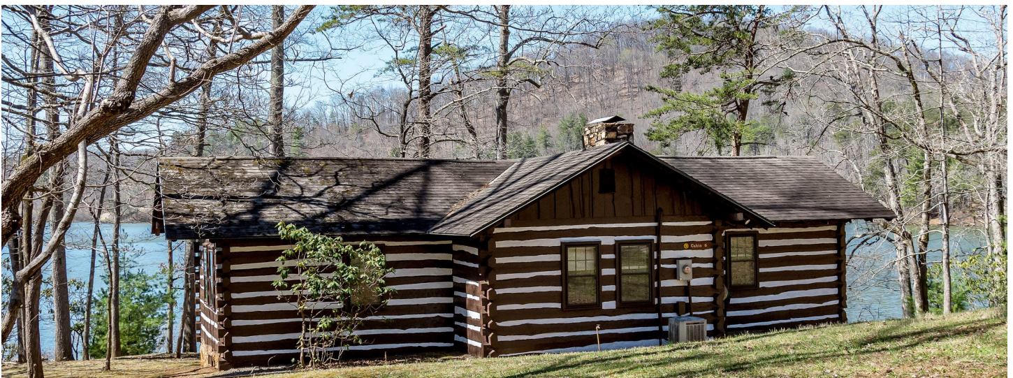
Pictured above: A cabin at Fairy Stone State Park in ca. 2016.