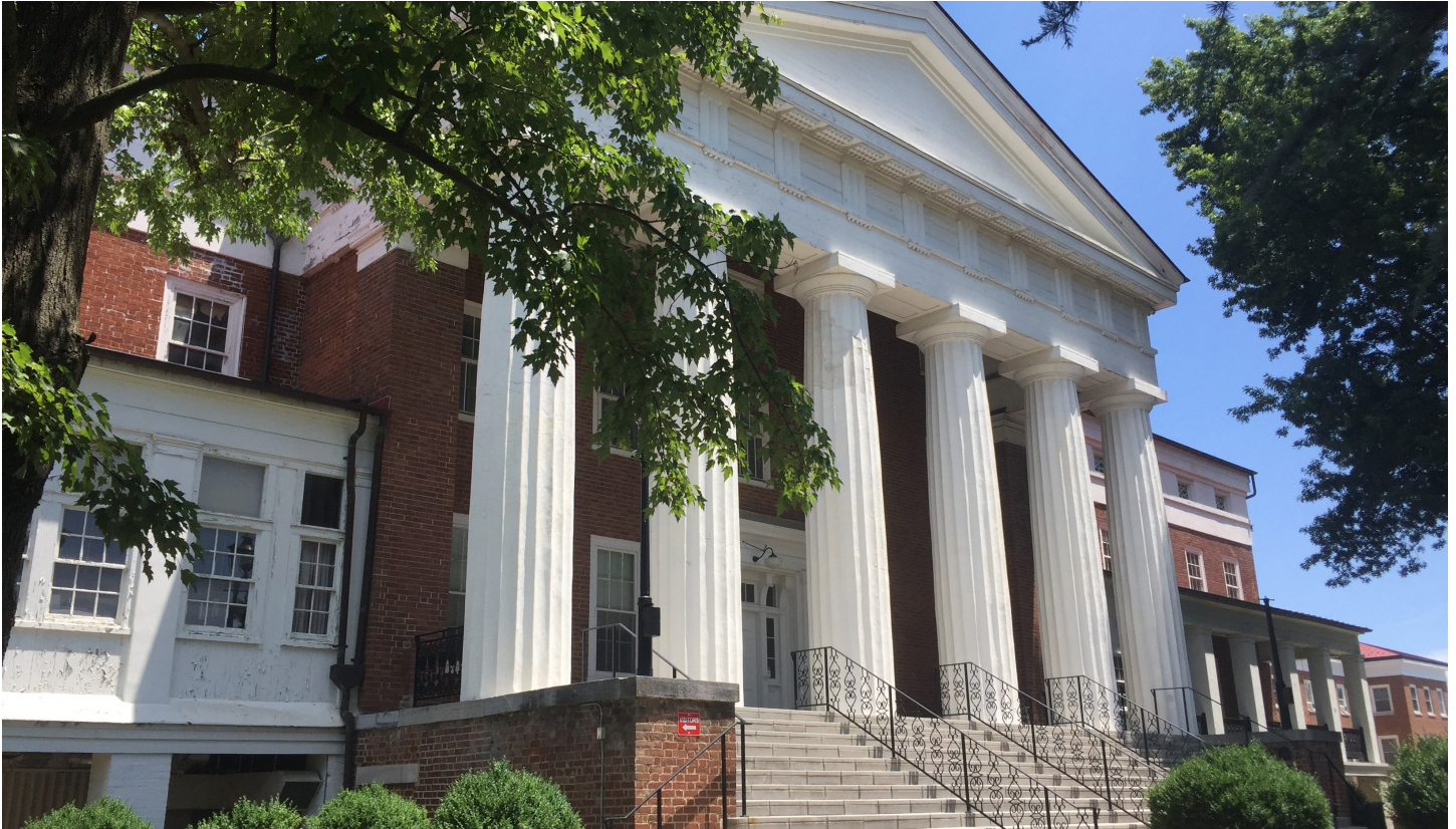
Pictured above: The Main Hall of VSDB in 2019.

VSDB is undergoing a renovation to the oldest building on campus, Main Hall. This project is for envelope repairs, although the condition remains that Main Hall is in dire need of maintenance for the overall upkeep of the building. The second and third floors have been abandoned due to the overall age and deterioration.